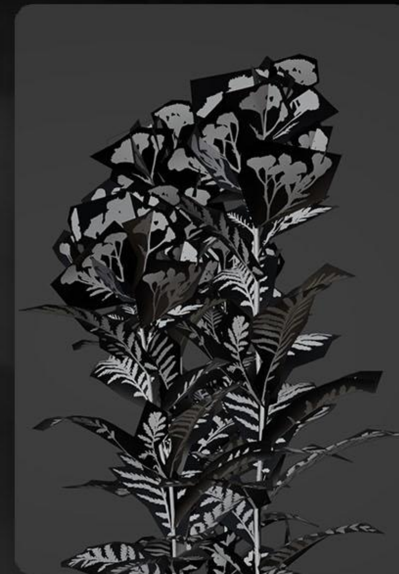
This plant rely on alpha masks