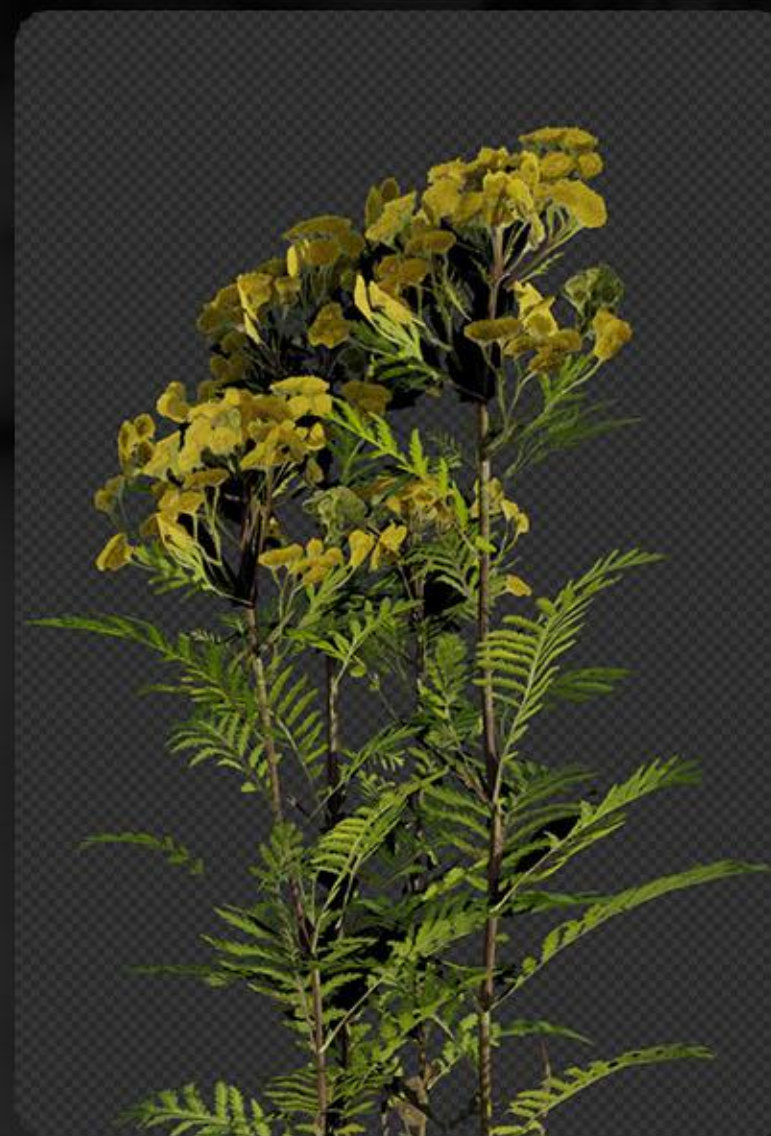
The rays are stuck!

If you see black pixels in your final render, it might be because an object is using alpha opacity masks in its shader. This problem is typically linked with simulated rays being stuck in between transparent surfaces. Most raytracer rendering engines have a simple solution for this issue, you will need to either throw more rays or increase the number of ray bounces for transparent materials.