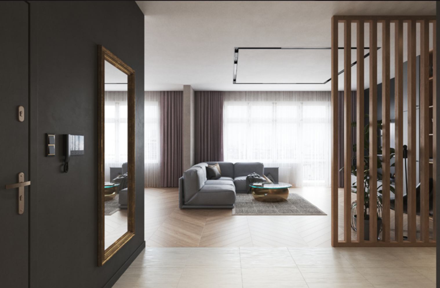
scene 04 cam 07

Have you ever wanted to make professional interior renderings? Do you know how to use V-RaySun, V-RaySky and V-RayPhysicalCamera? Have you ever had problems with composition? Archinteriors will end all your problems. Take a look at this 5 fully textured scenes with professional shaders and lighting ready to render. Get your own portfolio and join cg market.