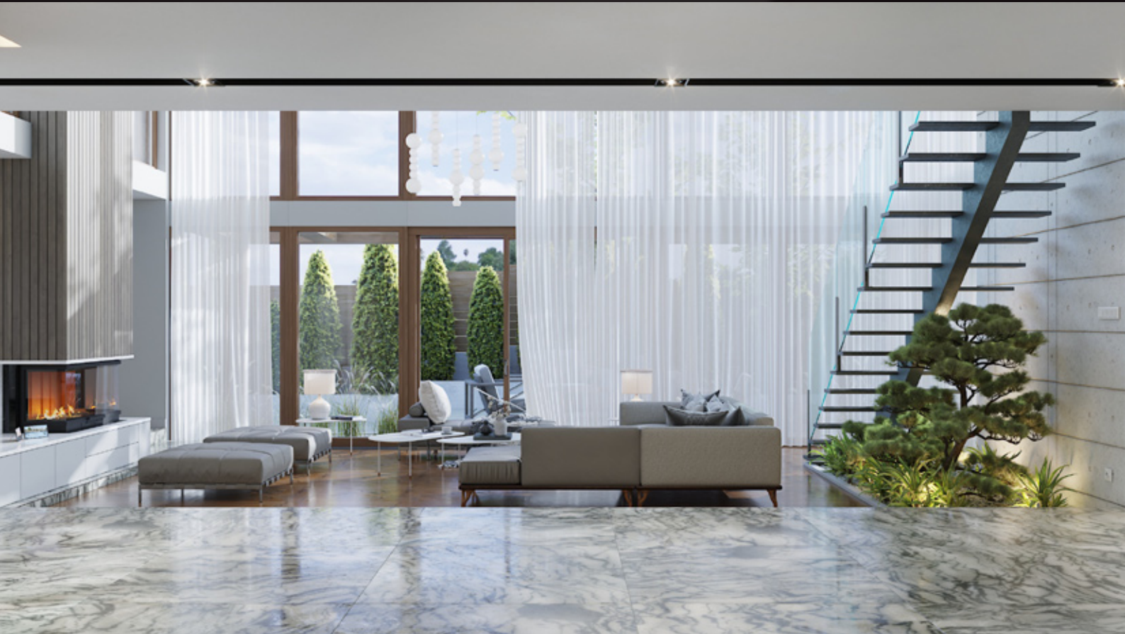
scene 01 cam 01

Have you ever wanted to make professional interior renderings? Do you know how to use V-RaySun, V-RaySky and V-RayPhysicalCamera? Have you ever had problems with composition? Archinteriors will end all your problems. Take a look at this 5 fully textured scenes with professional shaders and lighting ready to render. Get your own portfolio and join cg market.