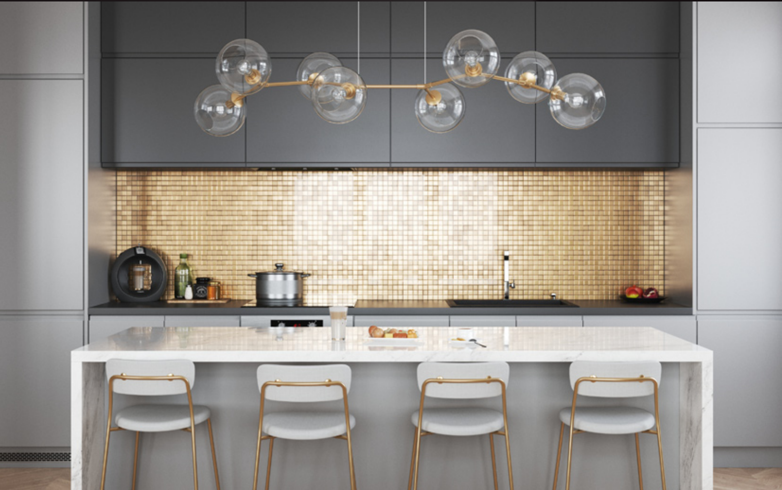
scene 04 cam 08

Have you ever wanted to make professional interior renderings? Do you know how to use V-RaySun, V-RaySky and V-RayPhysicalCamera? Have you ever had problems with composition? Archinteriors will end all your problems. Take a look at this 5 fully textured scenes with professional shaders and lighting ready to render. Get your own portfolio and join cg market.