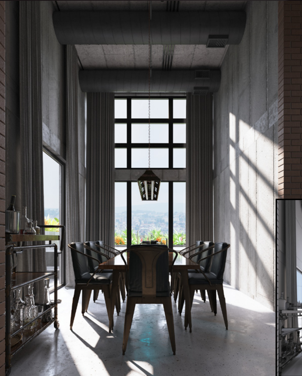
scene 03 cam 02

Have you ever wanted to make professional interior renderings? Do you know how to use V-RaySun, V-RaySky and V-RayPhysicalCamera? Have you ever had problems with composition? Archinteriors will end all your problems. Take a look at this 5 fully textured scenes with professional shaders and lighting ready to render. Get your own portfolio and join cg market.