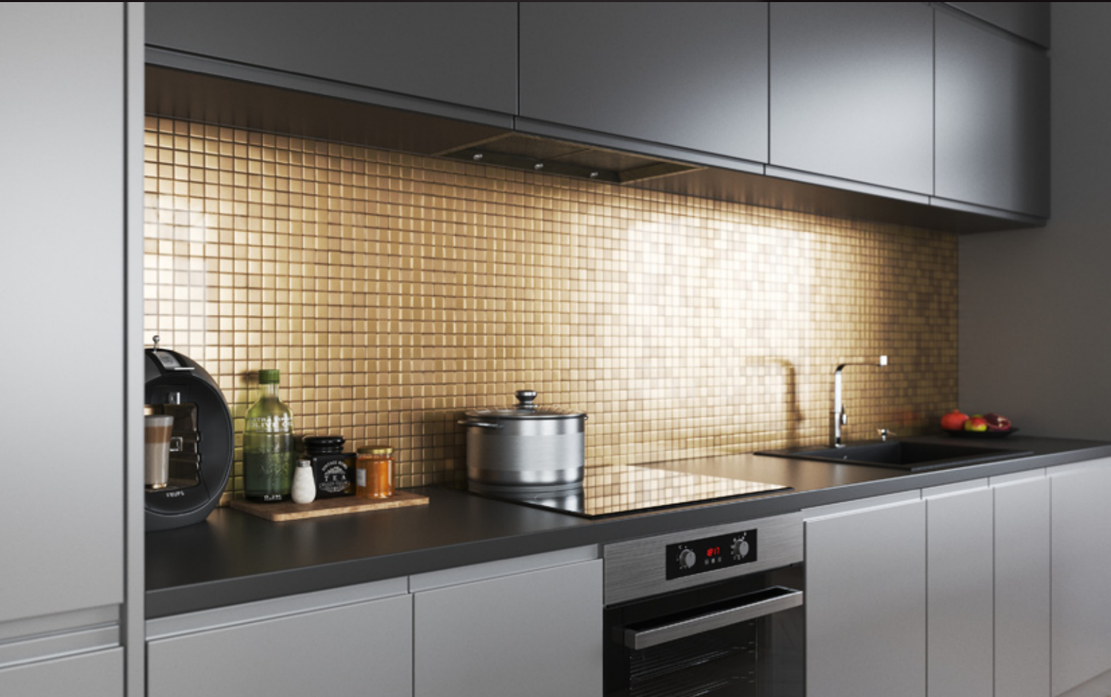
scene 04 cam 09

Have you ever wanted to make professional interior renderings? Do you know how to use V-RaySun, V-RaySky and V-RayPhysicalCamera? Have you ever had problems with composition? Archinteriors will end all your problems. Take a look at this 5 fully textured scenes with professional shaders and lighting ready to render. Get your own portfolio and join cg market.