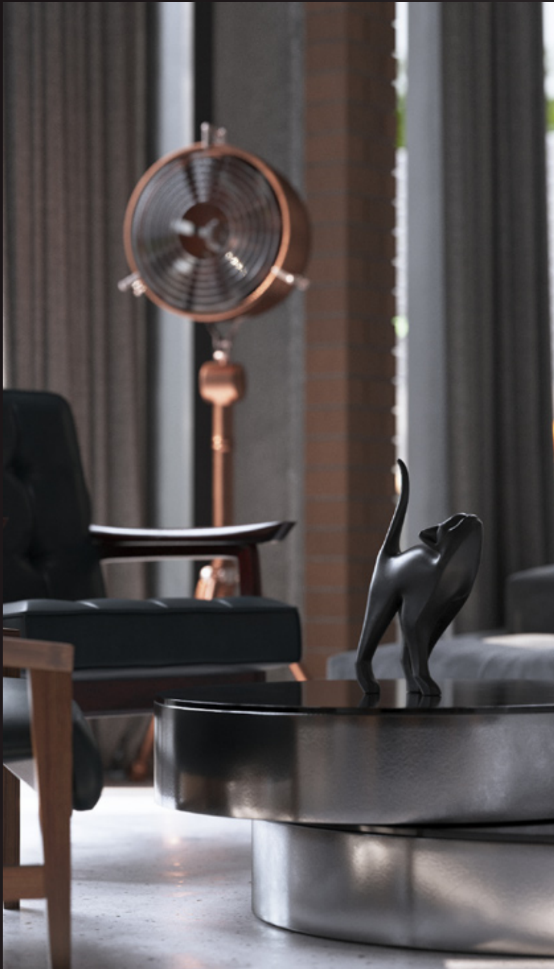
scene 03 cam 11

Have you ever wanted to make professional interior renderings? Do you know how to use V-RaySun, V-RaySky and V-RayPhysicalCamera? Have you ever had problems with composition? Archinteriors will end all your problems. Take a look at this 5 fully textured scenes with professional shaders and lighting ready to render. Get your own portfolio and join cg market.