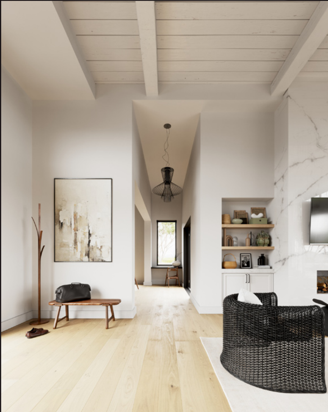
scene 05 cam 08

Have you ever wanted to make professional interior renderings? Do you know how to use V-RaySun, V-RaySky and V-RayPhysicalCamera? Have you ever had problems with composition? Archinteriors will end all your problems. Take a look at this 5 fully textured scenes with professional shaders and lighting ready to render. Get your own portfolio and join cg market.