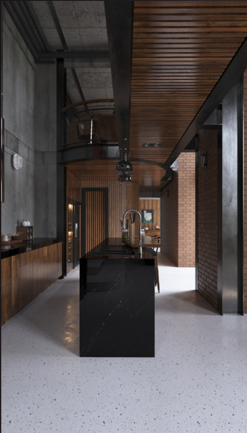
scene 03 cam 05

Have you ever wanted to make professional interior renderings? Do you know how to use V-RaySun, V-RaySky and V-RayPhysicalCamera? Have you ever had problems with composition? Archinteriors will end all your problems. Take a look at this 5 fully textured scenes with professional shaders and lighting ready to render. Get your own portfolio and join cg market.