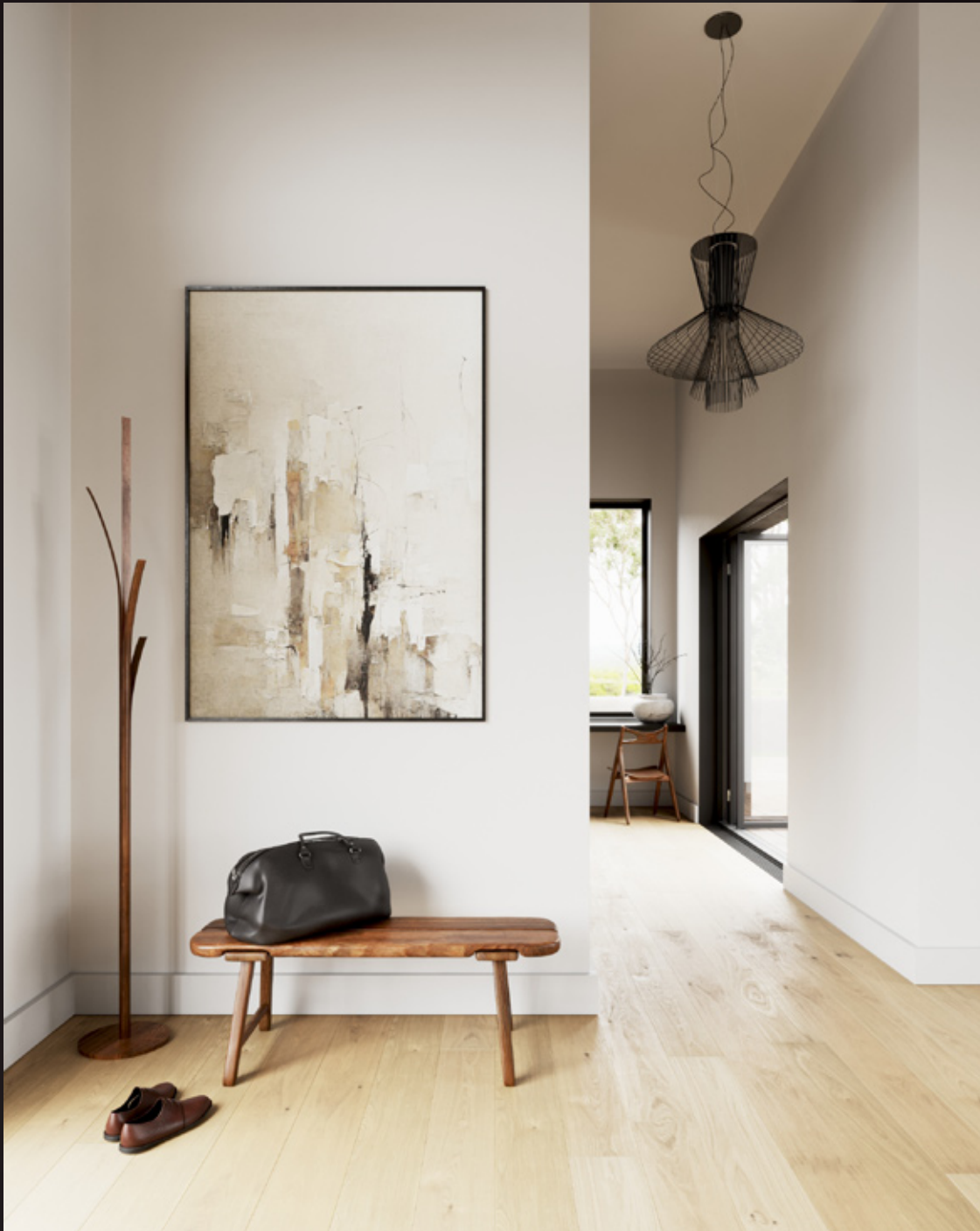
scene 05 cam 09

Have you ever wanted to make professional interior renderings? Do you know how to use V-RaySun, V-RaySky and V-RayPhysicalCamera? Have you ever had problems with composition? Archinteriors will end all your problems. Take a look at this 5 fully textured scenes with professional shaders and lighting ready to render. Get your own portfolio and join cg market.