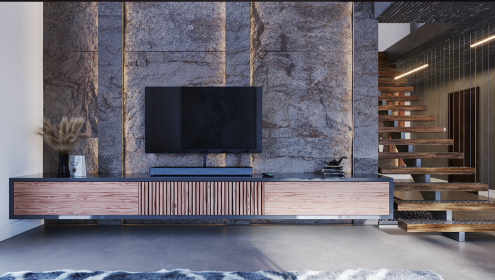
scene 02 cam 10

Have you ever wanted to make professional interior renderings? Do you know how to use V-RaySun, V-RaySky and V-RayPhysicalCamera? Have you ever had problems with composition? Archinteriors will end all your problems. Take a look at this 5 fully textured scenes with professional shaders and lighting ready to render. Get your own portfolio and join cg market.