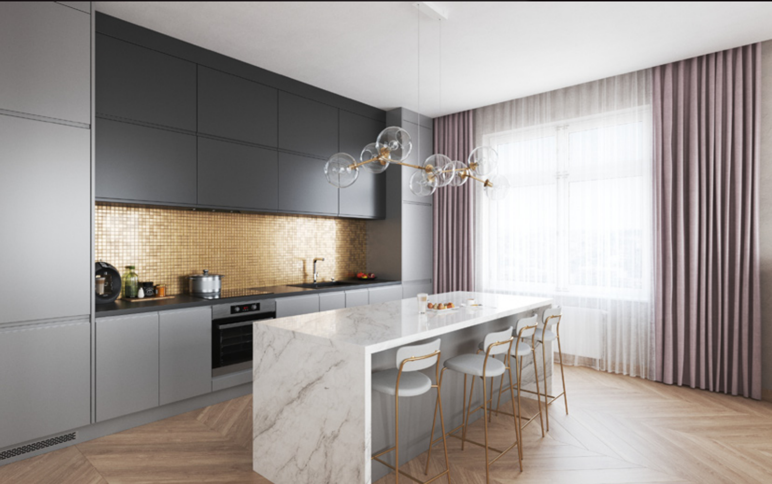
scene 04 cam 04

Have you ever wanted to make professional interior renderings? Do you know how to use V-RaySun, V-RaySky and V-RayPhysicalCamera? Have you ever had problems with composition? Archinteriors will end all your problems. Take a look at this 5 fully textured scenes with professional shaders and lighting ready to render. Get your own portfolio and join cg market.