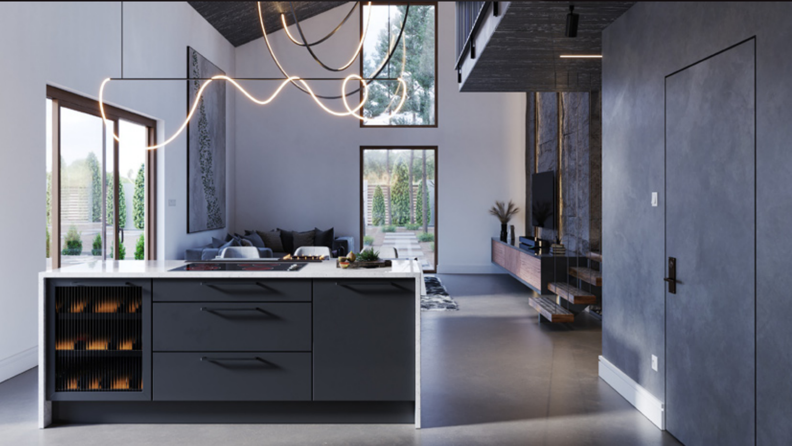
scene 02 cam 03

Have you ever wanted to make professional interior renderings? Do you know how to use V-RaySun, V-RaySky and V-RayPhysicalCamera? Have you ever had problems with composition? Archinteriors will end all your problems. Take a look at this 5 fully textured scenes with professional shaders and lighting ready to render. Get your own portfolio and join cg market.