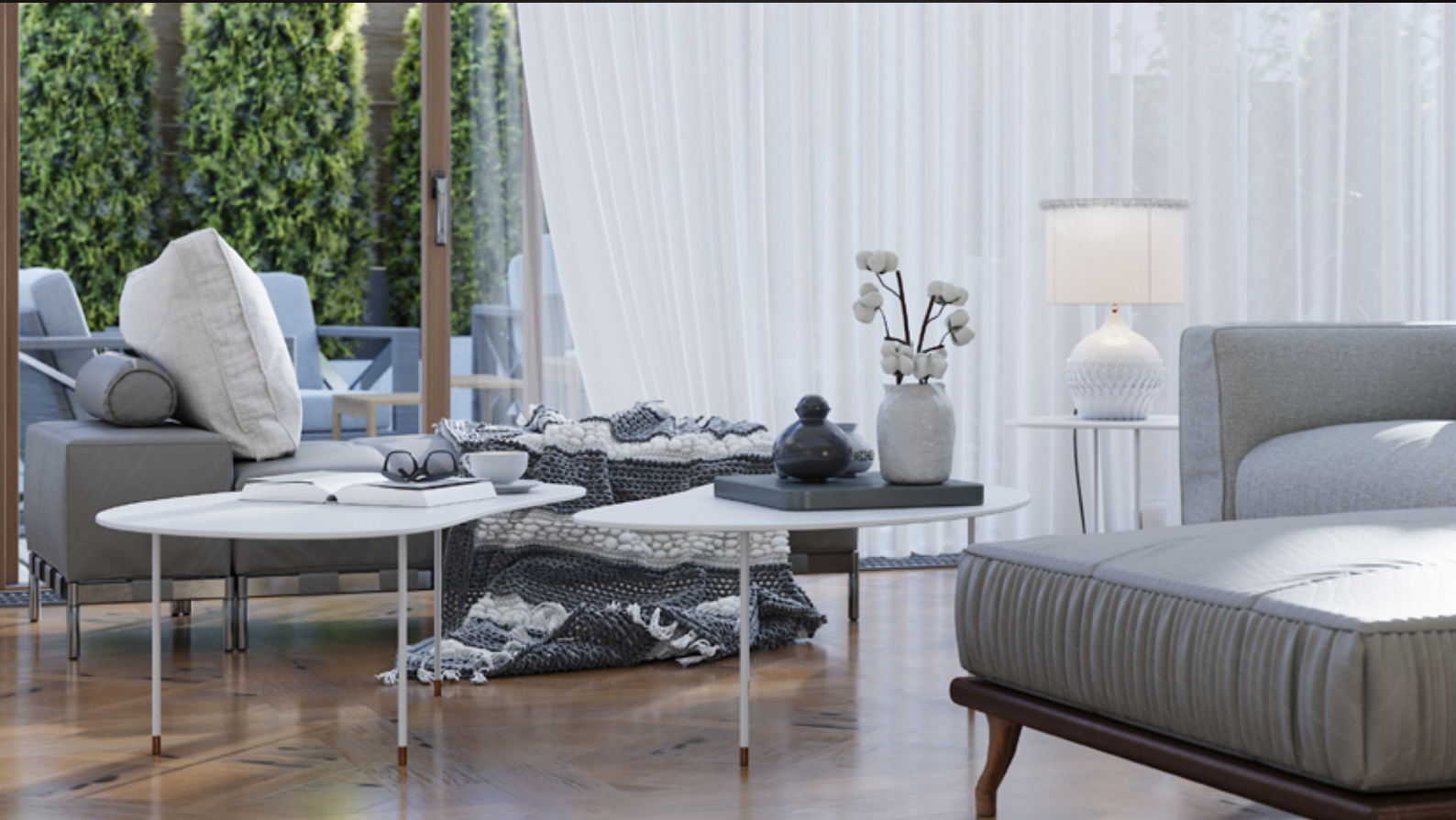
scene 01 cam 03

Have you ever wanted to make professional interior renderings? Do you know how to use V-RaySun, V-RaySky and V-RayPhysicalCamera? Have you ever had problems with composition? Archinteriors will end all your problems. Take a look at this 5 fully textured scenes with professional shaders and lighting ready to render. Get your own portfolio and join cg market.