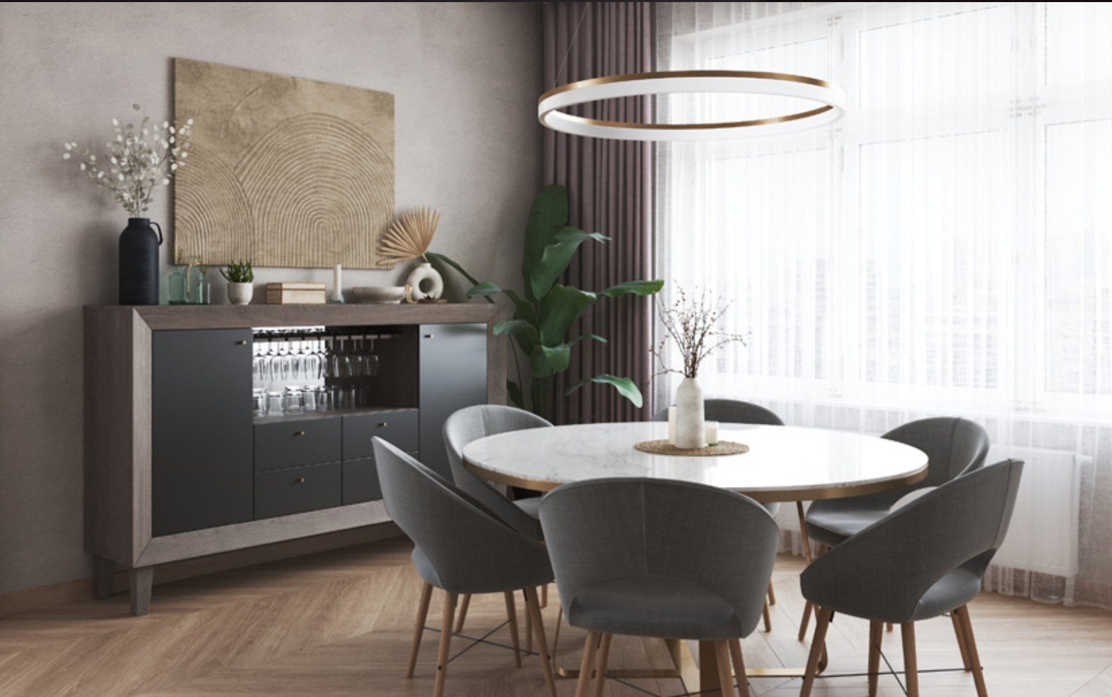
scene 04 cam 05

Have you ever wanted to make professional interior renderings? Do you know how to use V-RaySun, V-RaySky and V-RayPhysicalCamera? Have you ever had problems with composition? Archinteriors will end all your problems. Take a look at this 5 fully textured scenes with professional shaders and lighting ready to render. Get your own portfolio and join cg market.