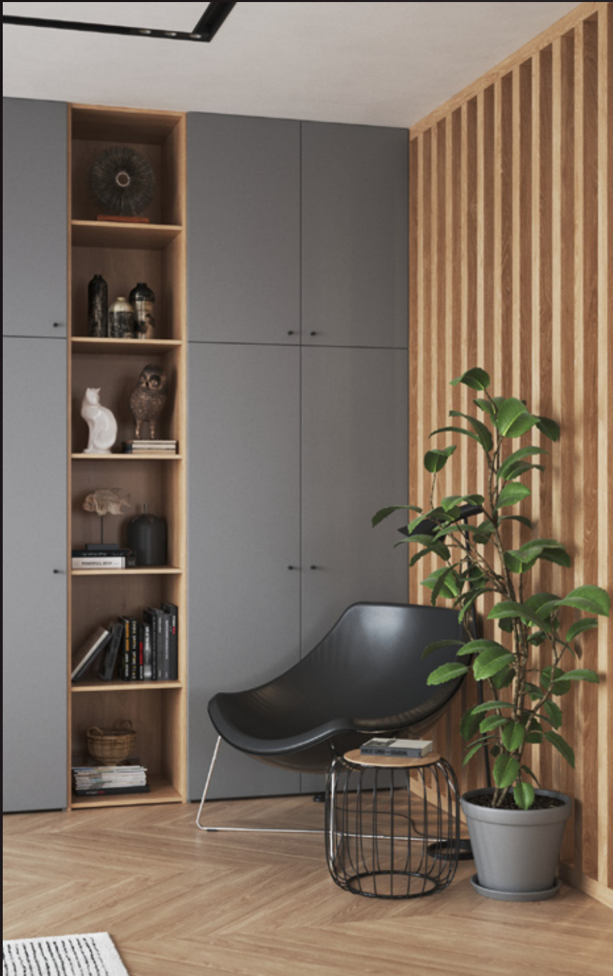
scene 04 cam 11

Have you ever wanted to make professional interior renderings? Do you know how to use V-RaySun, V-RaySky and V-RayPhysicalCamera? Have you ever had problems with composition? Archinteriors will end all your problems. Take a look at this 5 fully textured scenes with professional shaders and lighting ready to render. Get your own portfolio and join cg market.