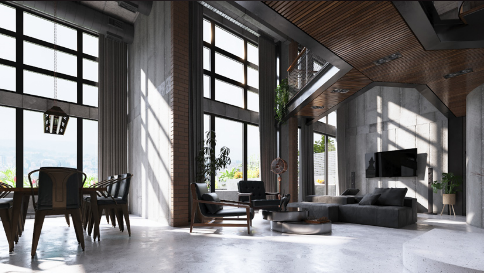
scene 03 cam 01

Have you ever wanted to make professional interior renderings? Do you know how to use V-RaySun, V-RaySky and V-RayPhysicalCamera? Have you ever had problems with composition? Archinteriors will end all your problems. Take a look at this 5 fully textured scenes with professional shaders and lighting ready to render. Get your own portfolio and join cg market.