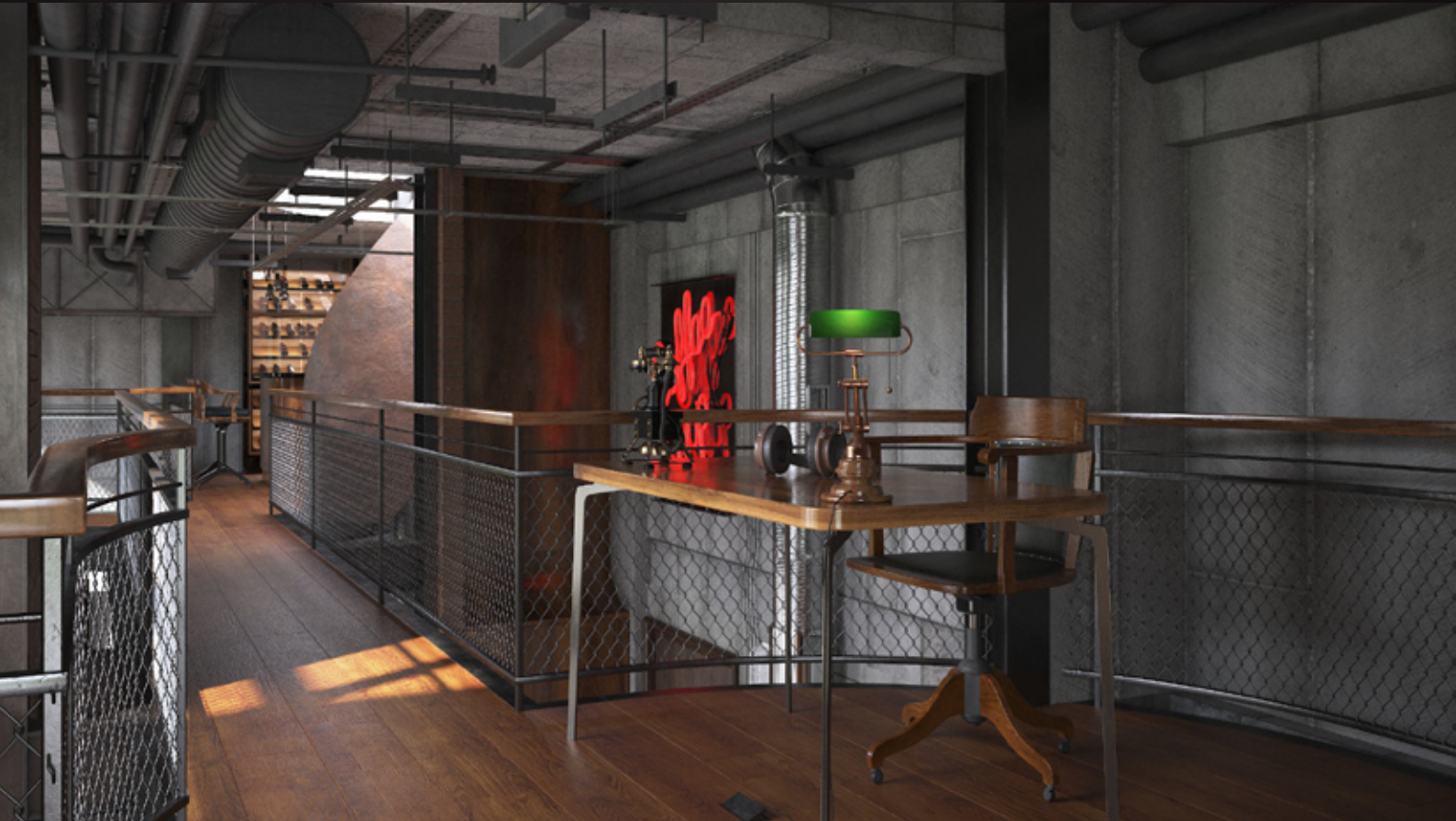
scene 03 cam 07

Have you ever wanted to make professional interior renderings? Do you know how to use V-RaySun, V-RaySky and V-RayPhysicalCamera? Have you ever had problems with composition? Archinteriors will end all your problems. Take a look at this 5 fully textured scenes with professional shaders and lighting ready to render. Get your own portfolio and join cg market.