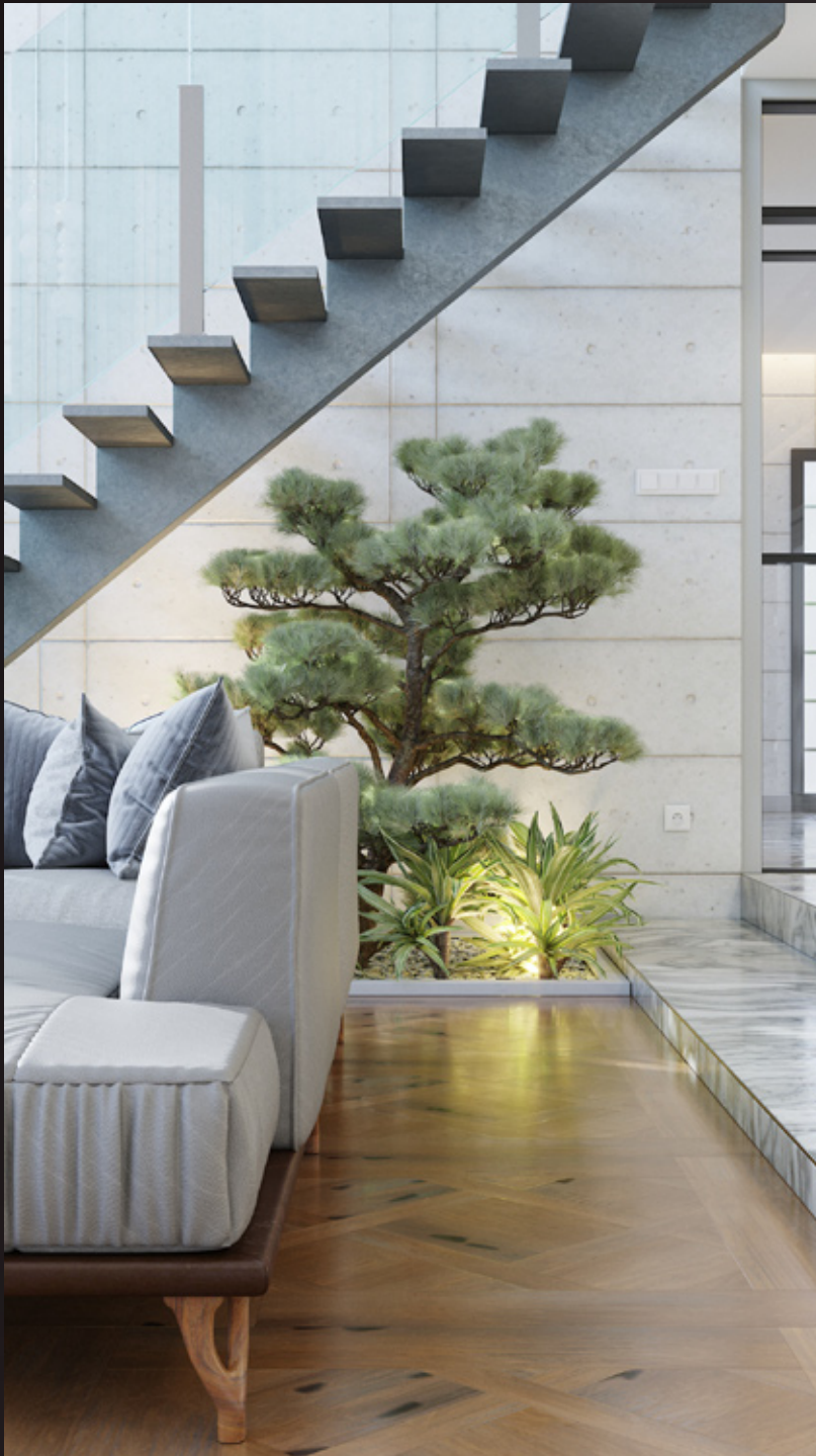
scene 01 cam 07

Have you ever wanted to make professional interior renderings? Do you know how to use V-RaySun, V-RaySky and V-RayPhysicalCamera? Have you ever had problems with composition? Archinteriors will end all your problems. Take a look at this 5 fully textured scenes with professional shaders and lighting ready to render. Get your own portfolio and join cg market.