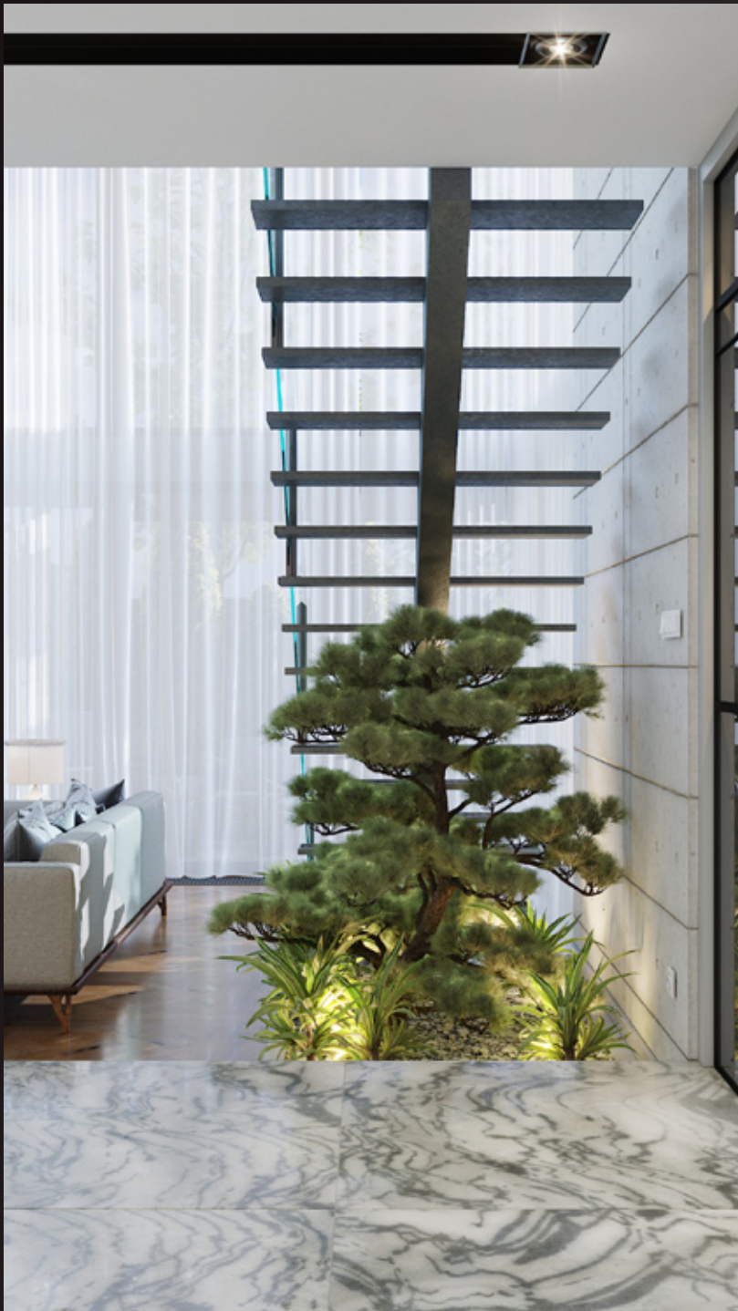
scene 01 cam 05

Have you ever wanted to make professional interior renderings? Do you know how to use V-RaySun, V-RaySky and V-RayPhysicalCamera? Have you ever had problems with composition? Archinteriors will end all your problems. Take a look at this 5 fully textured scenes with professional shaders and lighting ready to render. Get your own portfolio and join cg market.