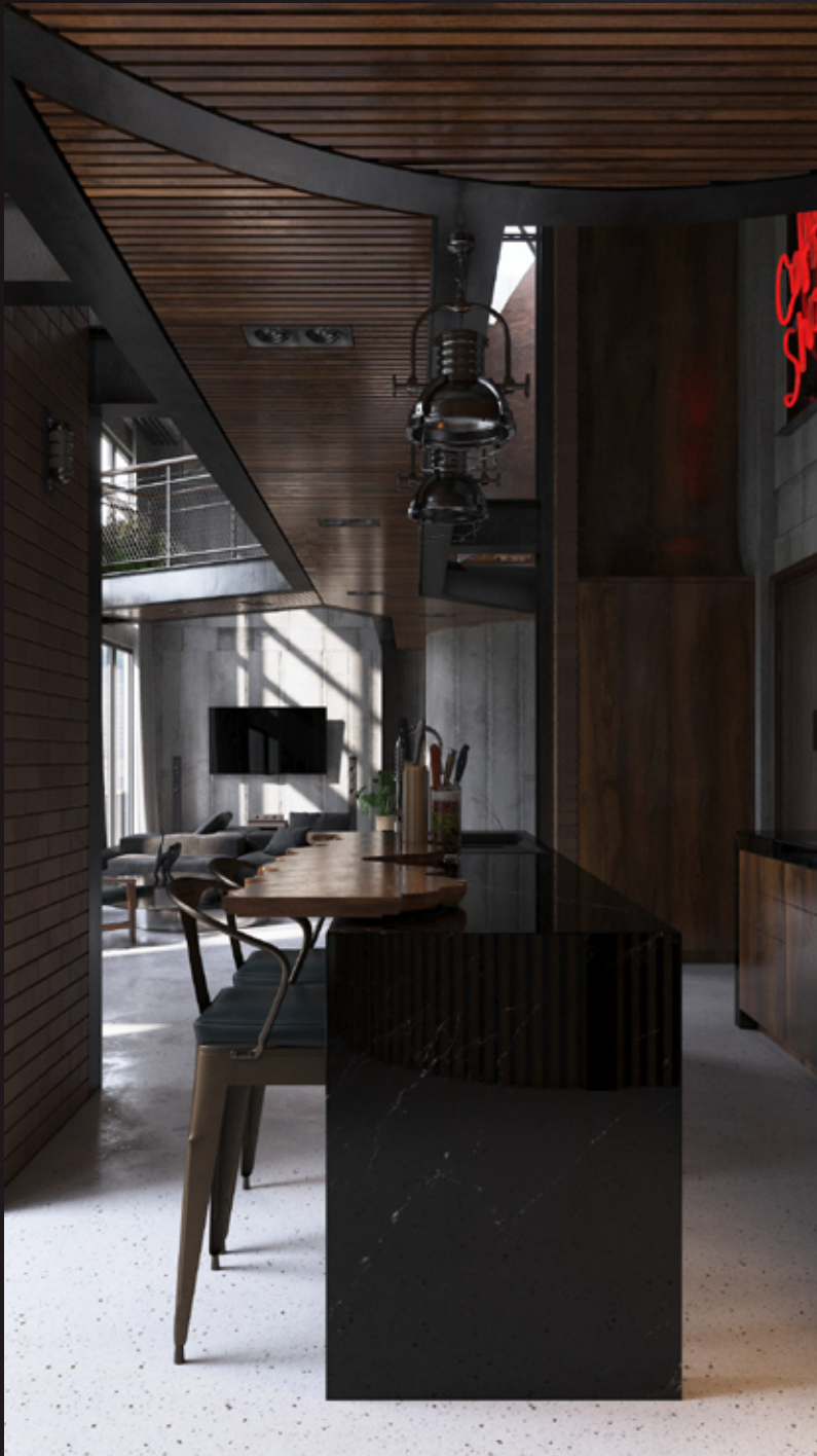
scene 03 cam 04

Have you ever wanted to make professional interior renderings? Do you know how to use V-RaySun, V-RaySky and V-RayPhysicalCamera? Have you ever had problems with composition? Archinteriors will end all your problems. Take a look at this 5 fully textured scenes with professional shaders and lighting ready to render. Get your own portfolio and join cg market.