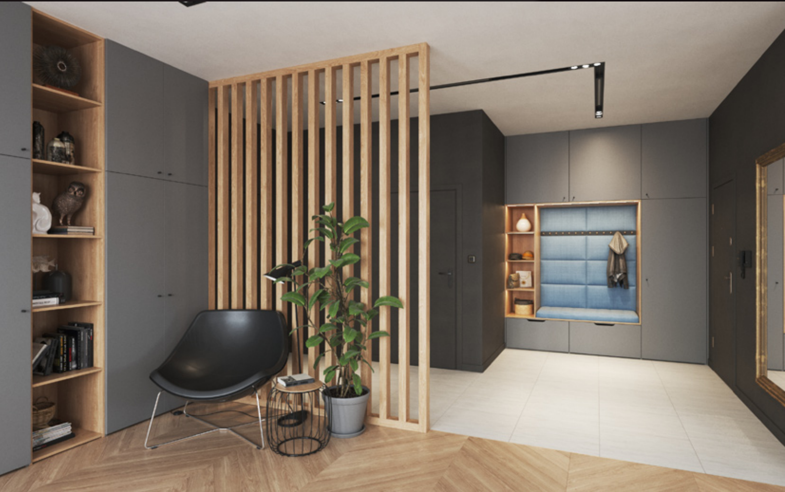
scene 04 cam 06

Have you ever wanted to make professional interior renderings? Do you know how to use V-RaySun, V-RaySky and V-RayPhysicalCamera? Have you ever had problems with composition? Archinteriors will end all your problems. Take a look at this 5 fully textured scenes with professional shaders and lighting ready to render. Get your own portfolio and join cg market.