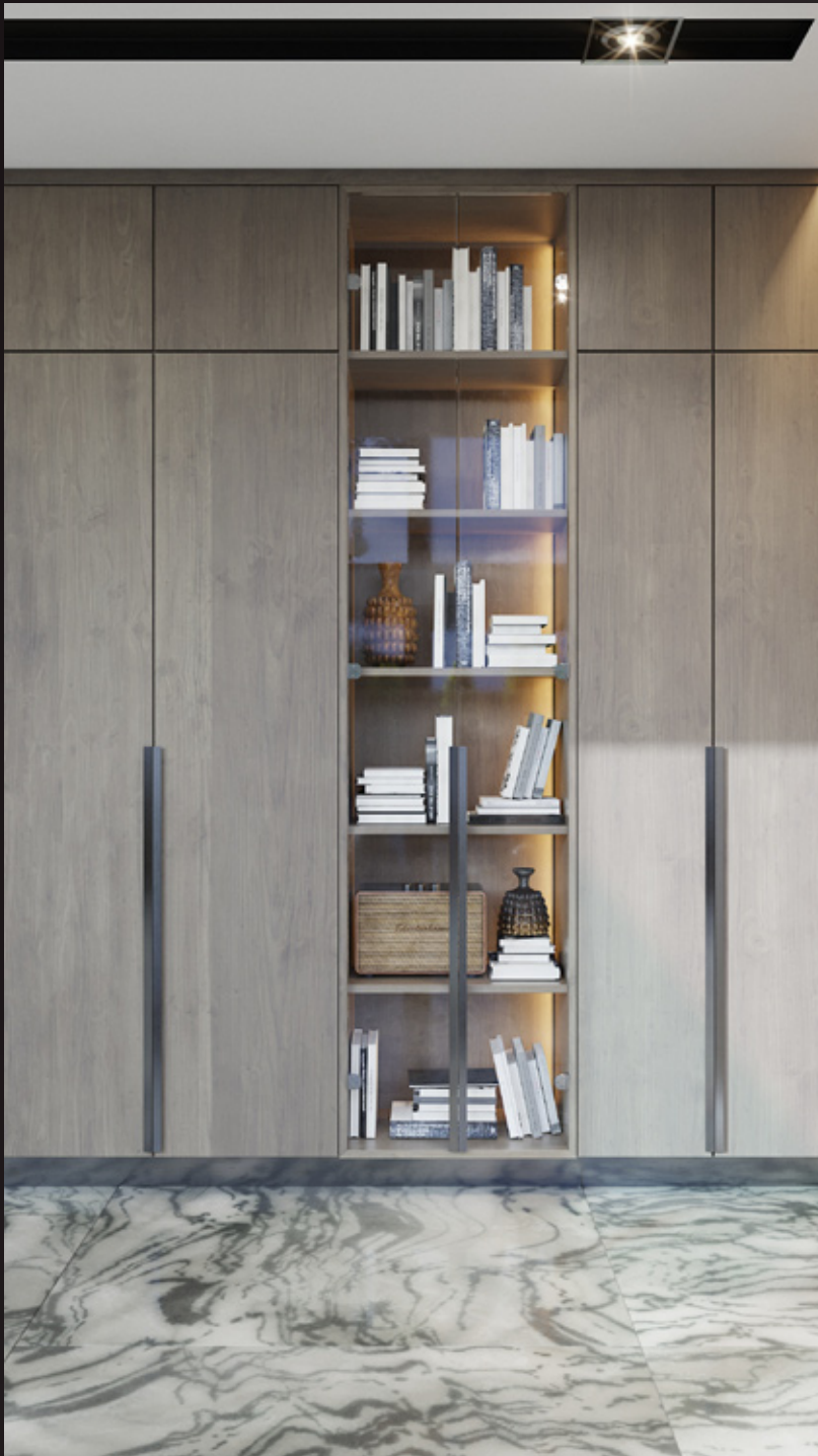
scene 01 cam 08

Have you ever wanted to make professional interior renderings? Do you know how to use V-RaySun, V-RaySky and V-RayPhysicalCamera? Have you ever had problems with composition? Archinteriors will end all your problems. Take a look at this 5 fully textured scenes with professional shaders and lighting ready to render. Get your own portfolio and join cg market.