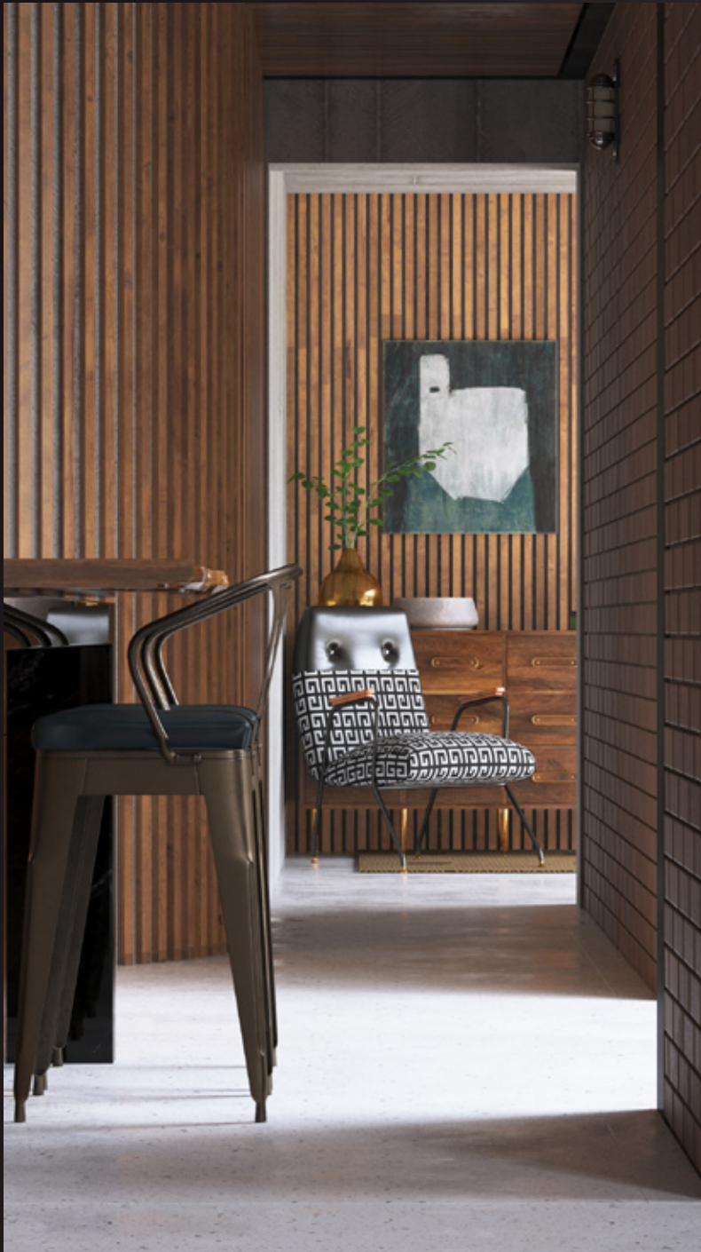
scene 03 cam 12

Have you ever wanted to make professional interior renderings? Do you know how to use V-RaySun, V-RaySky and V-RayPhysicalCamera? Have you ever had problems with composition? Archinteriors will end all your problems. Take a look at this 5 fully textured scenes with professional shaders and lighting ready to render. Get your own portfolio and join cg market.