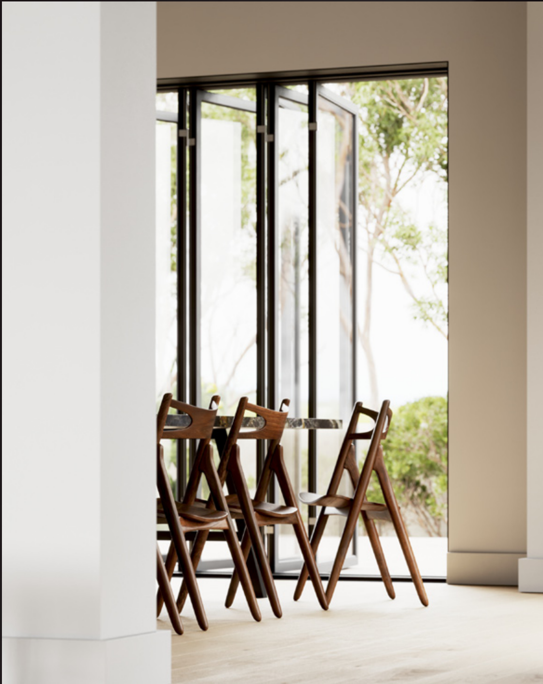
scene 05 cam 11

Have you ever wanted to make professional interior renderings? Do you know how to use V-RaySun, V-RaySky and V-RayPhysicalCamera? Have you ever had problems with composition? Archinteriors will end all your problems. Take a look at this 5 fully textured scenes with professional shaders and lighting ready to render. Get your own portfolio and join cg market.