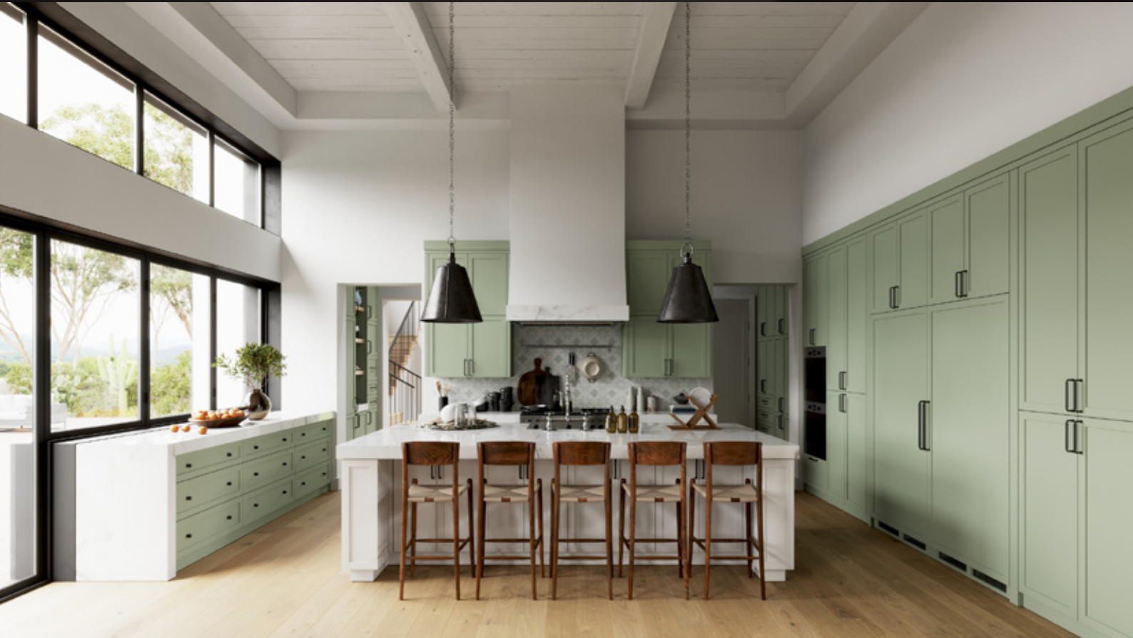
scene 05 cam 02

Have you ever wanted to make professional interior renderings? Do you know how to use V-RaySun, V-RaySky and V-RayPhysicalCamera? Have you ever had problems with composition? Archinteriors will end all your problems. Take a look at this 5 fully textured scenes with professional shaders and lighting ready to render. Get your own portfolio and join cg market.