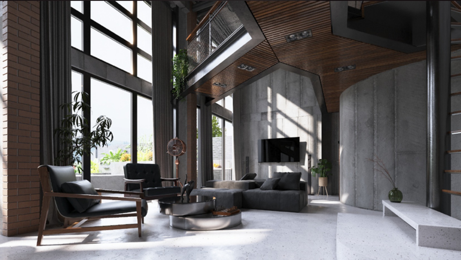
scene 03 cam 06

Have you ever wanted to make professional interior renderings? Do you know how to use V-RaySun, V-RaySky and V-RayPhysicalCamera? Have you ever had problems with composition? Archinteriors will end all your problems. Take a look at this 5 fully textured scenes with professional shaders and lighting ready to render. Get your own portfolio and join cg market.