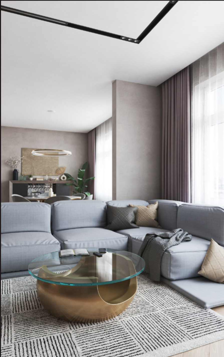
scene 04 cam 10

Have you ever wanted to make professional interior renderings? Do you know how to use V-RaySun, V-RaySky and V-RayPhysicalCamera? Have you ever had problems with composition? Archinteriors will end all your problems. Take a look at this 5 fully textured scenes with professional shaders and lighting ready to render. Get your own portfolio and join cg market.