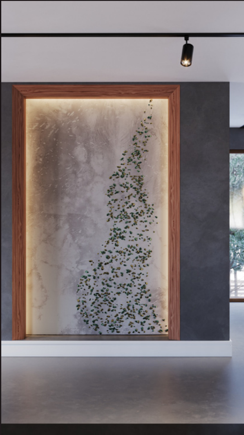
scene 02 cam 09

Have you ever wanted to make professional interior renderings? Do you know how to use V-RaySun, V-RaySky and V-RayPhysicalCamera? Have you ever had problems with composition? Archinteriors will end all your problems. Take a look at this 5 fully textured scenes with professional shaders and lighting ready to render. Get your own portfolio and join cg market.