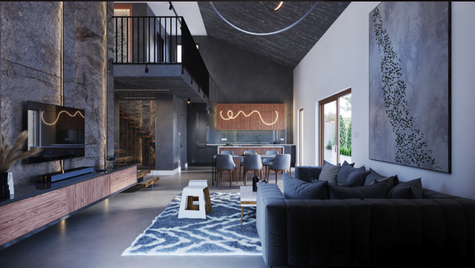
scene 02 cam 02

Have you ever wanted to make professional interior renderings? Do you know how to use V-RaySun, V-RaySky and V-RayPhysicalCamera? Have you ever had problems with composition? Archinteriors will end all your problems. Take a look at this 5 fully textured scenes with professional shaders and lighting ready to render. Get your own portfolio and join cg market.