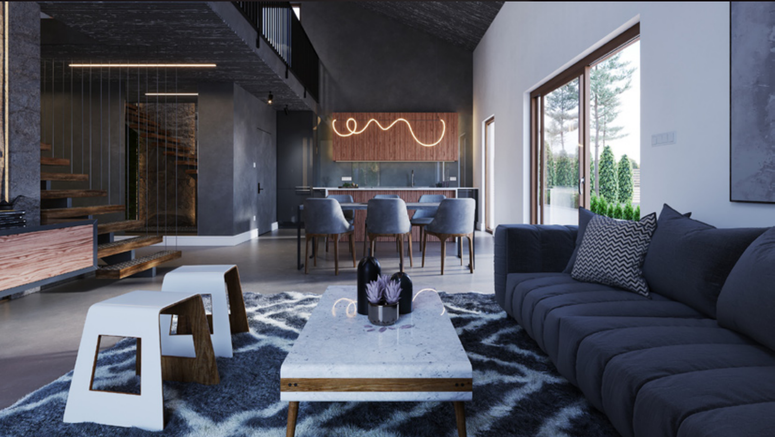
scene 02 cam 04

Have you ever wanted to make professional interior renderings? Do you know how to use V-RaySun, V-RaySky and V-RayPhysicalCamera? Have you ever had problems with composition? Archinteriors will end all your problems. Take a look at this 5 fully textured scenes with professional shaders and lighting ready to render. Get your own portfolio and join cg market.