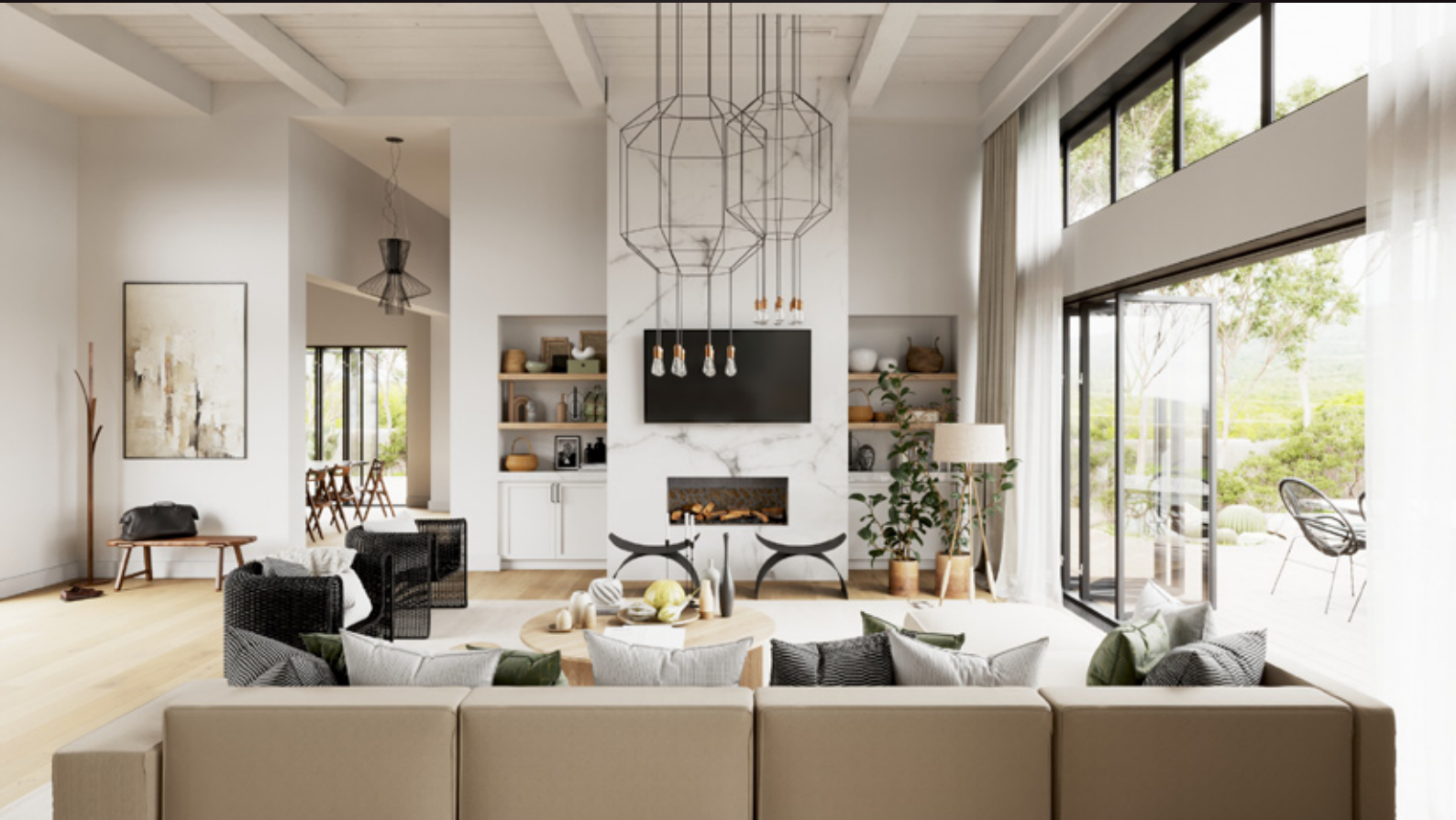
scene 05 cam 01

Have you ever wanted to make professional interior renderings? Do you know how to use V-RaySun, V-RaySky and V-RayPhysicalCamera? Have you ever had problems with composition? Archinteriors will end all your problems. Take a look at this 5 fully textured scenes with professional shaders and lighting ready to render. Get your own portfolio and join cg market.