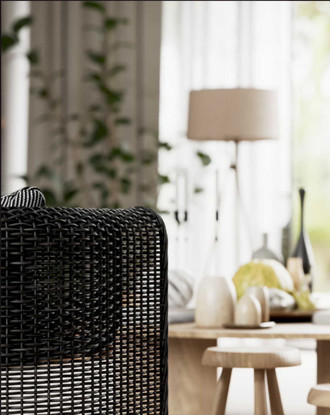
scene 05 cam 10

Have you ever wanted to make professional interior renderings? Do you know how to use V-RaySun, V-RaySky and V-RayPhysicalCamera? Have you ever had problems with composition? Archinteriors will end all your problems. Take a look at this 5 fully textured scenes with professional shaders and lighting ready to render. Get your own portfolio and join cg market.