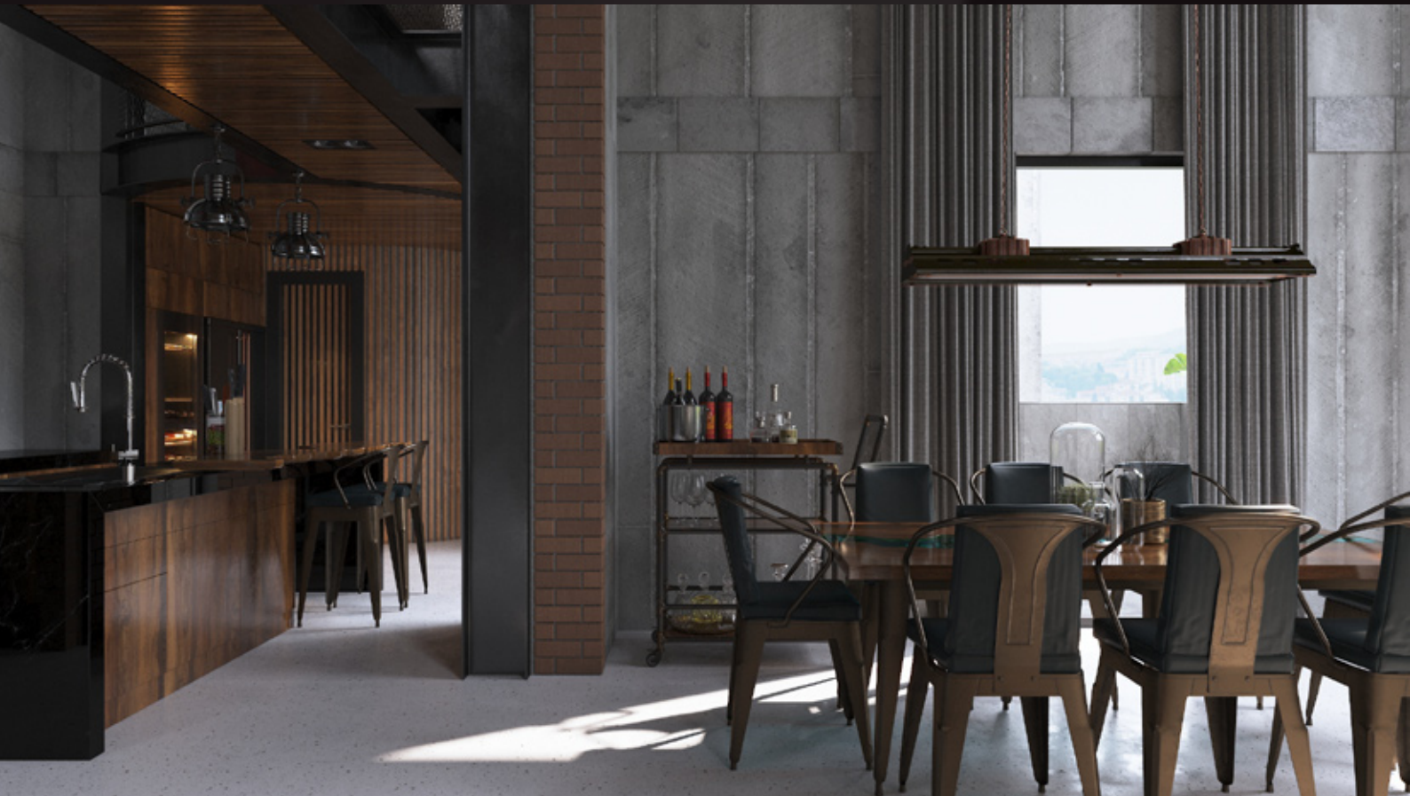
scene 03 cam 09

Have you ever wanted to make professional interior renderings? Do you know how to use V-RaySun, V-RaySky and V-RayPhysicalCamera? Have you ever had problems with composition? Archinteriors will end all your problems. Take a look at this 5 fully textured scenes with professional shaders and lighting ready to render. Get your own portfolio and join cg market.