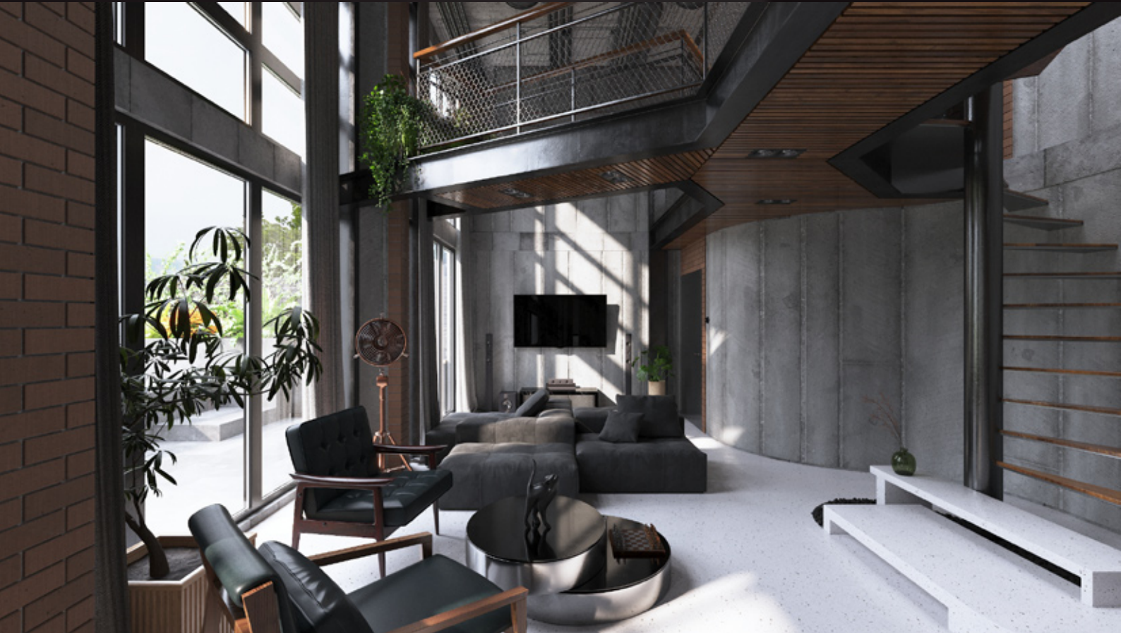
scene 03 cam 10

Have you ever wanted to make professional interior renderings? Do you know how to use V-RaySun, V-RaySky and V-RayPhysicalCamera? Have you ever had problems with composition? Archinteriors will end all your problems. Take a look at this 5 fully textured scenes with professional shaders and lighting ready to render. Get your own portfolio and join cg market.