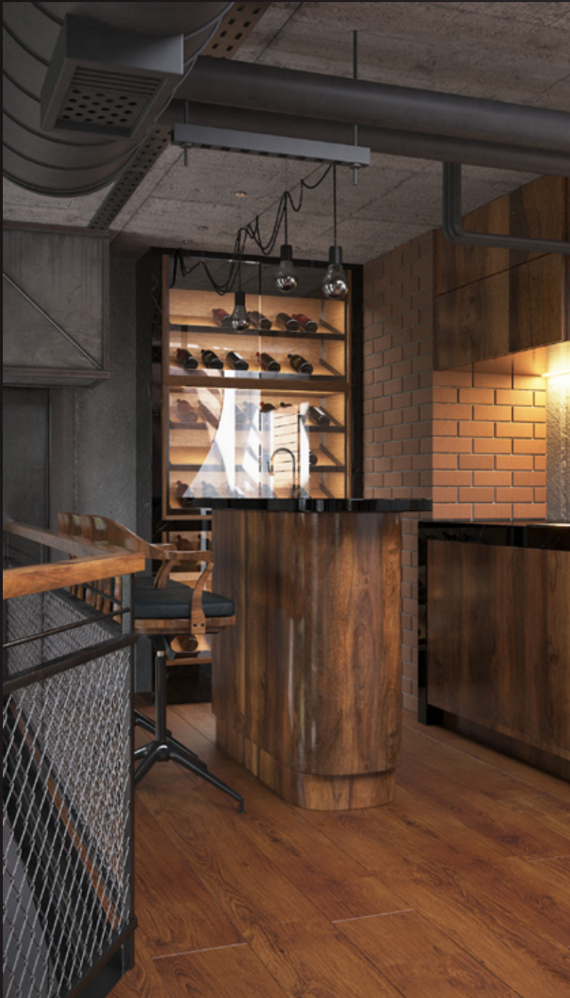
scene 03 cam 08

Have you ever wanted to make professional interior renderings? Do you know how to use V-RaySun, V-RaySky and V-RayPhysicalCamera? Have you ever had problems with composition? Archinteriors will end all your problems. Take a look at this 5 fully textured scenes with professional shaders and lighting ready to render. Get your own portfolio and join cg market.