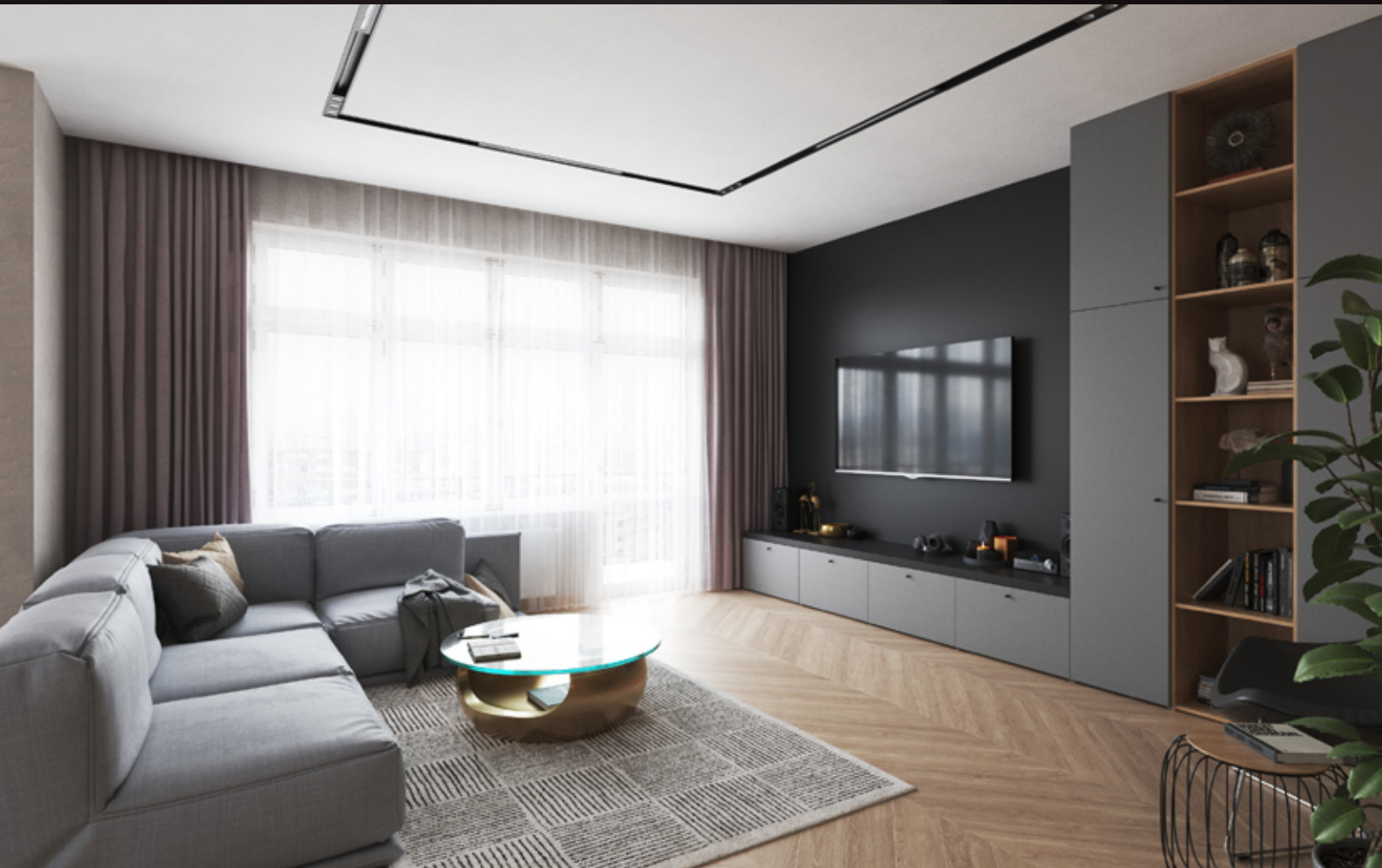
scene 04 cam 01

Have you ever wanted to make professional interior renderings? Do you know how to use V-RaySun, V-RaySky and V-RayPhysicalCamera? Have you ever had problems with composition? Archinteriors will end all your problems. Take a look at this 5 fully textured scenes with professional shaders and lighting ready to render. Get your own portfolio and join cg market.