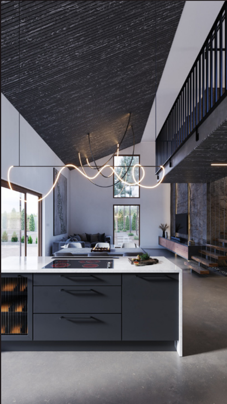
scene 02 cam 06

Have you ever wanted to make professional interior renderings? Do you know how to use V-RaySun, V-RaySky and V-RayPhysicalCamera? Have you ever had problems with composition? Archinteriors will end all your problems. Take a look at this 5 fully textured scenes with professional shaders and lighting ready to render. Get your own portfolio and join cg market.