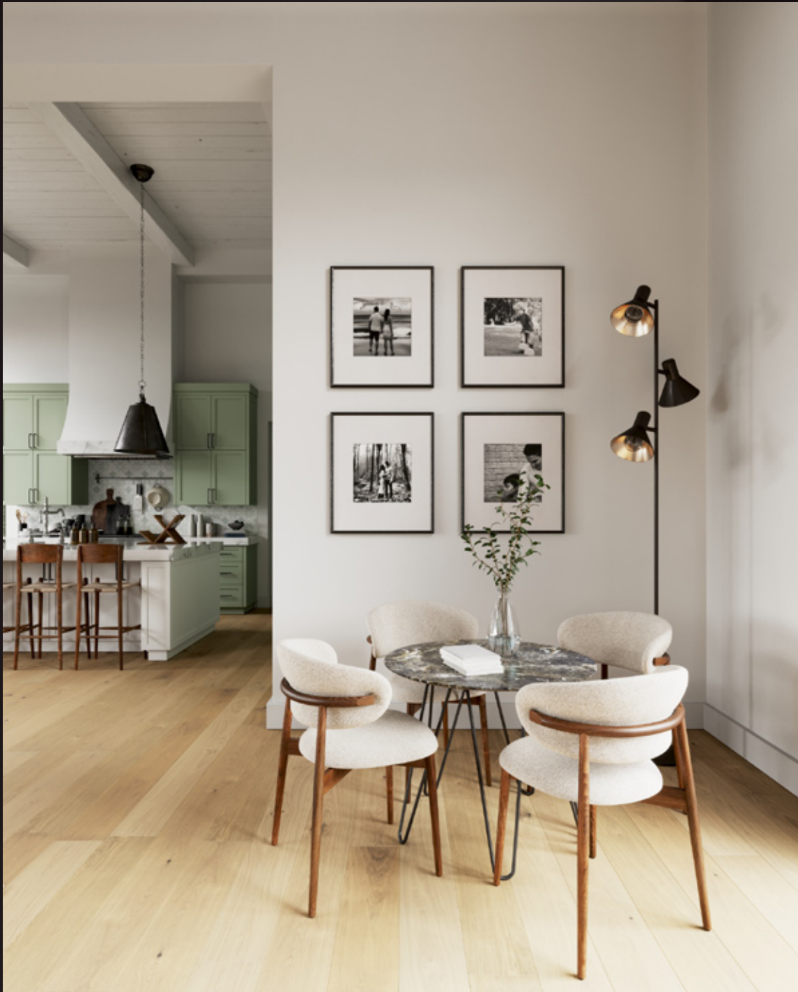
scene 05 cam 06

Have you ever wanted to make professional interior renderings? Do you know how to use V-RaySun, V-RaySky and V-RayPhysicalCamera? Have you ever had problems with composition? Archinteriors will end all your problems. Take a look at this 5 fully textured scenes with professional shaders and lighting ready to render. Get your own portfolio and join cg market.