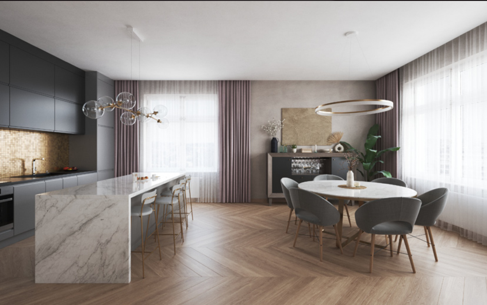
scene 04 cam 02

Have you ever wanted to make professional interior renderings? Do you know how to use V-RaySun, V-RaySky and V-RayPhysicalCamera? Have you ever had problems with composition? Archinteriors will end all your problems. Take a look at this 5 fully textured scenes with professional shaders and lighting ready to render. Get your own portfolio and join cg market.