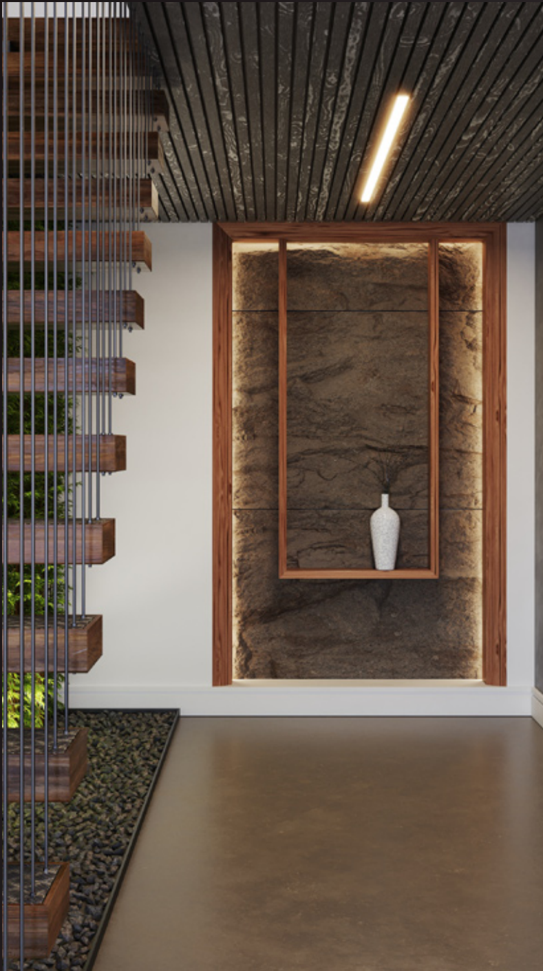
scene 02 cam 07

Have you ever wanted to make professional interior renderings? Do you know how to use V-RaySun, V-RaySky and V-RayPhysicalCamera? Have you ever had problems with composition? Archinteriors will end all your problems. Take a look at this 5 fully textured scenes with professional shaders and lighting ready to render. Get your own portfolio and join cg market.