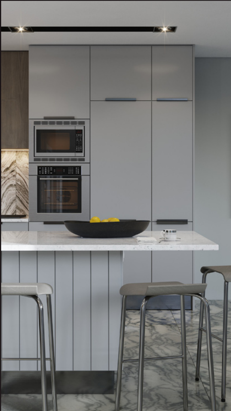
scene 01 cam 06

Have you ever wanted to make professional interior renderings? Do you know how to use V-RaySun, V-RaySky and V-RayPhysicalCamera? Have you ever had problems with composition? Archinteriors will end all your problems. Take a look at this 5 fully textured scenes with professional shaders and lighting ready to render. Get your own portfolio and join cg market.