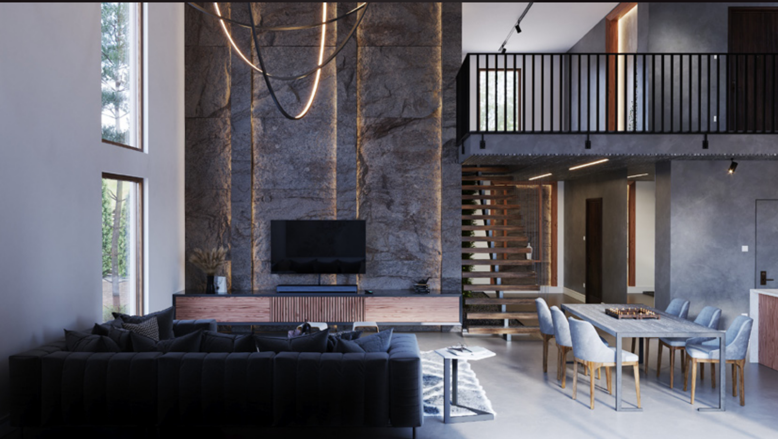
scene 02 cam 01

Have you ever wanted to make professional interior renderings? Do you know how to use V-RaySun, V-RaySky and V-RayPhysicalCamera? Have you ever had problems with composition? Archinteriors will end all your problems. Take a look at this 5 fully textured scenes with professional shaders and lighting ready to render. Get your own portfolio and join cg market.