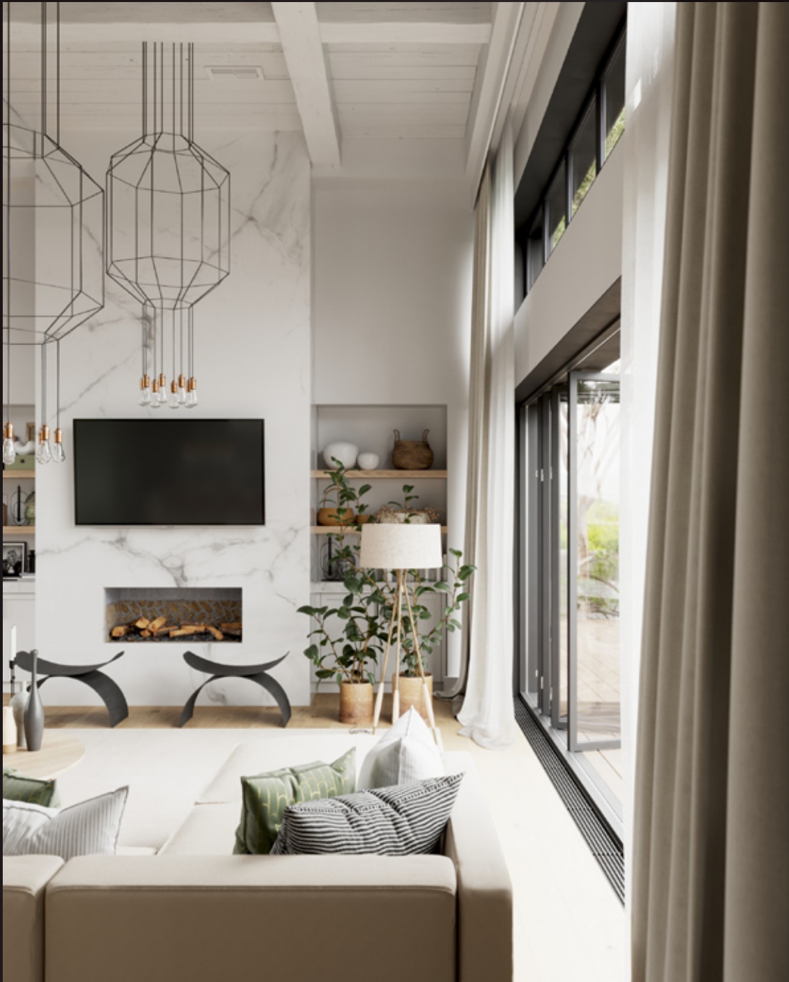
scene 05 cam 05

Have you ever wanted to make professional interior renderings? Do you know how to use V-RaySun, V-RaySky and V-RayPhysicalCamera? Have you ever had problems with composition? Archinteriors will end all your problems. Take a look at this 5 fully textured scenes with professional shaders and lighting ready to render. Get your own portfolio and join cg market.