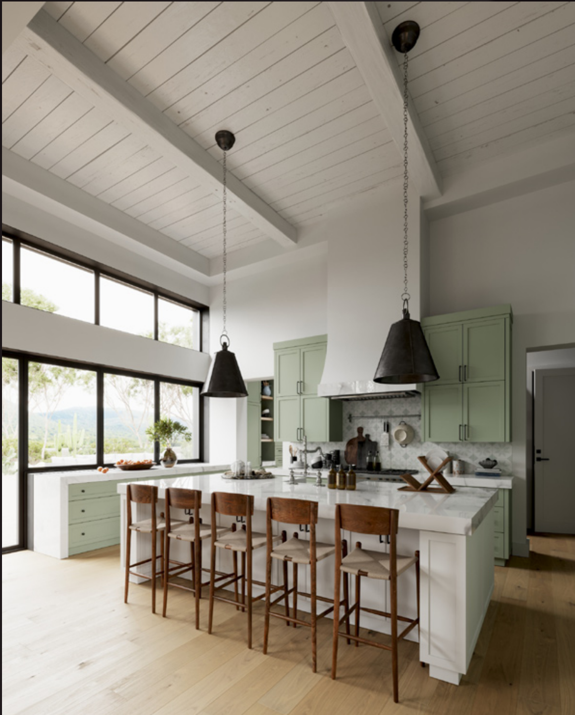
scene 05 cam 04

Have you ever wanted to make professional interior renderings? Do you know how to use V-RaySun, V-RaySky and V-RayPhysicalCamera? Have you ever had problems with composition? Archinteriors will end all your problems. Take a look at this 5 fully textured scenes with professional shaders and lighting ready to render. Get your own portfolio and join cg market.