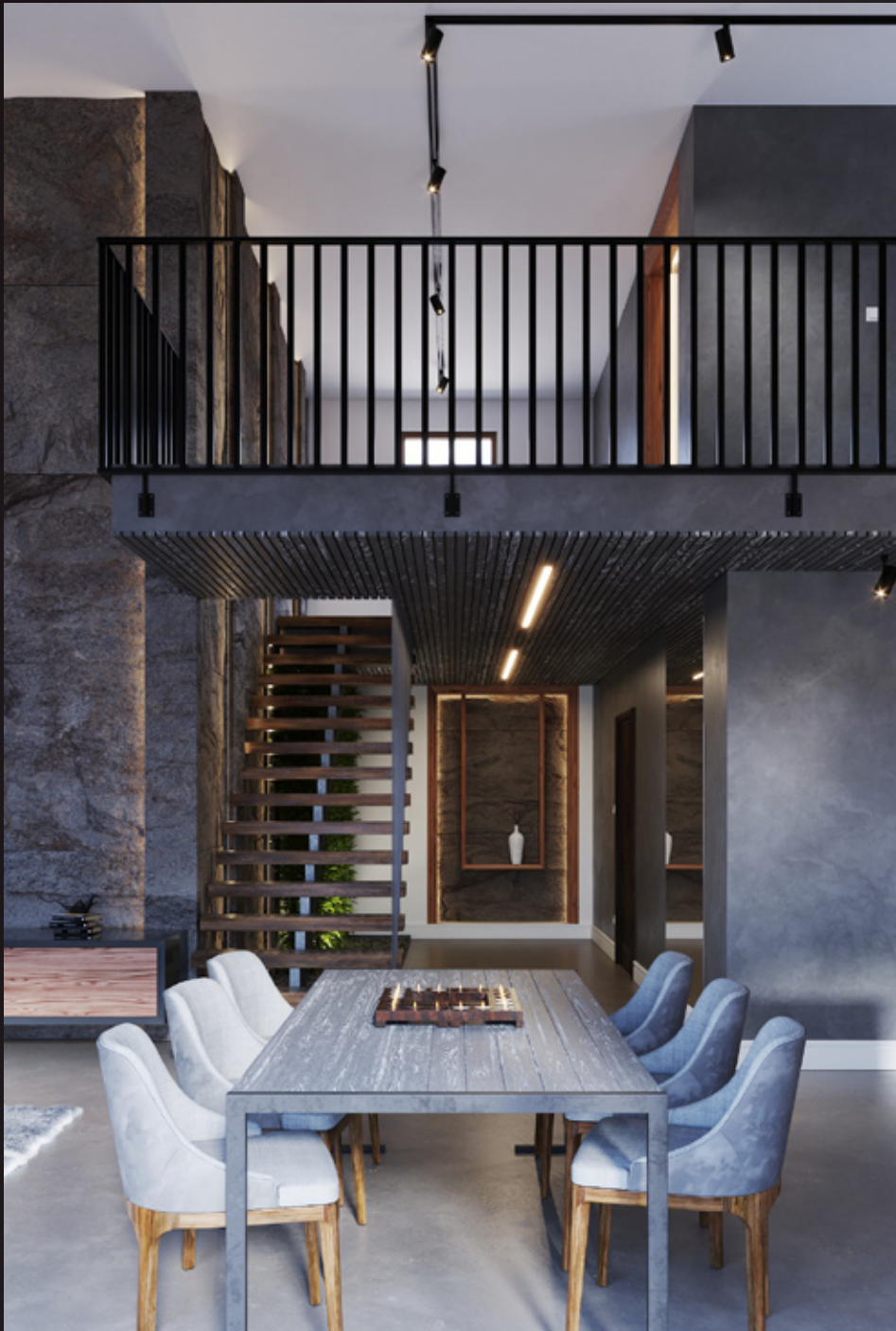
scene 02 cam 05

Have you ever wanted to make professional interior renderings? Do you know how to use V-RaySun, V-RaySky and V-RayPhysicalCamera? Have you ever had problems with composition? Archinteriors will end all your problems. Take a look at this 5 fully textured scenes with professional shaders and lighting ready to render. Get your own portfolio and join cg market.