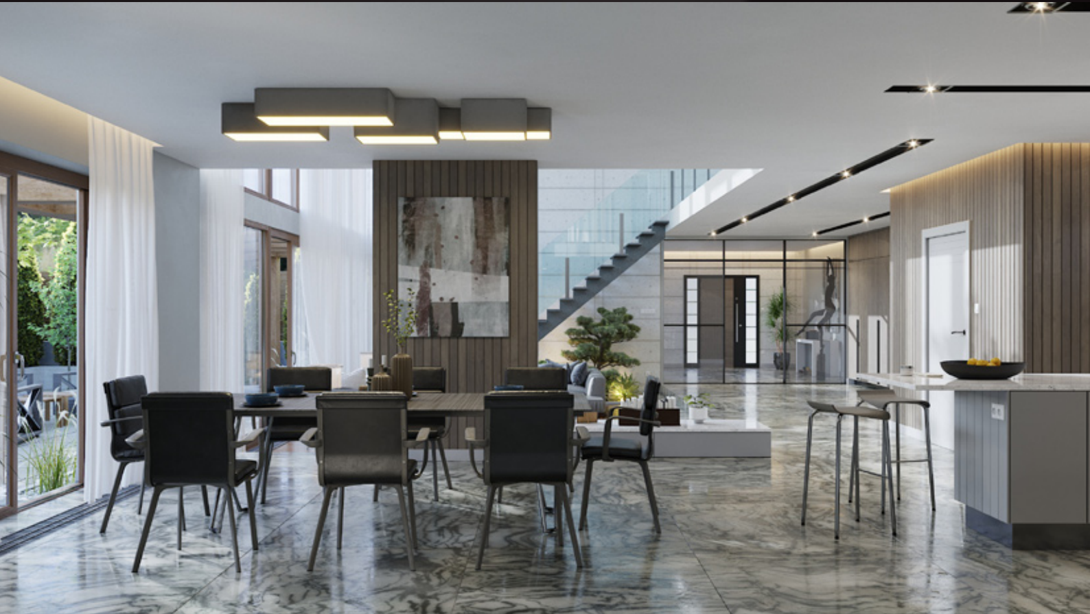
scene 01 cam 02

Have you ever wanted to make professional interior renderings? Do you know how to use V-RaySun, V-RaySky and V-RayPhysicalCamera? Have you ever had problems with composition? Archinteriors will end all your problems. Take a look at this 5 fully textured scenes with professional shaders and lighting ready to render. Get your own portfolio and join cg market.