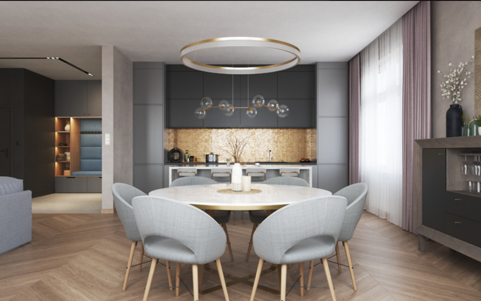
scene 04 cam 03

Have you ever wanted to make professional interior renderings? Do you know how to use V-RaySun, V-RaySky and V-RayPhysicalCamera? Have you ever had problems with composition? Archinteriors will end all your problems. Take a look at this 5 fully textured scenes with professional shaders and lighting ready to render. Get your own portfolio and join cg market.