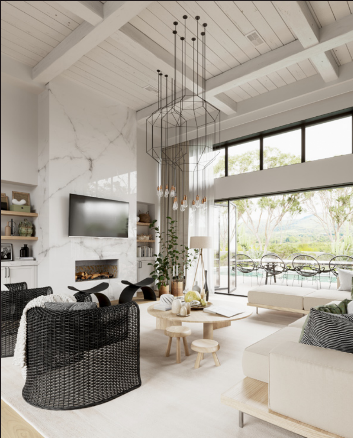
scene 05 cam 03

Have you ever wanted to make professional interior renderings? Do you know how to use V-RaySun, V-RaySky and V-RayPhysicalCamera? Have you ever had problems with composition? Archinteriors will end all your problems. Take a look at this 5 fully textured scenes with professional shaders and lighting ready to render. Get your own portfolio and join cg market.