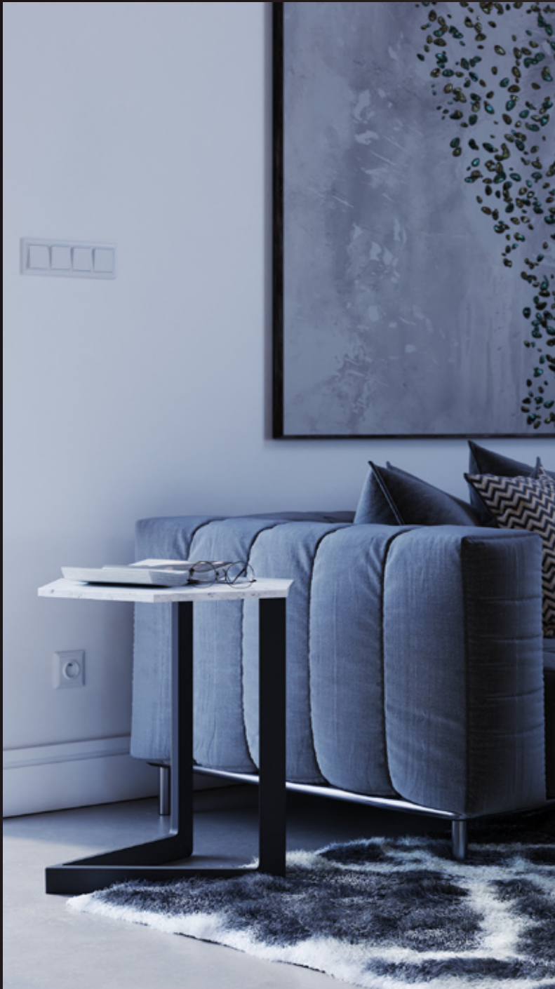
scene 02 cam 08

Have you ever wanted to make professional interior renderings? Do you know how to use V-RaySun, V-RaySky and V-RayPhysicalCamera? Have you ever had problems with composition? Archinteriors will end all your problems. Take a look at this 5 fully textured scenes with professional shaders and lighting ready to render. Get your own portfolio and join cg market.