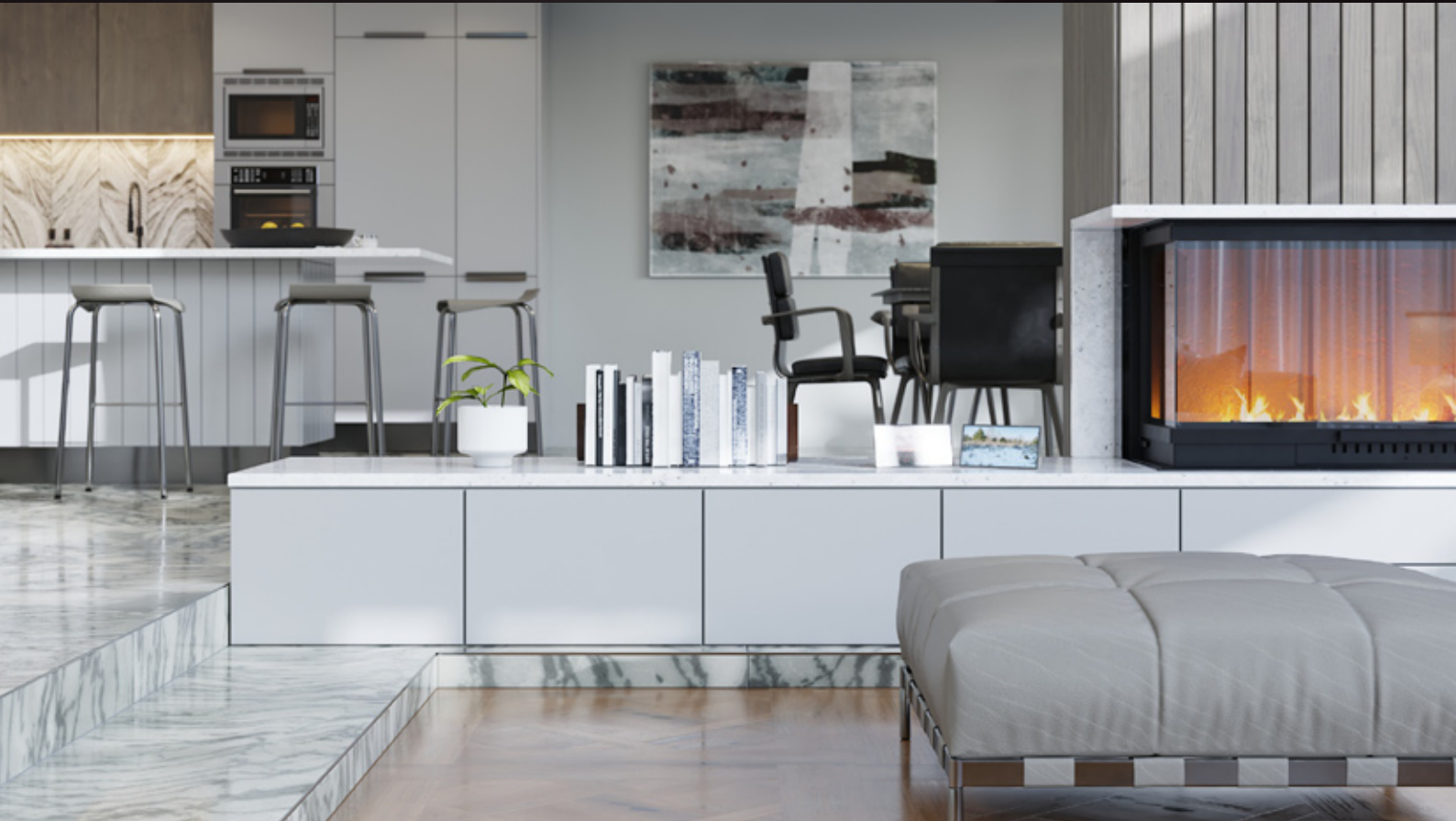
scene 01 cam 04

Have you ever wanted to make professional interior renderings? Do you know how to use V-RaySun, V-RaySky and V-RayPhysicalCamera? Have you ever had problems with composition? Archinteriors will end all your problems. Take a look at this 5 fully textured scenes with professional shaders and lighting ready to render. Get your own portfolio and join cg market.