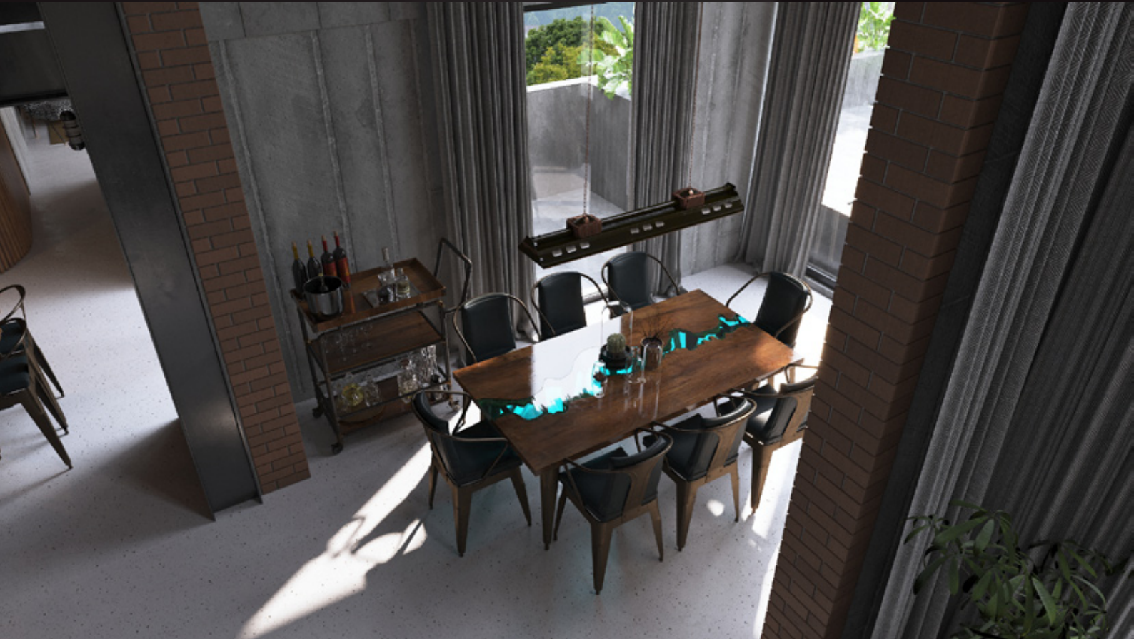
scene 03 cam 03

Have you ever wanted to make professional interior renderings? Do you know how to use V-RaySun, V-RaySky and V-RayPhysicalCamera? Have you ever had problems with composition? Archinteriors will end all your problems. Take a look at this 5 fully textured scenes with professional shaders and lighting ready to render. Get your own portfolio and join cg market.