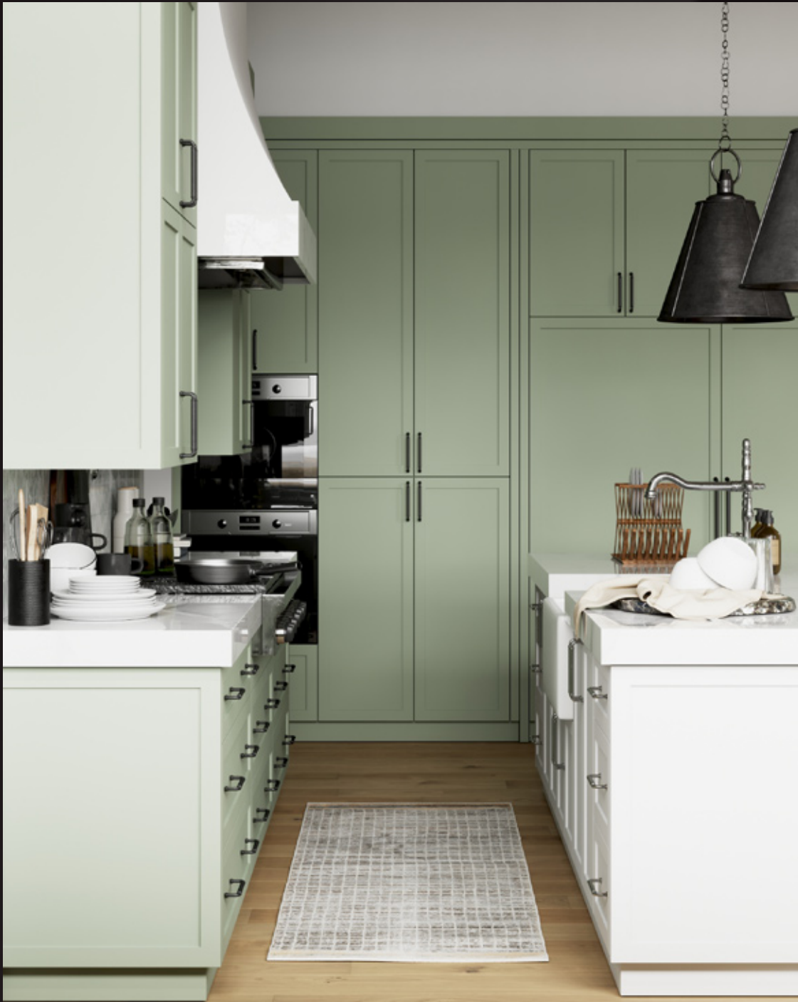
scene 05 cam 07

Have you ever wanted to make professional interior renderings? Do you know how to use V-RaySun, V-RaySky and V-RayPhysicalCamera? Have you ever had problems with composition? Archinteriors will end all your problems. Take a look at this 5 fully textured scenes with professional shaders and lighting ready to render. Get your own portfolio and join cg market.