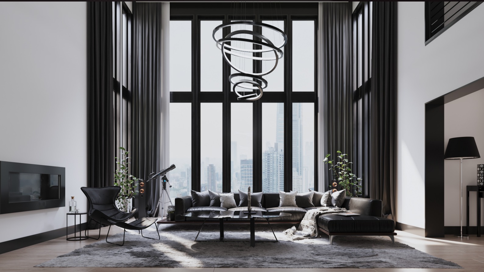
scene 05 cam 03

Have you ever wanted to make professional interior renderings? Do you know how to use V-RaySun, V-RaySky and V-RayPhysicalCamera? Have you ever had problems with composition? Archinteriors will end all your problems. Take a look at this 5 fully textured scenes with professional shaders and lighting ready to render. Get your own portfolio and join cg market.