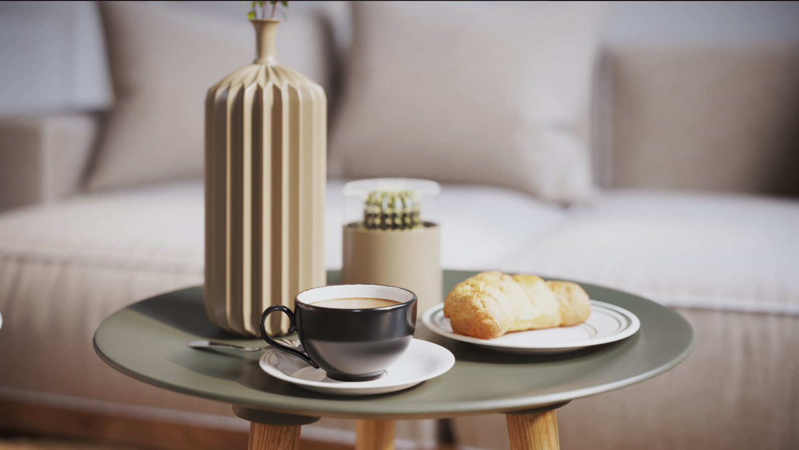
scene 01 cam 05

Have you ever wanted to make professional interior renderings? Do you know how to use V-RaySun, V-RaySky and V-RayPhysicalCamera? Have you ever had problems with composition? Archinteriors will end all your problems. Take a look at this 5 fully textured scenes with professional shaders and lighting ready to render. Get your own portfolio and join cg market.