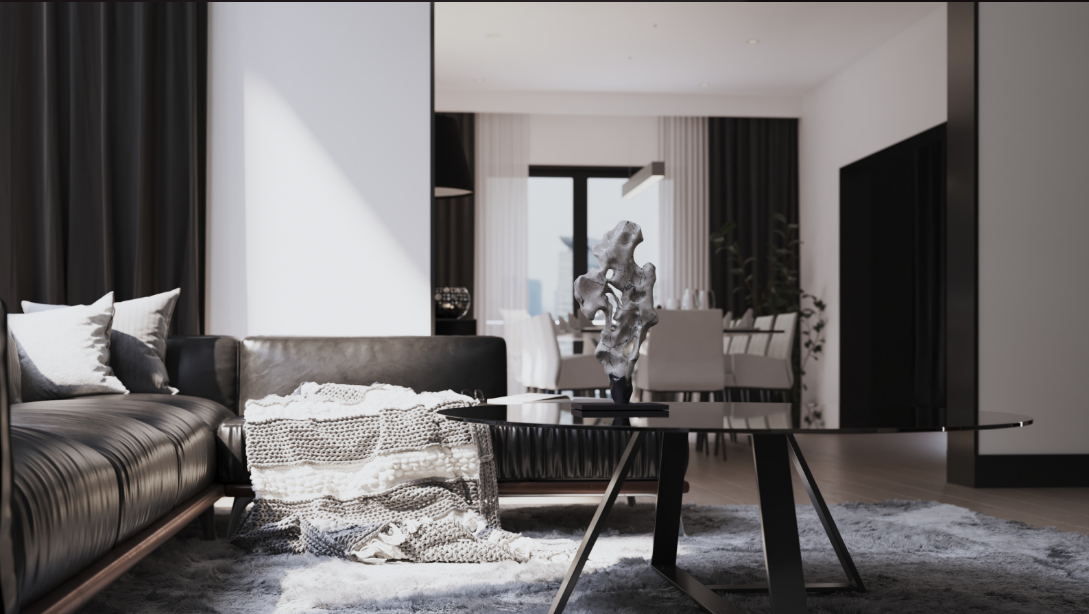
scene 05 cam 06

Have you ever wanted to make professional interior renderings? Do you know how to use V-RaySun, V-RaySky and V-RayPhysicalCamera? Have you ever had problems with composition? Archinteriors will end all your problems. Take a look at this 5 fully textured scenes with professional shaders and lighting ready to render. Get your own portfolio and join cg market.