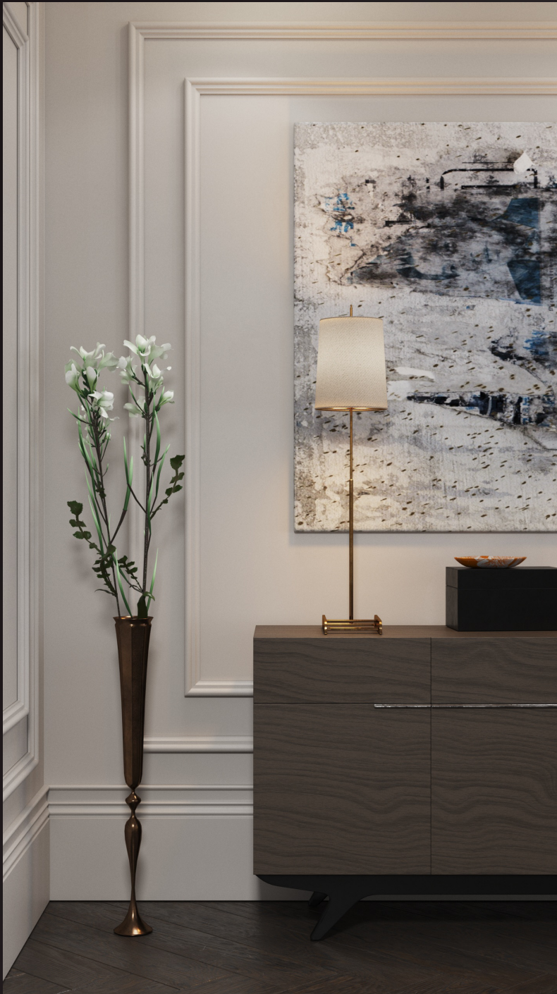
scene 02 cam 08

Have you ever wanted to make professional interior renderings? Do you know how to use V-RaySun, V-RaySky and V-RayPhysicalCamera? Have you ever had problems with composition? Archinteriors will end all your problems. Take a look at this 5 fully textured scenes with professional shaders and lighting ready to render. Get your own portfolio and join cg market.