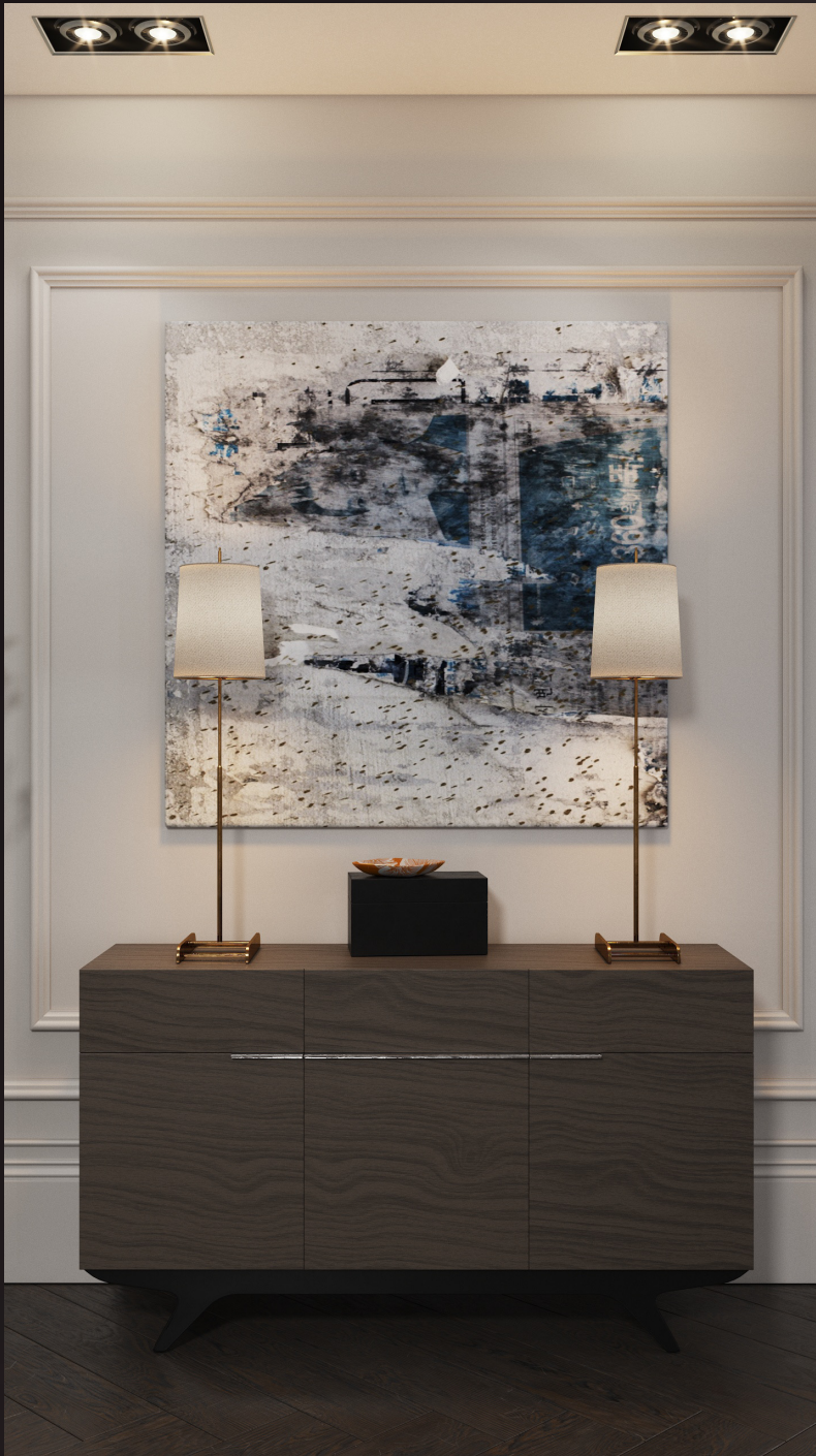
scene 02 cam 09

Have you ever wanted to make professional interior renderings? Do you know how to use V-RaySun, V-RaySky and V-RayPhysicalCamera? Have you ever had problems with composition? Archinteriors will end all your problems. Take a look at this 5 fully textured scenes with professional shaders and lighting ready to render. Get your own portfolio and join cg market.