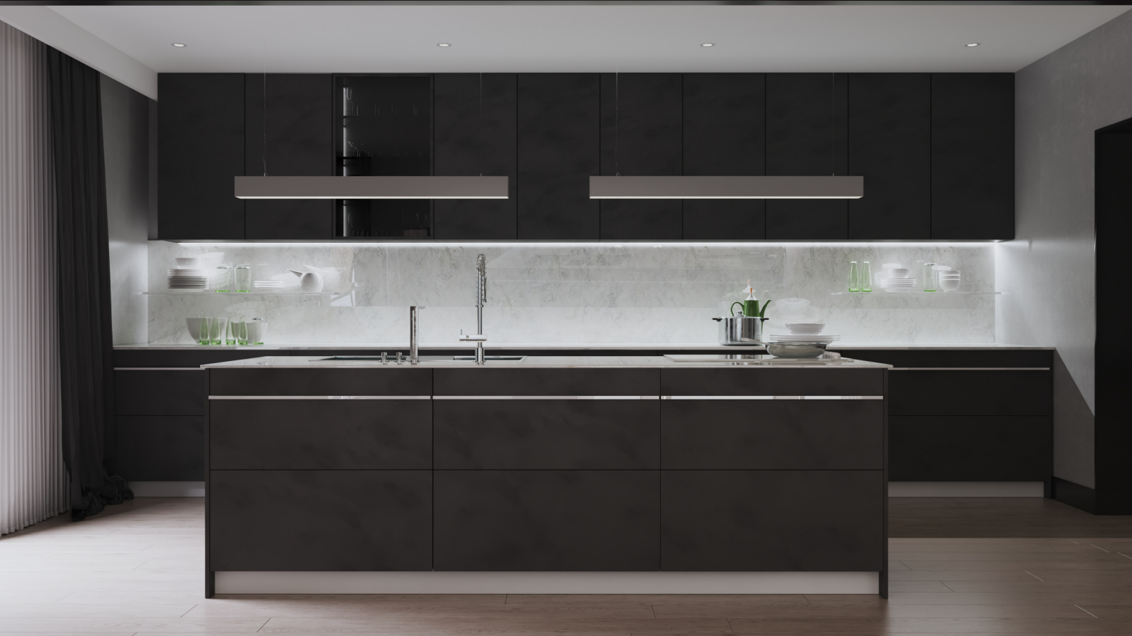
scene 05 cam 05

Have you ever wanted to make professional interior renderings? Do you know how to use V-RaySun, V-RaySky and V-RayPhysicalCamera? Have you ever had problems with composition? Archinteriors will end all your problems. Take a look at this 5 fully textured scenes with professional shaders and lighting ready to render. Get your own portfolio and join cg market.