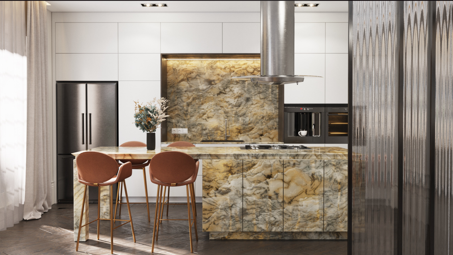
scene 02 cam 03

Have you ever wanted to make professional interior renderings? Do you know how to use V-RaySun, V-RaySky and V-RayPhysicalCamera? Have you ever had problems with composition? Archinteriors will end all your problems. Take a look at this 5 fully textured scenes with professional shaders and lighting ready to render. Get your own portfolio and join cg market.