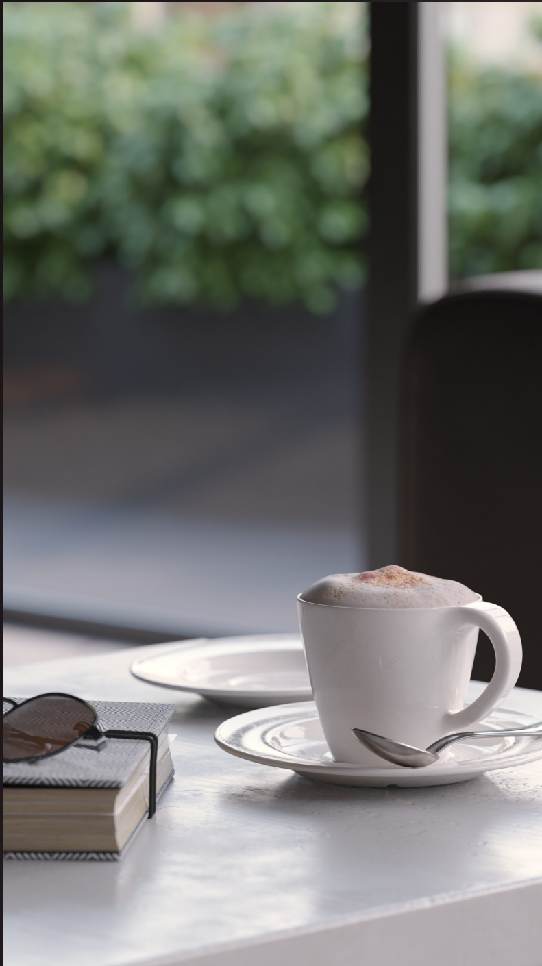
scene 04 cam 03

Have you ever wanted to make professional interior renderings? Do you know how to use V-RaySun, V-RaySky and V-RayPhysicalCamera? Have you ever had problems with composition? Archinteriors will end all your problems. Take a look at this 5 fully textured scenes with professional shaders and lighting ready to render. Get your own portfolio and join cg market.