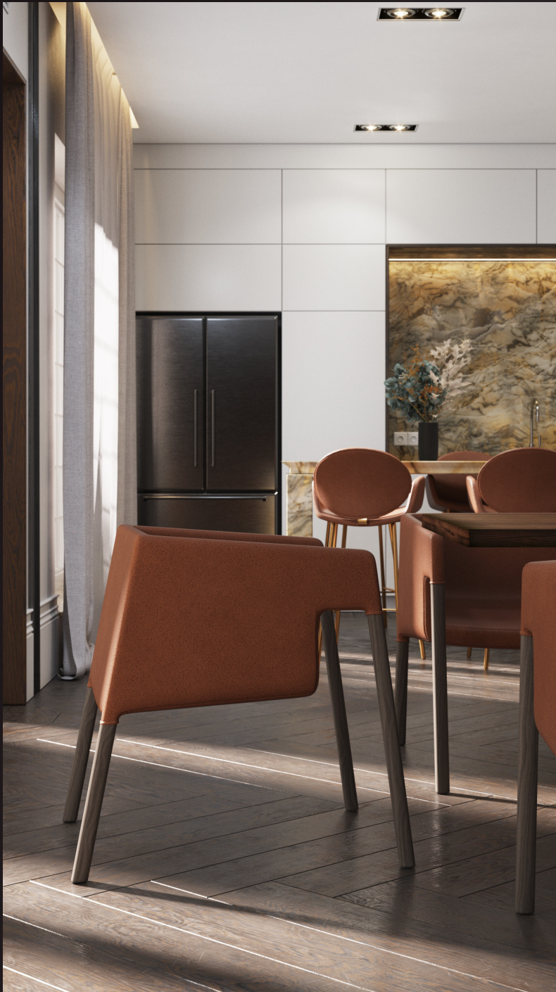
scene 02 cam 07

Have you ever wanted to make professional interior renderings? Do you know how to use V-RaySun, V-RaySky and V-RayPhysicalCamera? Have you ever had problems with composition? Archinteriors will end all your problems. Take a look at this 5 fully textured scenes with professional shaders and lighting ready to render. Get your own portfolio and join cg market.