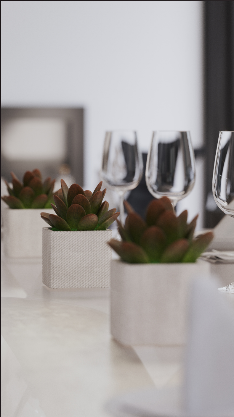
scene 05 cam 07

Have you ever wanted to make professional interior renderings? Do you know how to use V-RaySun, V-RaySky and V-RayPhysicalCamera? Have you ever had problems with composition? Archinteriors will end all your problems. Take a look at this 5 fully textured scenes with professional shaders and lighting ready to render. Get your own portfolio and join cg market.