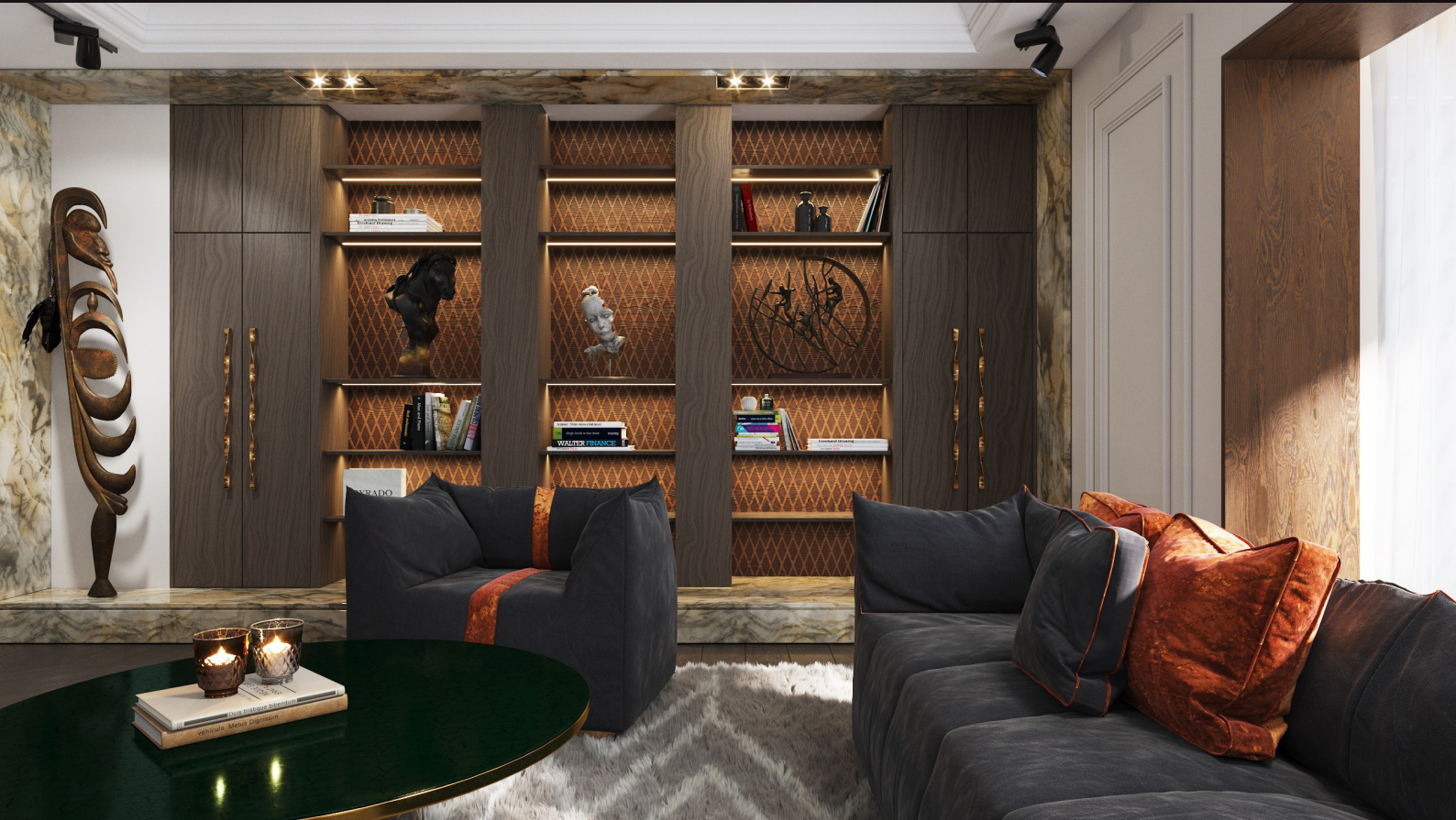
scene 02 cam 04

Have you ever wanted to make professional interior renderings? Do you know how to use V-RaySun, V-RaySky and V-RayPhysicalCamera? Have you ever had problems with composition? Archinteriors will end all your problems. Take a look at this 5 fully textured scenes with professional shaders and lighting ready to render. Get your own portfolio and join cg market.