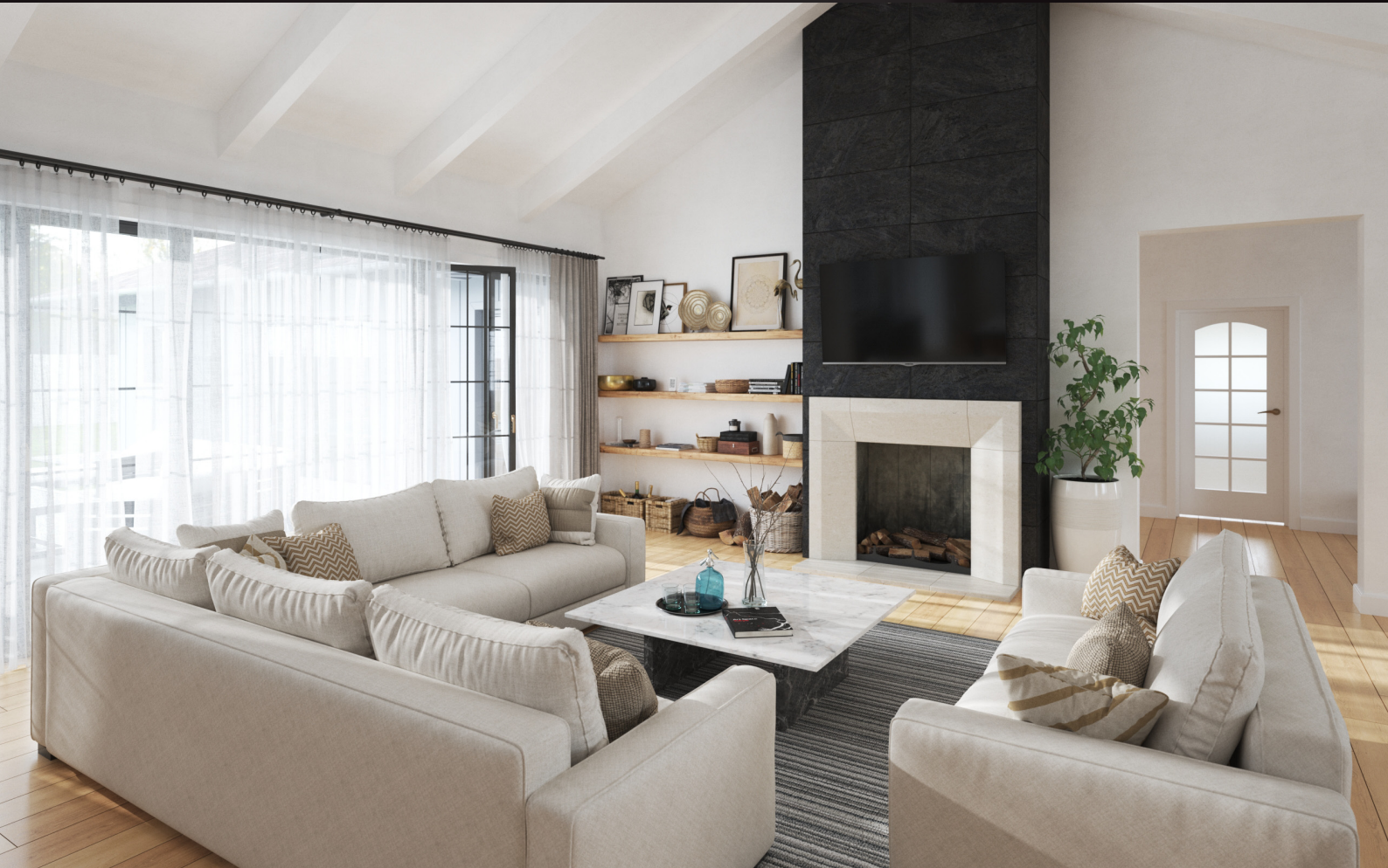
scene 03 cam 02

Have you ever wanted to make professional interior renderings? Do you know how to use V-RaySun, V-RaySky and V-RayPhysicalCamera? Have you ever had problems with composition? Archinteriors will end all your problems. Take a look at this 5 fully textured scenes with professional shaders and lighting ready to render. Get your own portfolio and join cg market.