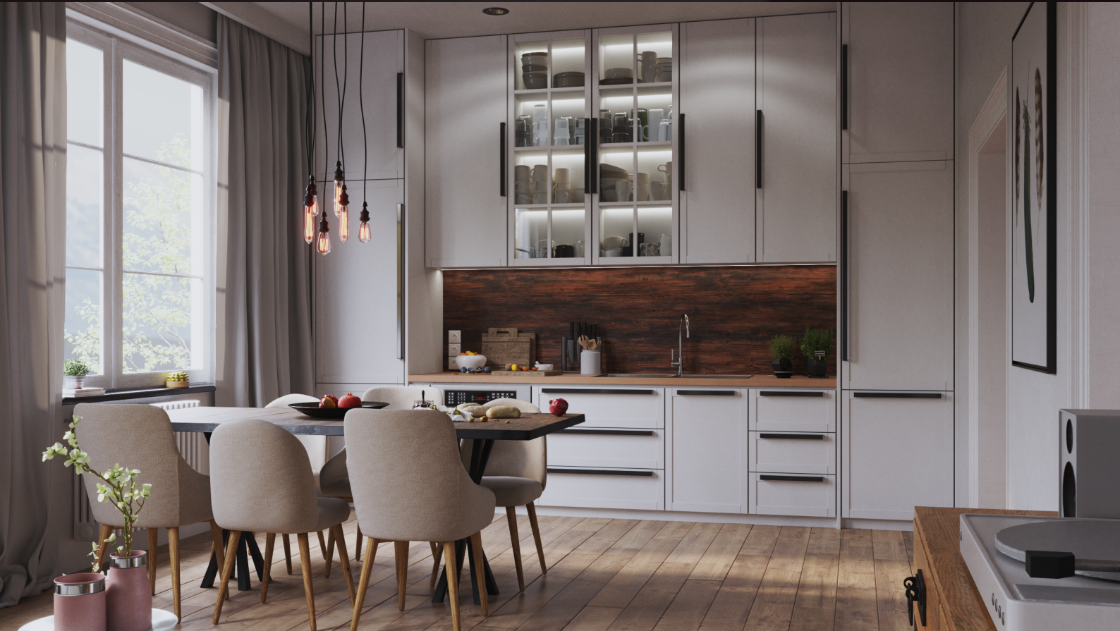
scene 01 cam 02

Have you ever wanted to make professional interior renderings? Do you know how to use V-RaySun, V-RaySky and V-RayPhysicalCamera? Have you ever had problems with composition? Archinteriors will end all your problems. Take a look at this 5 fully textured scenes with professional shaders and lighting ready to render. Get your own portfolio and join cg market.