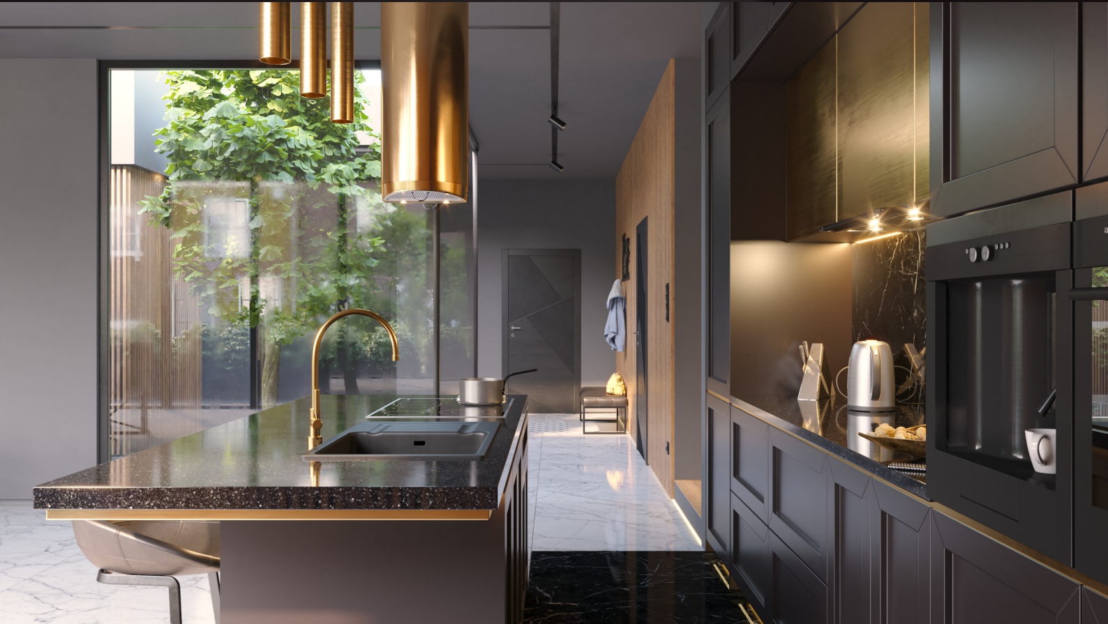
scene 04 cam 01

Have you ever wanted to make professional interior renderings? Do you know how to use V-RaySun, V-RaySky and V-RayPhysicalCamera? Have you ever had problems with composition? Archinteriors will end all your problems. Take a look at this 5 fully textured scenes with professional shaders and lighting ready to render. Get your own portfolio and join cg market.