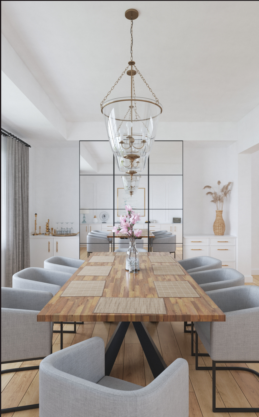
scene 03 cam 05

Have you ever wanted to make professional interior renderings? Do you know how to use V-RaySun, V-RaySky and V-RayPhysicalCamera? Have you ever had problems with composition? Archinteriors will end all your problems. Take a look at this 5 fully textured scenes with professional shaders and lighting ready to render. Get your own portfolio and join cg market.