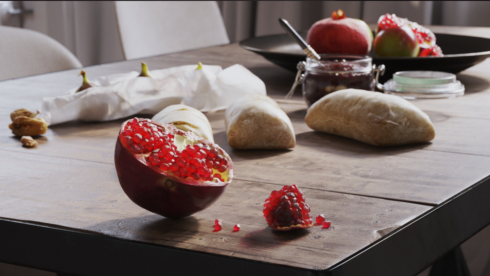
scene 01 cam 04

Have you ever wanted to make professional interior renderings? Do you know how to use V-RaySun, V-RaySky and V-RayPhysicalCamera? Have you ever had problems with composition? Archinteriors will end all your problems. Take a look at this 5 fully textured scenes with professional shaders and lighting ready to render. Get your own portfolio and join cg market.