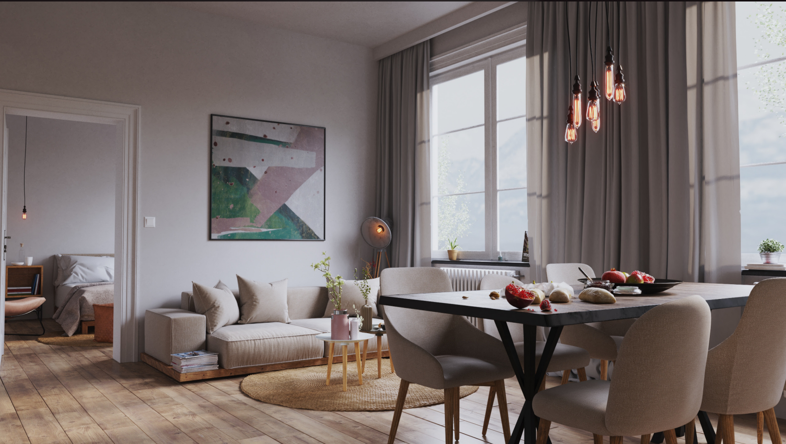
scene 01 cam 01

Have you ever wanted to make professional interior renderings? Do you know how to use V-RaySun, V-RaySky and V-RayPhysicalCamera? Have you ever had problems with composition? Archinteriors will end all your problems. Take a look at this 5 fully textured scenes with professional shaders and lighting ready to render. Get your own portfolio and join cg market.