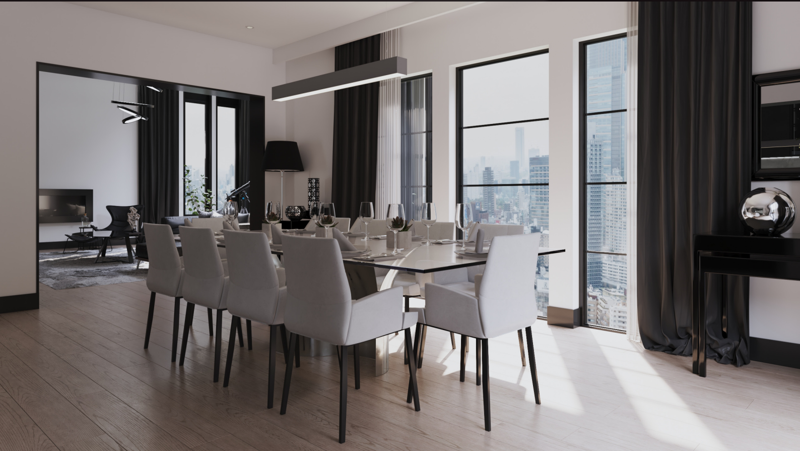
scene 05 cam 02

Have you ever wanted to make professional interior renderings? Do you know how to use V-RaySun, V-RaySky and V-RayPhysicalCamera? Have you ever had problems with composition? Archinteriors will end all your problems. Take a look at this 5 fully textured scenes with professional shaders and lighting ready to render. Get your own portfolio and join cg market.