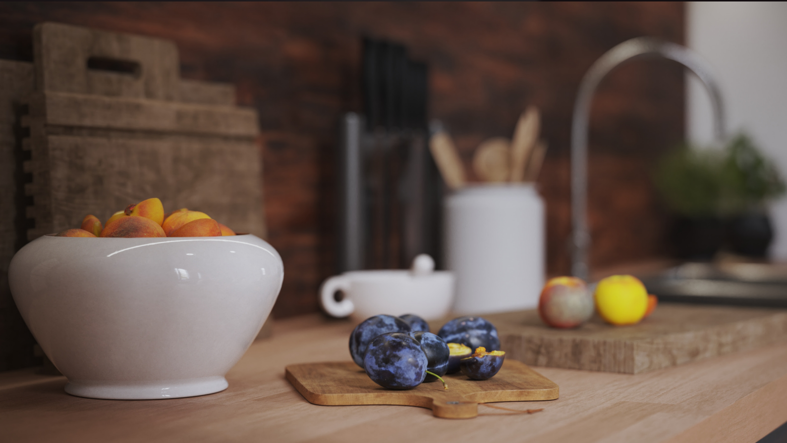
scene 01 cam 03

Have you ever wanted to make professional interior renderings? Do you know how to use V-RaySun, V-RaySky and V-RayPhysicalCamera? Have you ever had problems with composition? Archinteriors will end all your problems. Take a look at this 5 fully textured scenes with professional shaders and lighting ready to render. Get your own portfolio and join cg market.