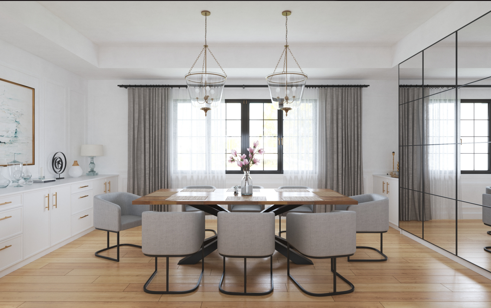
scene 03 cam 03

Have you ever wanted to make professional interior renderings? Do you know how to use V-RaySun, V-RaySky and V-RayPhysicalCamera? Have you ever had problems with composition? Archinteriors will end all your problems. Take a look at this 5 fully textured scenes with professional shaders and lighting ready to render. Get your own portfolio and join cg market.