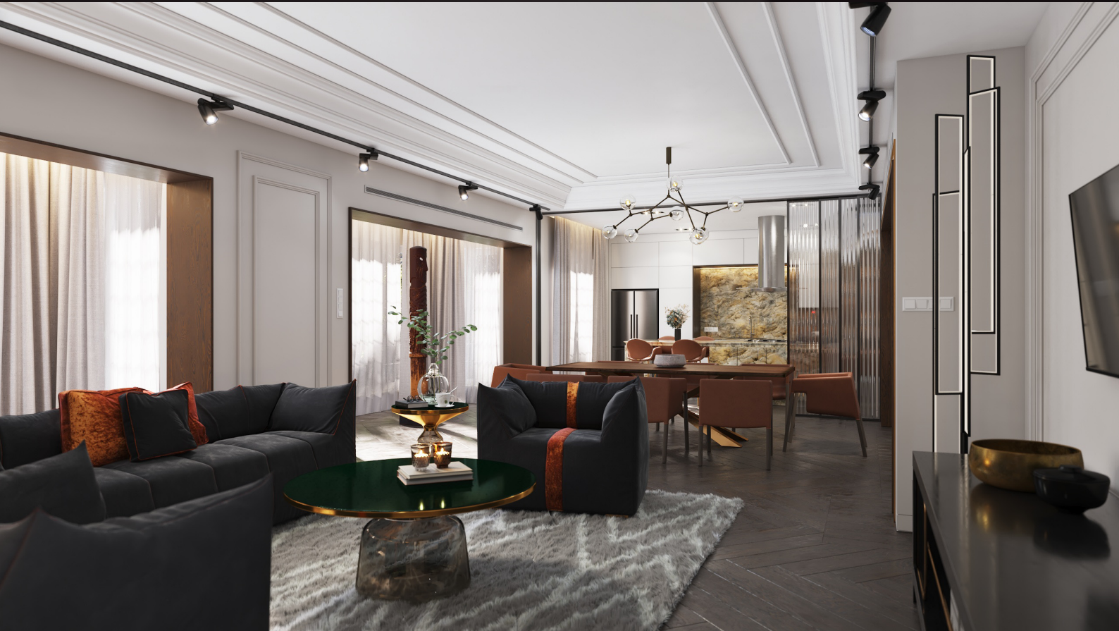
scene 02 cam 02

Have you ever wanted to make professional interior renderings? Do you know how to use V-RaySun, V-RaySky and V-RayPhysicalCamera? Have you ever had problems with composition? Archinteriors will end all your problems. Take a look at this 5 fully textured scenes with professional shaders and lighting ready to render. Get your own portfolio and join cg market.