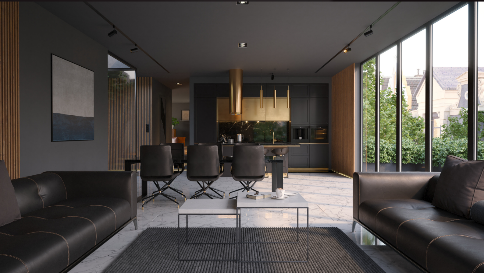
scene 04 cam 02

Have you ever wanted to make professional interior renderings? Do you know how to use V-RaySun, V-RaySky and V-RayPhysicalCamera? Have you ever had problems with composition? Archinteriors will end all your problems. Take a look at this 5 fully textured scenes with professional shaders and lighting ready to render. Get your own portfolio and join cg market.