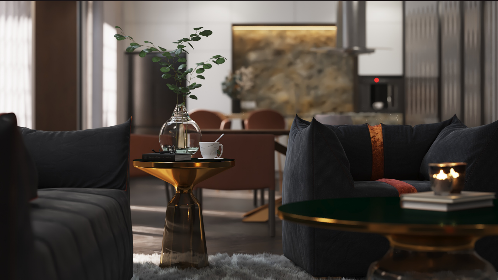
scene 02 cam 05

Have you ever wanted to make professional interior renderings? Do you know how to use V-RaySun, V-RaySky and V-RayPhysicalCamera? Have you ever had problems with composition? Archinteriors will end all your problems. Take a look at this 5 fully textured scenes with professional shaders and lighting ready to render. Get your own portfolio and join cg market.