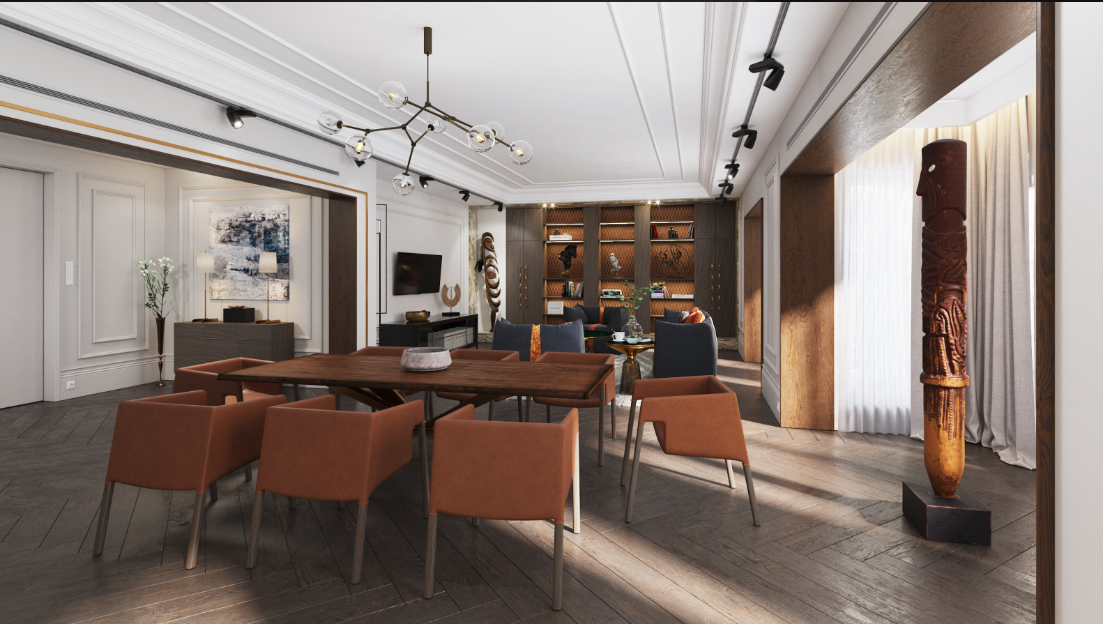
scene 02 cam 01

Have you ever wanted to make professional interior renderings? Do you know how to use V-RaySun, V-RaySky and V-RayPhysicalCamera? Have you ever had problems with composition? Archinteriors will end all your problems. Take a look at this 5 fully textured scenes with professional shaders and lighting ready to render. Get your own portfolio and join cg market.