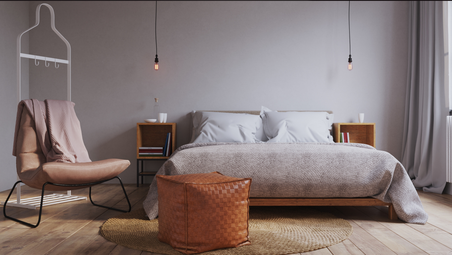
scene 01 cam 06

Have you ever wanted to make professional interior renderings? Do you know how to use V-RaySun, V-RaySky and V-RayPhysicalCamera? Have you ever had problems with composition? Archinteriors will end all your problems. Take a look at this 5 fully textured scenes with professional shaders and lighting ready to render. Get your own portfolio and join cg market.