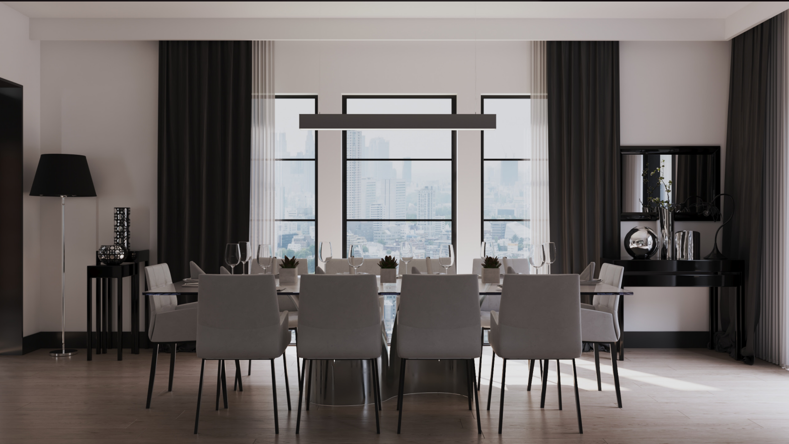
scene 05 cam 04

Have you ever wanted to make professional interior renderings? Do you know how to use V-RaySun, V-RaySky and V-RayPhysicalCamera? Have you ever had problems with composition? Archinteriors will end all your problems. Take a look at this 5 fully textured scenes with professional shaders and lighting ready to render. Get your own portfolio and join cg market.