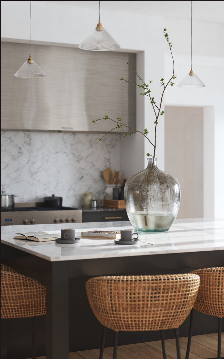
scene 03 cam 04

Have you ever wanted to make professional interior renderings? Do you know how to use V-RaySun, V-RaySky and V-RayPhysicalCamera? Have you ever had problems with composition? Archinteriors will end all your problems. Take a look at this 5 fully textured scenes with professional shaders and lighting ready to render. Get your own portfolio and join cg market.