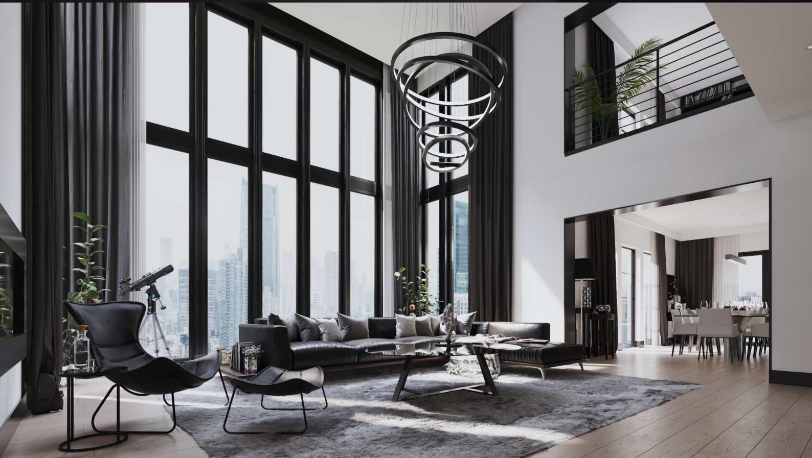
scene 05 cam 01

Have you ever wanted to make professional interior renderings? Do you know how to use V-RaySun, V-RaySky and V-RayPhysicalCamera? Have you ever had problems with composition? Archinteriors will end all your problems. Take a look at this 5 fully textured scenes with professional shaders and lighting ready to render. Get your own portfolio and join cg market.