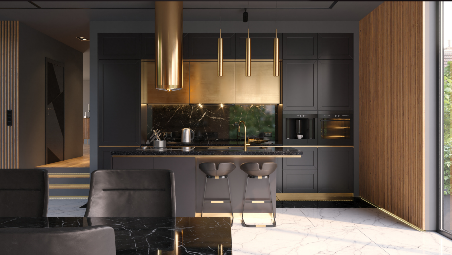
scene 04 cam 06

Have you ever wanted to make professional interior renderings? Do you know how to use V-RaySun, V-RaySky and V-RayPhysicalCamera? Have you ever had problems with composition? Archinteriors will end all your problems. Take a look at this 5 fully textured scenes with professional shaders and lighting ready to render. Get your own portfolio and join cg market.