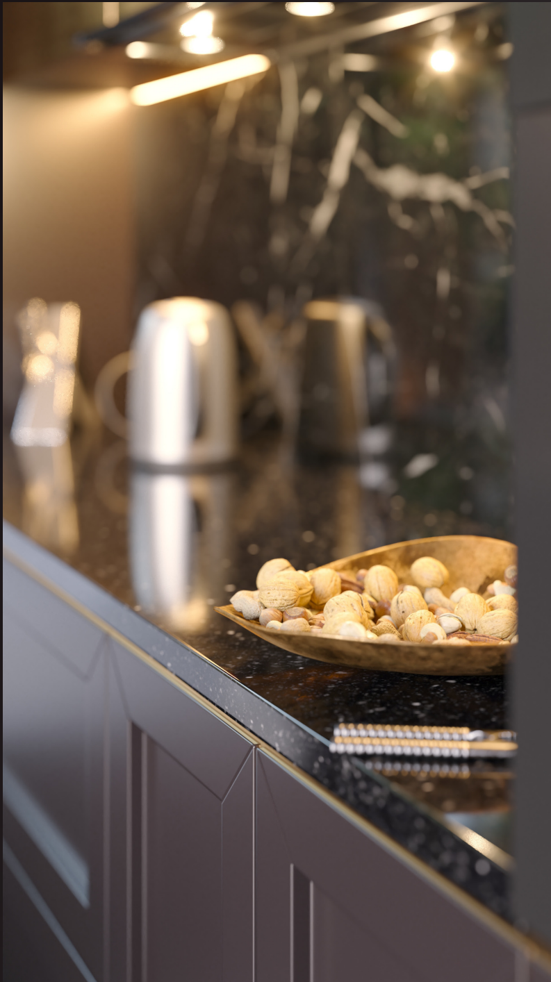
scene 04 cam 04

Have you ever wanted to make professional interior renderings? Do you know how to use V-RaySun, V-RaySky and V-RayPhysicalCamera? Have you ever had problems with composition? Archinteriors will end all your problems. Take a look at this 5 fully textured scenes with professional shaders and lighting ready to render. Get your own portfolio and join cg market.