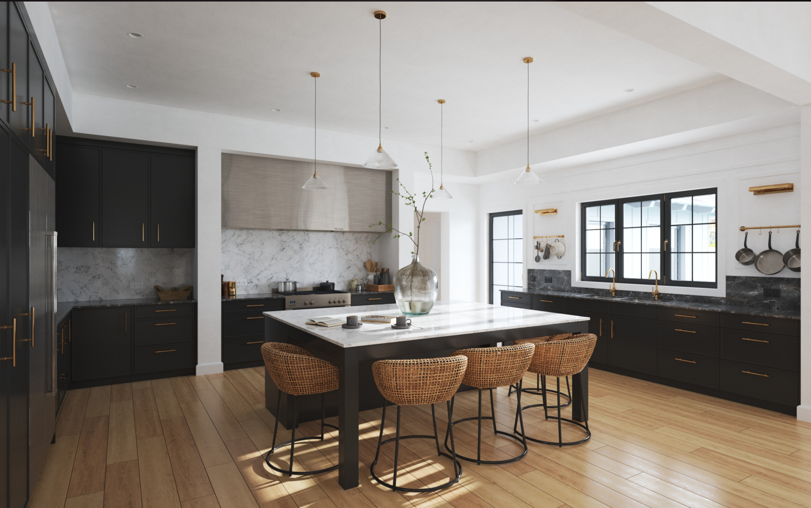
scene 03 cam 01

Have you ever wanted to make professional interior renderings? Do you know how to use V-RaySun, V-RaySky and V-RayPhysicalCamera? Have you ever had problems with composition? Archinteriors will end all your problems. Take a look at this 5 fully textured scenes with professional shaders and lighting ready to render. Get your own portfolio and join cg market.