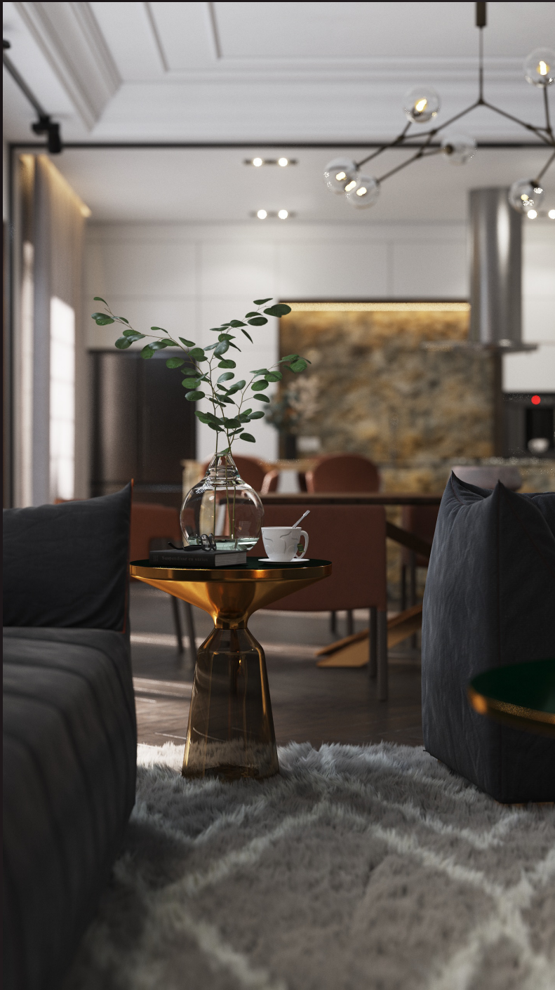
scene 02 cam 06

Have you ever wanted to make professional interior renderings? Do you know how to use V-RaySun, V-RaySky and V-RayPhysicalCamera? Have you ever had problems with composition? Archinteriors will end all your problems. Take a look at this 5 fully textured scenes with professional shaders and lighting ready to render. Get your own portfolio and join cg market.