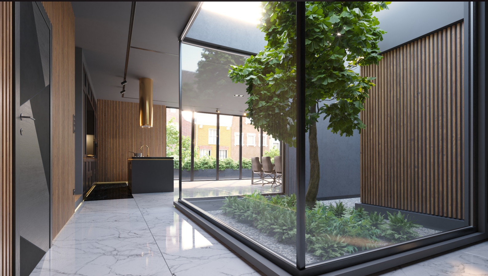
scene 04 cam 05

Have you ever wanted to make professional interior renderings? Do you know how to use V-RaySun, V-RaySky and V-RayPhysicalCamera? Have you ever had problems with composition? Archinteriors will end all your problems. Take a look at this 5 fully textured scenes with professional shaders and lighting ready to render. Get your own portfolio and join cg market.