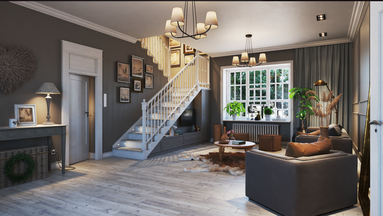
scene 05 cam 01

Have you ever wanted to make professional interior renderings? Do you know how to use V-RaySun, V-RaySky and V-RayPhysicalCamera? Have you ever had problems with composition? Archinteriors will end all your problems. Take a look at this 10 fully textured scenes with professional shaders and lighting ready to render. Get your own portfolio and join cg market.