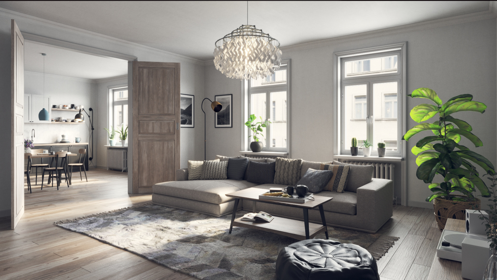
scene 03 cam 01

Have you ever wanted to make professional interior renderings? Do you know how to use V-RaySun, V-RaySky and V-RayPhysicalCamera? Have you ever had problems with composition? Archinteriors will end all your problems. Take a look at this 10 fully textured scenes with professional shaders and lighting ready to render. Get your own portfolio and join cg market.