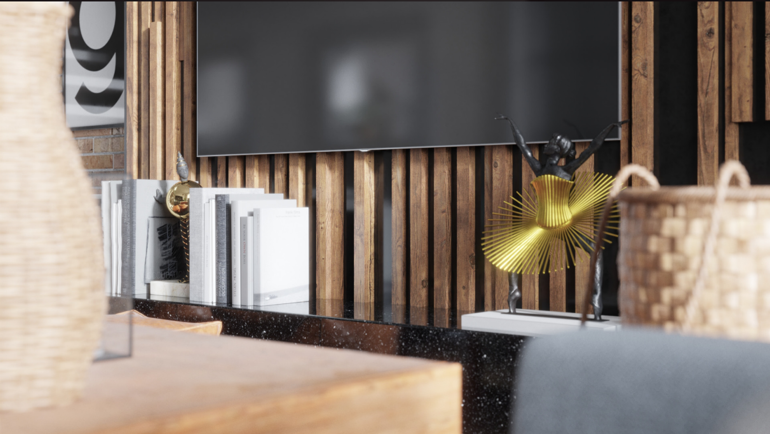
scene 08 cam 04

Have you ever wanted to make professional interior renderings? Do you know how to use V-RaySun, V-RaySky and V-RayPhysicalCamera? Have you ever had problems with composition? Archinteriors will end all your problems. Take a look at this 10 fully textured scenes with professional shaders and lighting ready to render. Get your own portfolio and join cg market.