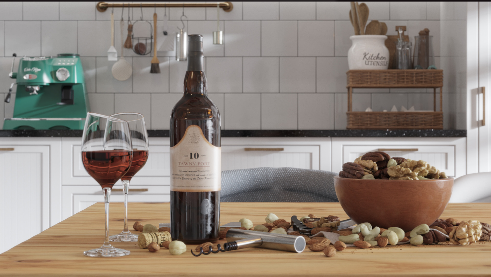
scene 08 cam 03

Have you ever wanted to make professional interior renderings? Do you know how to use V-RaySun, V-RaySky and V-RayPhysicalCamera? Have you ever had problems with composition? Archinteriors will end all your problems. Take a look at this 10 fully textured scenes with professional shaders and lighting ready to render. Get your own portfolio and join cg market.