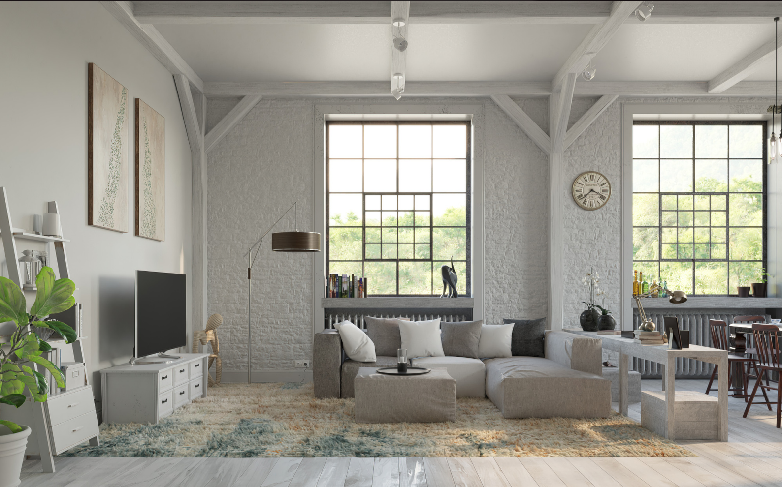
scene 02 cam 02

Have you ever wanted to make professional interior renderings? Do you know how to use V-RaySun, V-RaySky and V-RayPhysicalCamera? Have you ever had problems with composition? Archinteriors will end all your problems. Take a look at this 10 fully textured scenes with professional shaders and lighting ready to render. Get your own portfolio and join cg market.