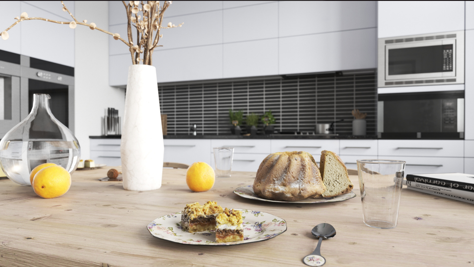
scene 10 cam 03

Have you ever wanted to make professional interior renderings? Do you know how to use V-RaySun, V-RaySky and V-RayPhysicalCamera? Have you ever had problems with composition? Archinteriors will end all your problems. Take a look at this 10 fully textured scenes with professional shaders and lighting ready to render. Get your own portfolio and join cg market.