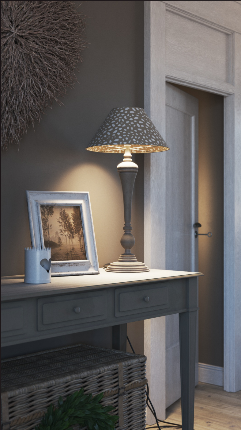
scene 05 cam 03

Have you ever wanted to make professional interior renderings? Do you know how to use V-RaySun, V-RaySky and V-RayPhysicalCamera? Have you ever had problems with composition? Archinteriors will end all your problems. Take a look at this 10 fully textured scenes with professional shaders and lighting ready to render. Get your own portfolio and join cg market.