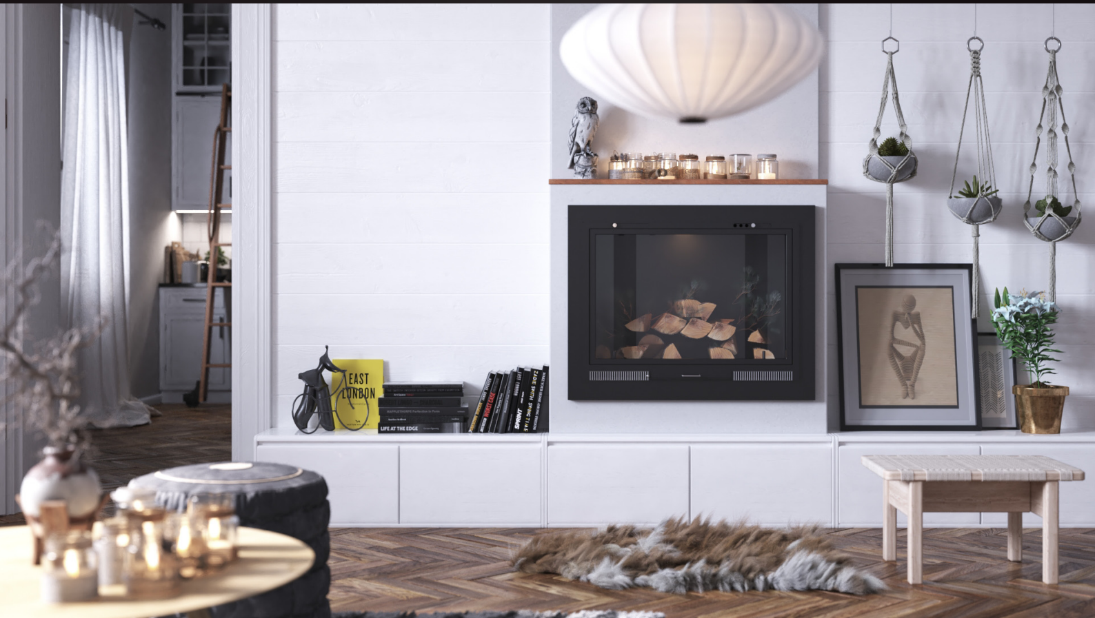
scene 04 cam 02

Have you ever wanted to make professional interior renderings? Do you know how to use V-RaySun, V-RaySky and V-RayPhysicalCamera? Have you ever had problems with composition? Archinteriors will end all your problems. Take a look at this 10 fully textured scenes with professional shaders and lighting ready to render. Get your own portfolio and join cg market.