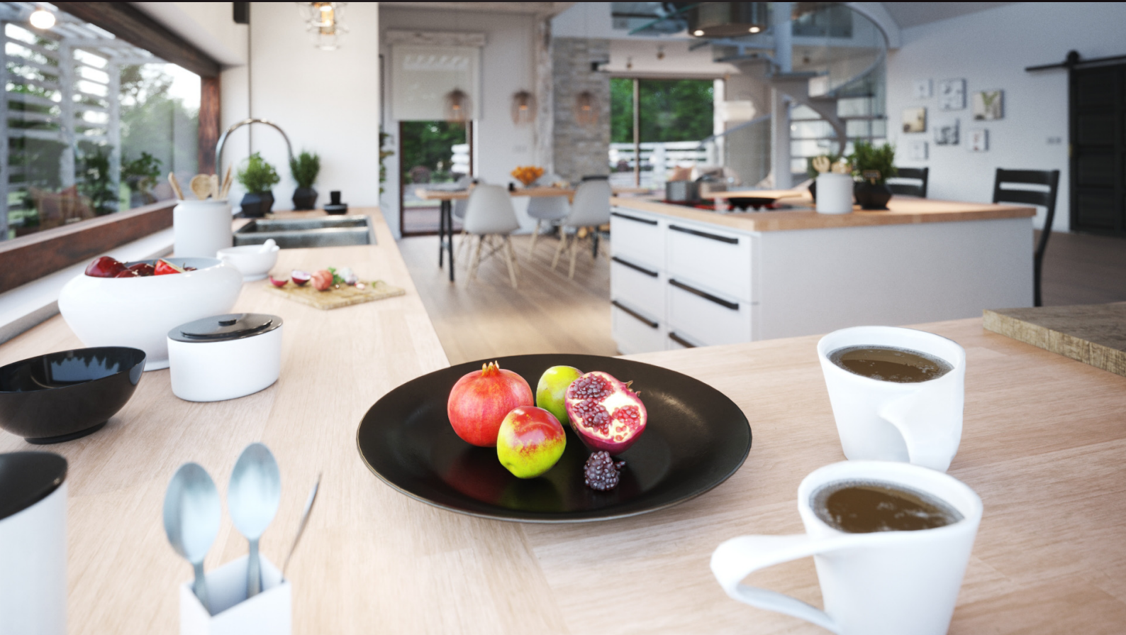
scene 07 cam 04

Have you ever wanted to make professional interior renderings? Do you know how to use V-RaySun, V-RaySky and V-RayPhysicalCamera? Have you ever had problems with composition? Archinteriors will end all your problems. Take a look at this 10 fully textured scenes with professional shaders and lighting ready to render. Get your own portfolio and join cg market.