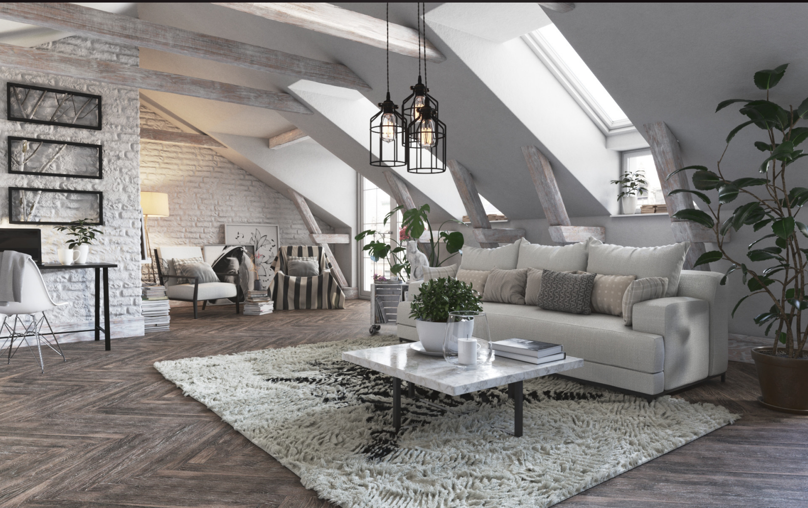
scene 06 cam 01

Have you ever wanted to make professional interior renderings? Do you know how to use V-RaySun, V-RaySky and V-RayPhysicalCamera? Have you ever had problems with composition? Archinteriors will end all your problems. Take a look at this 10 fully textured scenes with professional shaders and lighting ready to render. Get your own portfolio and join cg market.