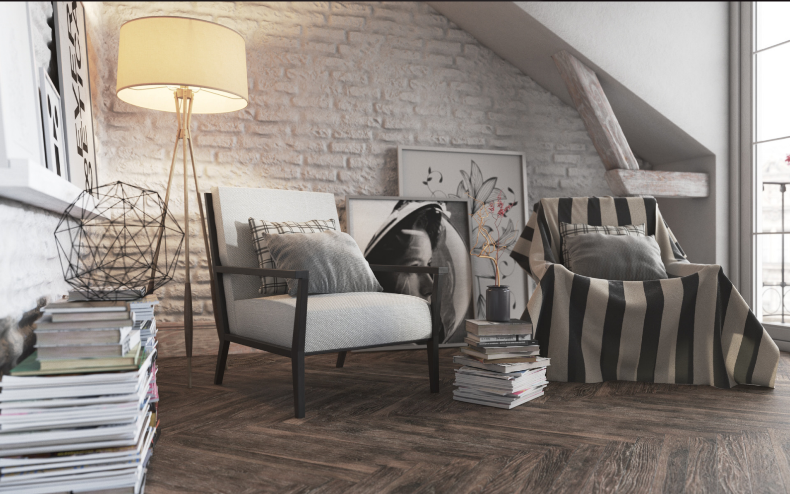
scene 06 cam 04

Have you ever wanted to make professional interior renderings? Do you know how to use V-RaySun, V-RaySky and V-RayPhysicalCamera? Have you ever had problems with composition? Archinteriors will end all your problems. Take a look at this 10 fully textured scenes with professional shaders and lighting ready to render. Get your own portfolio and join cg market.