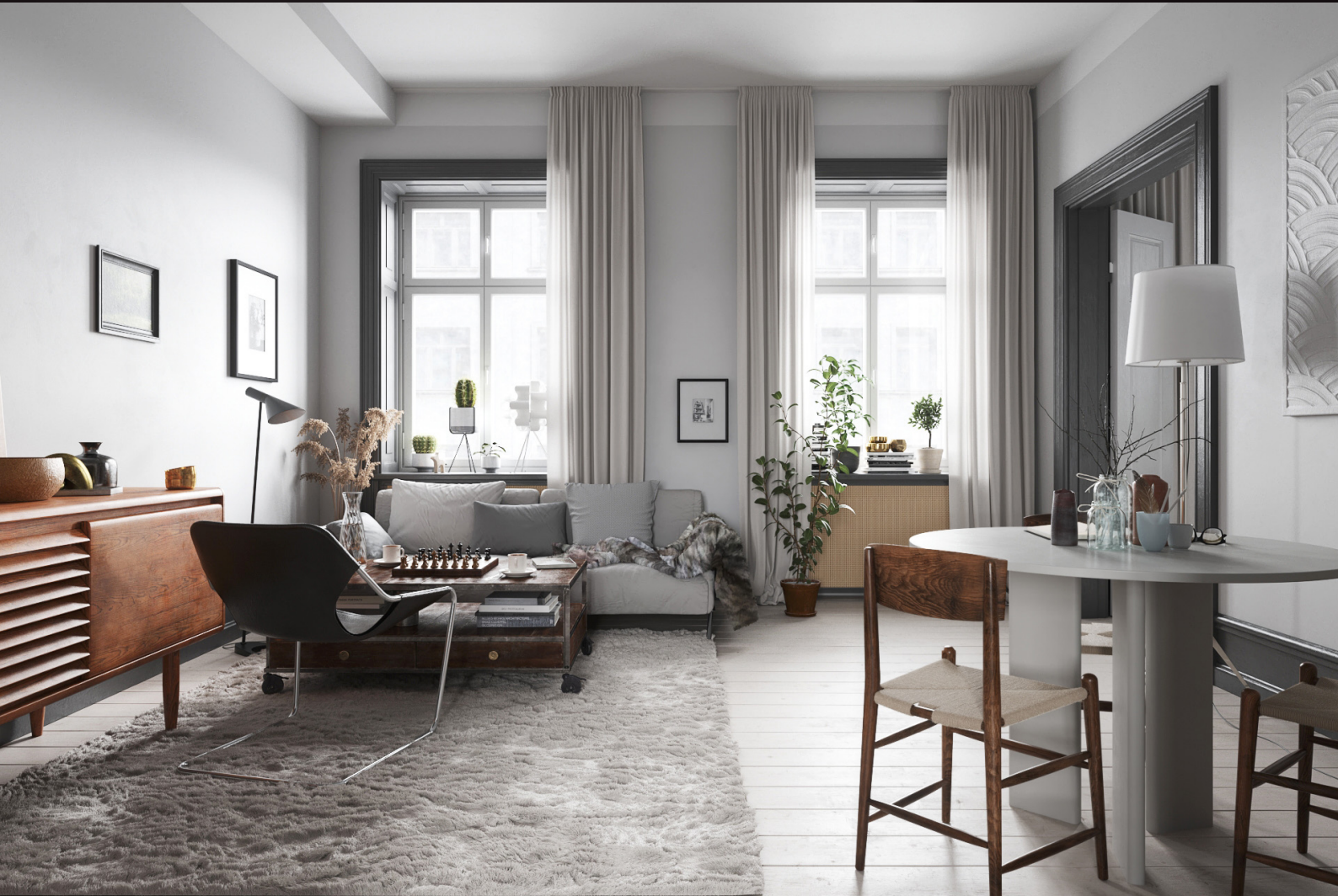
scene 01 cam 01

Have you ever wanted to make professional interior renderings? Do you know how to use V-RaySun, V-RaySky and V-RayPhysicalCamera? Have you ever had problems with composition? Archinteriors will end all your problems. Take a look at this 10 fully textured scenes with professional shaders and lighting ready to render. Get your own portfolio and join cg market.