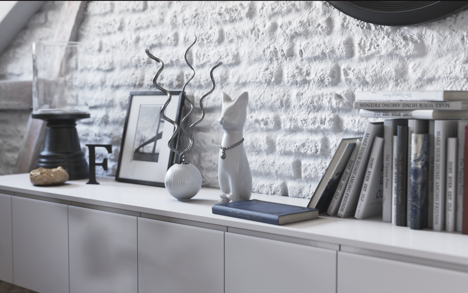
scene 06 cam 03

Have you ever wanted to make professional interior renderings? Do you know how to use V-RaySun, V-RaySky and V-RayPhysicalCamera? Have you ever had problems with composition? Archinteriors will end all your problems. Take a look at this 10 fully textured scenes with professional shaders and lighting ready to render. Get your own portfolio and join cg market.