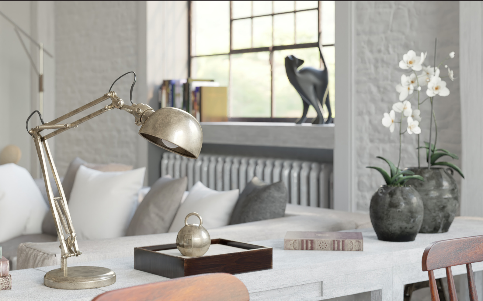
scene 02 cam 03

Have you ever wanted to make professional interior renderings? Do you know how to use V-RaySun, V-RaySky and V-RayPhysicalCamera? Have you ever had problems with composition? Archinteriors will end all your problems. Take a look at this 10 fully textured scenes with professional shaders and lighting ready to render. Get your own portfolio and join cg market.