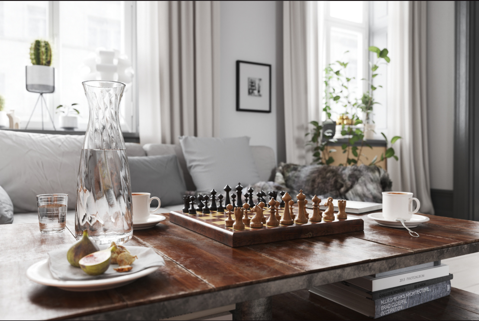
scene 01 cam 03

Have you ever wanted to make professional interior renderings? Do you know how to use V-RaySun, V-RaySky and V-RayPhysicalCamera? Have you ever had problems with composition? Archinteriors will end all your problems. Take a look at this 10 fully textured scenes with professional shaders and lighting ready to render. Get your own portfolio and join cg market.