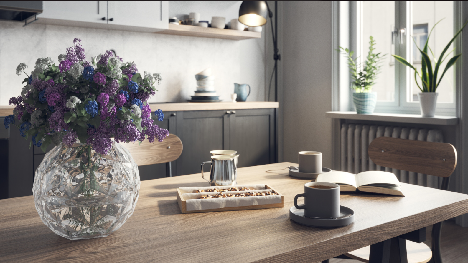
scene 03 cam 03

Have you ever wanted to make professional interior renderings? Do you know how to use V-RaySun, V-RaySky and V-RayPhysicalCamera? Have you ever had problems with composition? Archinteriors will end all your problems. Take a look at this 10 fully textured scenes with professional shaders and lighting ready to render. Get your own portfolio and join cg market.