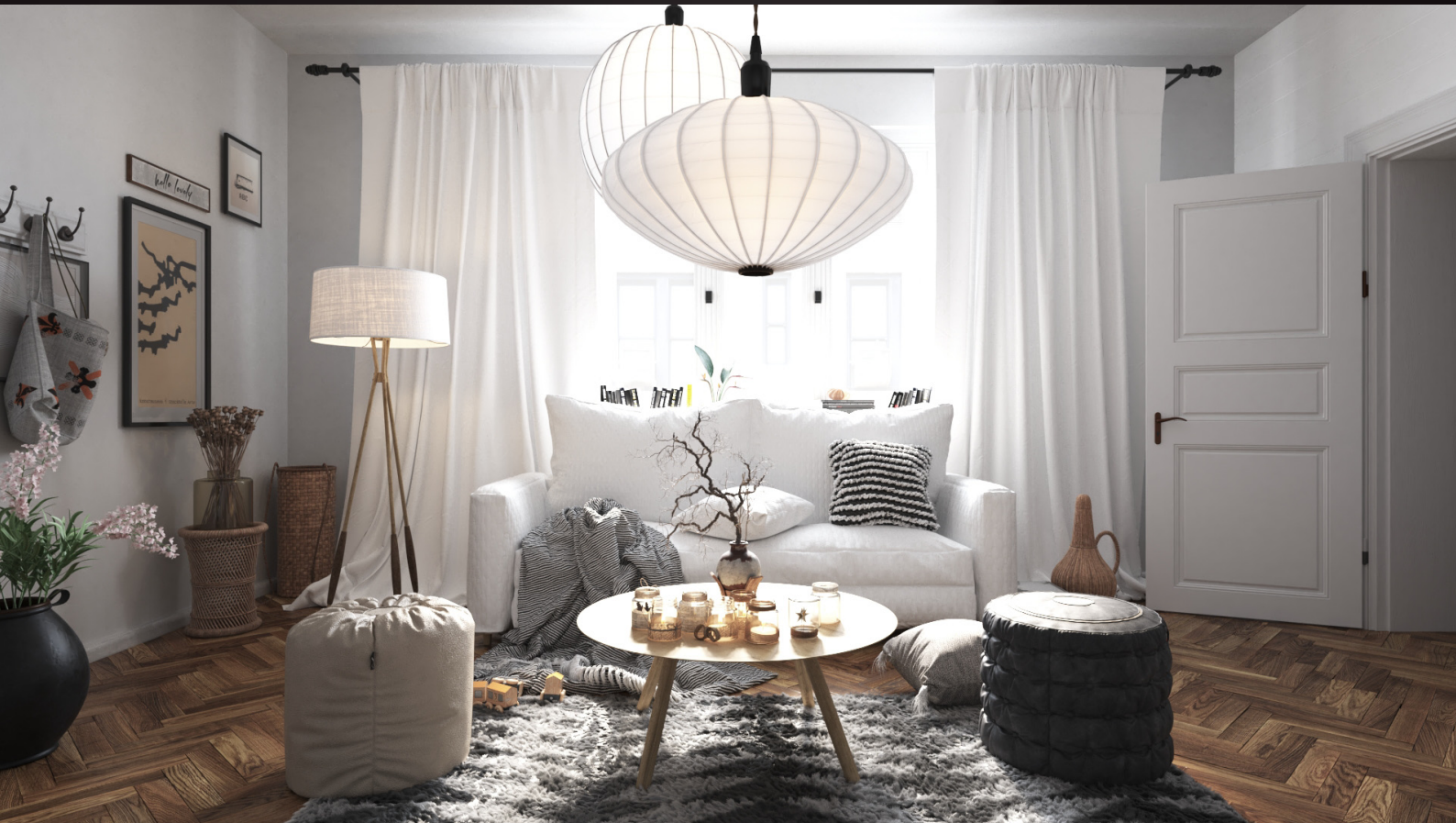
scene 04 cam 01

Have you ever wanted to make professional interior renderings? Do you know how to use V-RaySun, V-RaySky and V-RayPhysicalCamera? Have you ever had problems with composition? Archinteriors will end all your problems. Take a look at this 10 fully textured scenes with professional shaders and lighting ready to render. Get your own portfolio and join cg market.