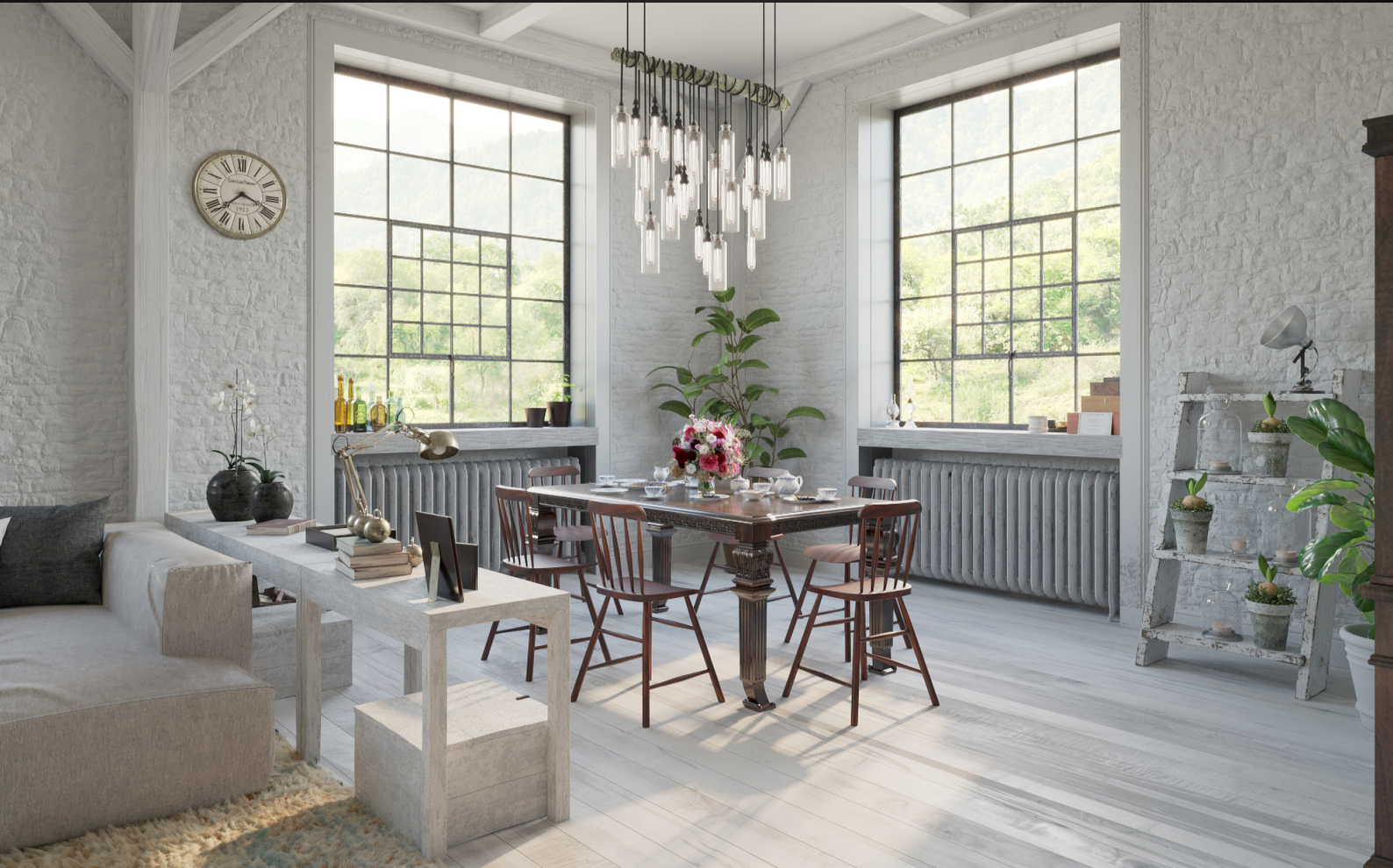
scene 02 cam 01

Have you ever wanted to make professional interior renderings? Do you know how to use V-RaySun, V-RaySky and V-RayPhysicalCamera? Have you ever had problems with composition? Archinteriors will end all your problems. Take a look at this 10 fully textured scenes with professional shaders and lighting ready to render. Get your own portfolio and join cg market.