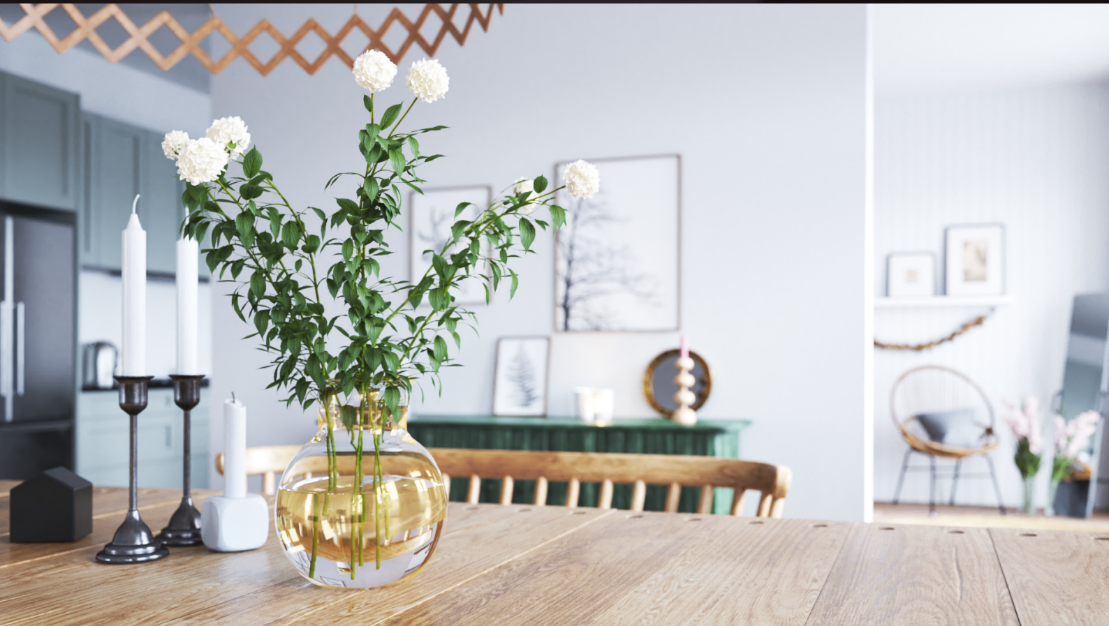
scene 09 cam 03

Have you ever wanted to make professional interior renderings? Do you know how to use V-RaySun, V-RaySky and V-RayPhysicalCamera? Have you ever had problems with composition? Archinteriors will end all your problems. Take a look at this 10 fully textured scenes with professional shaders and lighting ready to render. Get your own portfolio and join cg market.