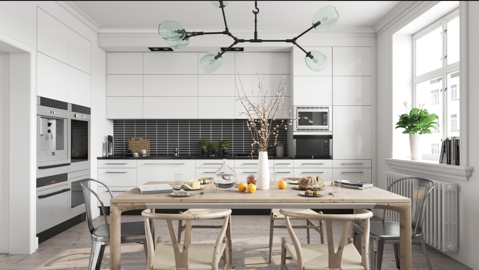
scene 10 cam 01

Have you ever wanted to make professional interior renderings? Do you know how to use V-RaySun, V-RaySky and V-RayPhysicalCamera? Have you ever had problems with composition? Archinteriors will end all your problems. Take a look at this 10 fully textured scenes with professional shaders and lighting ready to render. Get your own portfolio and join cg market.