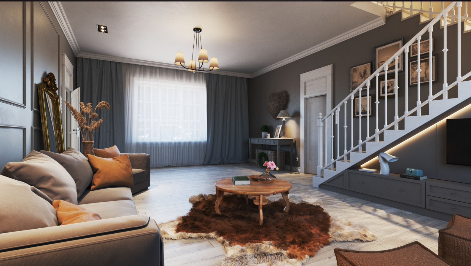
scene 05 cam 02

Have you ever wanted to make professional interior renderings? Do you know how to use V-RaySun, V-RaySky and V-RayPhysicalCamera? Have you ever had problems with composition? Archinteriors will end all your problems. Take a look at this 10 fully textured scenes with professional shaders and lighting ready to render. Get your own portfolio and join cg market.