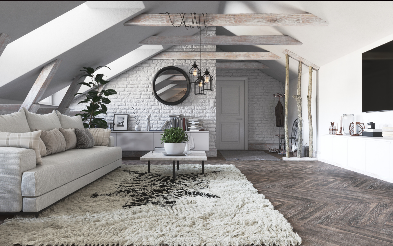
scene 06 cam 02

Have you ever wanted to make professional interior renderings? Do you know how to use V-RaySun, V-RaySky and V-RayPhysicalCamera? Have you ever had problems with composition? Archinteriors will end all your problems. Take a look at this 10 fully textured scenes with professional shaders and lighting ready to render. Get your own portfolio and join cg market.