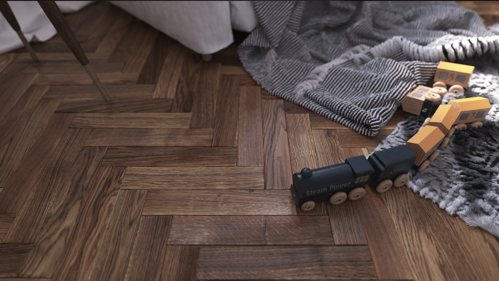
scene 04 cam 04

Have you ever wanted to make professional interior renderings? Do you know how to use V-RaySun, V-RaySky and V-RayPhysicalCamera? Have you ever had problems with composition? Archinteriors will end all your problems. Take a look at this 10 fully textured scenes with professional shaders and lighting ready to render. Get your own portfolio and join cg market.