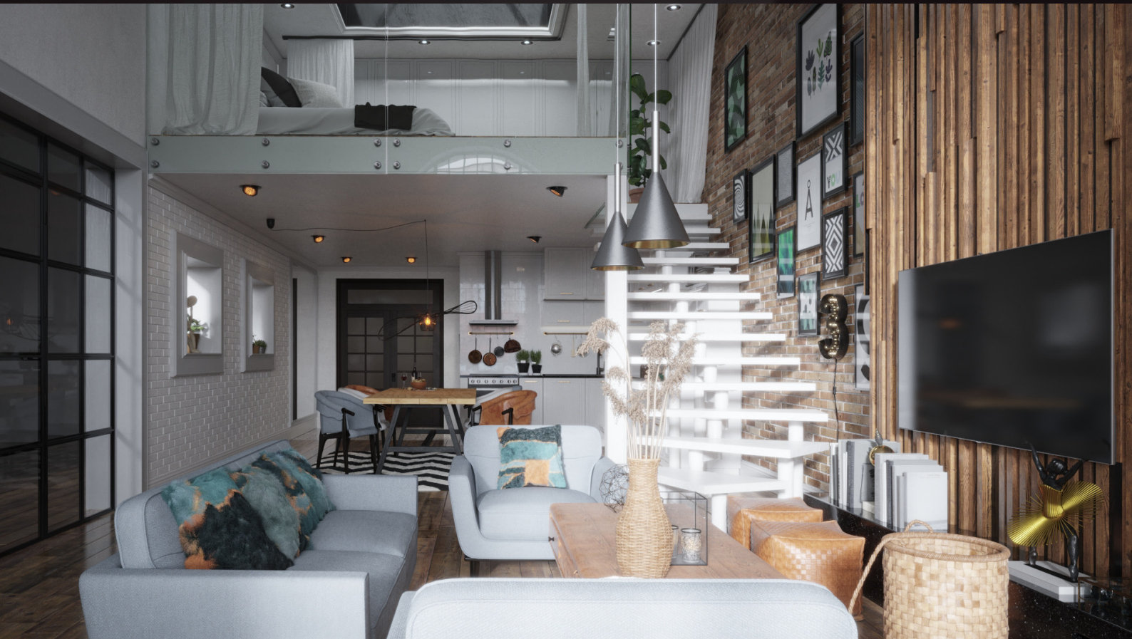
scene 08 cam 01

Have you ever wanted to make professional interior renderings? Do you know how to use V-RaySun, V-RaySky and V-RayPhysicalCamera? Have you ever had problems with composition? Archinteriors will end all your problems. Take a look at this 10 fully textured scenes with professional shaders and lighting ready to render. Get your own portfolio and join cg market.