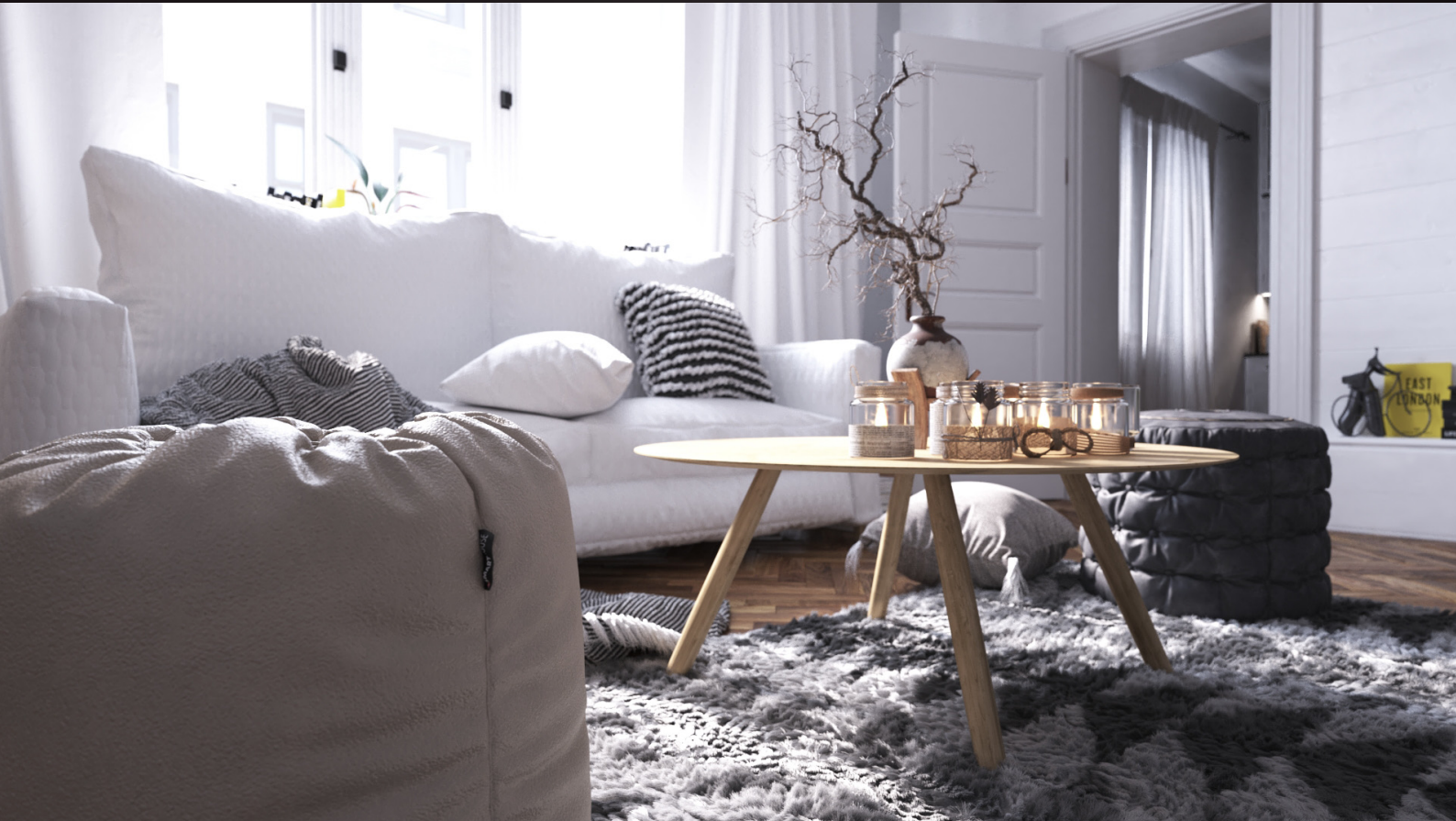
scene 04 cam 03

Have you ever wanted to make professional interior renderings? Do you know how to use V-RaySun, V-RaySky and V-RayPhysicalCamera? Have you ever had problems with composition? Archinteriors will end all your problems. Take a look at this 10 fully textured scenes with professional shaders and lighting ready to render. Get your own portfolio and join cg market.