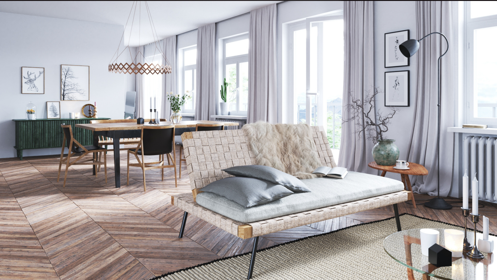
scene 09 cam 01

Have you ever wanted to make professional interior renderings? Do you know how to use V-RaySun, V-RaySky and V-RayPhysicalCamera? Have you ever had problems with composition? Archinteriors will end all your problems. Take a look at this 10 fully textured scenes with professional shaders and lighting ready to render. Get your own portfolio and join cg market.