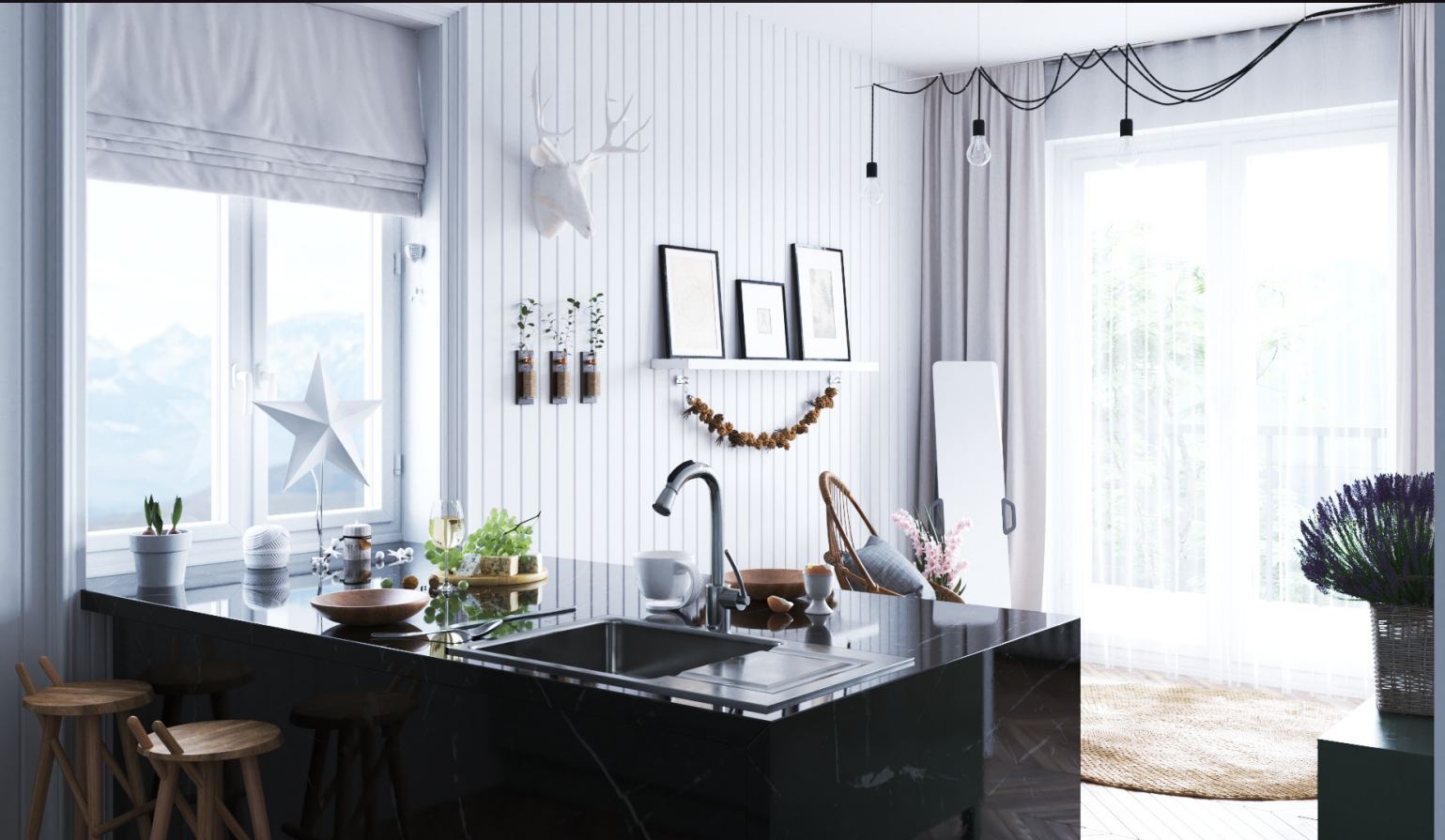
scene 09 cam 02

Have you ever wanted to make professional interior renderings? Do you know how to use V-RaySun, V-RaySky and V-RayPhysicalCamera? Have you ever had problems with composition? Archinteriors will end all your problems. Take a look at this 10 fully textured scenes with professional shaders and lighting ready to render. Get your own portfolio and join cg market.