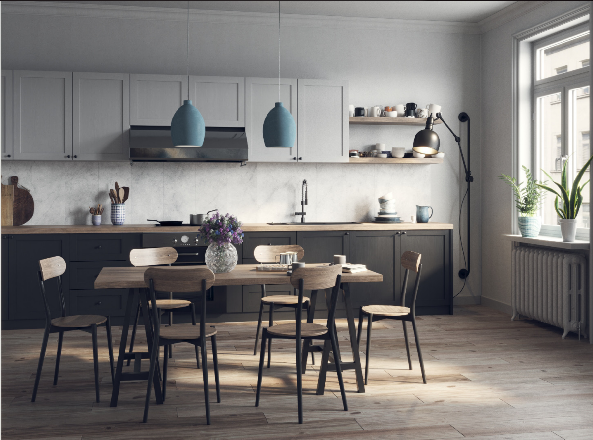
scene 03 cam 02

Have you ever wanted to make professional interior renderings? Do you know how to use V-RaySun, V-RaySky and V-RayPhysicalCamera? Have you ever had problems with composition? Archinteriors will end all your problems. Take a look at this 10 fully textured scenes with professional shaders and lighting ready to render. Get your own portfolio and join cg market.