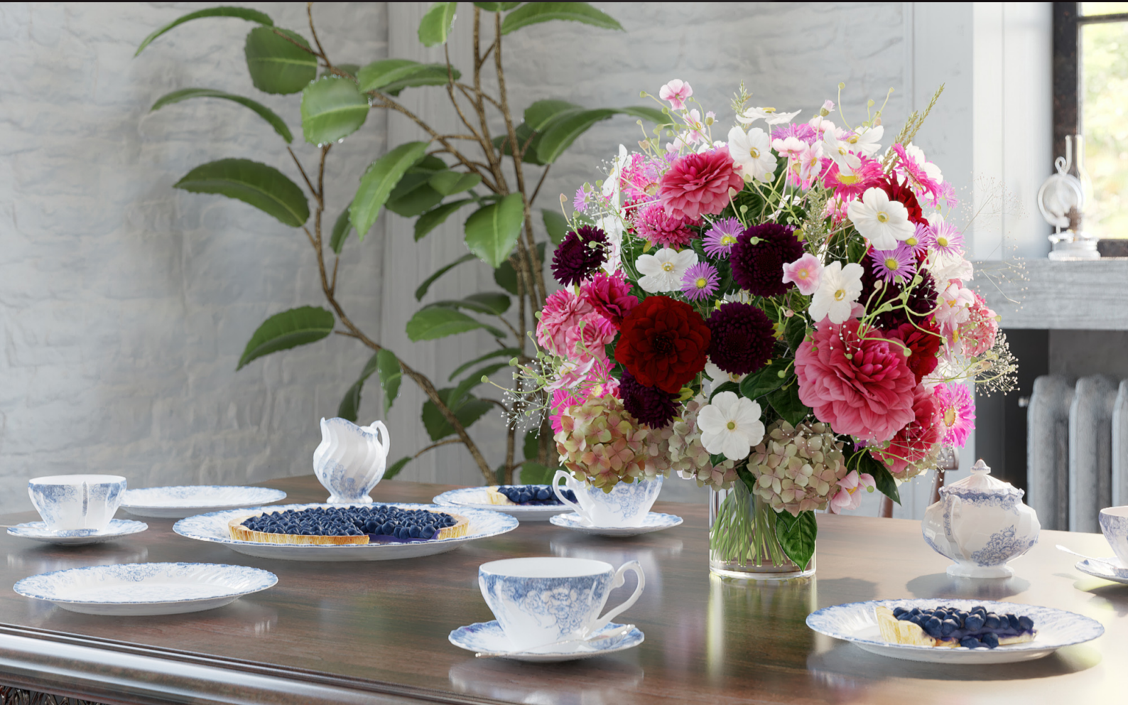
scene 02 cam 04

Have you ever wanted to make professional interior renderings? Do you know how to use V-RaySun, V-RaySky and V-RayPhysicalCamera? Have you ever had problems with composition? Archinteriors will end all your problems. Take a look at this 10 fully textured scenes with professional shaders and lighting ready to render. Get your own portfolio and join cg market.