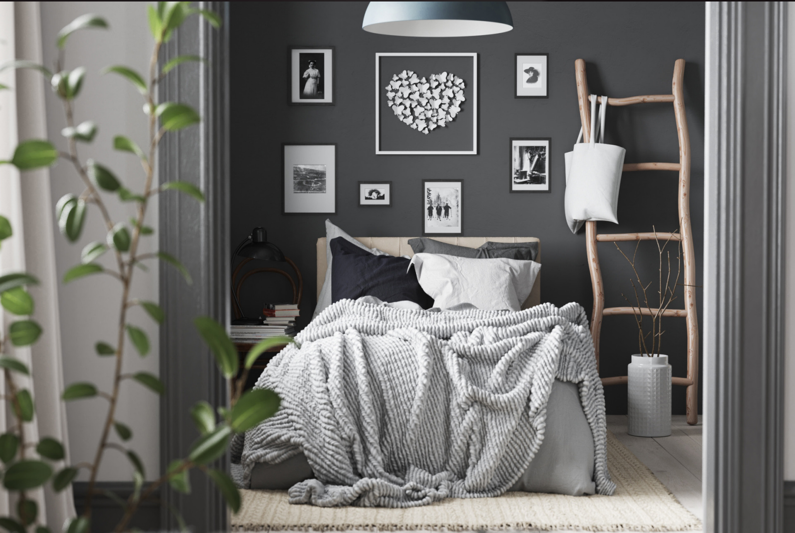
scene 01 cam 04

Have you ever wanted to make professional interior renderings? Do you know how to use V-RaySun, V-RaySky and V-RayPhysicalCamera? Have you ever had problems with composition? Archinteriors will end all your problems. Take a look at this 10 fully textured scenes with professional shaders and lighting ready to render. Get your own portfolio and join cg market.