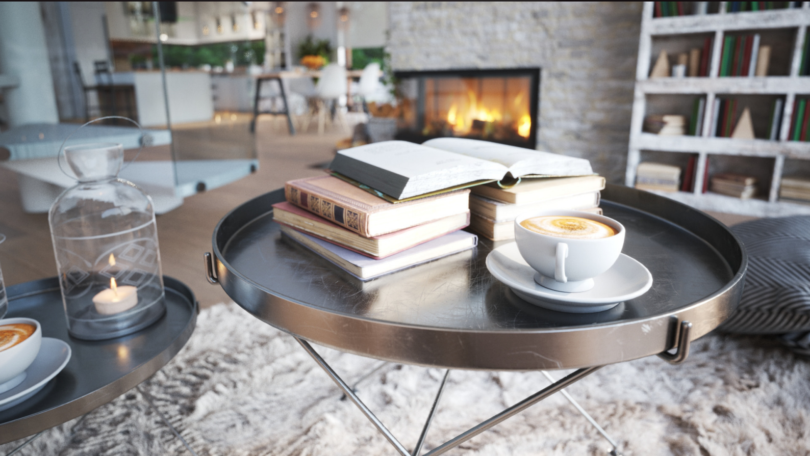
scene 07 cam 03

Have you ever wanted to make professional interior renderings? Do you know how to use V-RaySun, V-RaySky and V-RayPhysicalCamera? Have you ever had problems with composition? Archinteriors will end all your problems. Take a look at this 10 fully textured scenes with professional shaders and lighting ready to render. Get your own portfolio and join cg market.