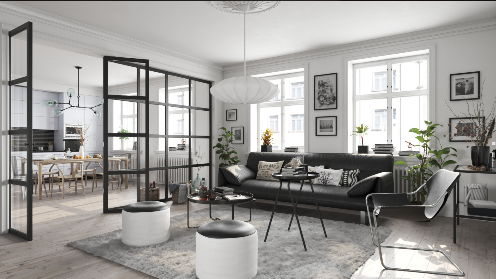
scene 10 cam 02

Have you ever wanted to make professional interior renderings? Do you know how to use V-RaySun, V-RaySky and V-RayPhysicalCamera? Have you ever had problems with composition? Archinteriors will end all your problems. Take a look at this 10 fully textured scenes with professional shaders and lighting ready to render. Get your own portfolio and join cg market.