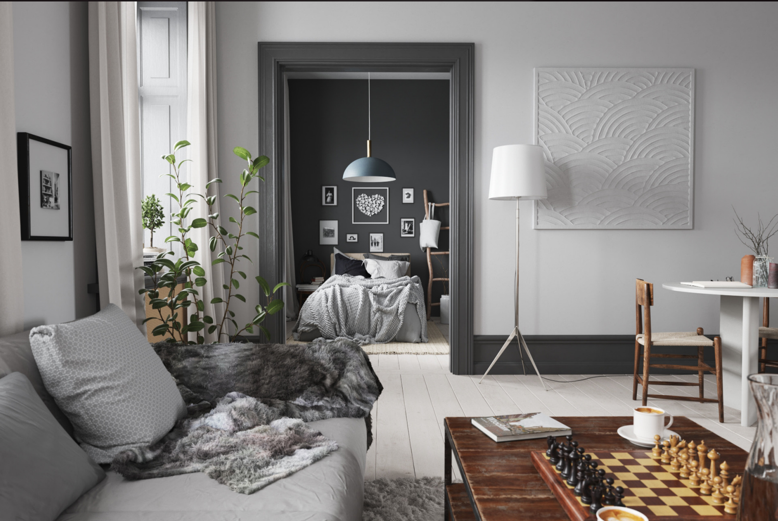
scene 01 cam 02

Have you ever wanted to make professional interior renderings? Do you know how to use V-RaySun, V-RaySky and V-RayPhysicalCamera? Have you ever had problems with composition? Archinteriors will end all your problems. Take a look at this 10 fully textured scenes with professional shaders and lighting ready to render. Get your own portfolio and join cg market.