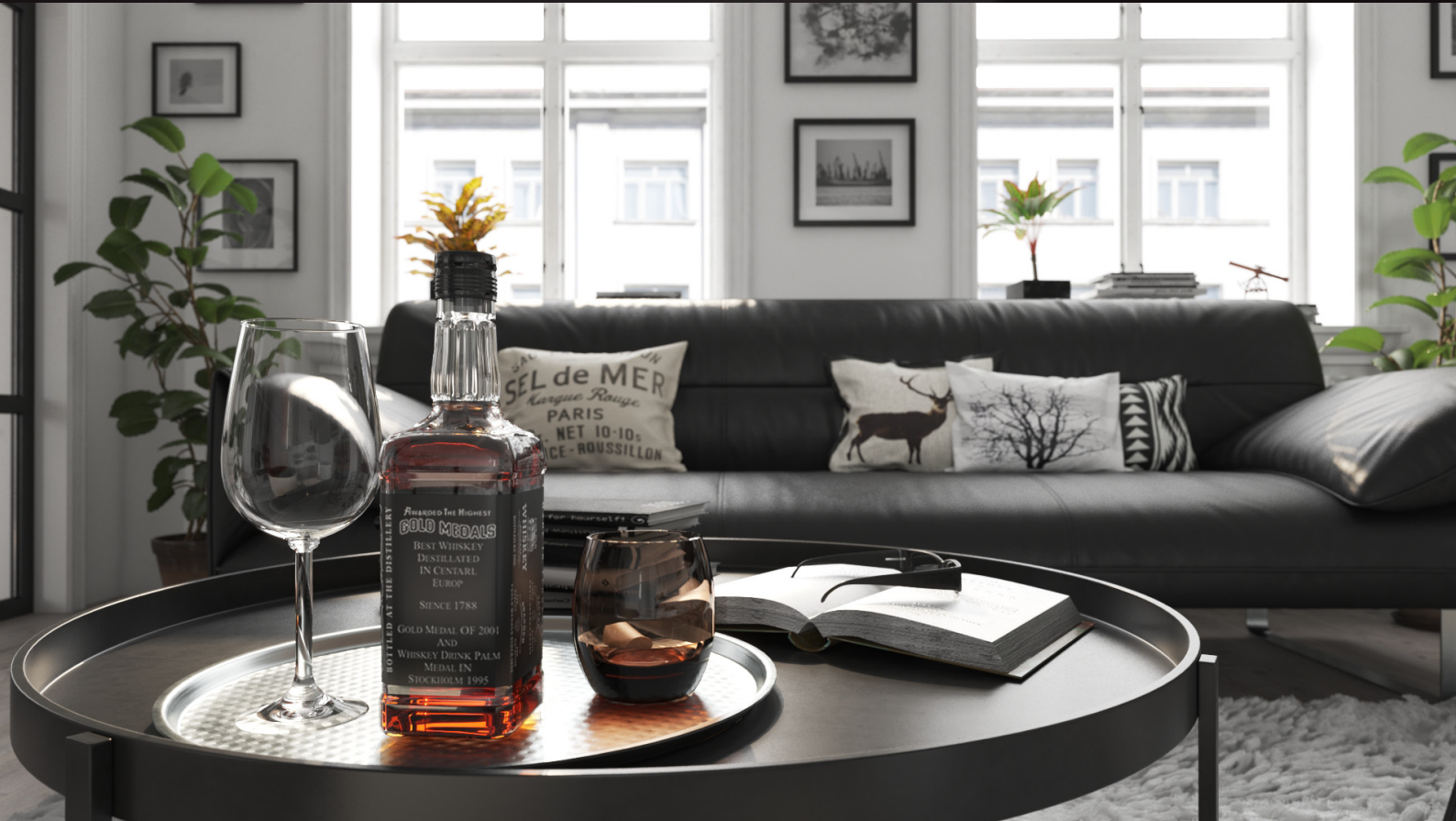
scene 10 cam 04

Have you ever wanted to make professional interior renderings? Do you know how to use V-RaySun, V-RaySky and V-RayPhysicalCamera? Have you ever had problems with composition? Archinteriors will end all your problems. Take a look at this 10 fully textured scenes with professional shaders and lighting ready to render. Get your own portfolio and join cg market.