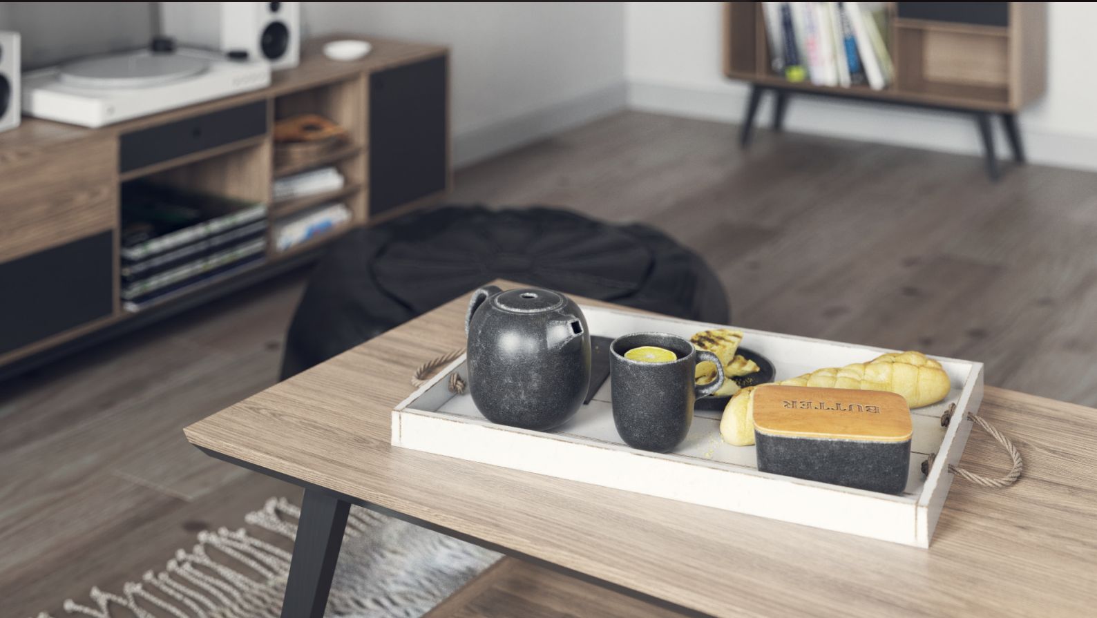
scene 03 cam 04

Have you ever wanted to make professional interior renderings? Do you know how to use V-RaySun, V-RaySky and V-RayPhysicalCamera? Have you ever had problems with composition? Archinteriors will end all your problems. Take a look at this 10 fully textured scenes with professional shaders and lighting ready to render. Get your own portfolio and join cg market.