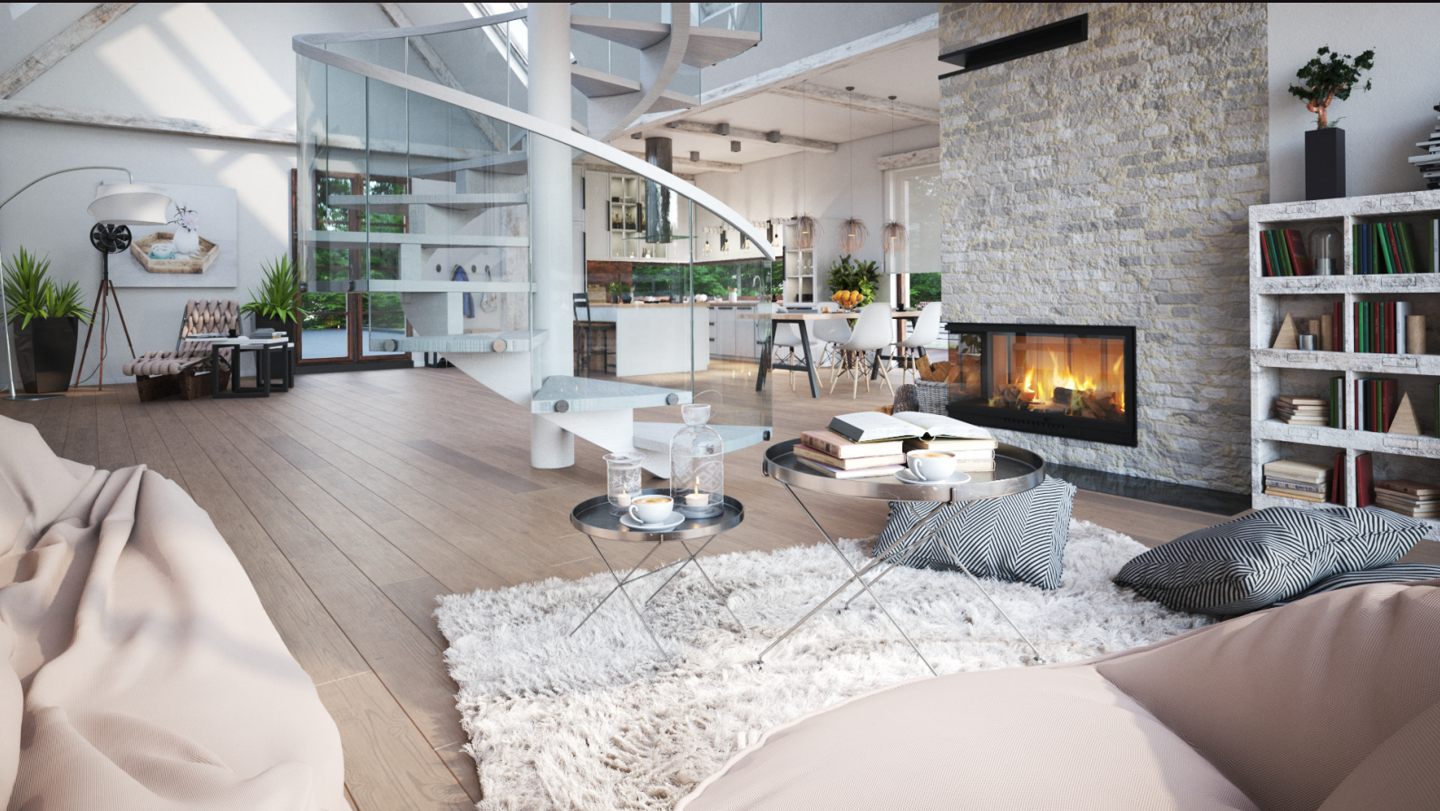
scene 07 cam 01

Have you ever wanted to make professional interior renderings? Do you know how to use V-RaySun, V-RaySky and V-RayPhysicalCamera? Have you ever had problems with composition? Archinteriors will end all your problems. Take a look at this 10 fully textured scenes with professional shaders and lighting ready to render. Get your own portfolio and join cg market.