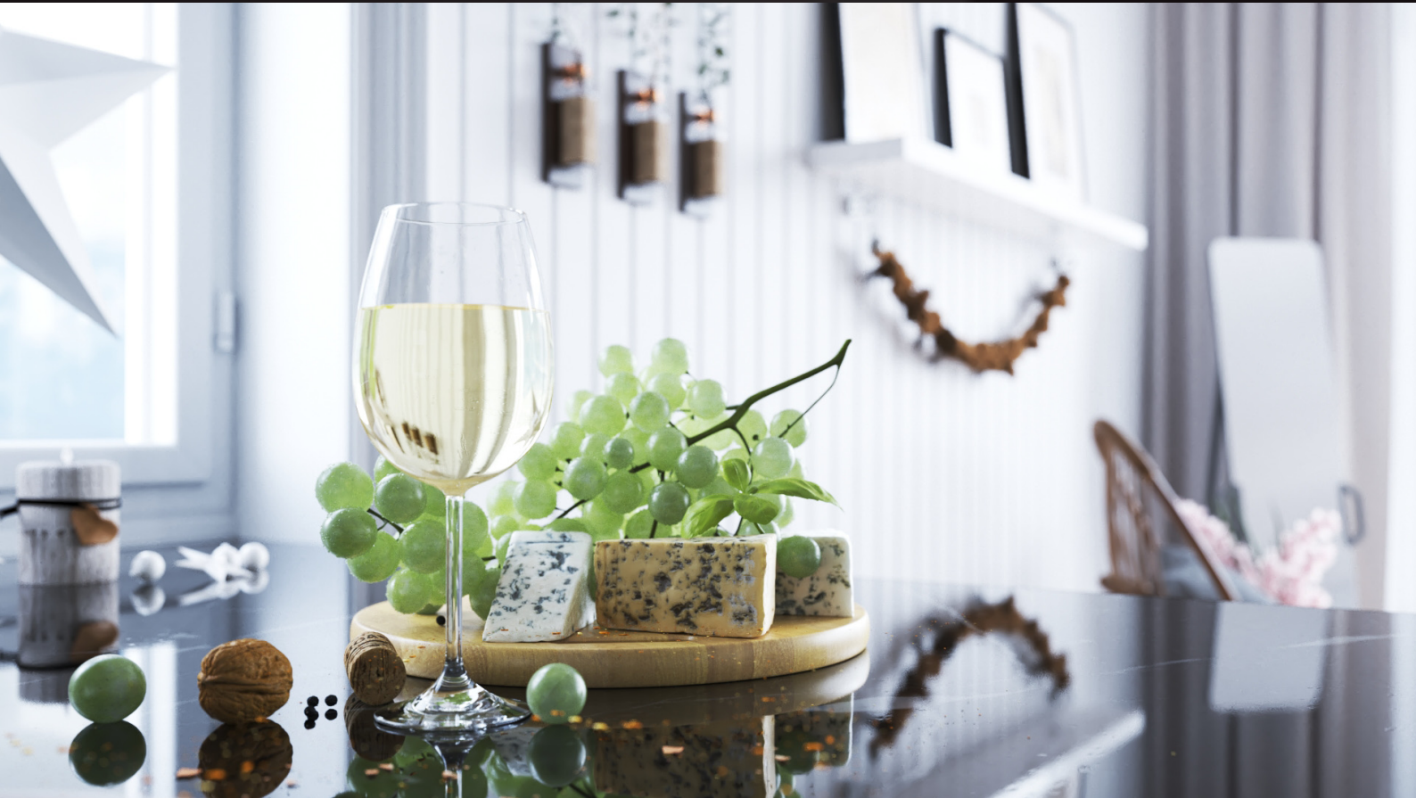
scene 09 cam 04

Have you ever wanted to make professional interior renderings? Do you know how to use V-RaySun, V-RaySky and V-RayPhysicalCamera? Have you ever had problems with composition? Archinteriors will end all your problems. Take a look at this 10 fully textured scenes with professional shaders and lighting ready to render. Get your own portfolio and join cg market.