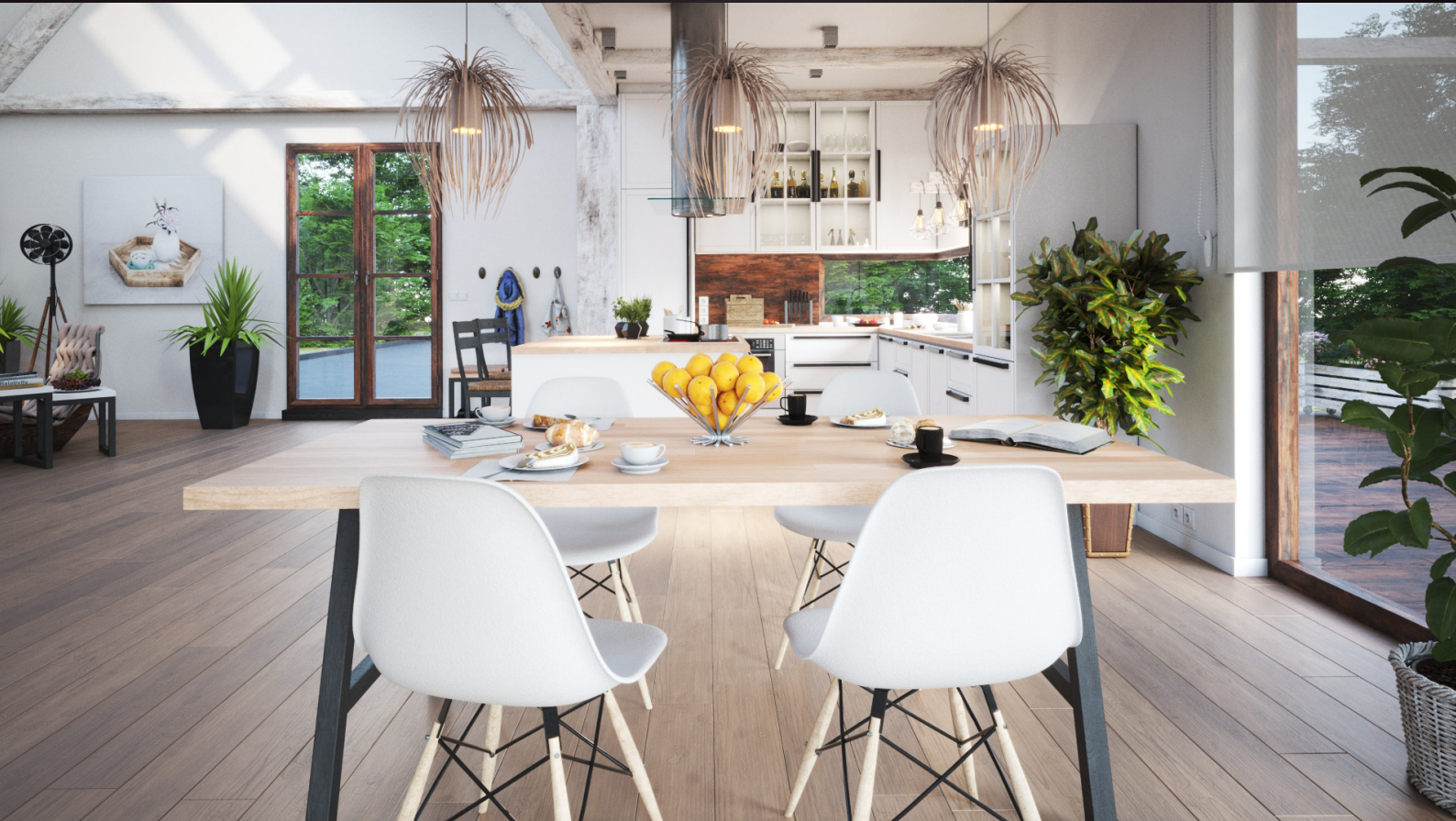
scene 07 cam 02

Have you ever wanted to make professional interior renderings? Do you know how to use V-RaySun, V-RaySky and V-RayPhysicalCamera? Have you ever had problems with composition? Archinteriors will end all your problems. Take a look at this 10 fully textured scenes with professional shaders and lighting ready to render. Get your own portfolio and join cg market.