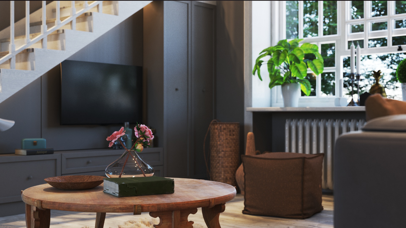
scene 05 cam 04

Have you ever wanted to make professional interior renderings? Do you know how to use V-RaySun, V-RaySky and V-RayPhysicalCamera? Have you ever had problems with composition? Archinteriors will end all your problems. Take a look at this 10 fully textured scenes with professional shaders and lighting ready to render. Get your own portfolio and join cg market.