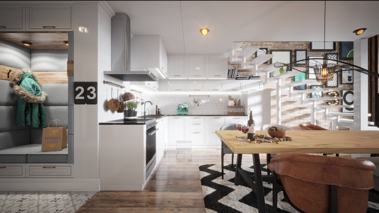
scene 08 cam 02

Have you ever wanted to make professional interior renderings? Do you know how to use V-RaySun, V-RaySky and V-RayPhysicalCamera? Have you ever had problems with composition? Archinteriors will end all your problems. Take a look at this 10 fully textured scenes with professional shaders and lighting ready to render. Get your own portfolio and join cg market.