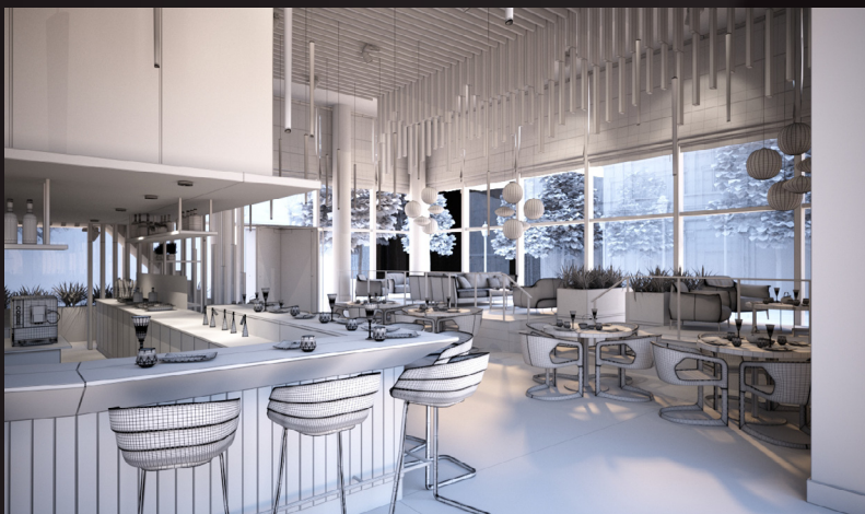
scene 04 cam 02 wire

Software and models © 2020 EVERMOTION. EVERMOTION logo is trademark or registered trademark of Evermotion Inc. in the U.S. and/or other countries. All rights reserved. All *.max, *.obj, *.fbx and bitmaps models included on this collection with data are an integral part of „archinteriors vol. 55” and the resale of this data is strictly prohibited. All models can be used for commercial purposes only by owners who bought this collection. The sharing of collection is strictly prohibited unless that user has written authorization from EVERMOTION.