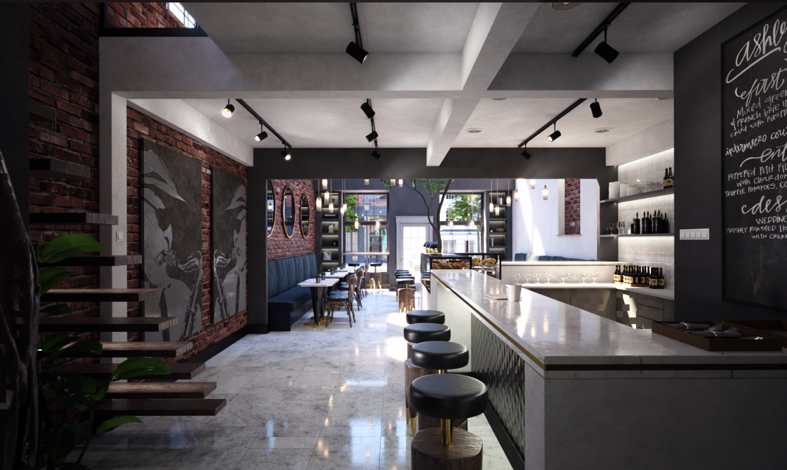
scene 07 cam 01

Have you ever wanted to make professional interior renderings? Do you know how to use V-RaySun, V-RaySky and V-RayPhysicalCamera? Have you ever had problems with composition? Archinteriors will end all your problems. Take a look at this 20 fully textured scenes with professional shaders and lighting ready to render. Get your own portfolio and join cg market.