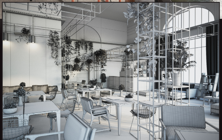
scene 08 cam 02 wire

Software and models © 2020 EVERMOTION. EVERMOTION logo is trademark or registered trademark of Evermotion Inc. in the U.S. and/or other countries. All rights reserved. All *.max, *.obj, *.fbx and bitmaps models included on this collection with data are an integral part of „archinteriors vol. 55” and the resale of this data is strictly prohibited. All models can be used for commercial purposes only by owners who bought this collection. The sharing of collection is strictly prohibited unless that user has written authorization from EVERMOTION.