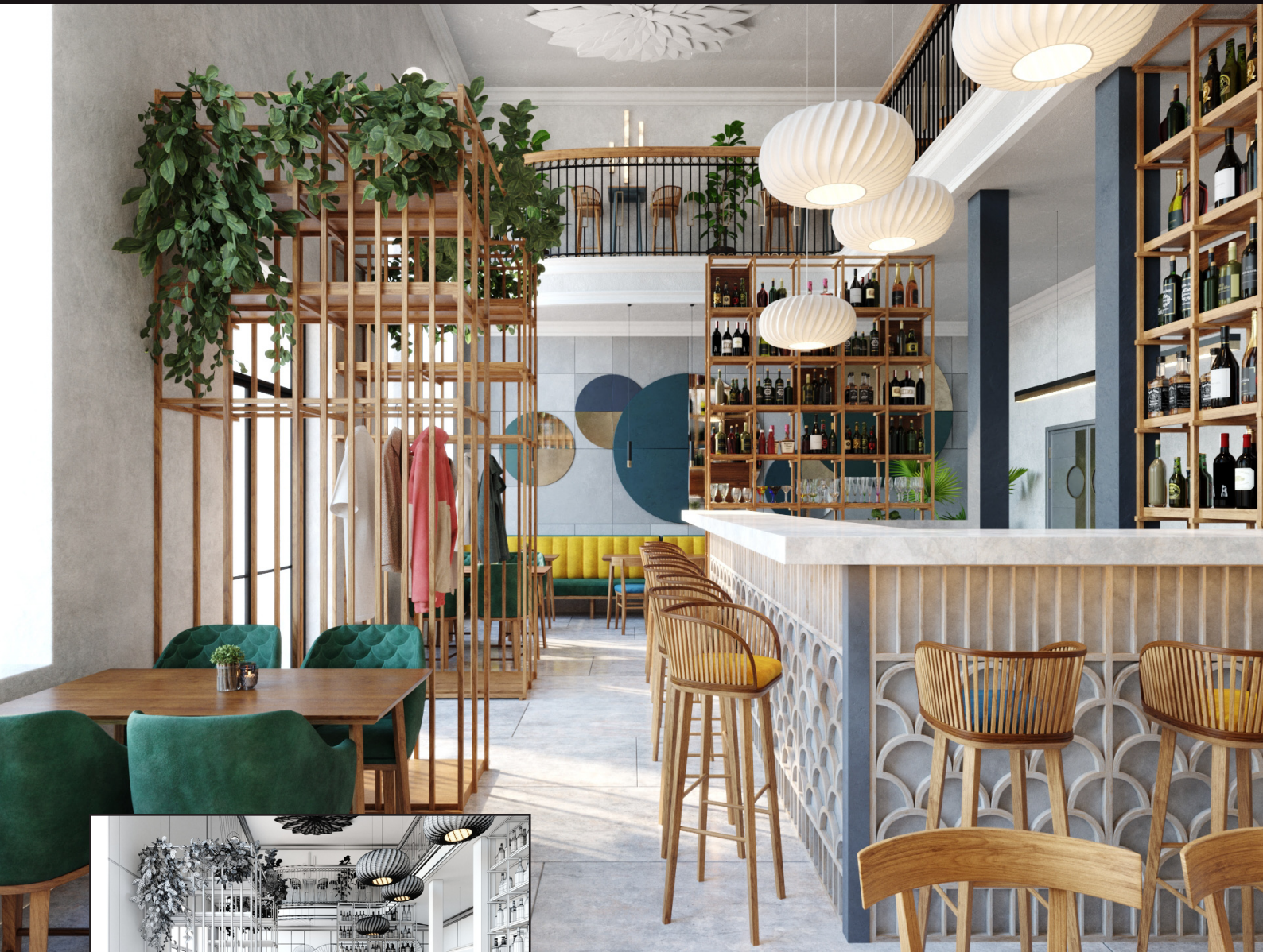
scene 03 cam 01

Have you ever wanted to make professional interior renderings? Do you know how to use V-RaySun, V-RaySky and V-RayPhysicalCamera? Have you ever had problems with composition? Archinteriors will end all your problems. Take a look at this 20 fully textured scenes with professional shaders and lighting ready to render. Get your own portfolio and join cg market.