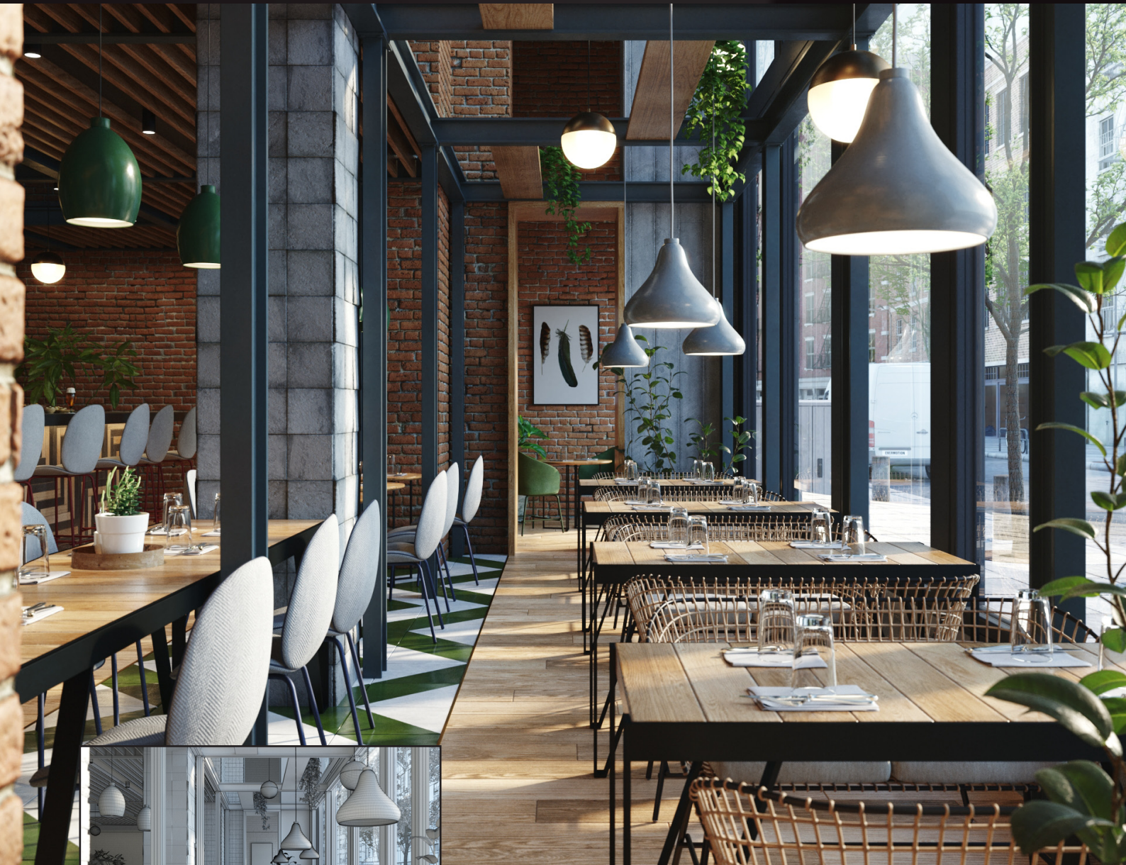
scene 09 cam 02

Have you ever wanted to make professional interior renderings? Do you know how to use V-RaySun, V-RaySky and V-RayPhysicalCamera? Have you ever had problems with composition? Archinteriors will end all your problems. Take a look at this 20 fully textured scenes with professional shaders and lighting ready to render. Get your own portfolio and join cg market.