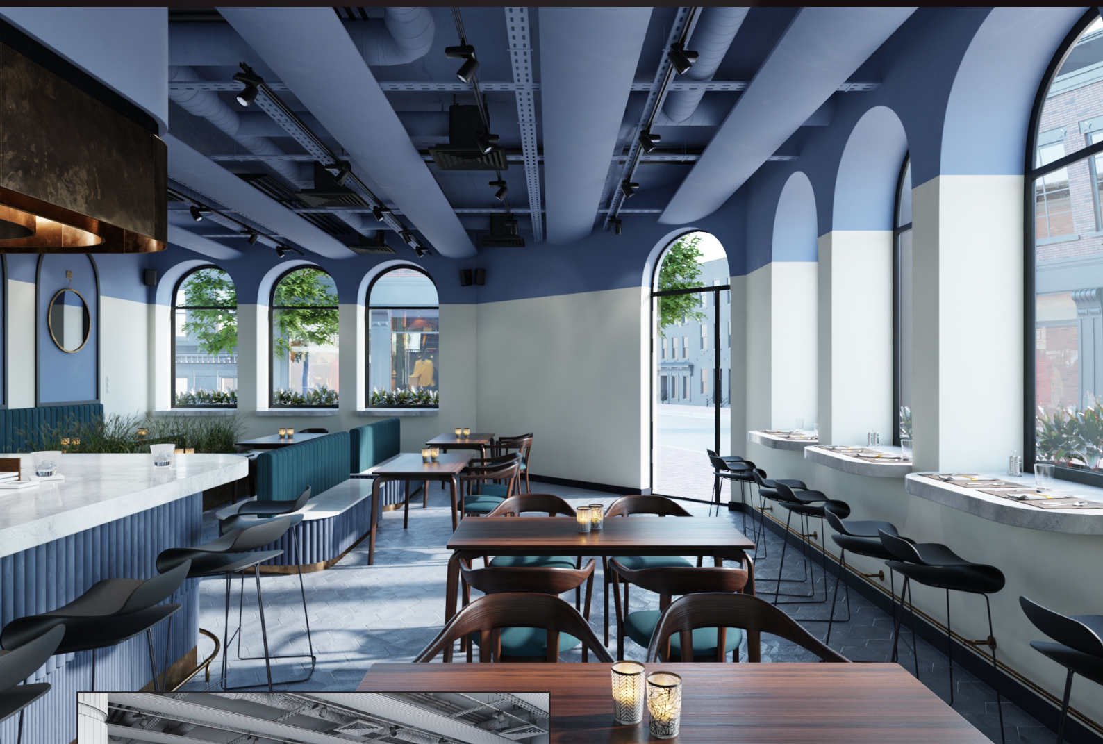
scene 10 cam 02

Have you ever wanted to make professional interior renderings? Do you know how to use V-RaySun, V-RaySky and V-RayPhysicalCamera? Have you ever had problems with composition? Archinteriors will end all your problems. Take a look at this 20 fully textured scenes with professional shaders and lighting ready to render. Get your own portfolio and join cg market.