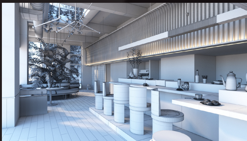
scene 05 cam 01 wire

Software and models © 2020 EVERMOTION. EVERMOTION logo is trademark or registered trademark of Evermotion Inc. in the U.S. and/or other countries. All rights reserved. All *.max, *.obj, *.fbx and bitmaps models included on this collection with data are an integral part of „archinteriors vol. 55” and the resale of this data is strictly prohibited. All models can be used for commercial purposes only by owners who bought this collection. The sharing of collection is strictly prohibited unless that user has written authorization from EVERMOTION.