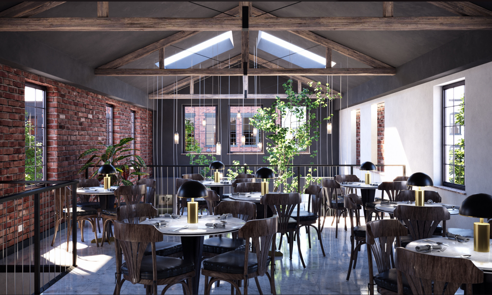
scene 07 cam 02

Have you ever wanted to make professional interior renderings? Do you know how to use V-RaySun, V-RaySky and V-RayPhysicalCamera? Have you ever had problems with composition? Archinteriors will end all your problems. Take a look at this 20 fully textured scenes with professional shaders and lighting ready to render. Get your own portfolio and join cg market.