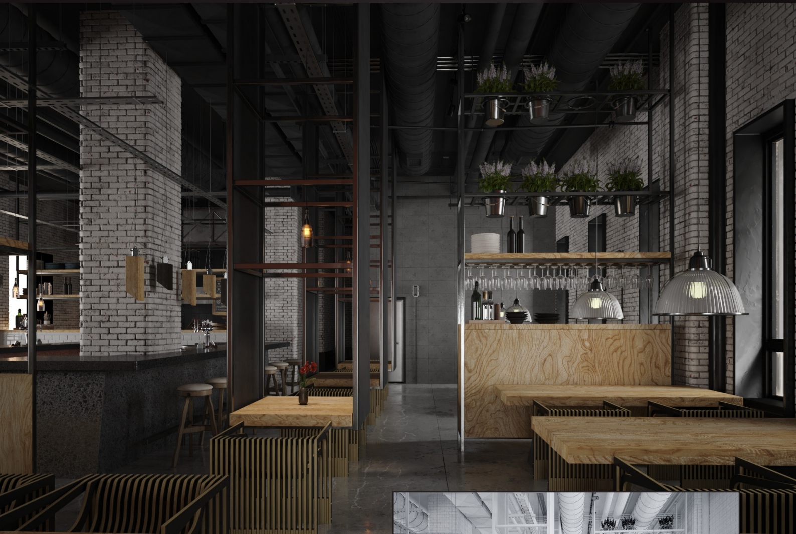
scene 06 cam 02

Have you ever wanted to make professional interior renderings? Do you know how to use V-RaySun, V-RaySky and V-RayPhysicalCamera? Have you ever had problems with composition? Archinteriors will end all your problems. Take a look at this 20 fully textured scenes with professional shaders and lighting ready to render. Get your own portfolio and join cg market.