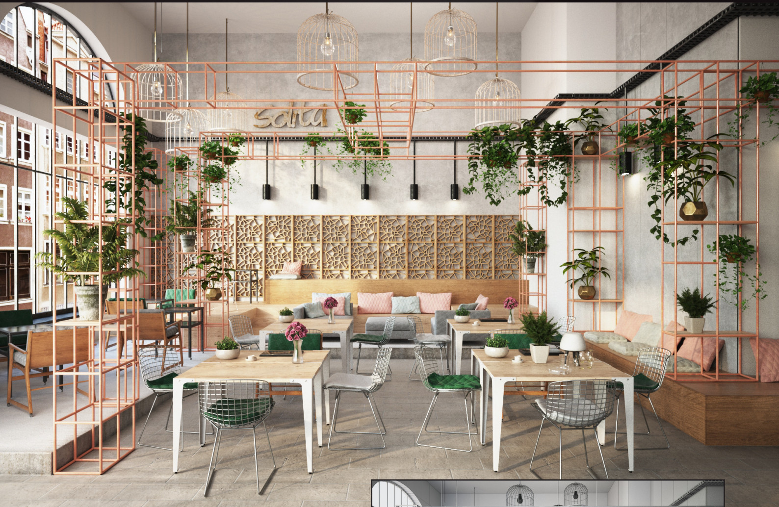
scene 08 cam 01

Have you ever wanted to make professional interior renderings? Do you know how to use V-RaySun, V-RaySky and V-RayPhysicalCamera? Have you ever had problems with composition? Archinteriors will end all your problems. Take a look at this 20 fully textured scenes with professional shaders and lighting ready to render. Get your own portfolio and join cg market.