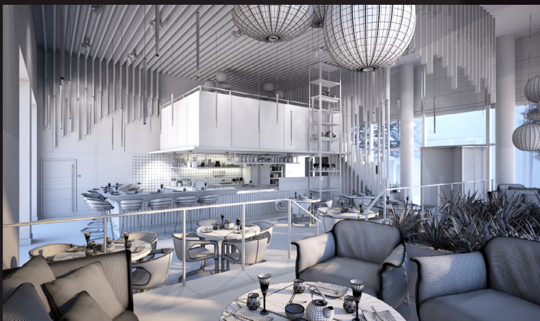
scene 04 cam 01 wire

Software and models © 2020 EVERMOTION. EVERMOTION logo is trademark or registered trademark of Evermotion Inc. in the U.S. and/or other countries. All rights reserved. All *.max, *.obj, *.fbx and bitmaps models included on this collection with data are an integral part of „archinteriors vol. 55” and the resale of this data is strictly prohibited. All models can be used for commercial purposes only by owners who bought this collection. The sharing of collection is strictly prohibited unless that user has written authorization from EVERMOTION.