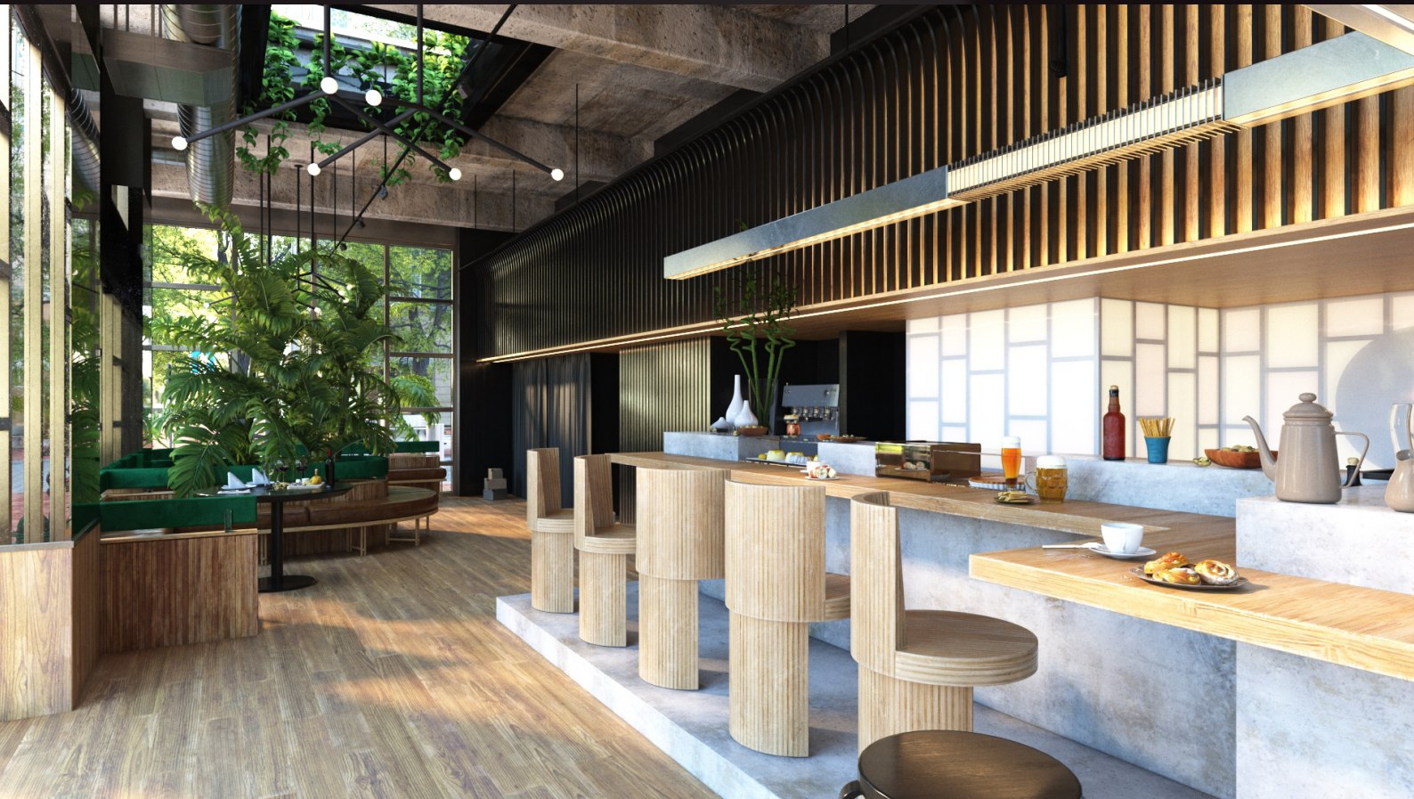
scene 05 cam 02

Have you ever wanted to make professional interior renderings? Do you know how to use V-RaySun, V-RaySky and V-RayPhysicalCamera? Have you ever had problems with composition? Archinteriors will end all your problems. Take a look at this 20 fully textured scenes with professional shaders and lighting ready to render. Get your own portfolio and join cg market.