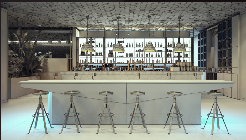
scene 02 cam 02 wire

Software and models © 2020 EVERMOTION. EVERMOTION logo is trademark or registered trademark of Evermotion Inc. in the U.S. and/or other countries. All rights reserved. All *.max, *.obj, *.fbx and bitmaps models included on this collection with data are an integral part of „archinteriors vol. 55” and the resale of this data is strictly prohibited. All models can be used for commercial purposes only by owners who bought this collection. The sharing of collection is strictly prohibited unless that user has written authorization from EVERMOTION.