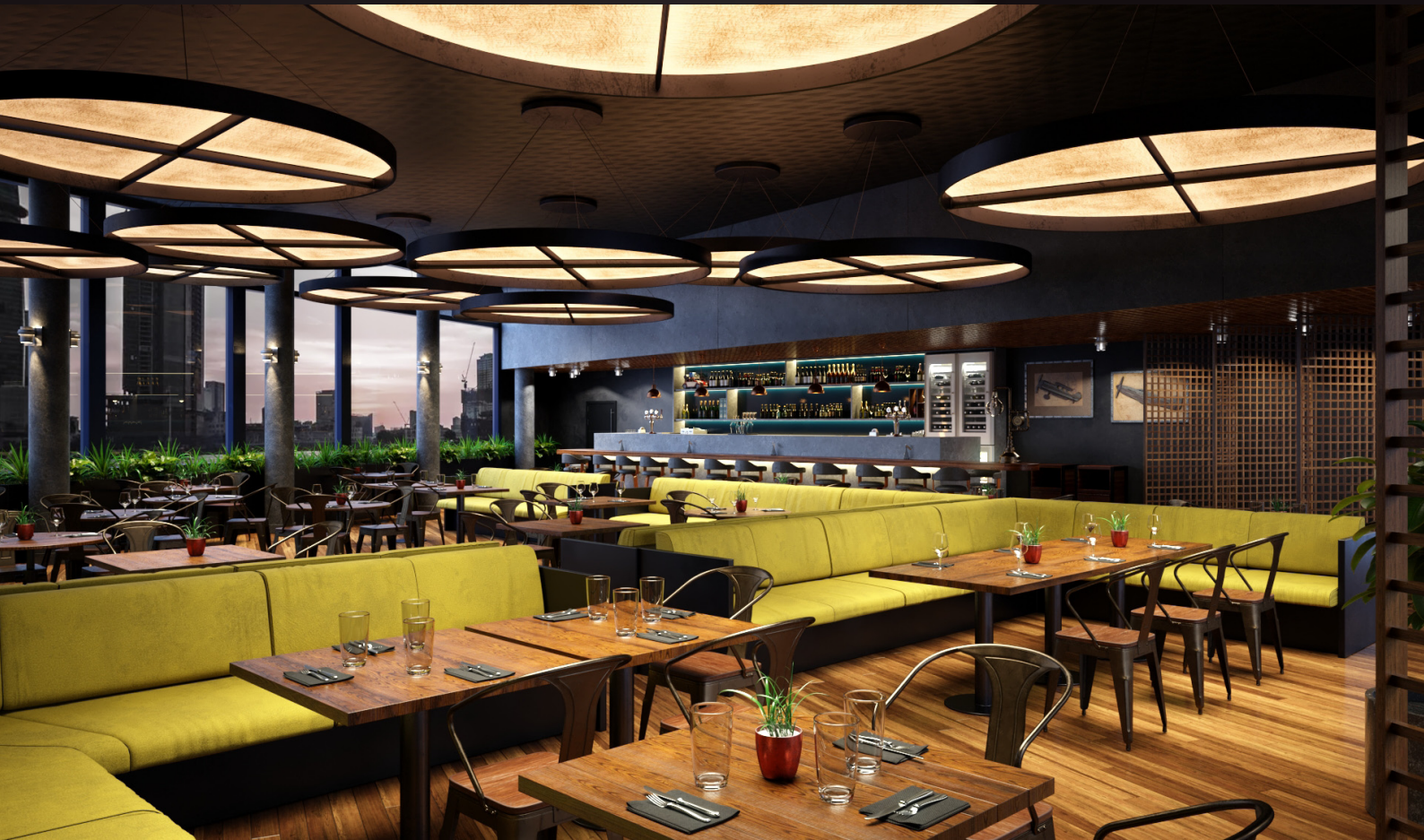
scene 01 cam 01

Have you ever wanted to make professional interior renderings? Do you know how to use V-RaySun, V-RaySky and V-RayPhysicalCamera? Have you ever had problems with composition? Archinteriors will end all your problems. Take a look at this 20 fully textured scenes with professional shaders and lighting ready to render. Get your own portfolio and join cg market.