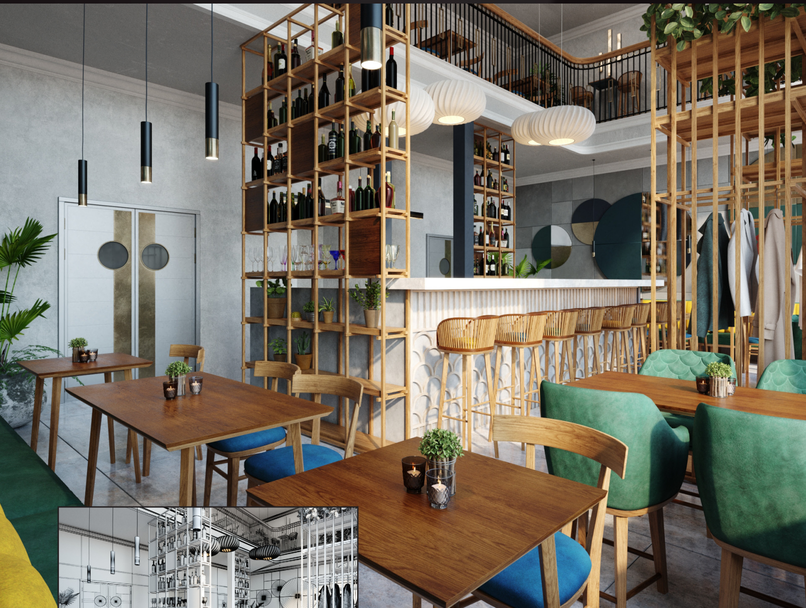
scene 03 cam 02

Have you ever wanted to make professional interior renderings? Do you know how to use V-RaySun, V-RaySky and V-RayPhysicalCamera? Have you ever had problems with composition? Archinteriors will end all your problems. Take a look at this 20 fully textured scenes with professional shaders and lighting ready to render. Get your own portfolio and join cg market.