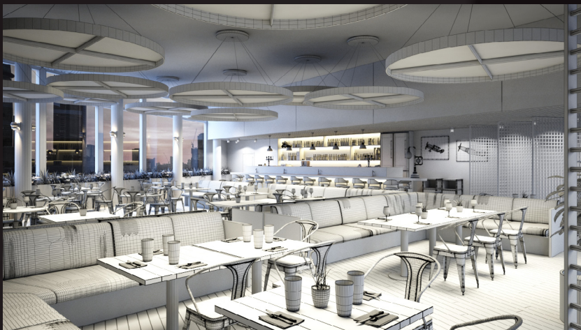
scene 01 cam 01 wire

Software and models © 2020 EVERMOTION. EVERMOTION logo is trademark or registered trademark of Evermotion Inc. in the U.S. and/or other countries. All rights reserved. All *.max, *.obj, *.fbx and bitmaps models included on this collection with data are an integral part of „archinteriors vol. 55” and the resale of this data is strictly prohibited. All models can be used for commercial purposes only by owners who bought this collection. The sharing of collection is strictly prohibited unless that user has written authorization from EVERMOTION.