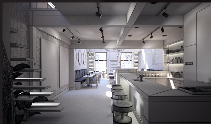
scene 07 cam 01 wire

Software and models © 2020 EVERMOTION. EVERMOTION logo is trademark or registered trademark of Evermotion Inc. in the U.S. and/or other countries. All rights reserved. All *.max, *.obj, *.fbx and bitmaps models included on this collection with data are an integral part of „archinteriors vol. 55” and the resale of this data is strictly prohibited. All models can be used for commercial purposes only by owners who bought this collection. The sharing of collection is strictly prohibited unless that user has written authorization from EVERMOTION.