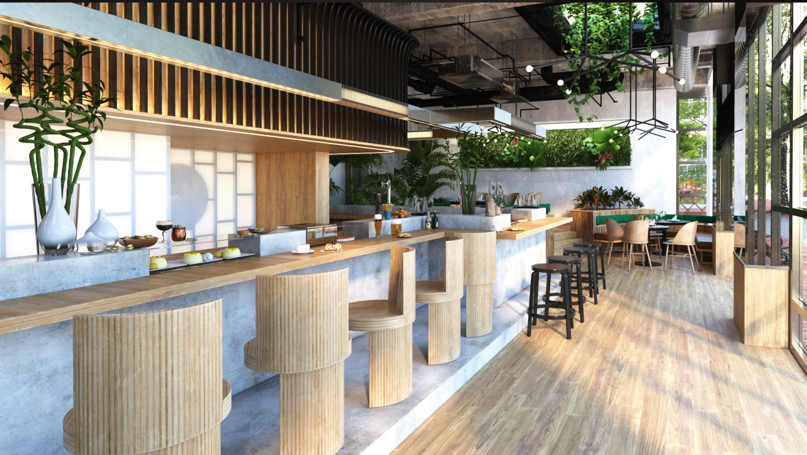
scene 05 cam 01

Have you ever wanted to make professional interior renderings? Do you know how to use V-RaySun, V-RaySky and V-RayPhysicalCamera? Have you ever had problems with composition? Archinteriors will end all your problems. Take a look at this 20 fully textured scenes with professional shaders and lighting ready to render. Get your own portfolio and join cg market.