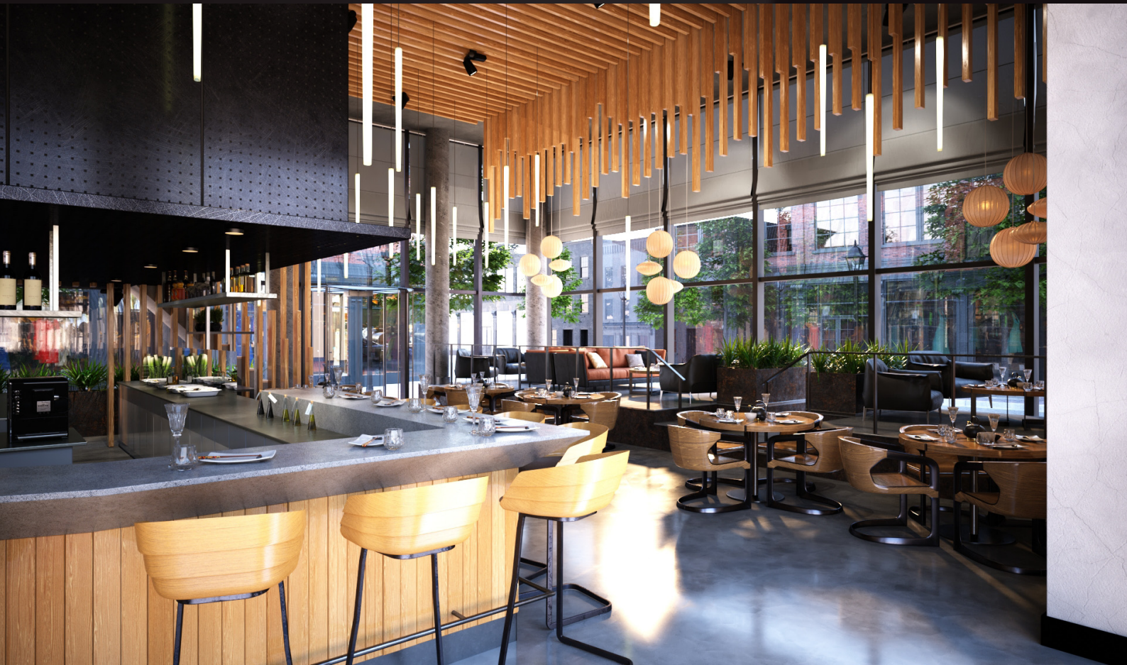
scene 04 cam 02

Have you ever wanted to make professional interior renderings? Do you know how to use V-RaySun, V-RaySky and V-RayPhysicalCamera? Have you ever had problems with composition? Archinteriors will end all your problems. Take a look at this 20 fully textured scenes with professional shaders and lighting ready to render. Get your own portfolio and join cg market.