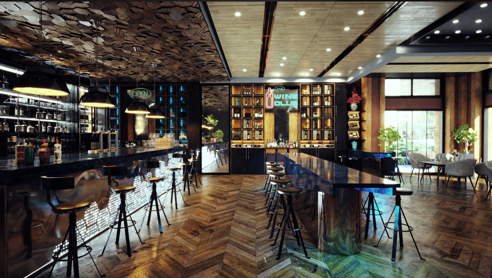
scene 02 cam 01

Have you ever wanted to make professional interior renderings? Do you know how to use V-RaySun, V-RaySky and V-RayPhysicalCamera? Have you ever had problems with composition? Archinteriors will end all your problems. Take a look at this 20 fully textured scenes with professional shaders and lighting ready to render. Get your own portfolio and join cg market.