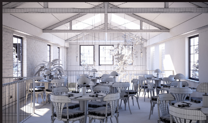
scene 07 cam 02 wire

Software and models © 2020 EVERMOTION. EVERMOTION logo is trademark or registered trademark of Evermotion Inc. in the U.S. and/or other countries. All rights reserved. All *.max, *.obj, *.fbx and bitmaps models included on this collection with data are an integral part of „archinteriors vol. 55” and the resale of this data is strictly prohibited. All models can be used for commercial purposes only by owners who bought this collection. The sharing of collection is strictly prohibited unless that user has written authorization from EVERMOTION.