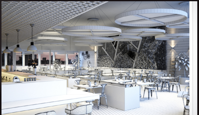
scene 01 cam 02 wire

Software and models © 2020 EVERMOTION. EVERMOTION logo is trademark or registered trademark of Evermotion Inc. in the U.S. and/or other countries. All rights reserved. All *.max, *.obj, *.fbx and bitmaps models included on this collection with data are an integral part of „archinteriors vol. 55” and the resale of this data is strictly prohibited. All models can be used for commercial purposes only by owners who bought this collection. The sharing of collection is strictly prohibited unless that user has written authorization from EVERMOTION.