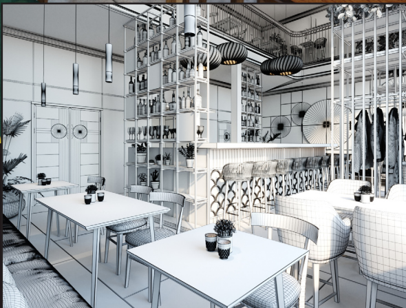
scene 03 cam 02 wire

Software and models © 2020 EVERMOTION. EVERMOTION logo is trademark or registered trademark of Evermotion Inc. in the U.S. and/or other countries. All rights reserved. All *.max, *.obj, *.fbx and bitmaps models included on this collection with data are an integral part of „archinteriors vol. 55” and the resale of this data is strictly prohibited. All models can be used for commercial purposes only by owners who bought this collection. The sharing of collection is strictly prohibited unless that user has written authorization from EVERMOTION.