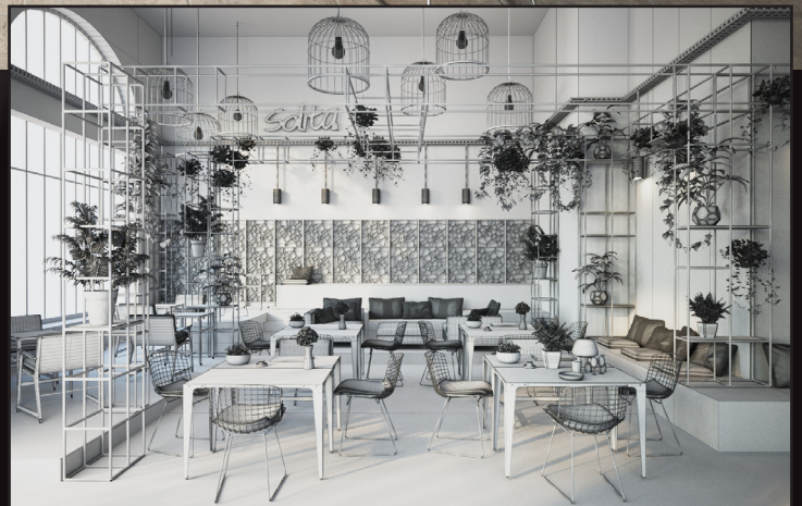
scene 08 cam 01 wire

Software and models © 2020 EVERMOTION. EVERMOTION logo is trademark or registered trademark of Evermotion Inc. in the U.S. and/or other countries. All rights reserved. All *.max, *.obj, *.fbx and bitmaps models included on this collection with data are an integral part of „archinteriors vol. 55” and the resale of this data is strictly prohibited. All models can be used for commercial purposes only by owners who bought this collection. The sharing of collection is strictly prohibited unless that user has written authorization from EVERMOTION.