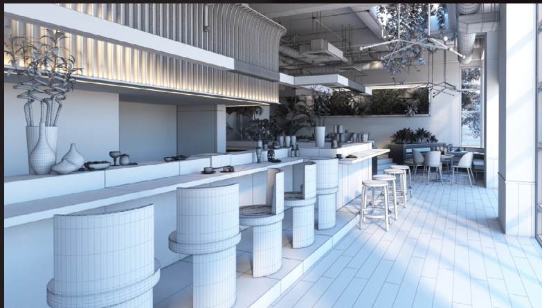
scene 05 cam 02 wire

Software and models © 2020 EVERMOTION. EVERMOTION logo is trademark or registered trademark of Evermotion Inc. in the U.S. and/or other countries. All rights reserved. All *.max, *.obj, *.fbx and bitmaps models included on this collection with data are an integral part of „archinteriors vol. 55” and the resale of this data is strictly prohibited. All models can be used for commercial purposes only by owners who bought this collection. The sharing of collection is strictly prohibited unless that user has written authorization from EVERMOTION.