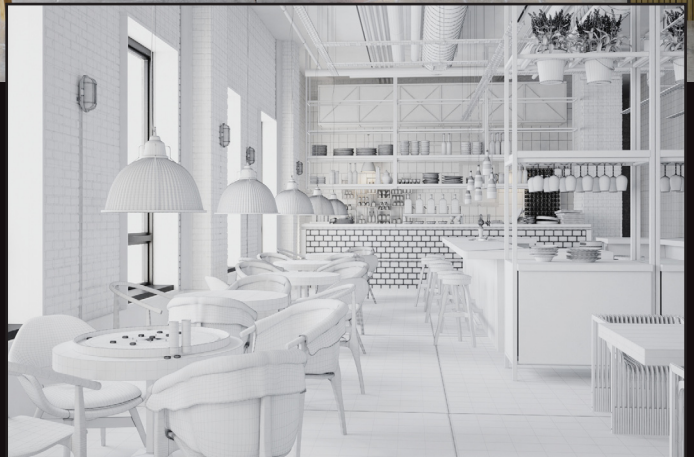
scene 06 cam 01 wire

Software and models © 2020 EVERMOTION. EVERMOTION logo is trademark or registered trademark of Evermotion Inc. in the U.S. and/or other countries. All rights reserved. All *.max, *.obj, *.fbx and bitmaps models included on this collection with data are an integral part of „archinteriors vol. 55” and the resale of this data is strictly prohibited. All models can be used for commercial purposes only by owners who bought this collection. The sharing of collection is strictly prohibited unless that user has written authorization from EVERMOTION.