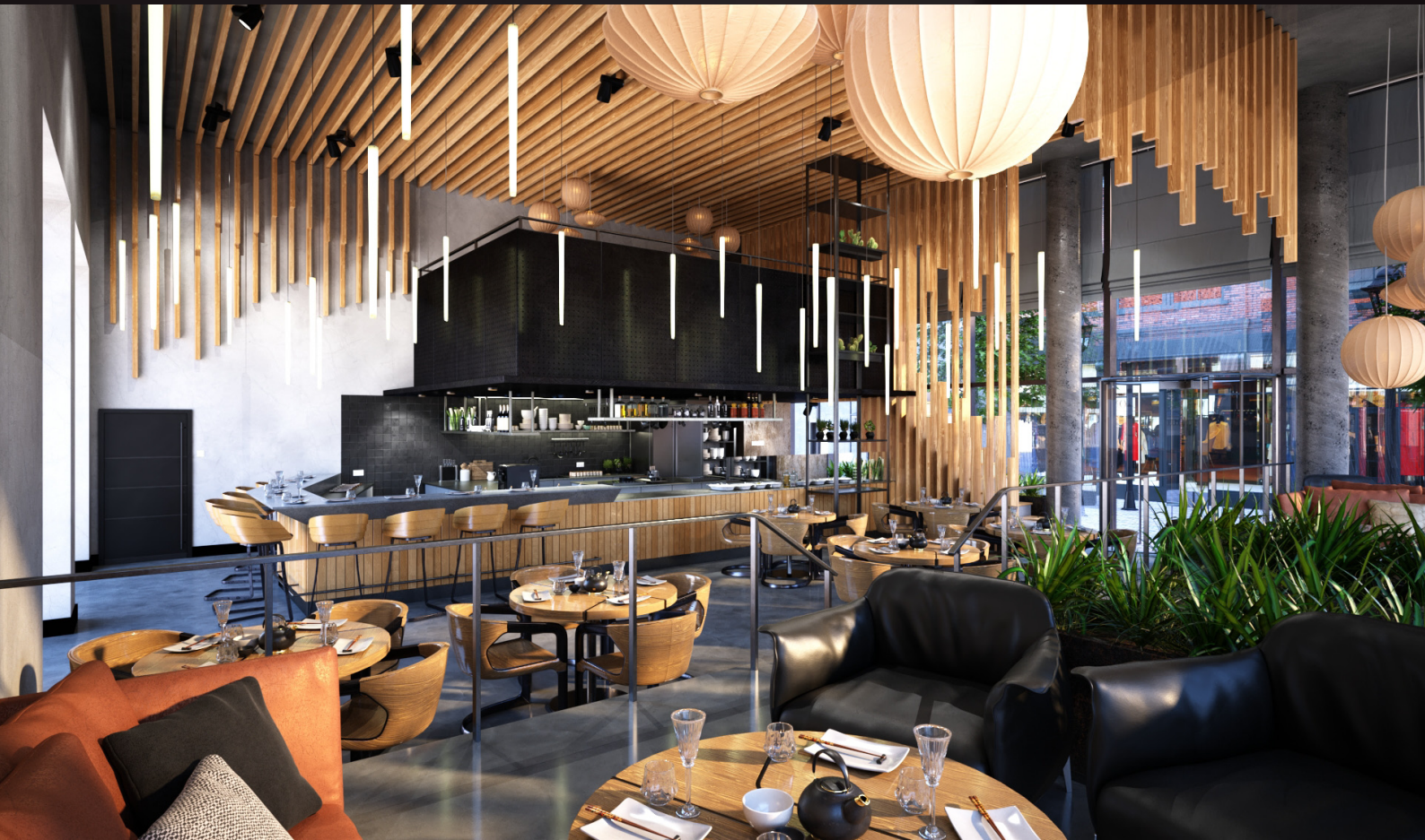
scene 04 cam 01

Have you ever wanted to make professional interior renderings? Do you know how to use V-RaySun, V-RaySky and V-RayPhysicalCamera? Have you ever had problems with composition? Archinteriors will end all your problems. Take a look at this 20 fully textured scenes with professional shaders and lighting ready to render. Get your own portfolio and join cg market.