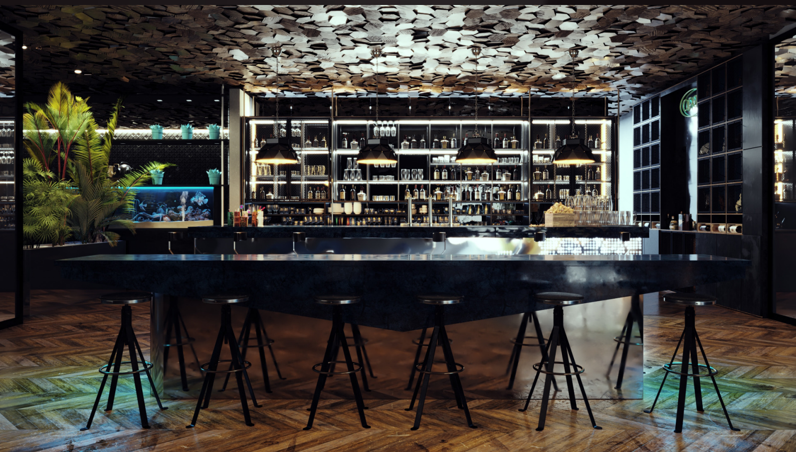
scene 02 cam 02

Have you ever wanted to make professional interior renderings? Do you know how to use V-RaySun, V-RaySky and V-RayPhysicalCamera? Have you ever had problems with composition? Archinteriors will end all your problems. Take a look at this 20 fully textured scenes with professional shaders and lighting ready to render. Get your own portfolio and join cg market.