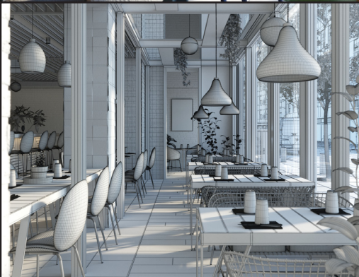
scene 09 cam 02 wire

Software and models © 2020 EVERMOTION. EVERMOTION logo is trademark or registered trademark of Evermotion Inc. in the U.S. and/or other countries. All rights reserved. All *.max, *.obj, *.fbx and bitmaps models included on this collection with data are an integral part of „archinteriors vol. 55” and the resale of this data is strictly prohibited. All models can be used for commercial purposes only by owners who bought this collection. The sharing of collection is strictly prohibited unless that user has written authorization from EVERMOTION.