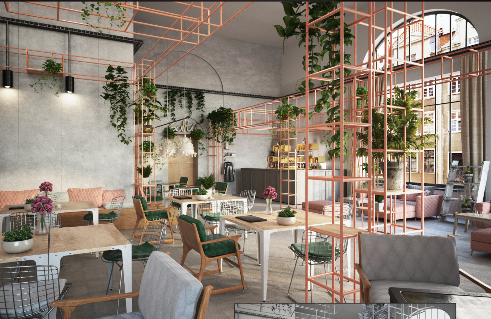
scene 08 cam 02

Have you ever wanted to make professional interior renderings? Do you know how to use V-RaySun, V-RaySky and V-RayPhysicalCamera? Have you ever had problems with composition? Archinteriors will end all your problems. Take a look at this 20 fully textured scenes with professional shaders and lighting ready to render. Get your own portfolio and join cg market.