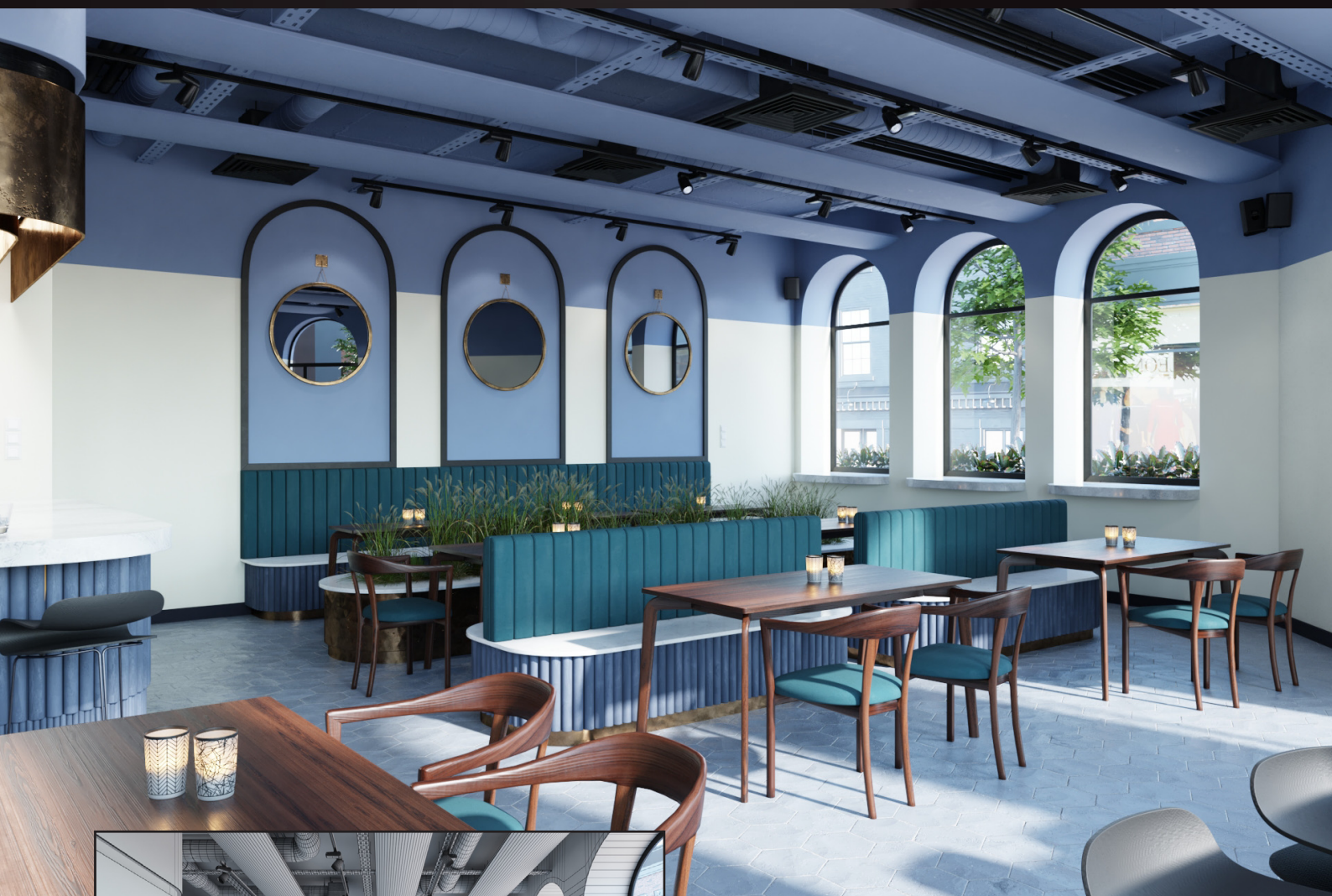
scene 10 cam 01

Have you ever wanted to make professional interior renderings? Do you know how to use V-RaySun, V-RaySky and V-RayPhysicalCamera? Have you ever had problems with composition? Archinteriors will end all your problems. Take a look at this 20 fully textured scenes with professional shaders and lighting ready to render. Get your own portfolio and join cg market.