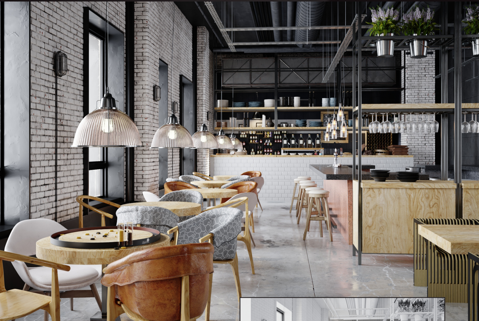
scene 06 cam 01

Have you ever wanted to make professional interior renderings? Do you know how to use V-RaySun, V-RaySky and V-RayPhysicalCamera? Have you ever had problems with composition? Archinteriors will end all your problems. Take a look at this 20 fully textured scenes with professional shaders and lighting ready to render. Get your own portfolio and join cg market.