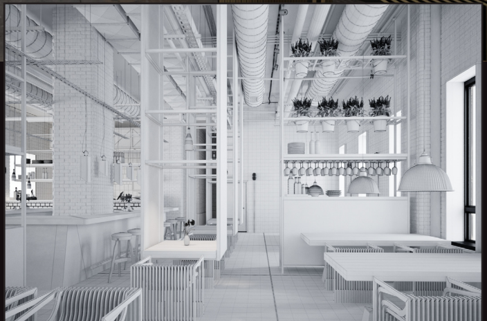
scene 06 cam 02 wire

Software and models © 2020 EVERMOTION. EVERMOTION logo is trademark or registered trademark of Evermotion Inc. in the U.S. and/or other countries. All rights reserved. All *.max, *.obj, *.fbx and bitmaps models included on this collection with data are an integral part of „archinteriors vol. 55” and the resale of this data is strictly prohibited. All models can be used for commercial purposes only by owners who bought this collection. The sharing of collection is strictly prohibited unless that user has written authorization from EVERMOTION.