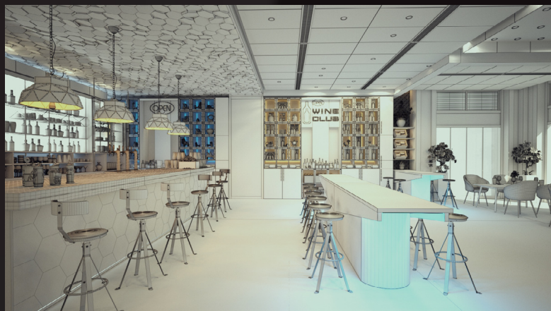
scene 02 cam 01 wire

Software and models © 2020 EVERMOTION. EVERMOTION logo is trademark or registered trademark of Evermotion Inc. in the U.S. and/or other countries. All rights reserved. All *.max, *.obj, *.fbx and bitmaps models included on this collection with data are an integral part of „archinteriors vol. 55” and the resale of this data is strictly prohibited. All models can be used for commercial purposes only by owners who bought this collection. The sharing of collection is strictly prohibited unless that user has written authorization from EVERMOTION.