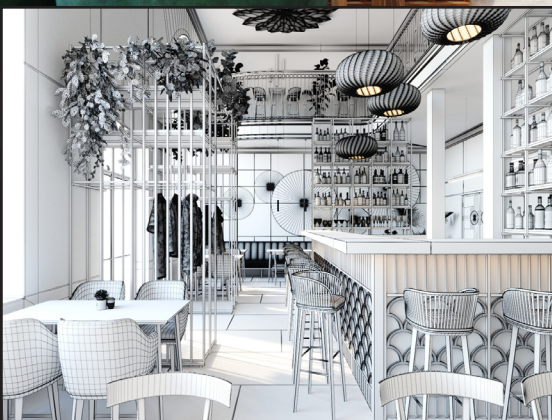
scene 03 cam 01 wire

Software and models © 2020 EVERMOTION. EVERMOTION logo is trademark or registered trademark of Evermotion Inc. in the U.S. and/or other countries. All rights reserved. All *.max, *.obj, *.fbx and bitmaps models included on this collection with data are an integral part of „archinteriors vol. 55” and the resale of this data is strictly prohibited. All models can be used for commercial purposes only by owners who bought this collection. The sharing of collection is strictly prohibited unless that user has written authorization from EVERMOTION.