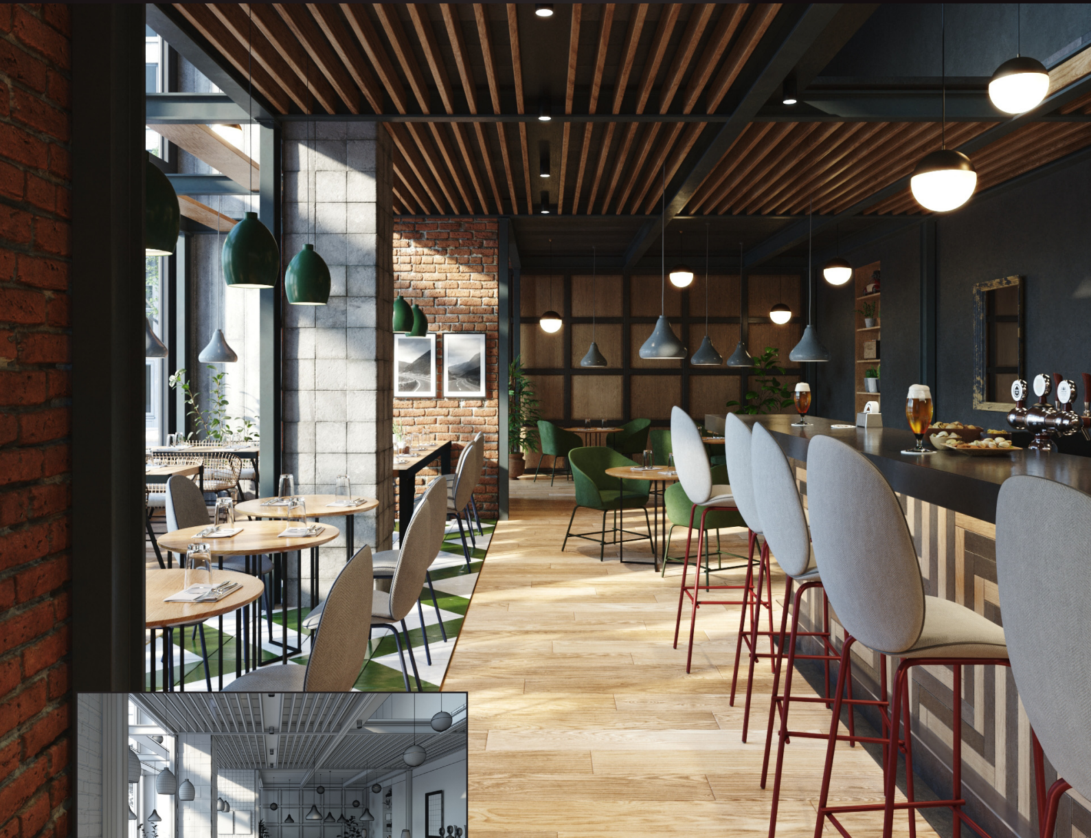
scene 09 cam 01

Have you ever wanted to make professional interior renderings? Do you know how to use V-RaySun, V-RaySky and V-RayPhysicalCamera? Have you ever had problems with composition? Archinteriors will end all your problems. Take a look at this 20 fully textured scenes with professional shaders and lighting ready to render. Get your own portfolio and join cg market.