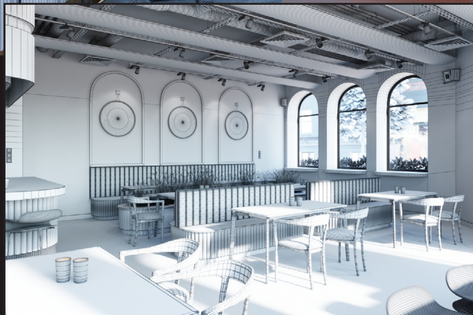
scene 10 cam 02 wire

Software and models © 2020 EVERMOTION. EVERMOTION logo is trademark or registered trademark of Evermotion Inc. in the U.S. and/or other countries. All rights reserved. All *.max, *.obj, *.fbx and bitmaps models included on this collection with data are an integral part of „archinteriors vol. 55” and the resale of this data is strictly prohibited. All models can be used for commercial purposes only by owners who bought this collection. The sharing of collection is strictly prohibited unless that user has written authorization from EVERMOTION.