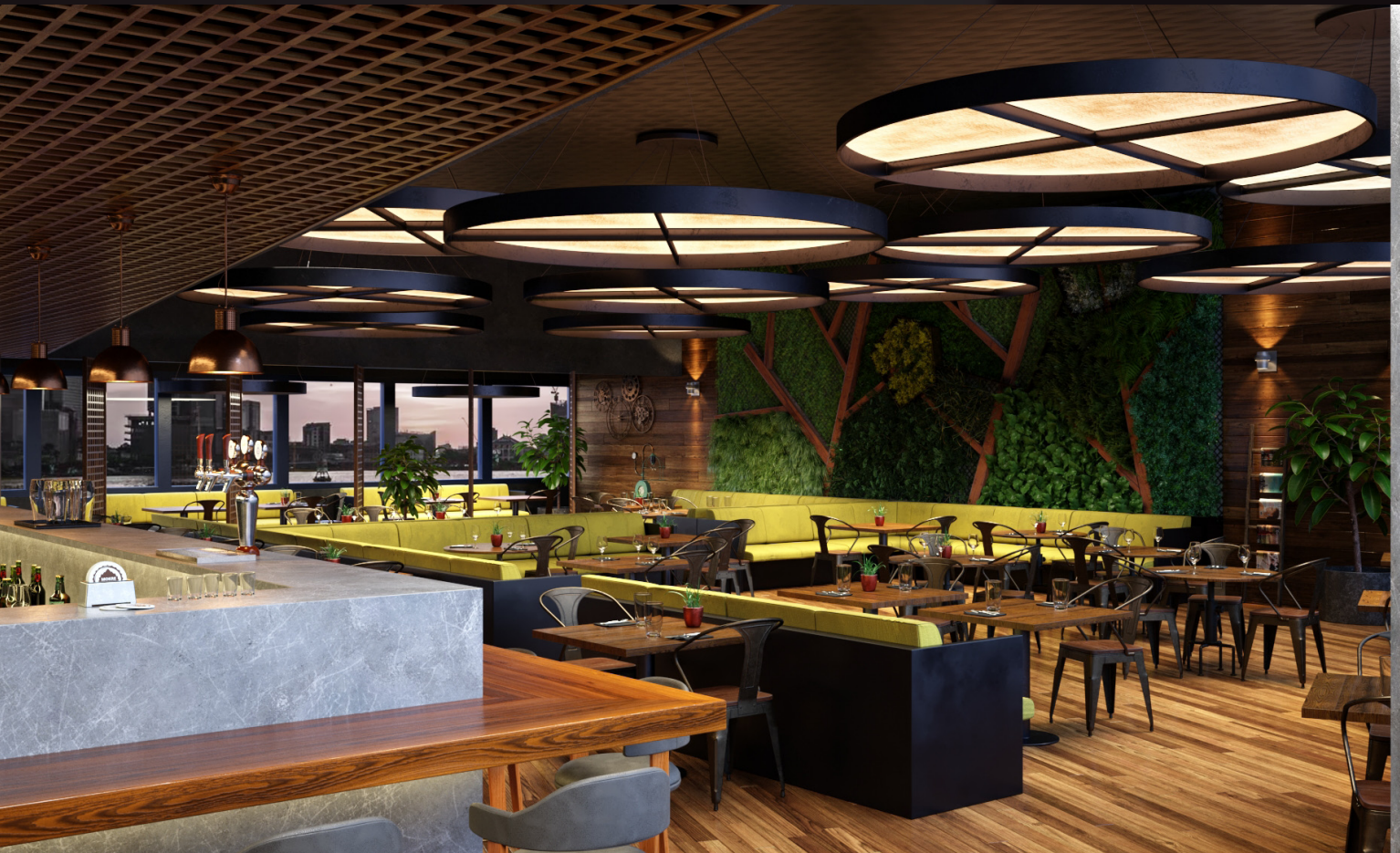
scene 01 cam 02

Have you ever wanted to make professional interior renderings? Do you know how to use V-RaySun, V-RaySky and V-RayPhysicalCamera? Have you ever had problems with composition? Archinteriors will end all your problems. Take a look at this 20 fully textured scenes with professional shaders and lighting ready to render. Get your own portfolio and join cg market.