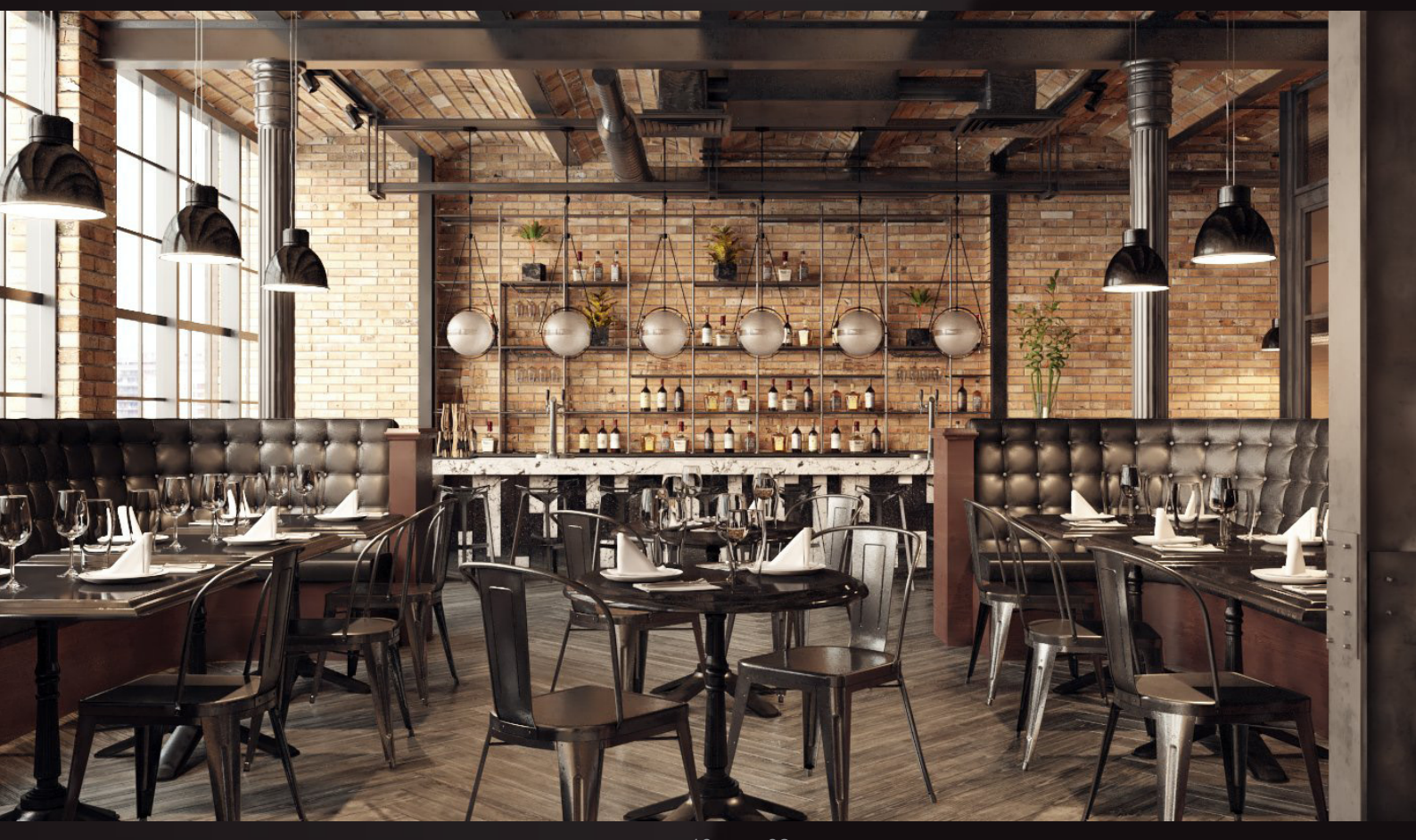
scene 10 cam 02

Have you ever wanted to make professional interior renderings? Do you know how to use VRaySun, VRaySky and VRayPhisicalCamera? Have you ever had problems with composition? Archinteriors will end all your problems. Take a look at this 10 fully textured scenes with professional shaders and lighting ready to render. Get your own portfolio and join cg market.