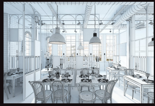
scene 02 cam 01 wire