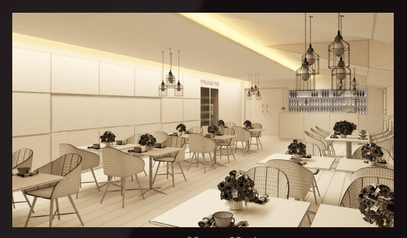
scene 06 cam 02 wire