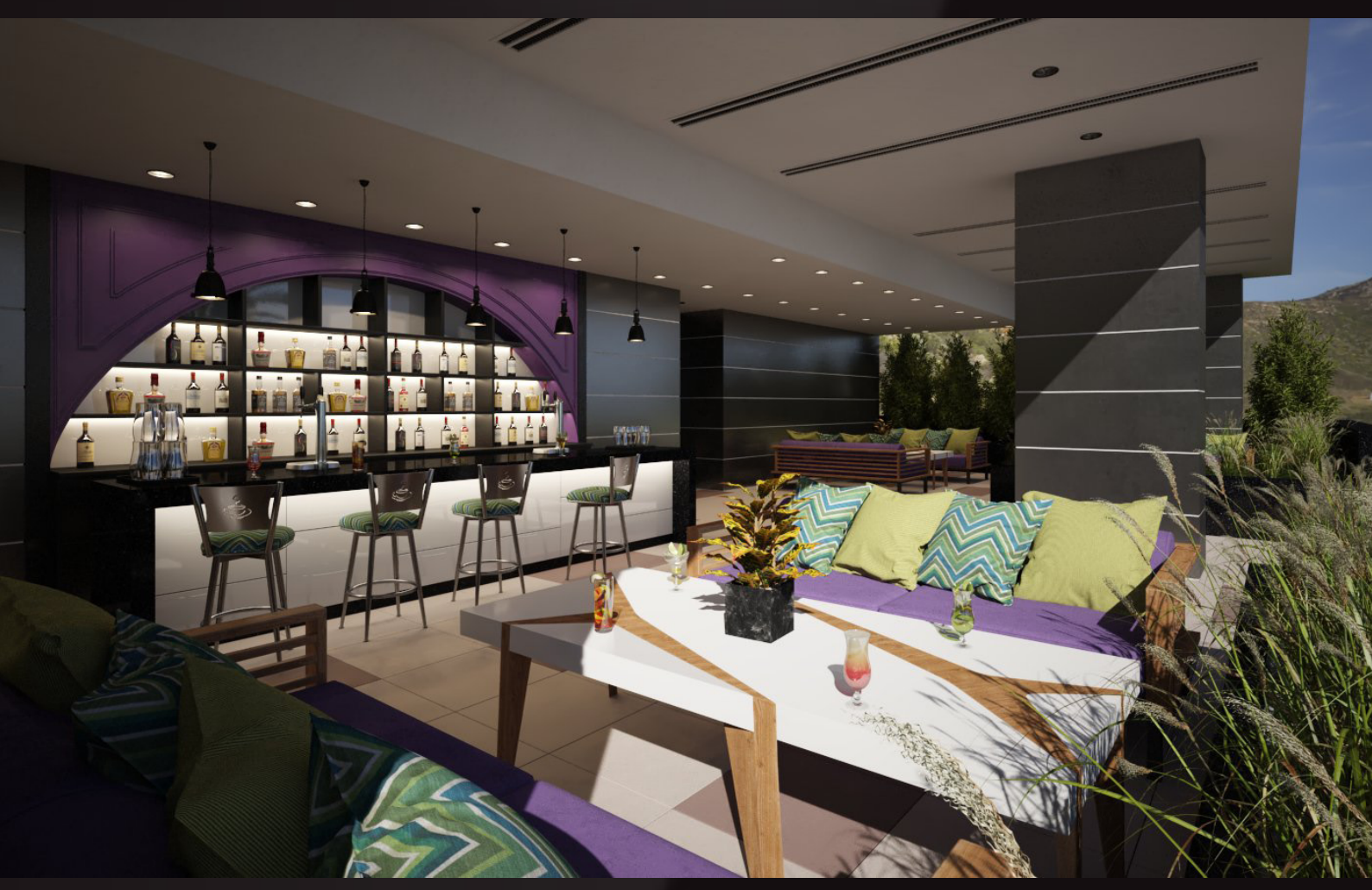
scene 07 cam 01

Have you ever wanted to make professional interior renderings? Do you know how to use VRaySun, VRaySky and VRayPhisicalCamera? Have you ever had problems with composition? Archinteriors will end all your problems. Take a look at this 10 fully textured scenes with professional shaders and lighting ready to render. Get your own portfolio and join cg market.