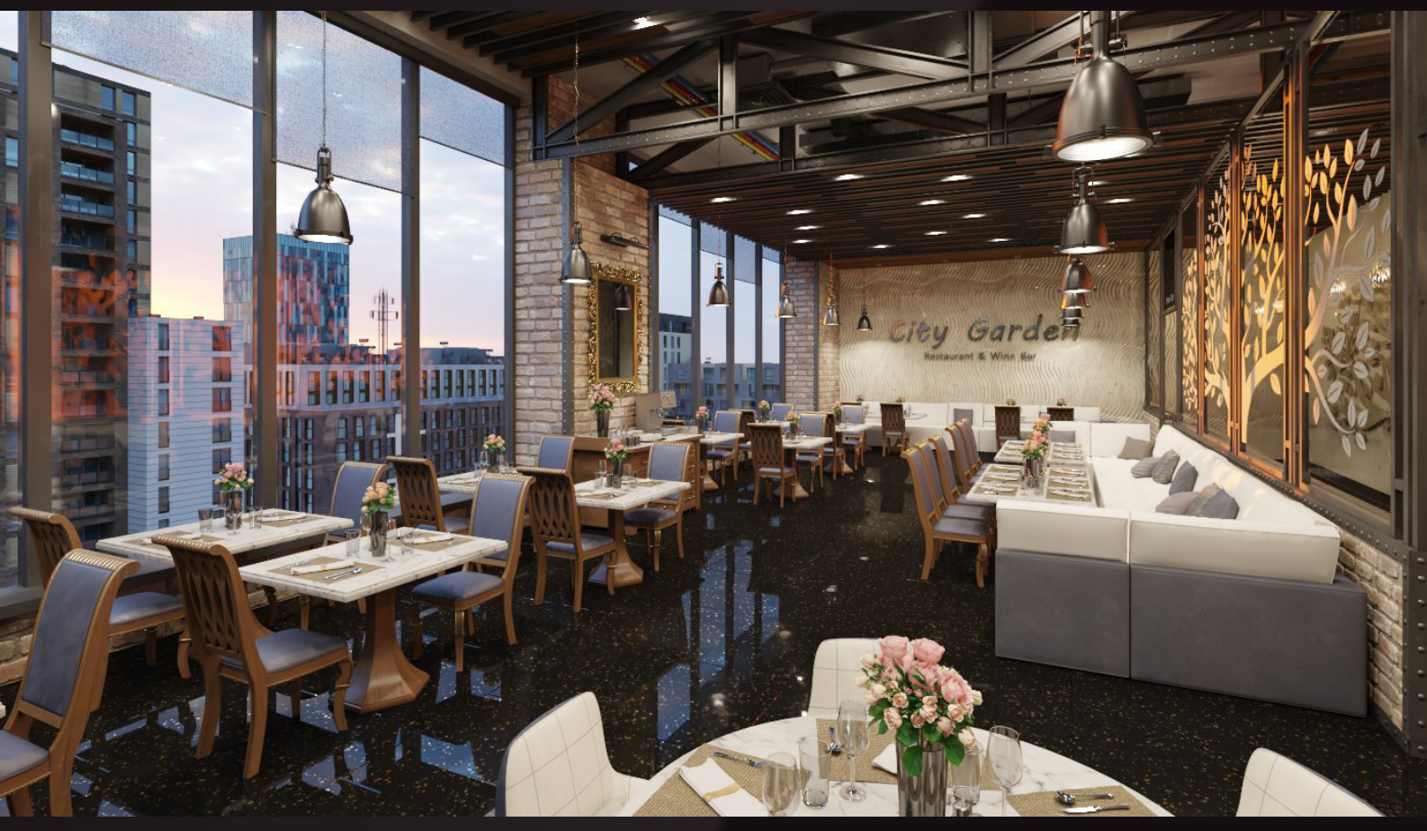
scene 09 cam 02

Have you ever wanted to make professional interior renderings? Do you know how to use VRaySun, VRaySky and VRayPhisicalCamera? Have you ever had problems with composition? Archinteriors will end all your problems. Take a look at this 10 fully textured scenes with professional shaders and lighting ready to render. Get your own portfolio and join cg market.