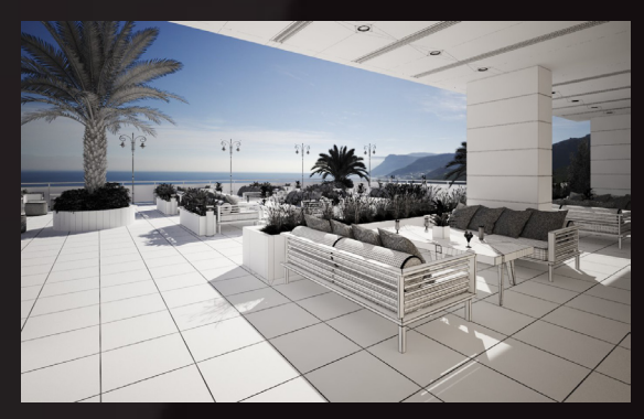
scene 07 cam 02 wire