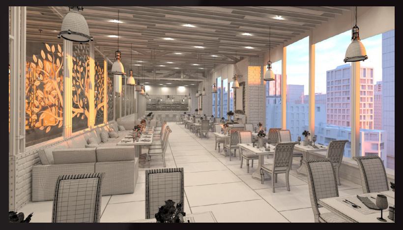
scene 09 cam 01 wire