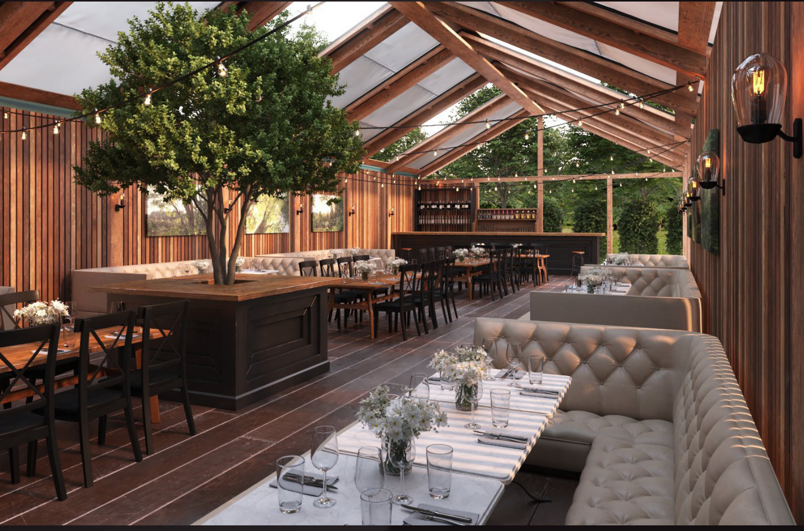
scene 08 cam 01

Have you ever wanted to make professional interior renderings? Do you know how to use VRaySun, VRaySky and VRayPhisicalCamera? Have you ever had problems with composition? Archinteriors will end all your problems. Take a look at this 10 fully textured scenes with professional shaders and lighting ready to render. Get your own portfolio and join cg market.