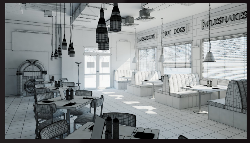
scene 03 cam 01 wire