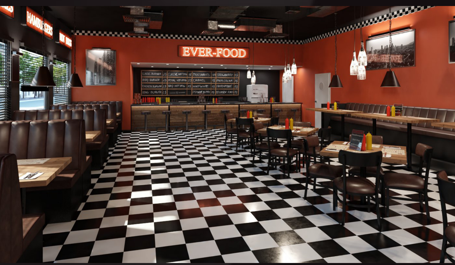
scene 03 cam 02

Have you ever wanted to make professional interior renderings? Do you know how to use VRaySun, VRaySky and VRayPhisicalCamera? Have you ever had problems with composition? Archinteriors will end all your problems. Take a look at this 10 fully textured scenes with professional shaders and lighting ready to render. Get your own portfolio and join cg market.