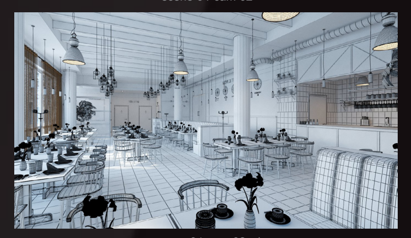
scene 04 cam 02 wire