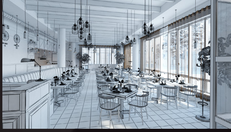
scene 04 cam 01 wire