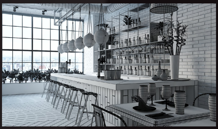
scene 10 cam 01 wire