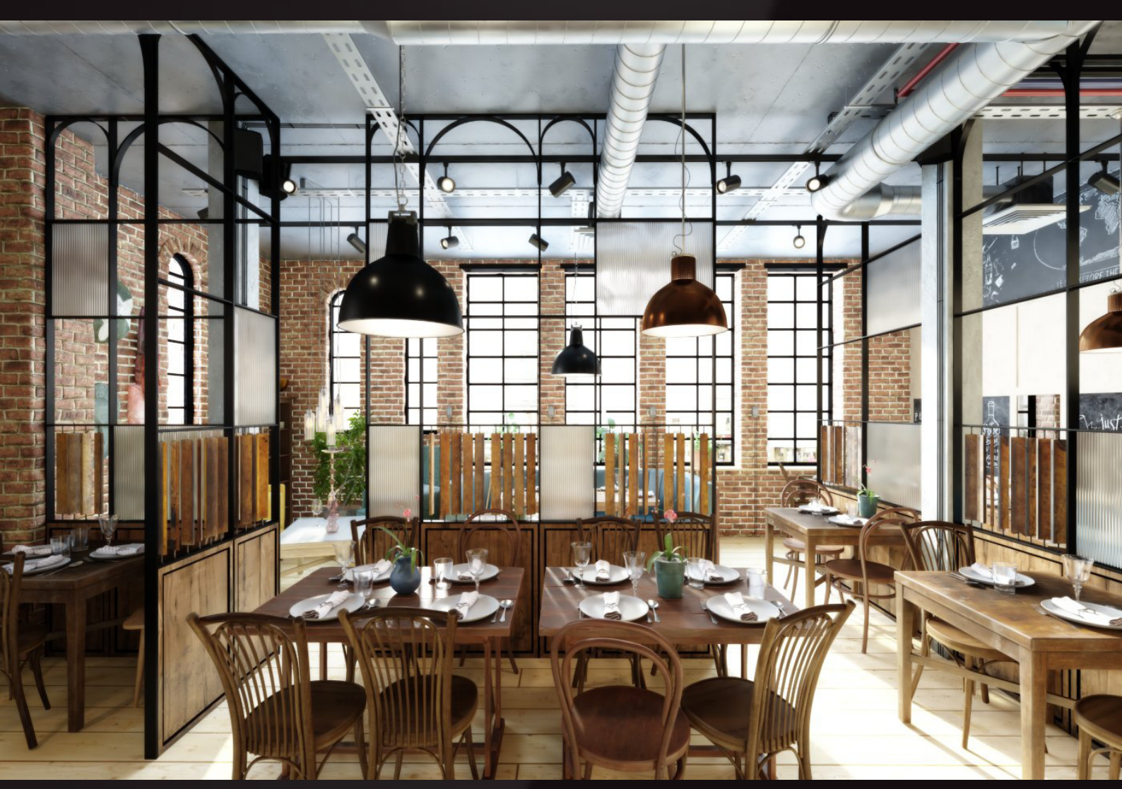
scene 02 cam 01

Have you ever wanted to make professional interior renderings? Do you know how to use VRaySun, VRaySky and VRayPhisicalCamera? Have you ever had problems with composition? Archinteriors will end all your problems. Take a look at this 10 fully textured scenes with professional shaders and lighting ready to render. Get your own portfolio and join cg market.