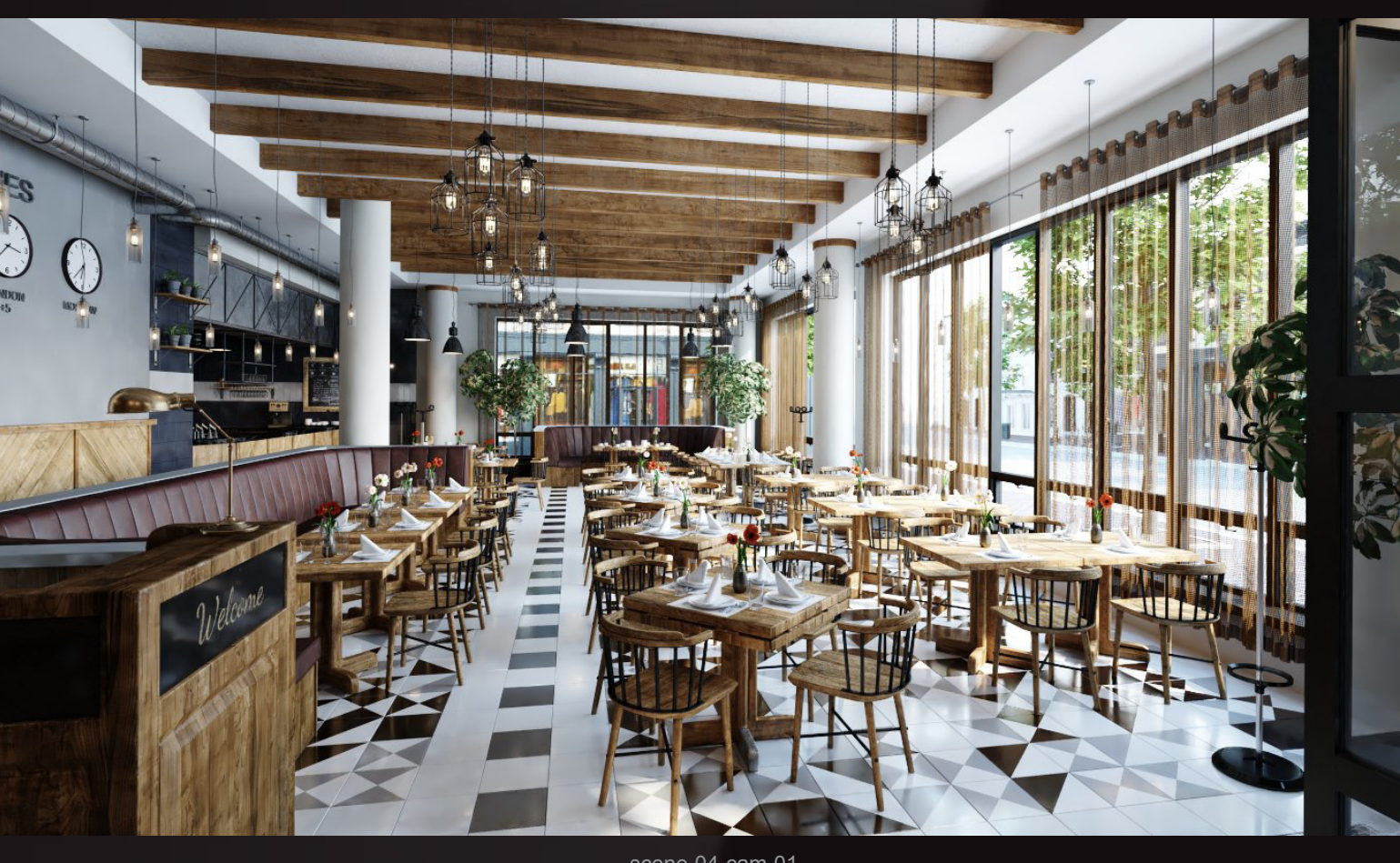
scene 04 cam 01

Have you ever wanted to make professional interior renderings? Do you know how to use VRaySun, VRaySky and VRayPhisicalCamera? Have you ever had problems with composition? Archinteriors will end all your problems. Take a look at this 10 fully textured scenes with professional shaders and lighting ready to render. Get your own portfolio and join cg market.