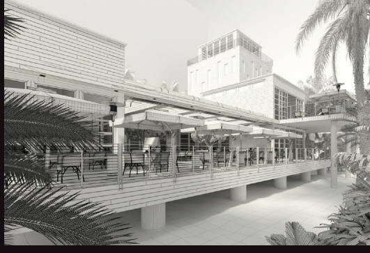
scene 05 cam 02 wire