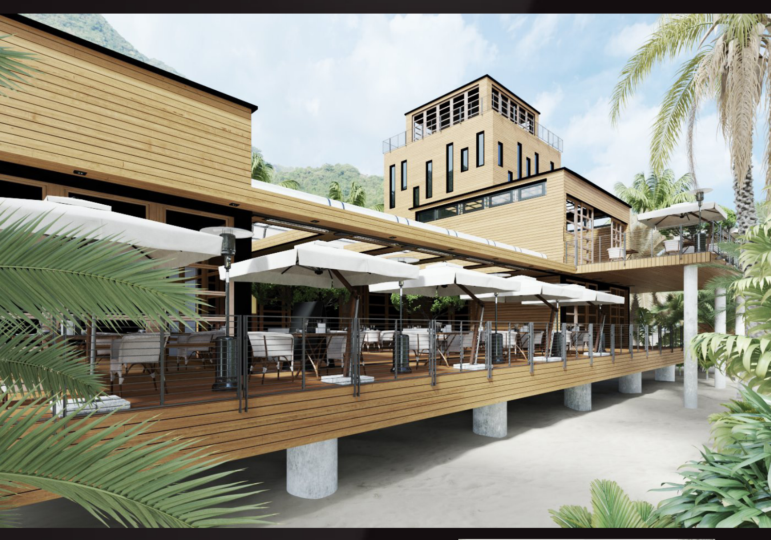
scene 05 cam 02

Have you ever wanted to make professional interior renderings? Do you know how to use VRaySun, VRaySky and VRayPhisicalCamera? Have you ever had problems with composition? Archinteriors will end all your problems. Take a look at this 10 fully textured scenes with professional shaders and lighting ready to render. Get your own portfolio and join cg market.