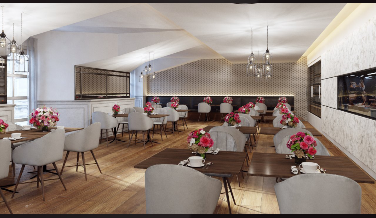
scene 06 cam 01

Have you ever wanted to make professional interior renderings? Do you know how to use VRaySun, VRaySky and VRayPhisicalCamera? Have you ever had problems with composition? Archinteriors will end all your problems. Take a look at this 10 fully textured scenes with professional shaders and lighting ready to render. Get your own portfolio and join cg market.