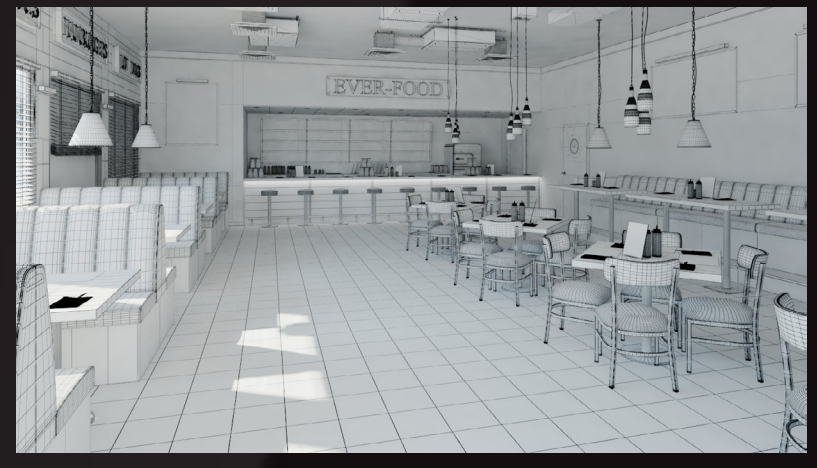
scene 03 cam 02 wire