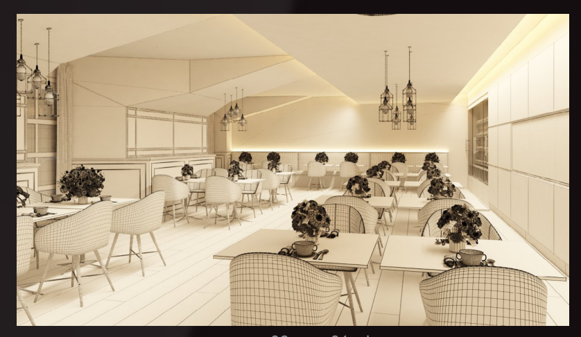
scene 06 cam 01 wire