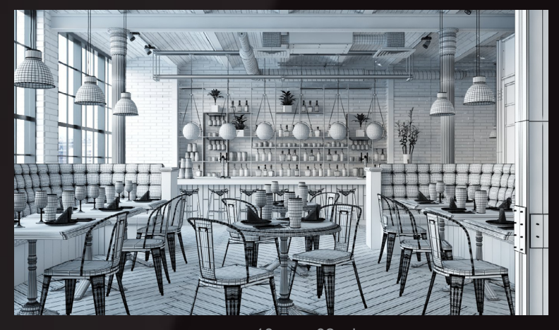
scene 10 cam 02 wire