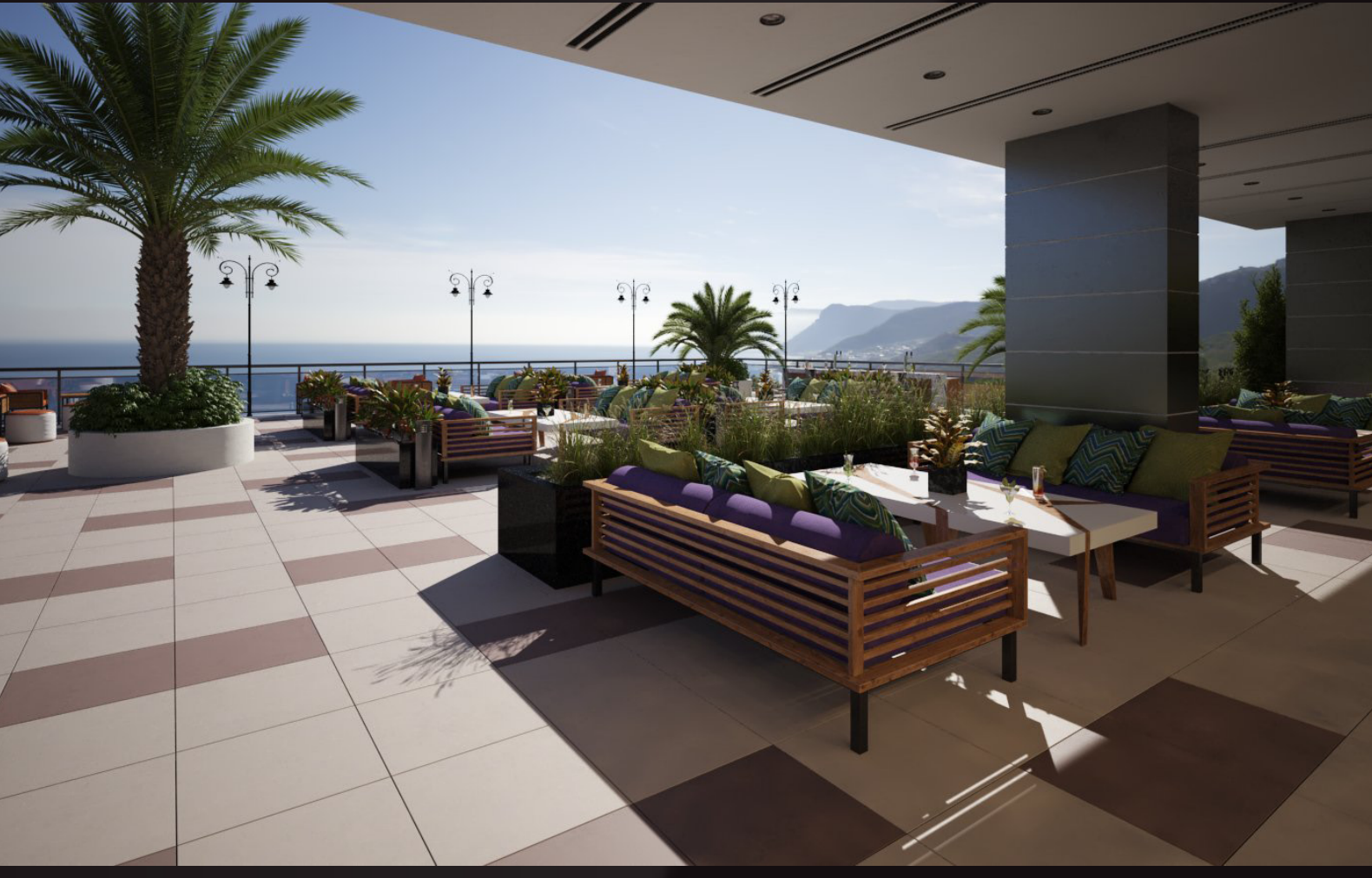
scene 07 cam 02

Have you ever wanted to make professional interior renderings? Do you know how to use VRaySun, VRaySky and VRayPhisicalCamera? Have you ever had problems with composition? Archinteriors will end all your problems. Take a look at this 10 fully textured scenes with professional shaders and lighting ready to render. Get your own portfolio and join cg market.