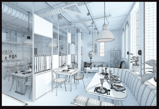
scene 02 cam 02 wire