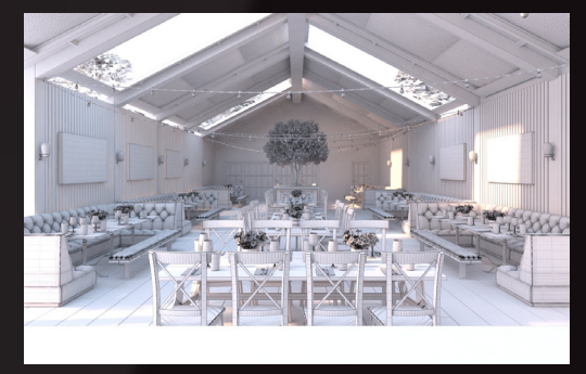
scene 08 cam 02 wire