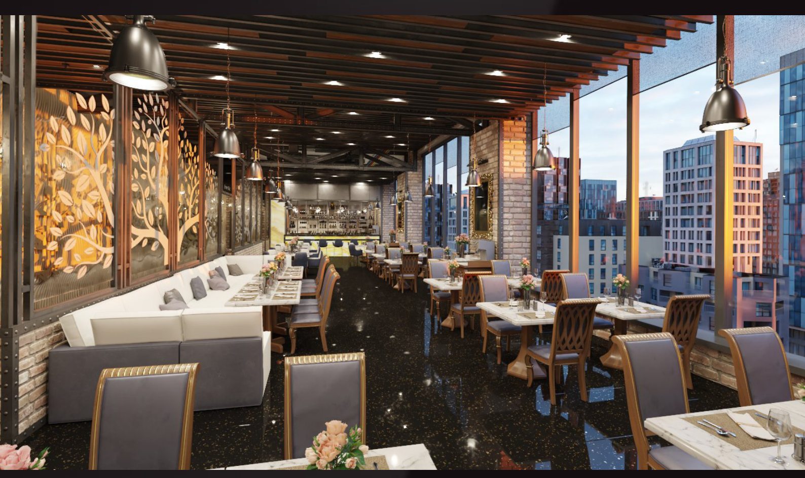
scene 09 cam 01

Have you ever wanted to make professional interior renderings? Do you know how to use VRaySun, VRaySky and VRayPhisicalCamera? Have you ever had problems with composition? Archinteriors will end all your problems. Take a look at this 10 fully textured scenes with professional shaders and lighting ready to render. Get your own portfolio and join cg market.