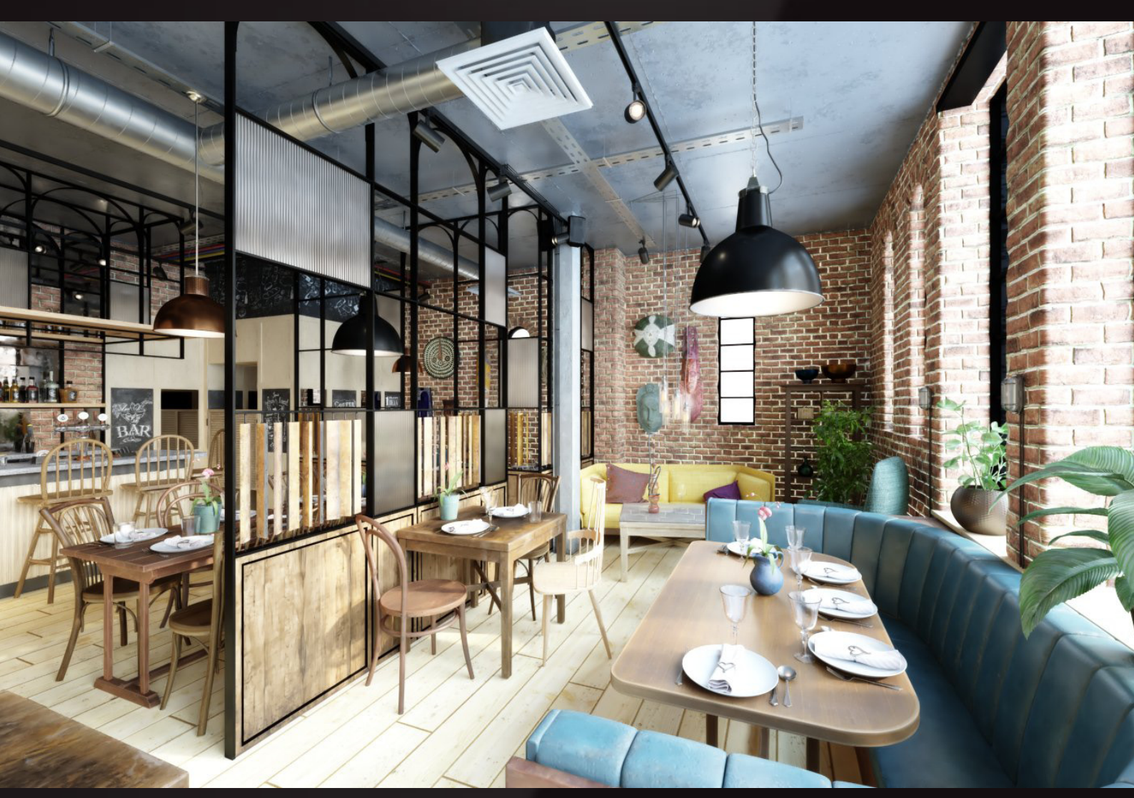
scene 02 cam 02

Have you ever wanted to make professional interior renderings? Do you know how to use VRaySun, VRaySky and VRayPhisicalCamera? Have you ever had problems with composition? Archinteriors will end all your problems. Take a look at this 10 fully textured scenes with professional shaders and lighting ready to render. Get your own portfolio and join cg market.