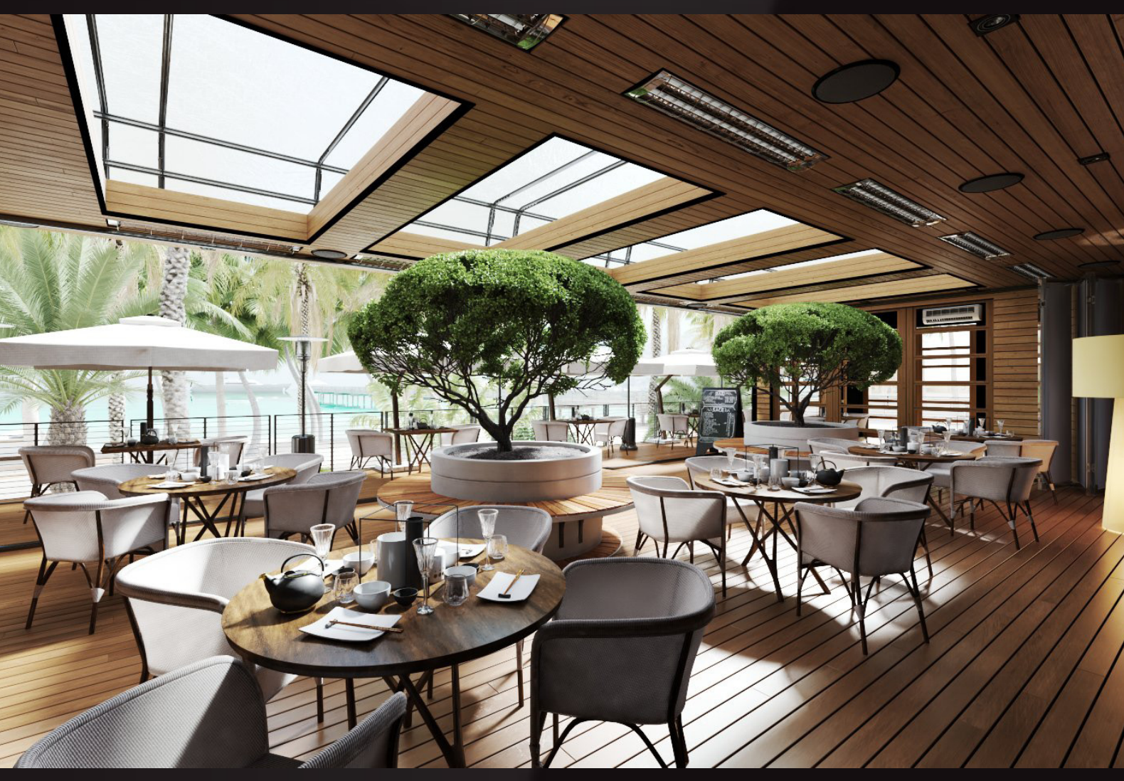
scene 05 cam 01

Have you ever wanted to make professional interior renderings? Do you know how to use VRaySun, VRaySky and VRayPhisicalCamera? Have you ever had problems with composition? Archinteriors will end all your problems. Take a look at this 10 fully textured scenes with professional shaders and lighting ready to render. Get your own portfolio and join cg market.