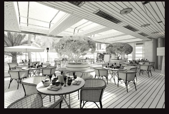
scene 05 cam 01 wire