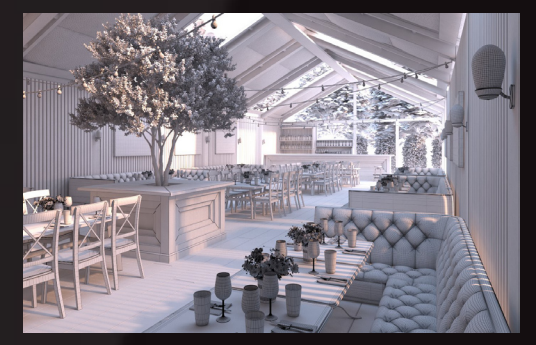
scene 08 cam 01 wire