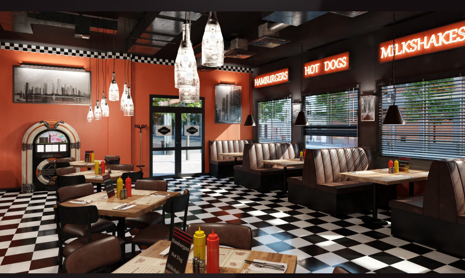
scene 03 cam 01

Have you ever wanted to make professional interior renderings? Do you know how to use VRaySun, VRaySky and VRayPhisicalCamera? Have you ever had problems with composition? Archinteriors will end all your problems. Take a look at this 10 fully textured scenes with professional shaders and lighting ready to render. Get your own portfolio and join cg market.