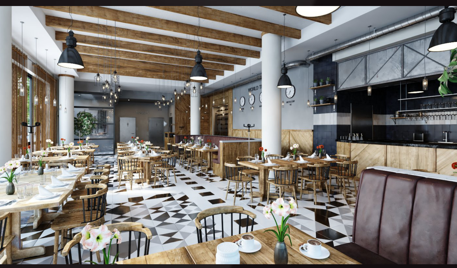
scene 04 cam 02

Have you ever wanted to make professional interior renderings? Do you know how to use VRaySun, VRaySky and VRayPhisicalCamera? Have you ever had problems with composition? Archinteriors will end all your problems. Take a look at this 10 fully textured scenes with professional shaders and lighting ready to render. Get your own portfolio and join cg market.