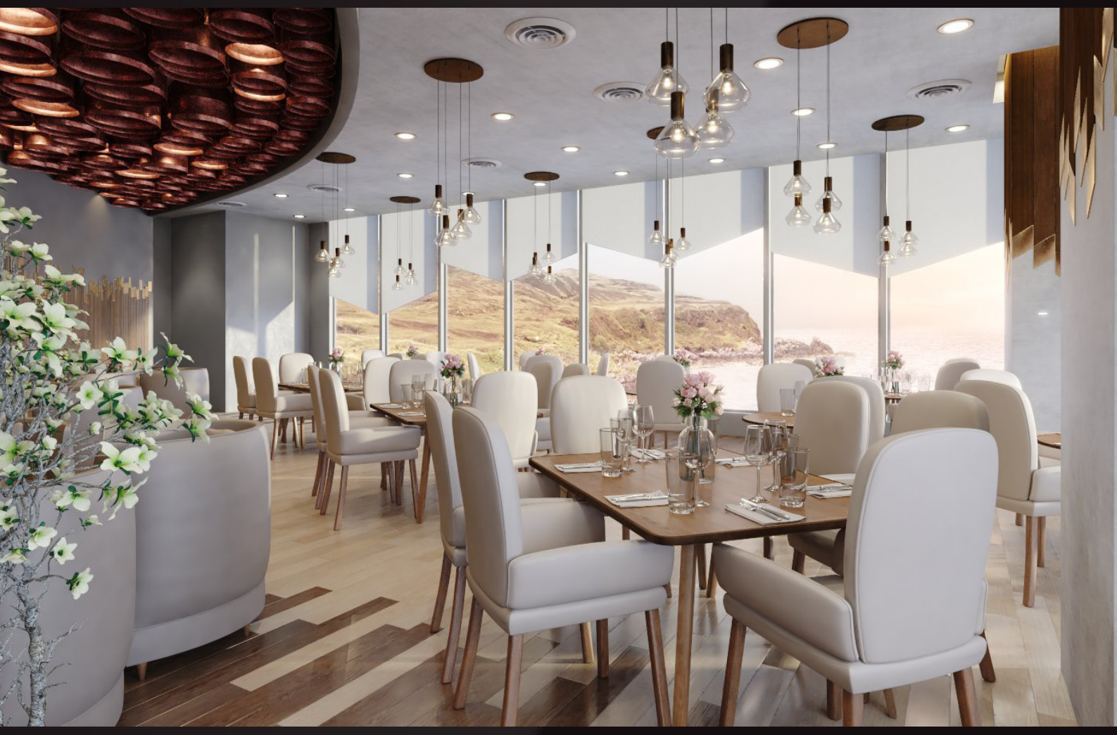
scene 01 cam 02

Have you ever wanted to make professional interior renderings? Do you know how to use VRaySun, VRaySky and VRayPhisicalCamera? Have you ever had problems with composition? Archinteriors will end all your problems. Take a look at this 10 fully textured scenes with professional shaders and lighting ready to render. Get your own portfolio and join cg market.