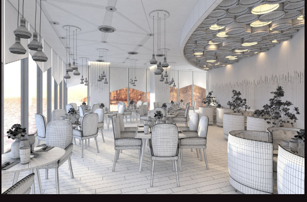
scene 01 cam 01 wire