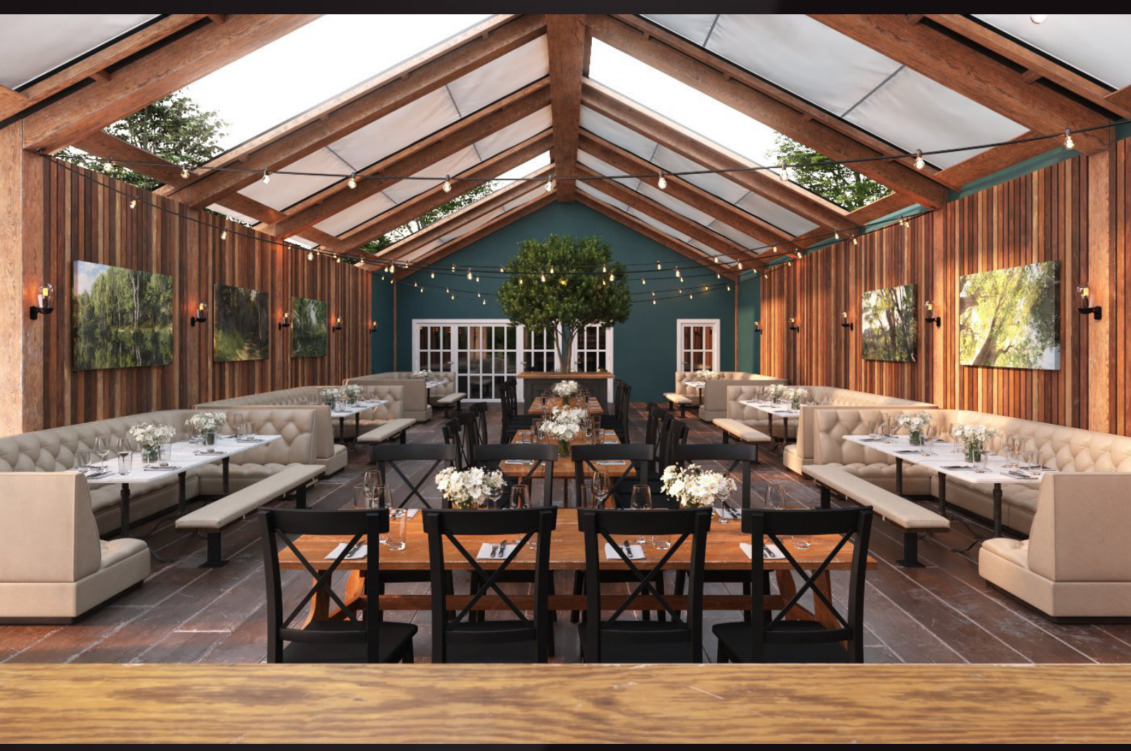
scene 08 cam 02

Have you ever wanted to make professional interior renderings? Do you know how to use VRaySun, VRaySky and VRayPhisicalCamera? Have you ever had problems with composition? Archinteriors will end all your problems. Take a look at this 10 fully textured scenes with professional shaders and lighting ready to render. Get your own portfolio and join cg market.