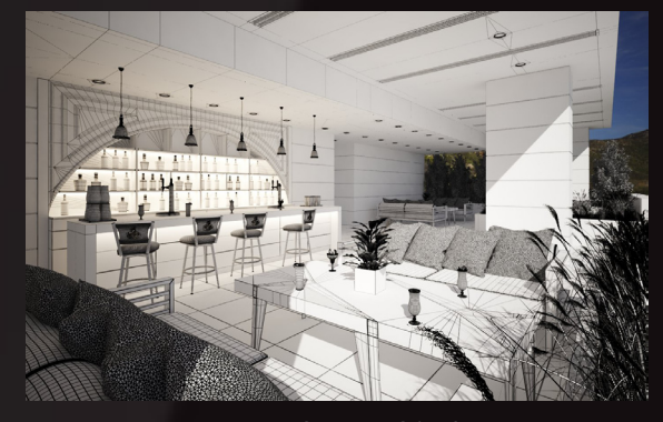
scene 07 cam 01 wire