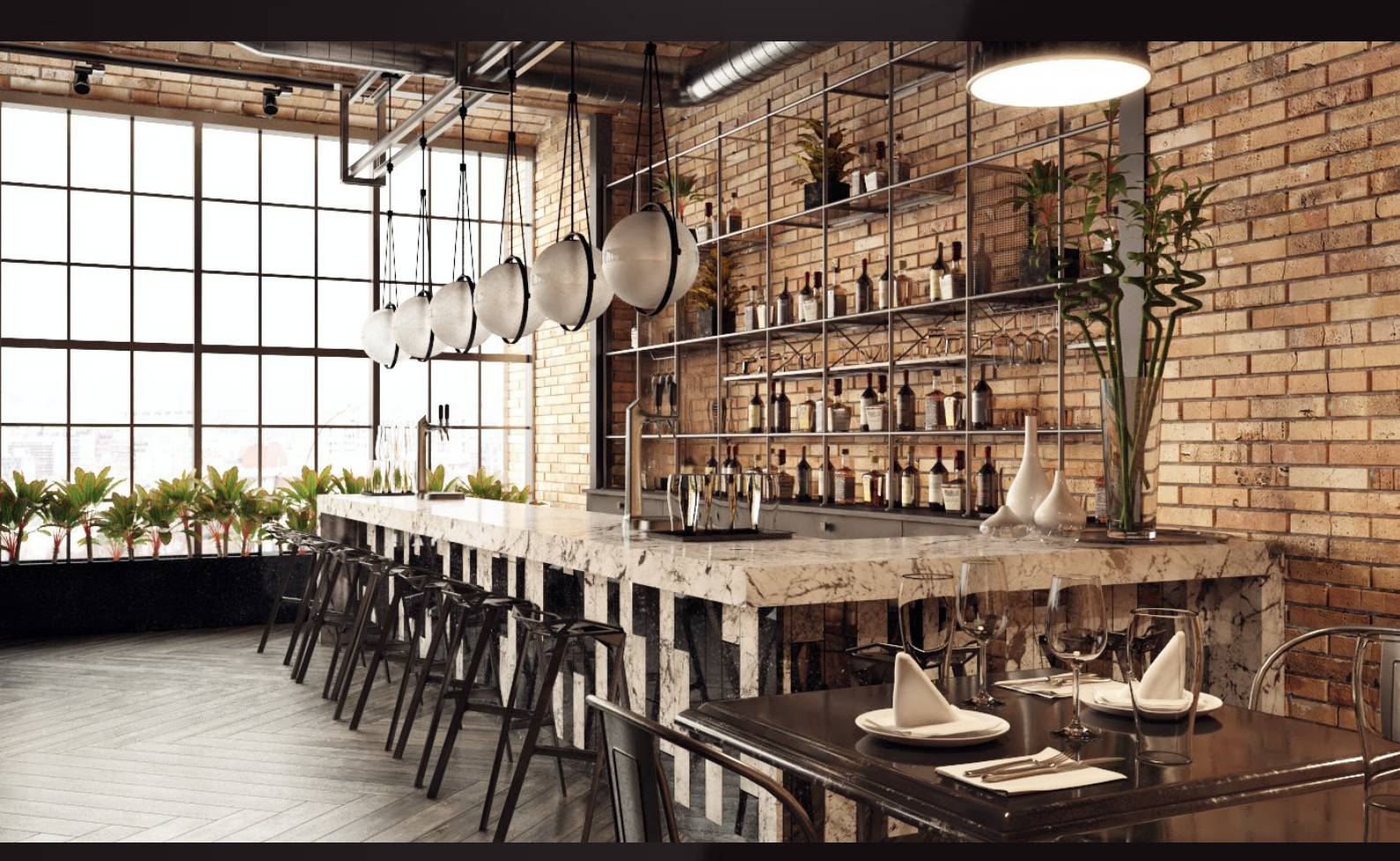
scene 10 cam 01

Have you ever wanted to make professional interior renderings? Do you know how to use VRaySun, VRaySky and VRayPhisicalCamera? Have you ever had problems with composition? Archinteriors will end all your problems. Take a look at this 10 fully textured scenes with professional shaders and lighting ready to render. Get your own portfolio and join cg market.