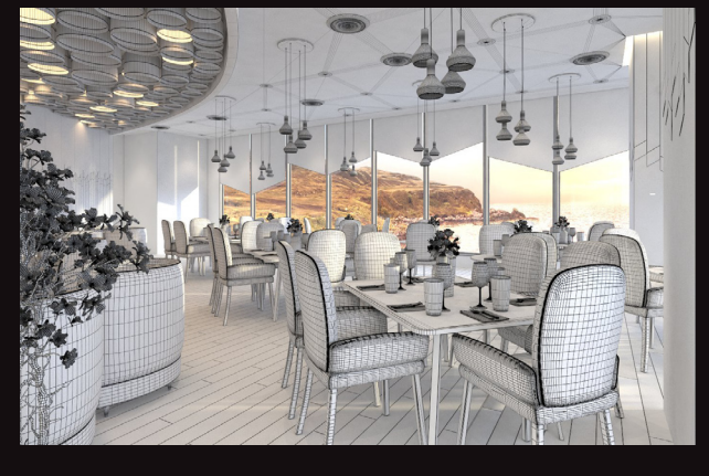
scene 01 cam 02 wire