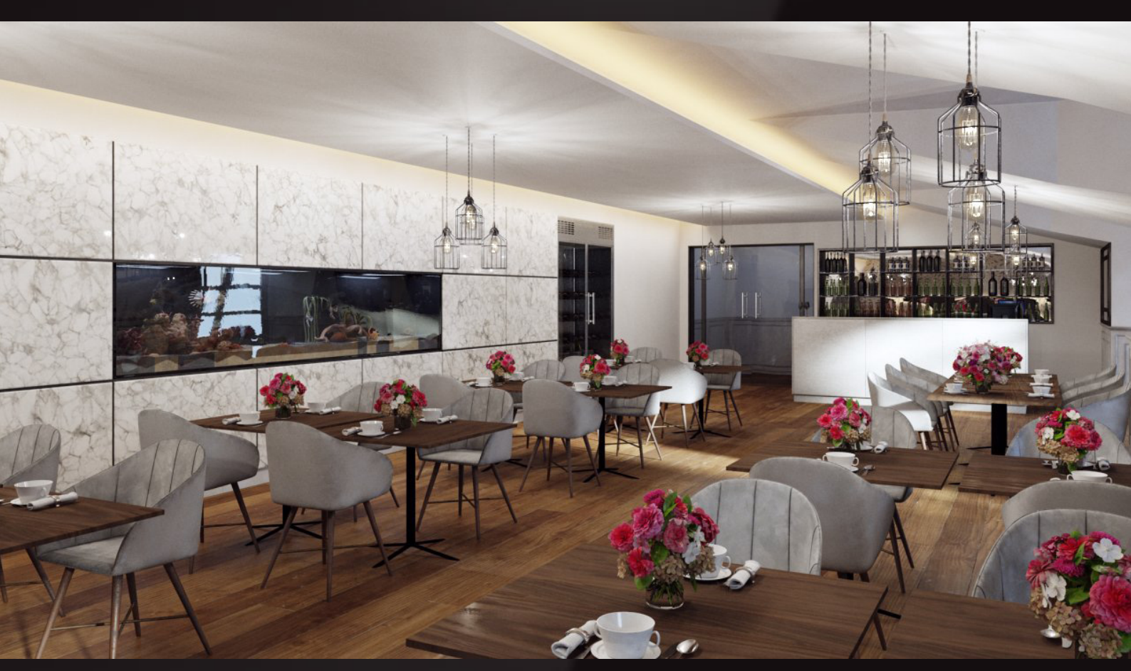
scene 06 cam 02

Have you ever wanted to make professional interior renderings? Do you know how to use VRaySun, VRaySky and VRayPhisicalCamera? Have you ever had problems with composition? Archinteriors will end all your problems. Take a look at this 10 fully textured scenes with professional shaders and lighting ready to render. Get your own portfolio and join cg market.