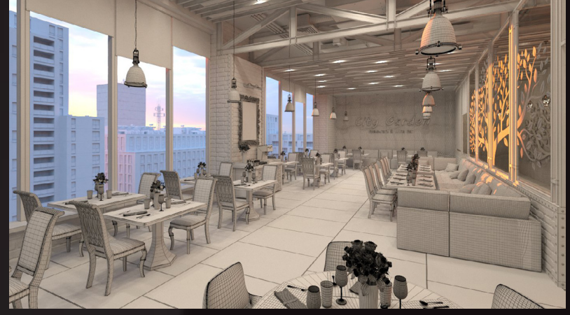
scene 09 cam 02 wire