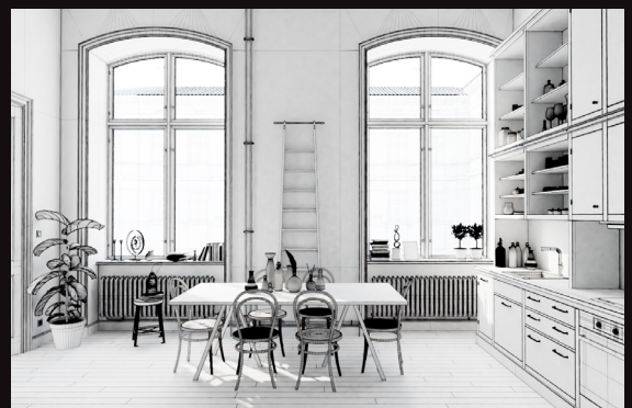
scene 07 wire

Software and models © 2018 EVERMOTION. EVERMOTION logo is trademark or registered trademark of Evermotion Inc. in the U.S. and/or other countries. All rights reserved. All *.blend and bitmaps models included on this collection with data are an integral part of „archinteriors vol.48 for blender” and the resale of this data is strictly prohibited. All models can be used for commercial purposes only by owners who bought this collection. The sharing of collection data is strictly prohibited unless that user has written authorizati on from EVERMOTION.