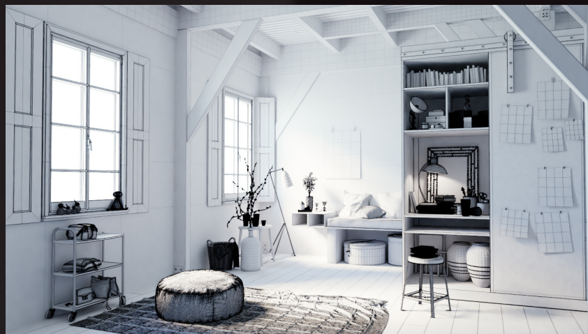
scene 08 wire

Software and models © 2018 EVERMOTION. EVERMOTION logo is trademark or registered trademark of Evermotion Inc. in the U.S. and/or other countries. All rights reserved. All *.blend and bitmaps models included on this collection with data are an integral part of „archinteriors vol.48 for blender” and the resale of this data is strictly prohibited. All models can be used for commercial purposes only by owners who bought this collection. The sharing of collection data is strictly prohibited unless that user has written authorizati on from EVERMOTION.