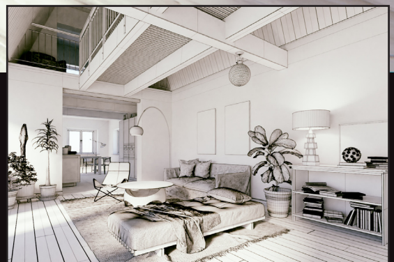
scene 05 wire

Software and models © 2018 EVERMOTION. EVERMOTION logo is trademark or registered trademark of Evermotion Inc. in the U.S. and/or other countries. All rights reserved. All *.blend and bitmaps models included on this collection with data are an integral part of „archinteriors vol.48 for blender” and the resale of this data is strictly prohibited. All models can be used for commercial purposes only by owners who bought this collection. The sharing of collection data is strictly prohibited unless that user has written authorizati on from EVERMOTION.