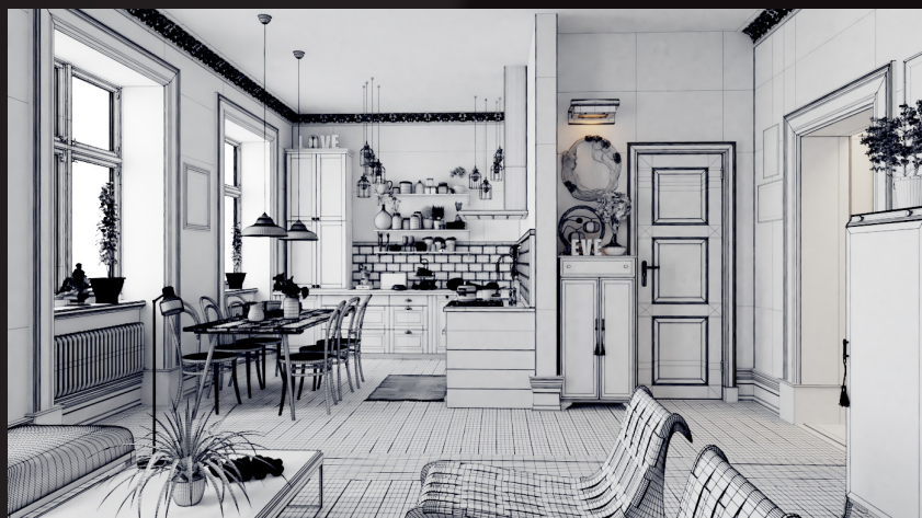
scene 06 wire

Software and models © 2018 EVERMOTION. EVERMOTION logo is trademark or registered trademark of Evermotion Inc. in the U.S. and/or other countries. All rights reserved. All *.blend and bitmaps models included on this collection with data are an integral part of „archinteriors vol.48 for blender” and the resale of this data is strictly prohibited. All models can be used for commercial purposes only by owners who bought this collection. The sharing of collection data is strictly prohibited unless that user has written authorizati on from EVERMOTION.