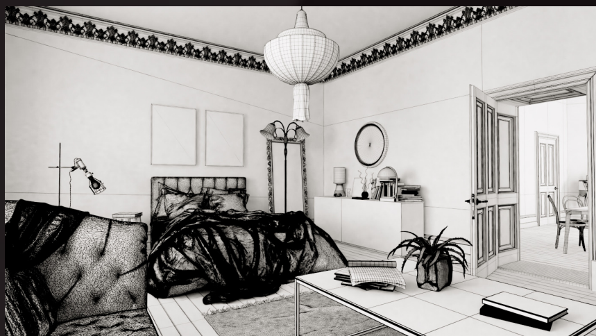
scene 09 wire

Software and models © 2018 EVERMOTION. EVERMOTION logo is trademark or registered trademark of Evermotion Inc. in the U.S. and/or other countries. All rights reserved. All *.blend and bitmaps models included on this collection with data are an integral part of „archinteriors vol.48 for blender” and the resale of this data is strictly prohibited. All models can be used for commercial purposes only by owners who bought this collection. The sharing of collection data is strictly prohibited unless that user has written authorization from EVERMOTION.