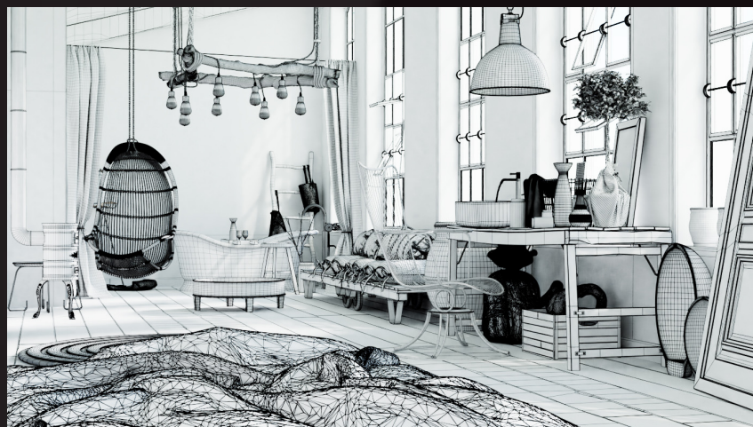
scene 04 wire

Software and models © 2018 EVERMOTION. EVERMOTION logo is trademark or registered trademark of Evermotion Inc. in the U.S. and/or other countries. All rights reserved. All *.blend and bitmaps models included on this collection with data are an integral part of „archinteriors vol.48 for blender” and the resale of this data is strictly prohibited. All models can be used for commercial purposes only by owners who bought this collection. The sharing of collection data is strictly prohibited unless that user has written authorizati on from EVERMOTION.