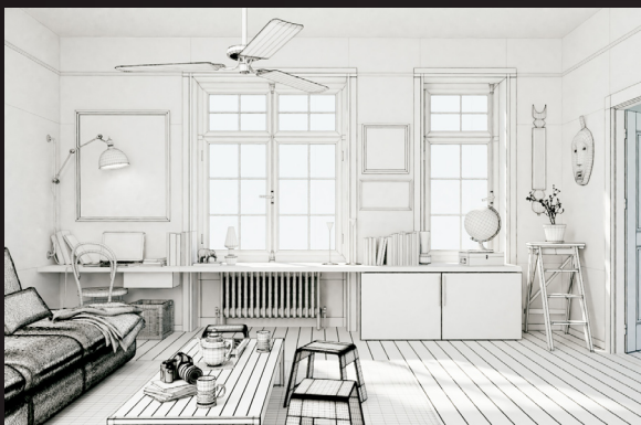
scene 10 wire

Software and models © 2018 EVERMOTION. EVERMOTION logo is trademark or registered trademark of Evermotion Inc. in the U.S. and/or other countries. All rights reserved. All *.blend and bitmaps models included on this collection with data are an integral part of „archinteriors vol.48 for blender” and the resale of this data is strictly prohibited. All models can be used for commercial purposes only by owners who bought this collection. The sharing of collection data is strictly prohibited unless that user has written authorizati on from EVERMOTION.