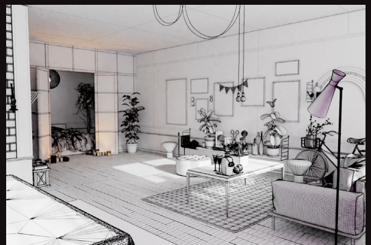
scene 03 wire

Software and models © 2018 EVERMOTION. EVERMOTION logo is trademark or registered trademark of Evermotion Inc. in the U.S. and/or other countries. All rights reserved. All *.blend and bitmaps models included on this collection with data are an integral part of „archinteriors vol.48 for blender” and the resale of this data is strictly prohibited. All models can be used for commercial purposes only by owners who bought this collection. The sharing of collection data is strictly prohibited unless that user has written authorizati on from EVERMOTION.