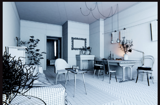
scene 02 wire

Software and models © 2018 EVERMOTION. EVERMOTION logo is trademark or registered trademark of Evermotion Inc. in the U.S. and/or other countries. All rights reserved. All *.blend and bitmaps models included on this collection with data are an integral part of „archinteriors vol.48 for blender” and the resale of this data is strictly prohibited. All models can be used for commercial purposes only by owners who bought this collection. The sharing of collection data is strictly prohibited unless that user has written authorization from EVERMOTION.