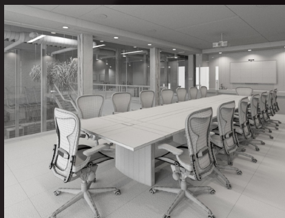
scene 09 wire

Software and models © 2019 EVERMOTION. EVERMOTION logo is trademark or registered trademark of Evermotion Inc. in the U.S. and/or other countries. All rights reserved. All *.c4d and bitmaps models included on this collection with data are an integral part of „archinteriors vol.47 C4D” and the resale of this data is strictly prohibited. All models can be used for commercial purposes only by owners who bought this collection. The sharing of collection is strictly prohibited unless that user has written authorization from EVERMOTION.