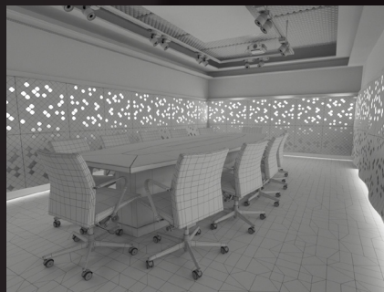
scene 04 wire

Software and models © 2019 EVERMOTION. EVERMOTION logo is trademark or registered trademark of Evermotion Inc. in the U.S. and/or other countries. All rights reserved. All *.c4d and bitmaps models included on this collection with data are an integral part of „archinteriors vol.47 C4D” and the resale of this data is strictly prohibited. All models can be used for commercial purposes only by owners who bought this collection. The sharing of collection is strictly prohibited unless that user has written authorization from EVERMOTION.