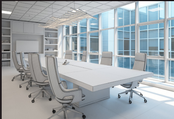
scene 10 wire

Software and models © 2019 EVERMOTION. EVERMOTION logo is trademark or registered trademark of Evermotion Inc. in the U.S. and/or other countries. All rights reserved. All *.c4d and bitmaps models included on this collection with data are an integral part of „archinteriors vol.47 C4D” and the resale of this data is strictly prohibited. All models can be used for commercial purposes only by owners who bought this collection. The sharing of collection is strictly prohibited unless that user has written authorization from EVERMOTION.