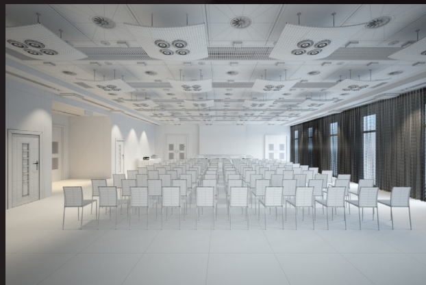
scene 08 wire

Software and models © 2019 EVERMOTION. EVERMOTION logo is trademark or registered trademark of Evermotion Inc. in the U.S. and/or other countries. All rights reserved. All *.c4d and bitmaps models included on this collection with data are an integral part of „archinteriors vol.47 C4D” and the resale of this data is strictly prohibited. All models can be used for commercial purposes only by owners who bought this collection. The sharing of collection is strictly prohibited unless that user has written authorization from EVERMOTION.