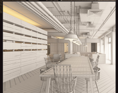
scene 01 wire

Software and models © 2019 EVERMOTION. EVERMOTION logo is trademark or registered trademark of Evermotion Inc. in the U.S. and/or other countries. All rights reserved. All *.c4d and bitmaps models included on this collection with data are an integral part of „archinteriors vol.47 C4D” and the resale of this data is strictly prohibited. All models can be used for commercial purposes only by owners who bought this collection. The sharing of collection is strictly prohibited unless that user has written authorization from EVERMOTION.