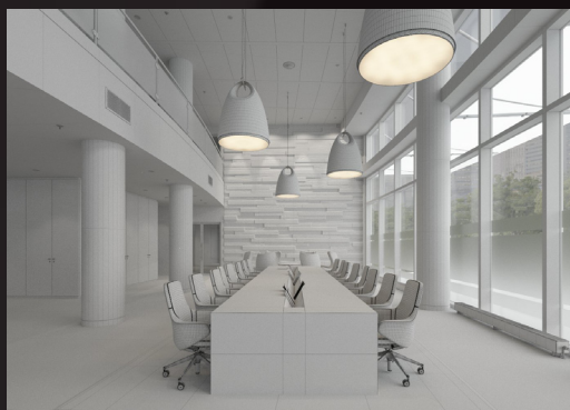
scene 03 wire

Software and models © 2019 EVERMOTION. EVERMOTION logo is trademark or registered trademark of Evermotion Inc. in the U.S. and/or other countries. All rights reserved. All *.c4d and bitmaps models included on this collection with data are an integral part of „archinteriors vol.47 C4D” and the resale of this data is strictly prohibited. All models can be used for commercial purposes only by owners who bought this collection. The sharing of collection is strictly prohibited unless that user has written authorization from EVERMOTION.