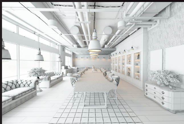
scene 05 wire

Software and models © 2019 EVERMOTION. EVERMOTION logo is trademark or registered trademark of Evermotion Inc. in the U.S. and/or other countries. All rights reserved. All *.c4d and bitmaps models included on this collection with data are an integral part of „archinteriors vol.47 C4D” and the resale of this data is strictly prohibited. All models can be used for commercial purposes only by owners who bought this collection. The sharing of collection is strictly prohibited unless that user has written authorization from EVERMOTION.