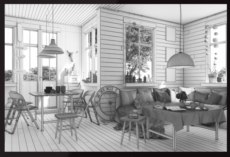
scene 2 - wire