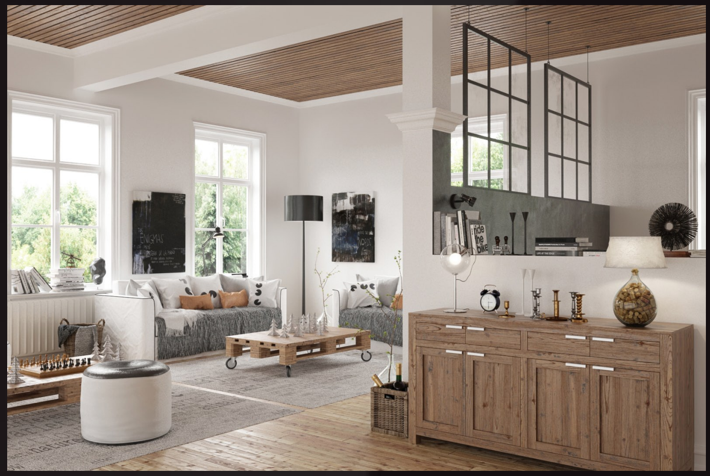
scene 7 - ps postproduction

Have you ever wanted to make professional exterior renderings? Do you know how to use VRaySun, VRaySky and VRayPhisicalCamera? Have you ever had problems with composition? Archinteriors will end all your problems. Take a look at this 10 fully textured scenes with professional shaders and lighting ready to render. Get your own portfolio and join cg market.