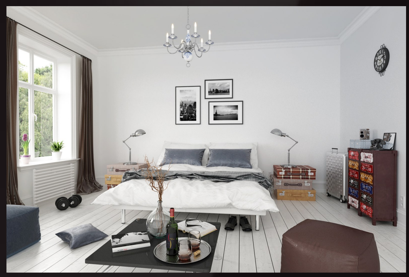
scene 5 - ps postproduction

Have you ever wanted to make professional exterior renderings? Do you know how to use VRaySun, VRaySky and VRayPhisicalCamera? Have you ever had problems with composition? Archinteriors will end all your problems. Take a look at this 10 fully textured scenes with professional shaders and lighting ready to render. Get your own portfolio and join cg market.