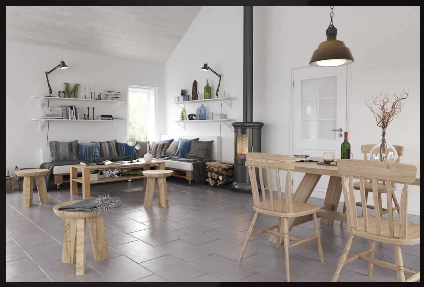
scene 9 - ps postproduction

Have you ever wanted to make professional exterior renderings? Do you know how to use VRaySun, VRaySky and VRayPhisicalCamera? Have you ever had problems with composition? Archinteriors will end all your problems. Take a look at this 10 fully textured scenes with professional shaders and lighting ready to render. Get your own portfolio and join cg market.