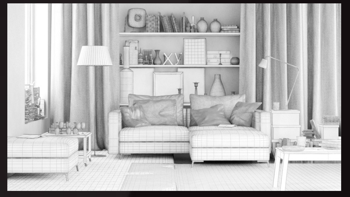
scene 6 - wire