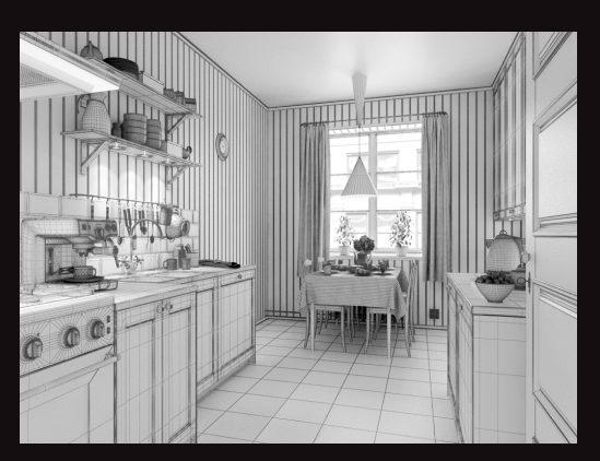
scene 1 - wire