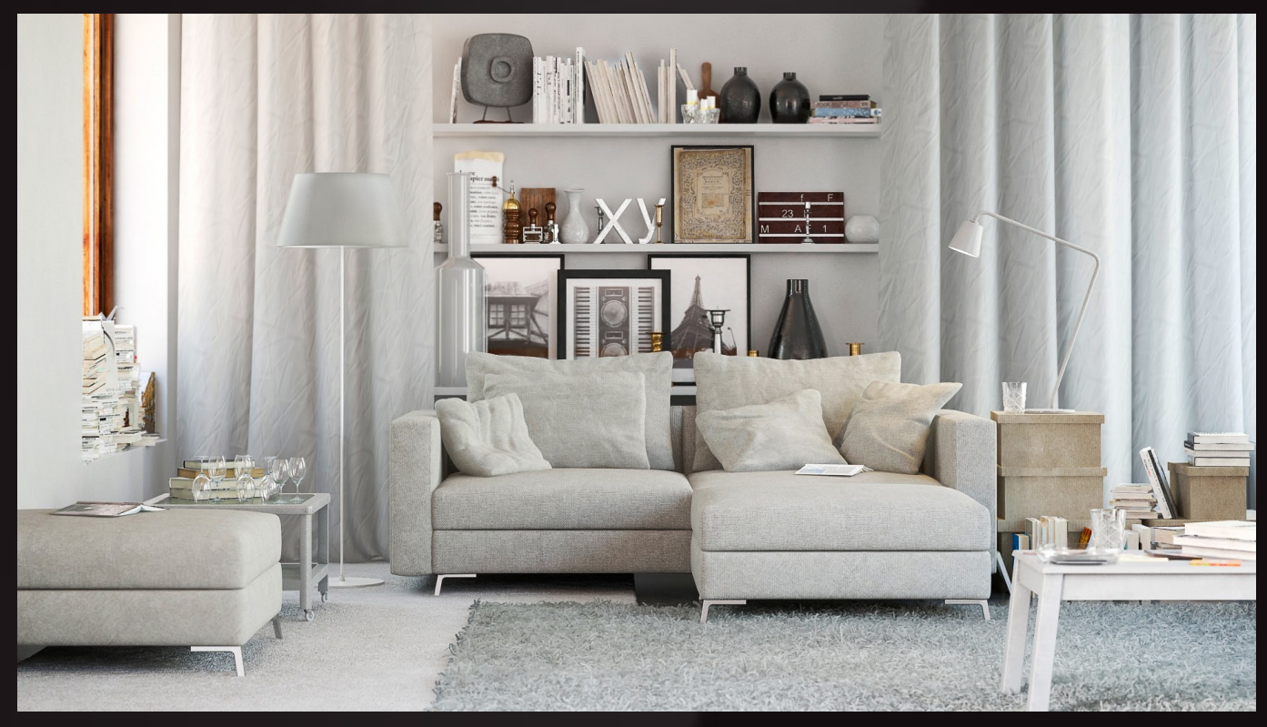
scene 6 - ps postproduction

Have you ever wanted to make professional exterior renderings? Do you know how to use VRaySun, VRaySky and VRayPhisicalCamera? Have you ever had problems with composition? Archinteriors will end all your problems. Take a look at this 10 fully textured scenes with professional shaders and lighting ready to render. Get your own portfolio and join cg market.