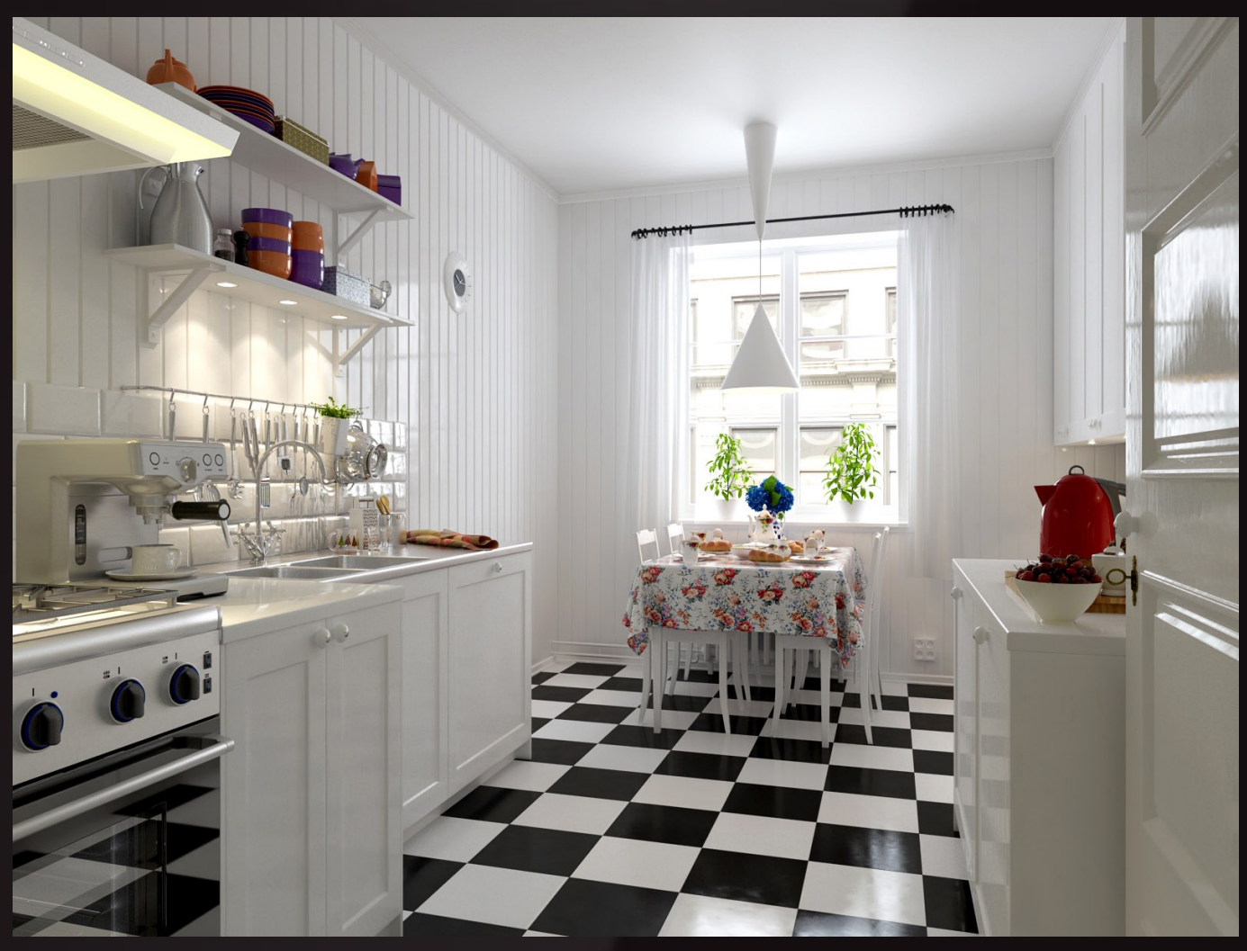
scene 1 - ps postproduction

Have you ever wanted to make professional exterior renderings? Do you know how to use VRaySun, VRaySky and VRayPhisicalCamera? Have you ever had problems with composition? Archinteriors will end all your problems. Take a look at this 10 fully textured scenes with professional shaders and lighting ready to render. Get your own portfolio and join cg market.