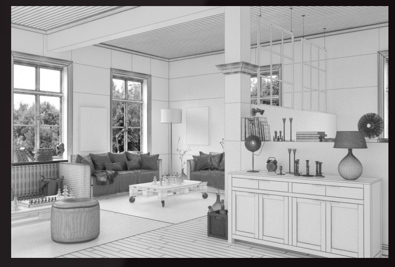
scene 7 - wire