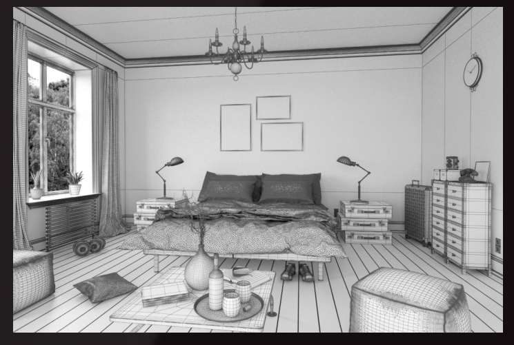
scene 5 - wire