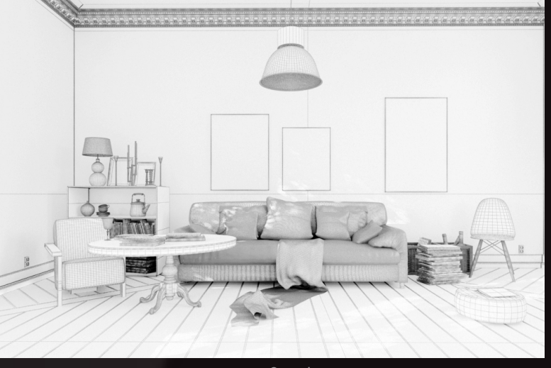
scene 8 - wire