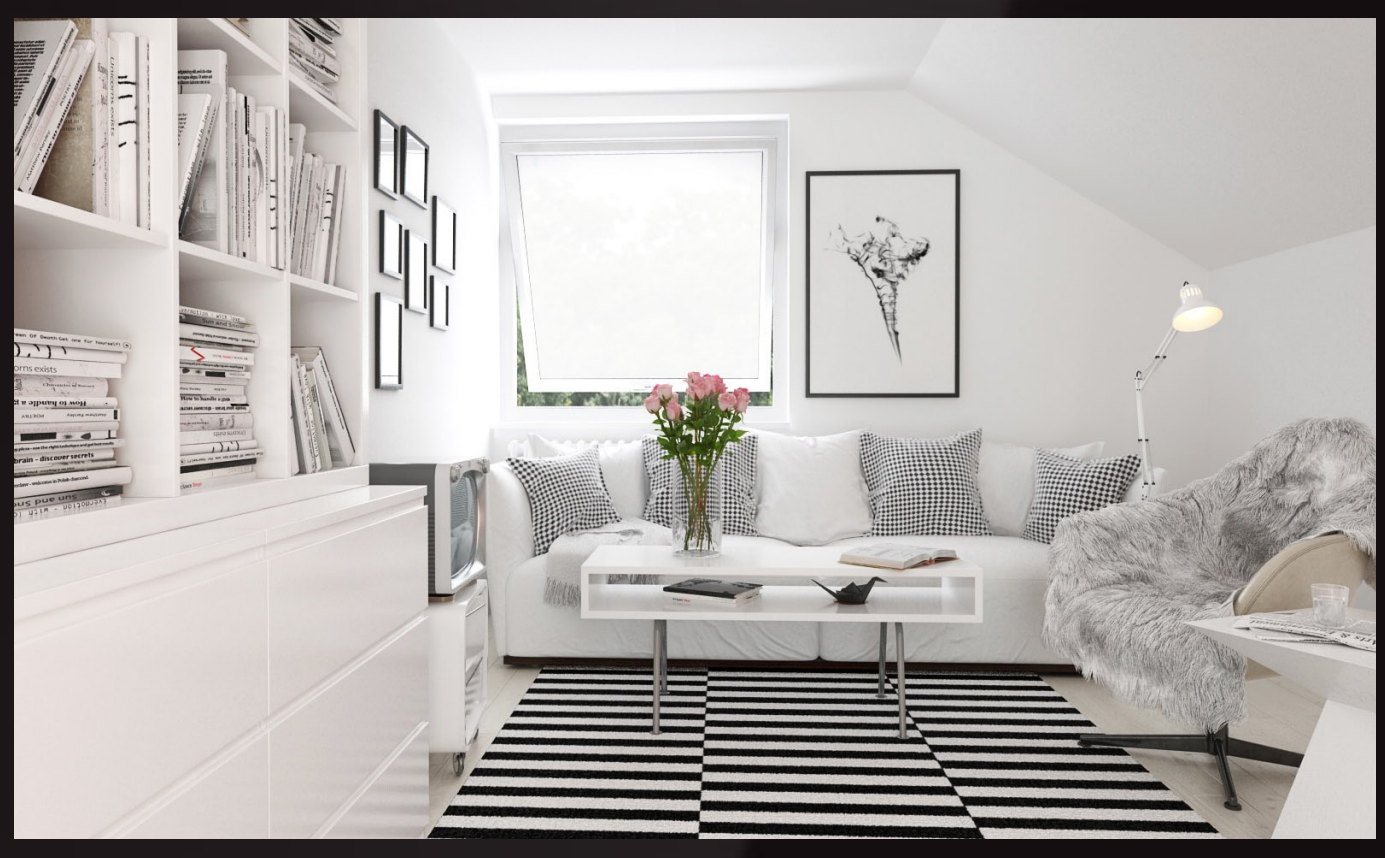
scene 4 - ps postproduction

Have you ever wanted to make professional exterior renderings? Do you know how to use VRaySun, VRaySky and VRayPhisicalCamera? Have you ever had problems with composition? Archinteriors will end all your problems. Take a look at this 10 fully textured scenes with professional shaders and lighting ready to render. Get your own portfolio and join cg market.