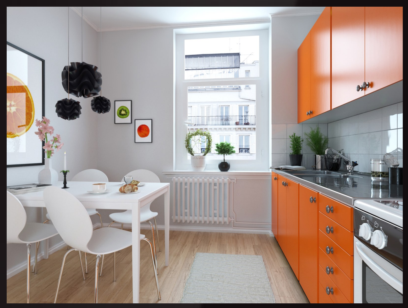
scene 3 - ps postproduction

Have you ever wanted to make professional exterior renderings? Do you know how to use VRaySun, VRaySky and VRayPhisicalCamera? Have you ever had problems with composition? Archinteriors will end all your problems. Take a look at this 10 fully textured scenes with professional shaders and lighting ready to render. Get your own portfolio and join cg market.