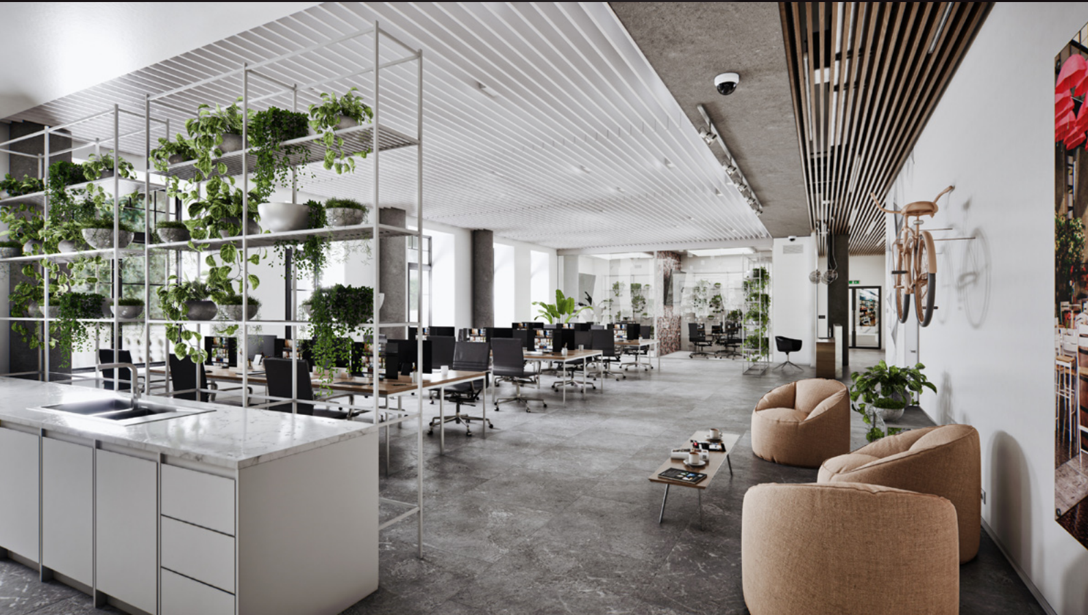
screenshot scene 02 cam 01

Archinteriors for Unreal Engine vol. 11 consists of five interior scenes of modern office workspaces. Each scene is a complete interior and contains various zones that characterize modern work spaces. You can find here a co-working zones, relaxation areas and a meeting spots which, interpenetrating each other, create an attractive work environment. All scenes are lit with Lumen, delivering perfect balance between high performance, lighting quality and flexibility. All interiors are fully modular and easy to re-use in your projects. Collection contains 40 animation shots set in Unreal Engine Sequencer.