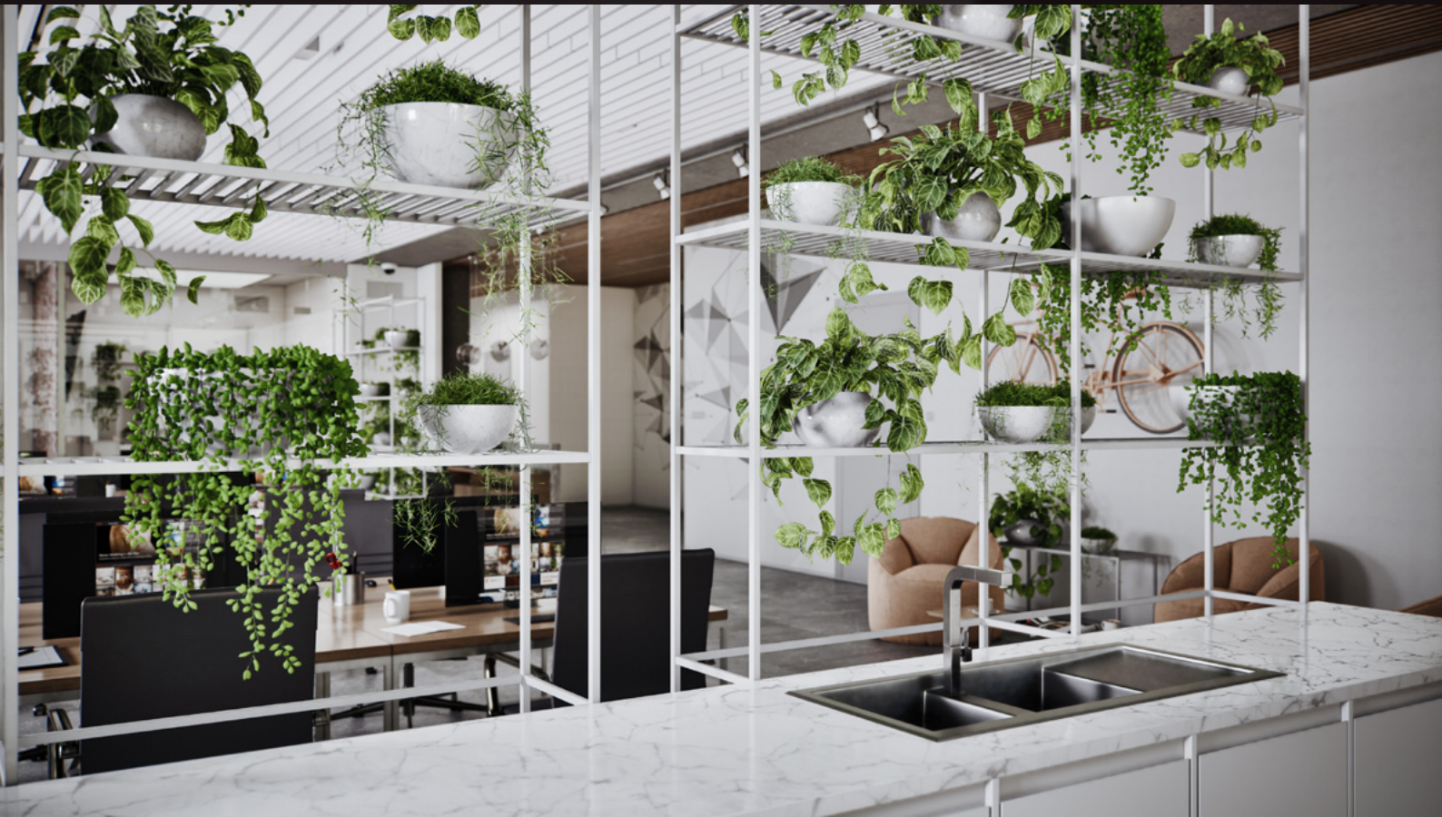
screenshot scene 02 cam 09

Archinteriors for Unreal Engine vol. 11 consists of five interior scenes of modern office workspaces. Each scene is a complete interior and contains various zones that characterize modern work spaces. You can find here a co-working zones, relaxation areas and a meeting spots which, interpenetrating each other, create an attractive work environment. All scenes are lit with Lumen, delivering perfect balance between high performance, lighting quality and flexibility. All interiors are fully modular and easy to re-use in your projects. Collection contains 40 animation shots set in Unreal Engine Sequencer.