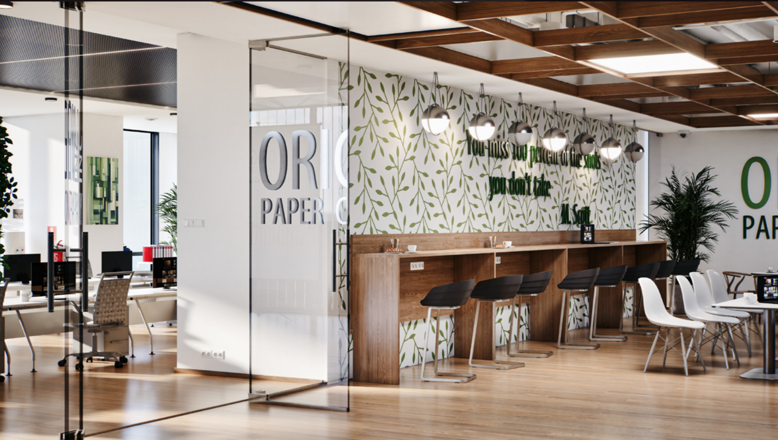
screenshot scene 05 cam 08

Archinteriors for Unreal Engine vol. 11 consists of five interior scenes of modern office workspaces. Each scene is a complete interior and contains various zones that characterize modern work spaces. You can find here a co-working zones, relaxation areas and a meeting spots which, interpenetrating each other, create an attractive work environment. All scenes are lit with Lumen, delivering perfect balance between high performance, lighting quality and flexibility. All interiors are fully modular and easy to re-use in your projects. Collection contains 40 animation shots set in Unreal Engine Sequencer.