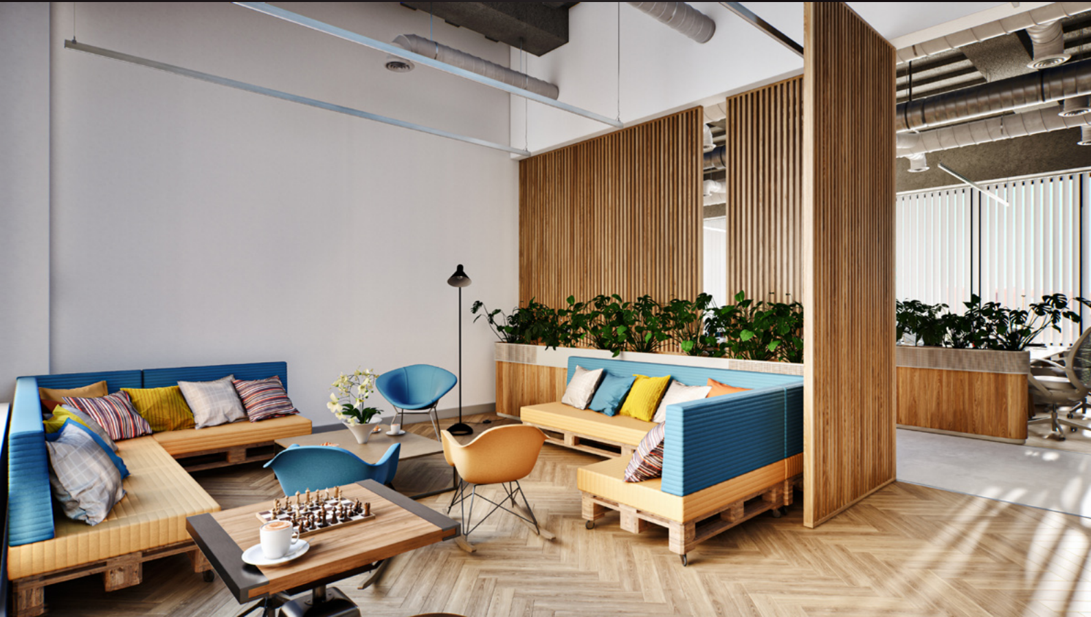
screenshot scene 03 cam 05

Archinteriors for Unreal Engine vol. 11 consists of five interior scenes of modern office workspaces. Each scene is a complete interior and contains various zones that characterize modern work spaces. You can find here a co-working zones, relaxation areas and a meeting spots which, interpenetrating each other, create an attractive work environment. All scenes are lit with Lumen, delivering perfect balance between high performance, lighting quality and flexibility. All interiors are fully modular and easy to re-use in your projects. Collection contains 40 animation shots set in Unreal Engine Sequencer.