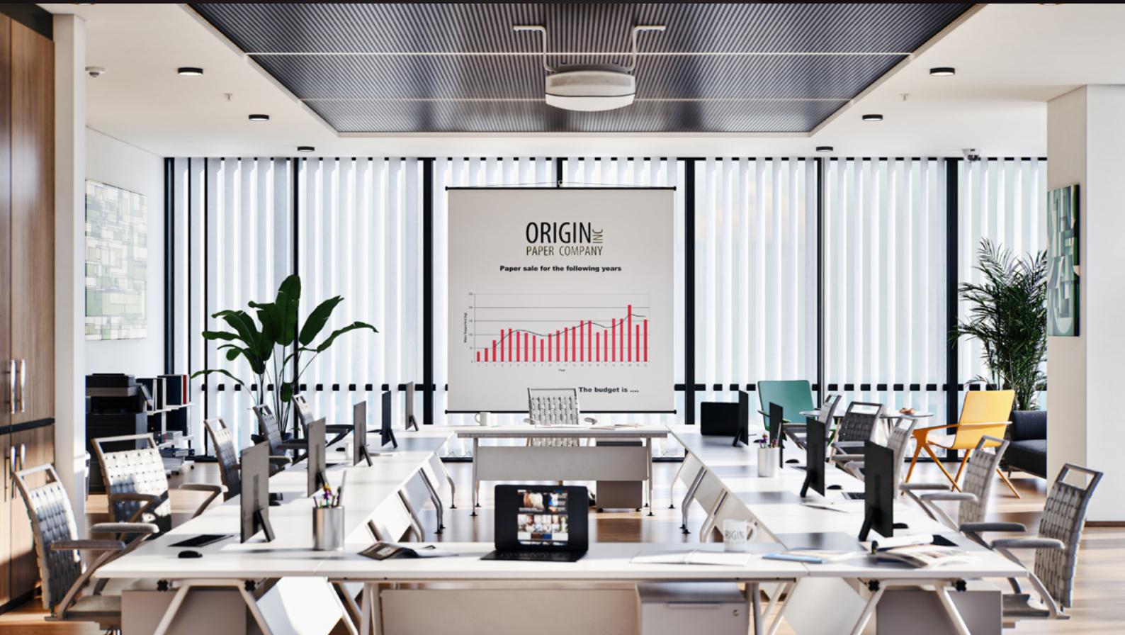
screenshot scene 05 cam 06

Archinteriors for Unreal Engine vol. 11 consists of five interior scenes of modern office workspaces. Each scene is a complete interior and contains various zones that characterize modern work spaces. You can find here a co-working zones, relaxation areas and a meeting spots which, interpenetrating each other, create an attractive work environment. All scenes are lit with Lumen, delivering perfect balance between high performance, lighting quality and flexibility. All interiors are fully modular and easy to re-use in your projects. Collection contains 40 animation shots set in Unreal Engine Sequencer.