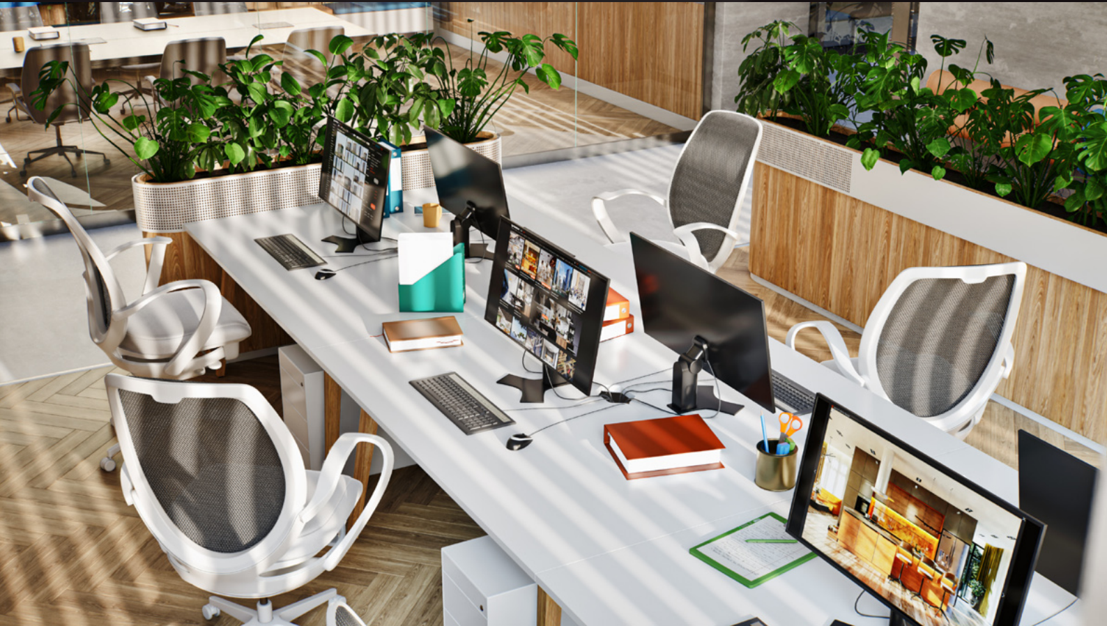
screenshot scene 03 cam 03

Archinteriors for Unreal Engine vol. 11 consists of five interior scenes of modern office workspaces. Each scene is a complete interior and contains various zones that characterize modern work spaces. You can find here a co-working zones, relaxation areas and a meeting spots which, interpenetrating each other, create an attractive work environment. All scenes are lit with Lumen, delivering perfect balance between high performance, lighting quality and flexibility. All interiors are fully modular and easy to re-use in your projects. Collection contains 40 animation shots set in Unreal Engine Sequencer.