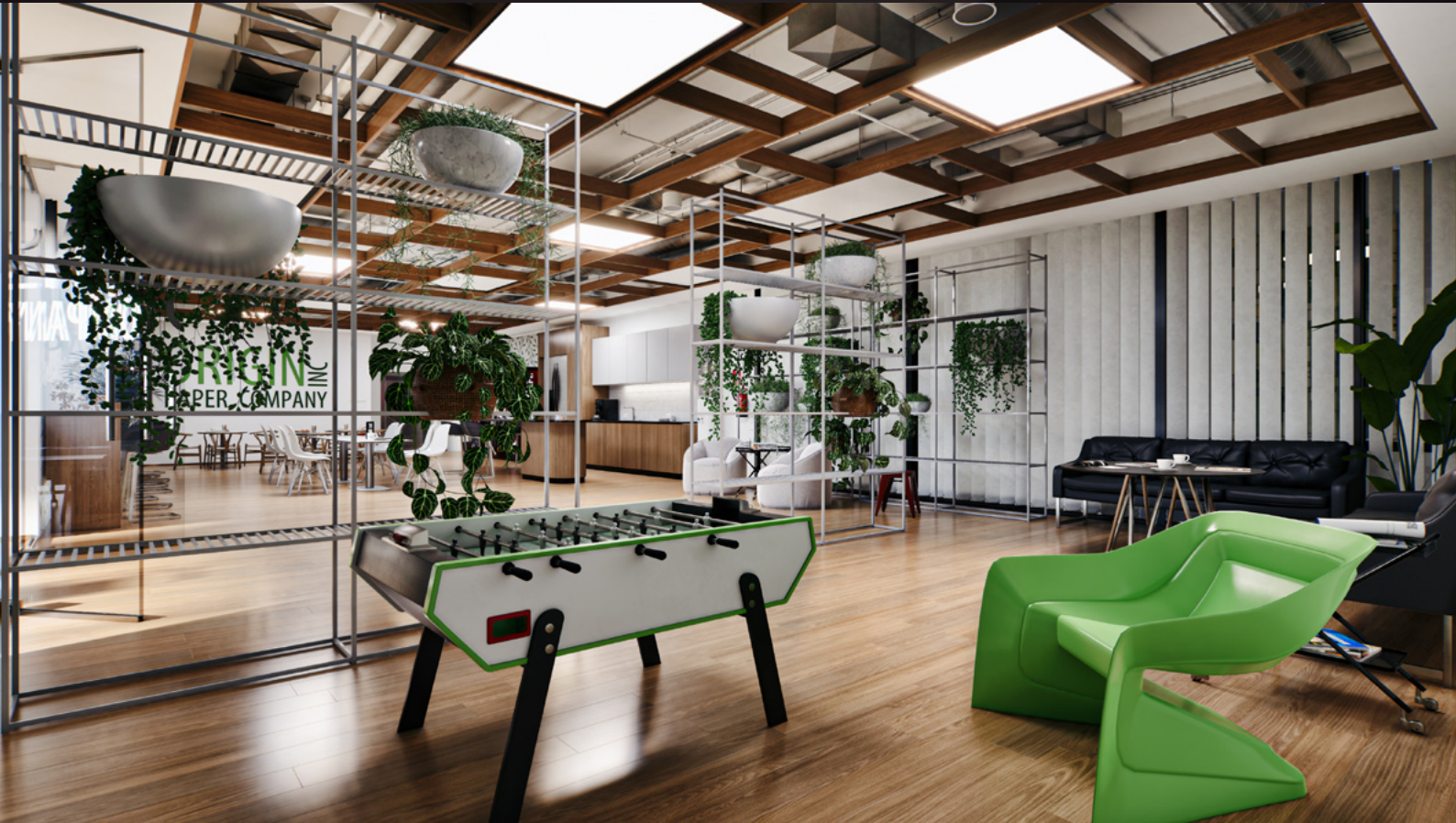
screenshot scene 05 cam 07

Archinteriors for Unreal Engine vol. 11 consists of five interior scenes of modern office workspaces. Each scene is a complete interior and contains various zones that characterize modern work spaces. You can find here a co-working zones, relaxation areas and a meeting spots which, interpenetrating each other, create an attractive work environment. All scenes are lit with Lumen, delivering perfect balance between high performance, lighting quality and flexibility. All interiors are fully modular and easy to re-use in your projects. Collection contains 40 animation shots set in Unreal Engine Sequencer.