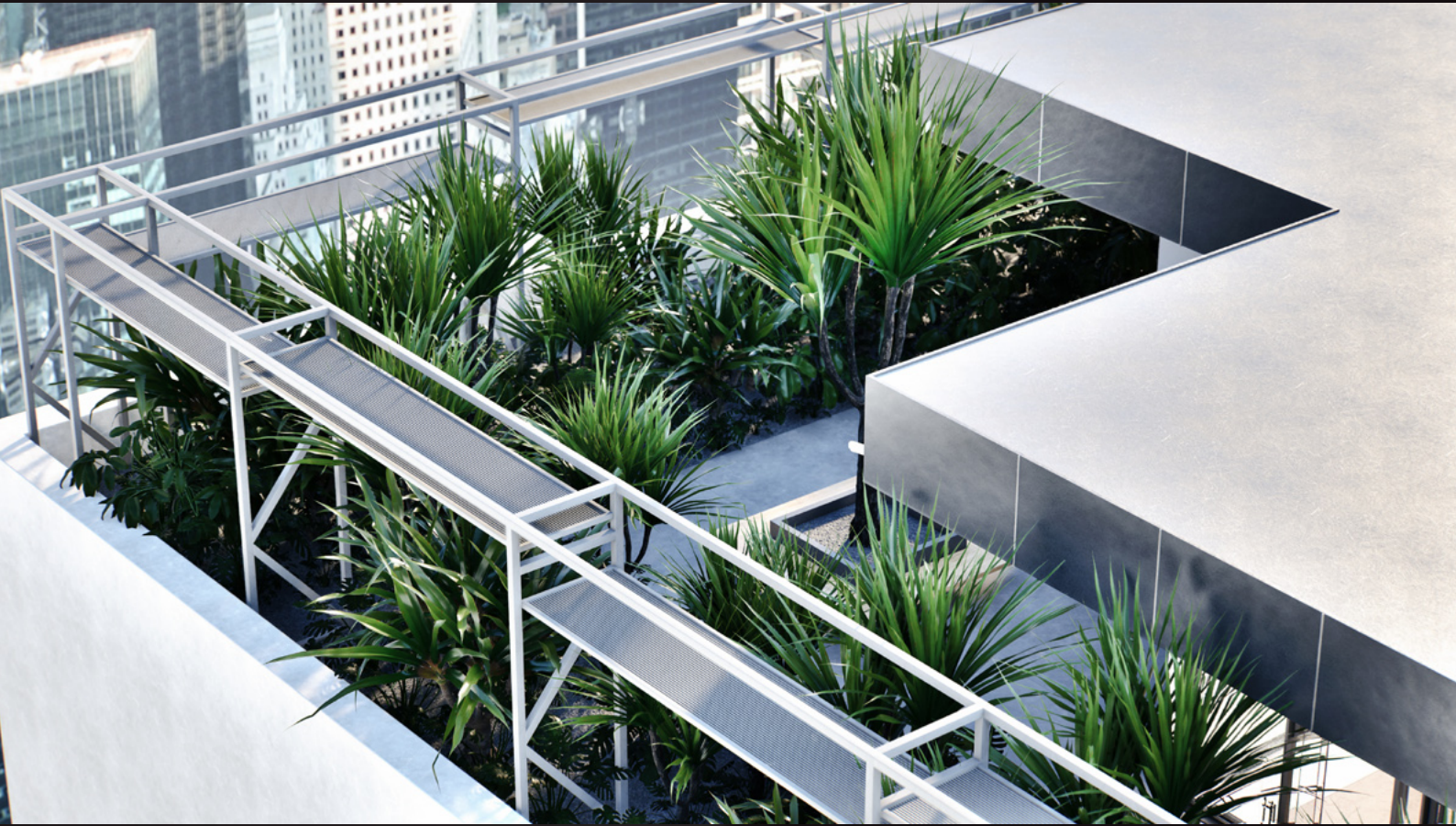
screenshot scene 04 cam 09

Archinteriors for Unreal Engine vol. 11 consists of five interior scenes of modern office workspaces. Each scene is a complete interior and contains various zones that characterize modern work spaces. You can find here a co-working zones, relaxation areas and a meeting spots which, interpenetrating each other, create an attractive work environment. All scenes are lit with Lumen, delivering perfect balance between high performance, lighting quality and flexibility. All interiors are fully modular and easy to re-use in your projects. Collection contains 40 animation shots set in Unreal Engine Sequencer.