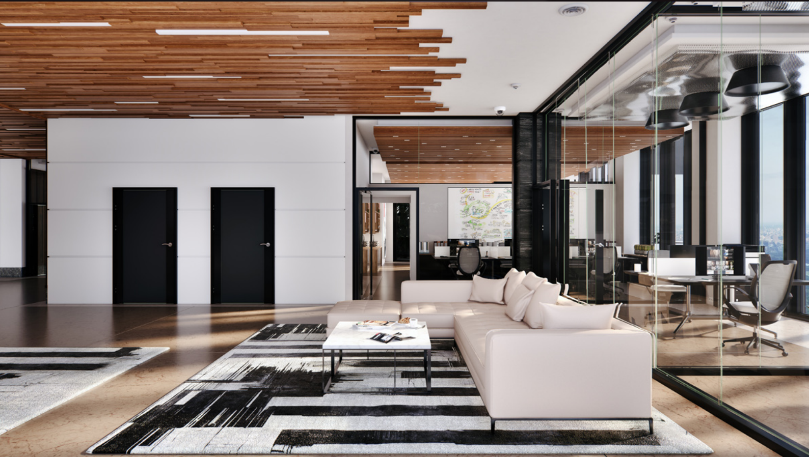
screenshot scene 04 cam 03

Archinteriors for Unreal Engine vol. 11 consists of five interior scenes of modern office workspaces. Each scene is a complete interior and contains various zones that characterize modern work spaces. You can find here a co-working zones, relaxation areas and a meeting spots which, interpenetrating each other, create an attractive work environment. All scenes are lit with Lumen, delivering perfect balance between high performance, lighting quality and flexibility. All interiors are fully modular and easy to re-use in your projects. Collection contains 40 animation shots set in Unreal Engine Sequencer.