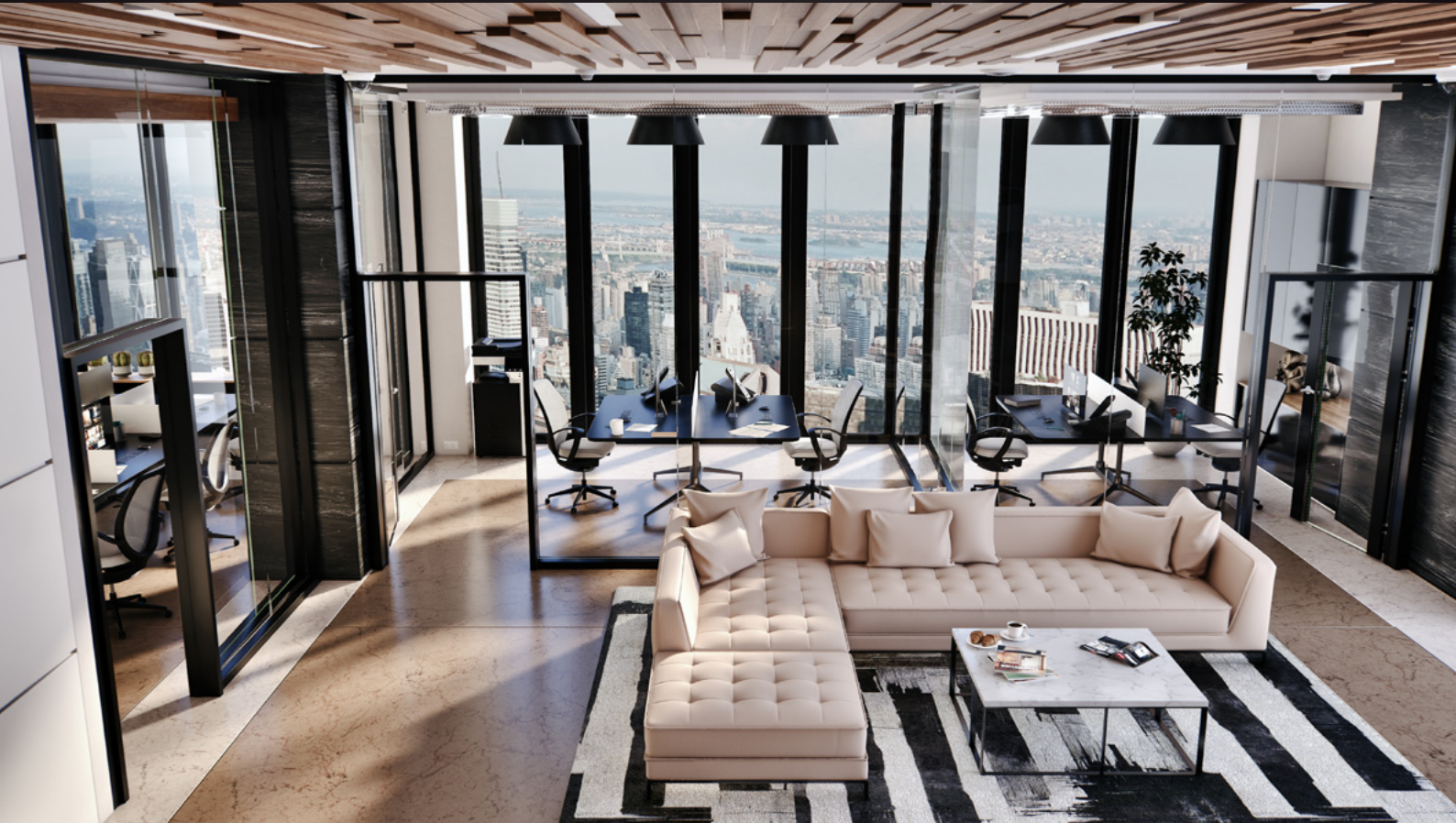
screenshot scene 04 cam 12

Archinteriors for Unreal Engine vol. 11 consists of five interior scenes of modern office workspaces. Each scene is a complete interior and contains various zones that characterize modern work spaces. You can find here a co-working zones, relaxation areas and a meeting spots which, interpenetrating each other, create an attractive work environment. All scenes are lit with Lumen, delivering perfect balance between high performance, lighting quality and flexibility. All interiors are fully modular and easy to re-use in your projects. Collection contains 40 animation shots set in Unreal Engine Sequencer.