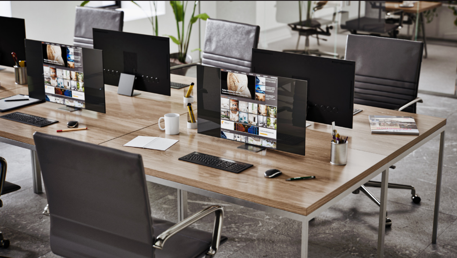
screenshot scene 02 cam 06

Archinteriors for Unreal Engine vol. 11 consists of five interior scenes of modern office workspaces. Each scene is a complete interior and contains various zones that characterize modern work spaces. You can find here a co-working zones, relaxation areas and a meeting spots which, interpenetrating each other, create an attractive work environment. All scenes are lit with Lumen, delivering perfect balance between high performance, lighting quality and flexibility. All interiors are fully modular and easy to re-use in your projects. Collection contains 40 animation shots set in Unreal Engine Sequencer.