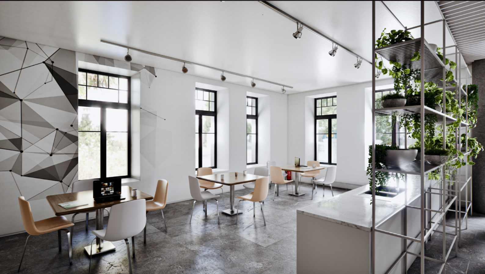
screenshot scene 02 cam 02

Archinteriors for Unreal Engine vol. 11 consists of five interior scenes of modern office workspaces. Each scene is a complete interior and contains various zones that characterize modern work spaces. You can find here a co-working zones, relaxation areas and a meeting spots which, interpenetrating each other, create an attractive work environment. All scenes are lit with Lumen, delivering perfect balance between high performance, lighting quality and flexibility. All interiors are fully modular and easy to re-use in your projects. Collection contains 40 animation shots set in Unreal Engine Sequencer.