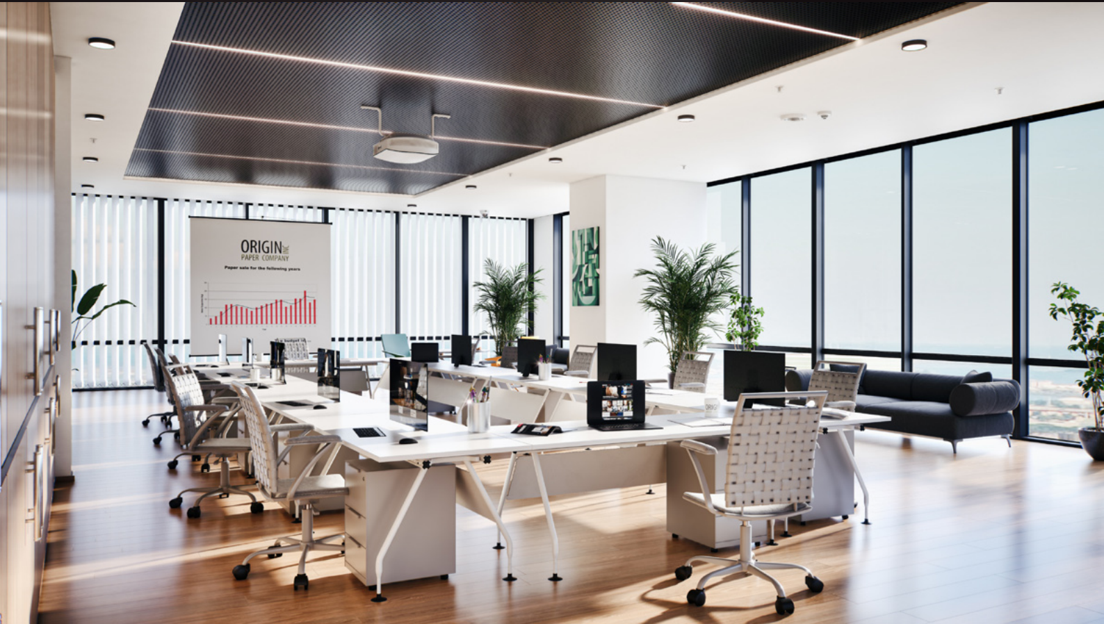
screenshot scene 05 cam 05

Archinteriors for Unreal Engine vol. 11 consists of five interior scenes of modern office workspaces. Each scene is a complete interior and contains various zones that characterize modern work spaces. You can find here a co-working zones, relaxation areas and a meeting spots which, interpenetrating each other, create an attractive work environment. All scenes are lit with Lumen, delivering perfect balance between high performance, lighting quality and flexibility. All interiors are fully modular and easy to re-use in your projects. Collection contains 40 animation shots set in Unreal Engine Sequencer.