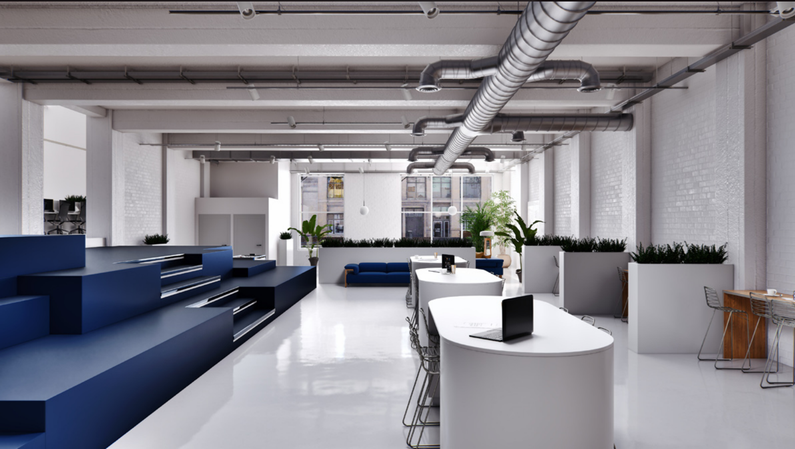
screenshot scene 01 cam 05

Archinteriors for Unreal Engine vol. 11 consists of five interior scenes of modern office workspaces. Each scene is a complete interior and contains various zones that characterize modern work spaces. You can find here a co-working zones, relaxation areas and a meeting spots which, interpenetrating each other, create an attractive work environment. All scenes are lit with Lumen, delivering perfect balance between high performance, lighting quality and flexibility. All interiors are fully modular and easy to re-use in your projects. Collection contains 40 animation shots set in Unreal Engine Sequencer.