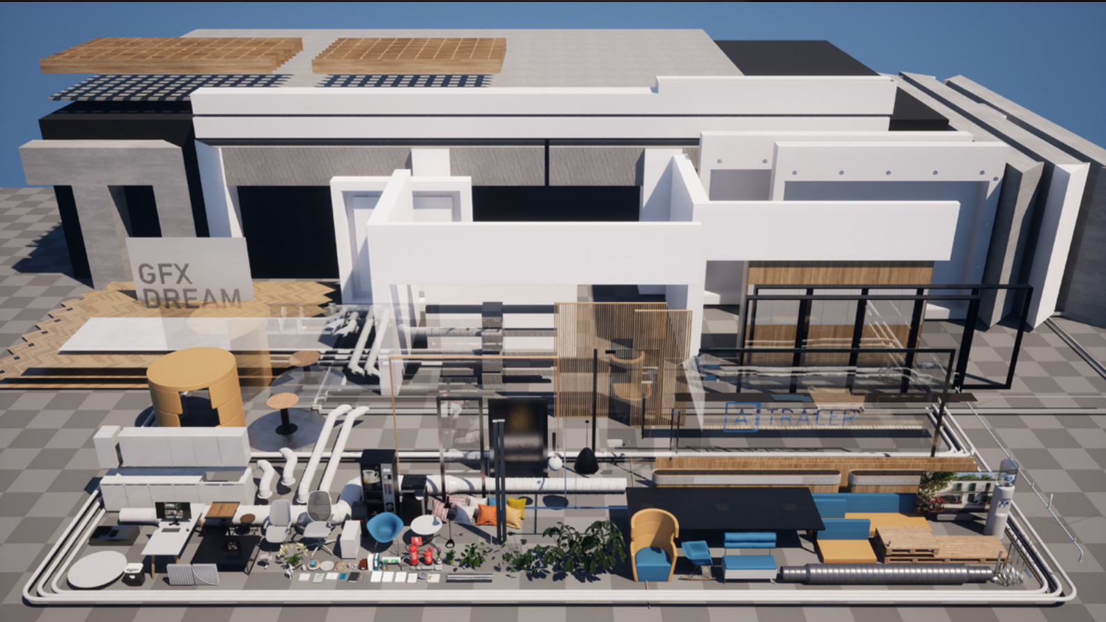
overview scene 03

Archinteriors for Unreal Engine vol. 11 consists of five interior scenes of modern office workspaces. Each scene is a complete interior and contains various zones that characterize modern work spaces. You can find here a co-working zones, relaxation areas and a meeting spots which, interpenetrating each other, create an attractive work environment. All scenes are lit with Lumen, delivering perfect balance between high performance, lighting quality and flexibility. All interiors are fully modular and easy to re-use in your projects. Collection contains 40 animation shots set in Unreal Engine Sequencer.