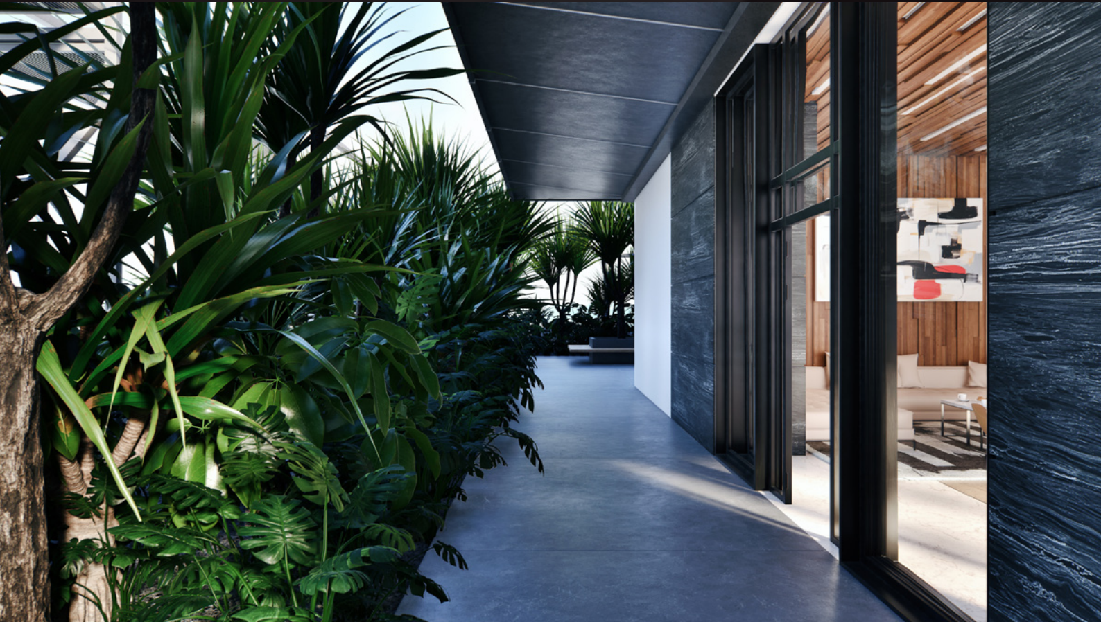
screenshot scene 04 cam 07

Archinteriors for Unreal Engine vol. 11 consists of five interior scenes of modern office workspaces. Each scene is a complete interior and contains various zones that characterize modern work spaces. You can find here a co-working zones, relaxation areas and a meeting spots which, interpenetrating each other, create an attractive work environment. All scenes are lit with Lumen, delivering perfect balance between high performance, lighting quality and flexibility. All interiors are fully modular and easy to re-use in your projects. Collection contains 40 animation shots set in Unreal Engine Sequencer.