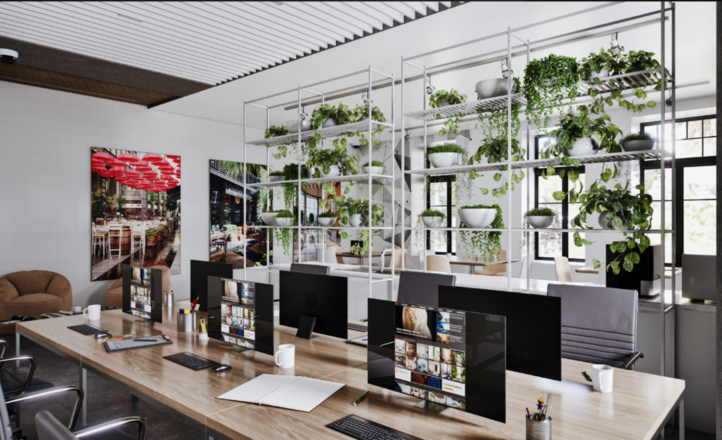
screenshot scene 02 cam 07

Archinteriors for Unreal Engine vol. 11 consists of five interior scenes of modern office workspaces. Each scene is a complete interior and contains various zones that characterize modern work spaces. You can find here a co-working zones, relaxation areas and a meeting spots which, interpenetrating each other, create an attractive work environment. All scenes are lit with Lumen, delivering perfect balance between high performance, lighting quality and flexibility. All interiors are fully modular and easy to re-use in your projects. Collection contains 40 animation shots set in Unreal Engine Sequencer.