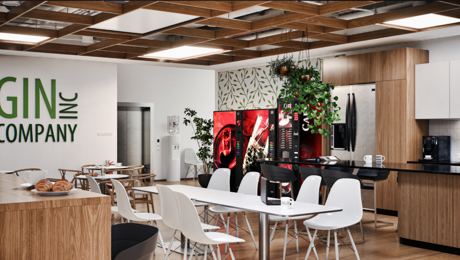
screenshot scene 05 cam 09

Archinteriors for Unreal Engine vol. 11 consists of five interior scenes of modern office workspaces. Each scene is a complete interior and contains various zones that characterize modern work spaces. You can find here a co-working zones, relaxation areas and a meeting spots which, interpenetrating each other, create an attractive work environment. All scenes are lit with Lumen, delivering perfect balance between high performance, lighting quality and flexibility. All interiors are fully modular and easy to re-use in your projects. Collection contains 40 animation shots set in Unreal Engine Sequencer.