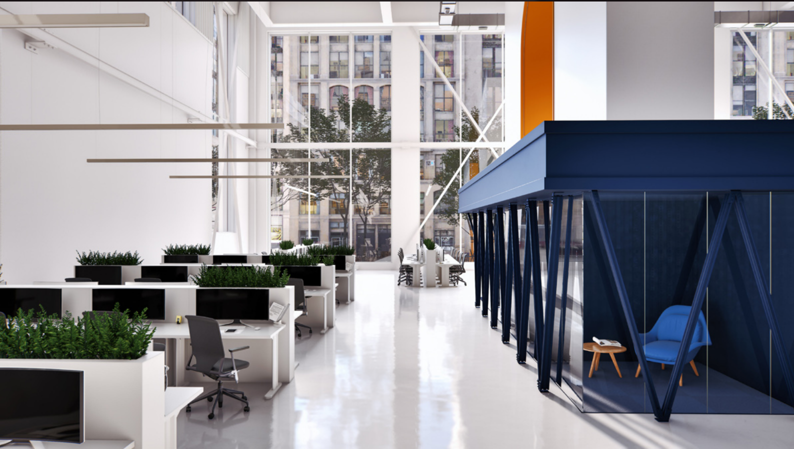
screenshot scene 01 cam 02

Archinteriors for Unreal Engine vol. 11 consists of five interior scenes of modern office workspaces. Each scene is a complete interior and contains various zones that characterize modern work spaces. You can find here a co-working zones, relaxation areas and a meeting spots which, interpenetrating each other, create an attractive work environment. All scenes are lit with Lumen, delivering perfect balance between high performance, lighting quality and flexibility. All interiors are fully modular and easy to re-use in your projects. Collection contains 40 animation shots set in Unreal Engine Sequencer.