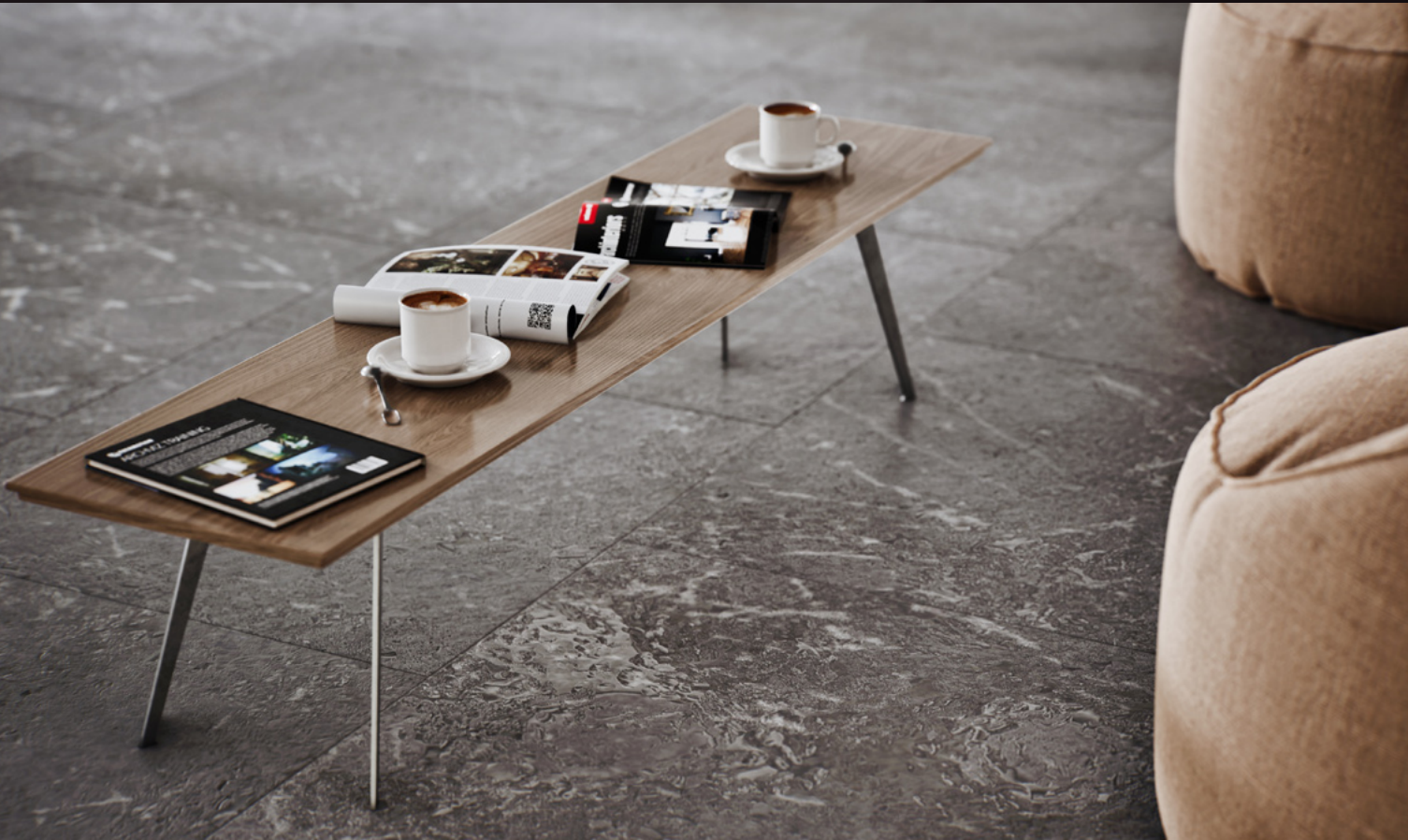
screenshot scene 02 cam 08

Archinteriors for Unreal Engine vol. 11 consists of five interior scenes of modern office workspaces. Each scene is a complete interior and contains various zones that characterize modern work spaces. You can find here a co-working zones, relaxation areas and a meeting spots which, interpenetrating each other, create an attractive work environment. All scenes are lit with Lumen, delivering perfect balance between high performance, lighting quality and flexibility. All interiors are fully modular and easy to re-use in your projects. Collection contains 40 animation shots set in Unreal Engine Sequencer.