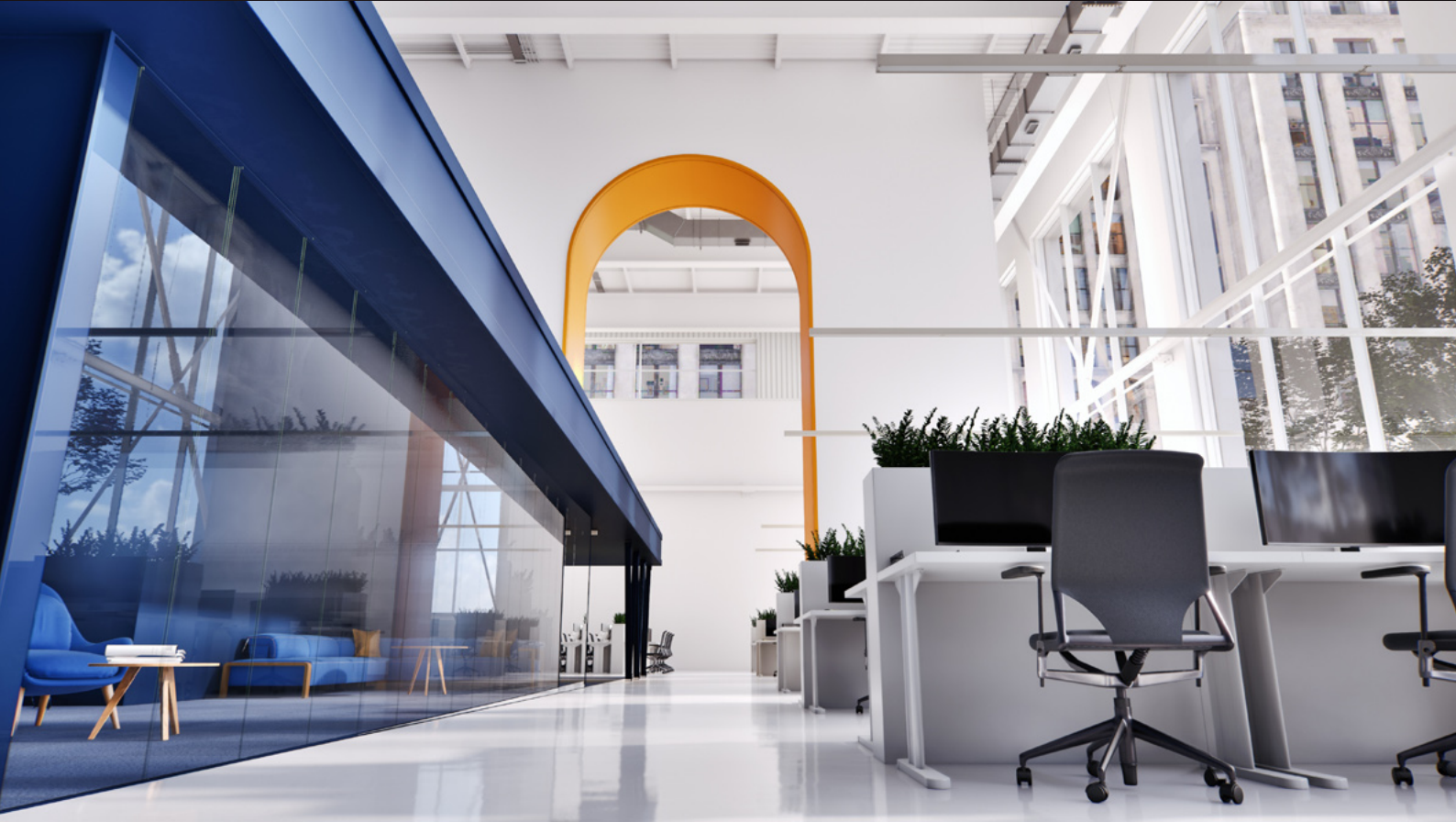
screenshot scene 01 cam 08

Archinteriors for Unreal Engine vol. 11 consists of five interior scenes of modern office workspaces. Each scene is a complete interior and contains various zones that characterize modern work spaces. You can find here a co-working zones, relaxation areas and a meeting spots which, interpenetrating each other, create an attractive work environment. All scenes are lit with Lumen, delivering perfect balance between high performance, lighting quality and flexibility. All interiors are fully modular and easy to re-use in your projects. Collection contains 40 animation shots set in Unreal Engine Sequencer.