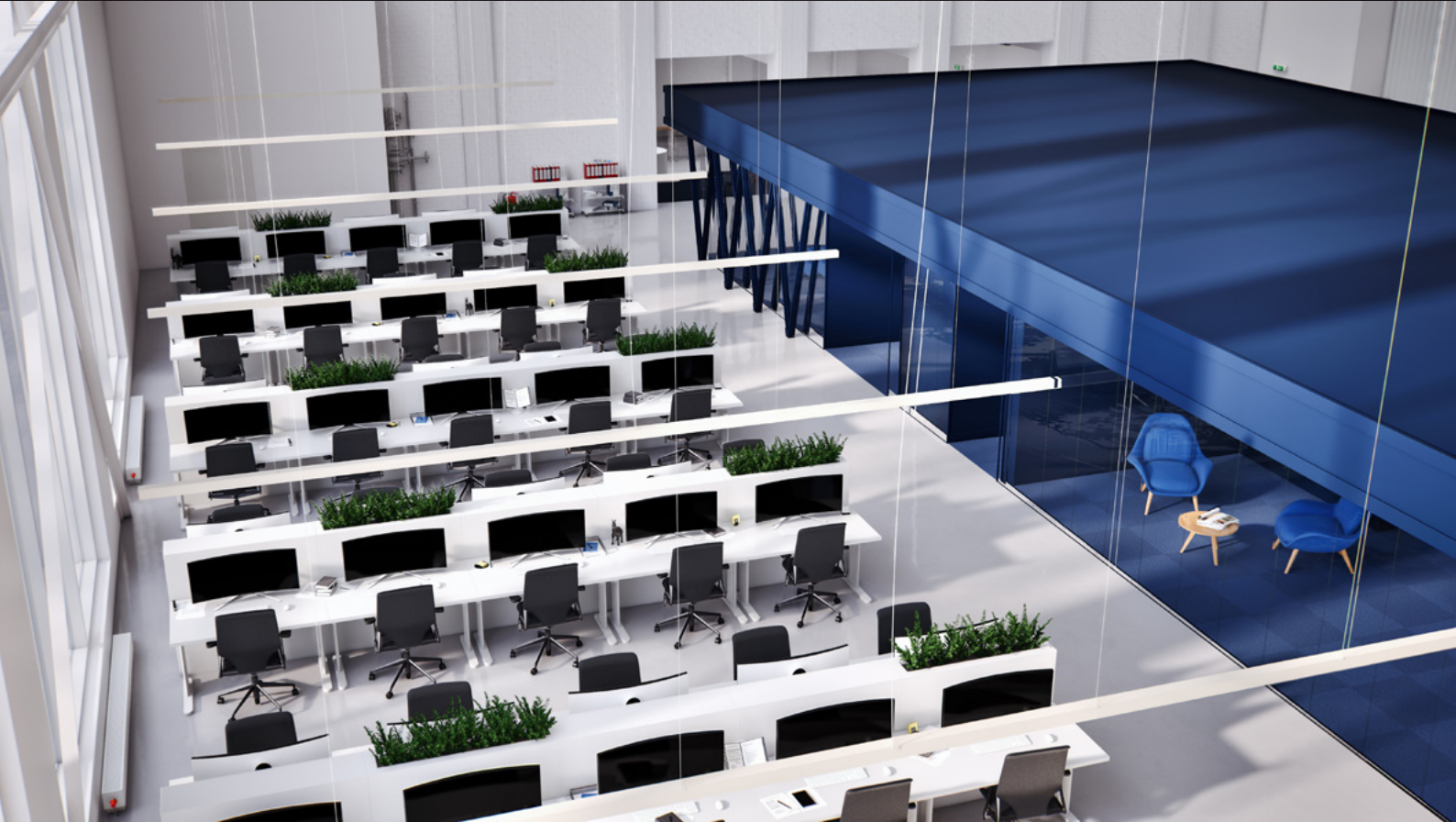
screenshot scene 01 cam 09

Archinteriors for Unreal Engine vol. 11 consists of five interior scenes of modern office workspaces. Each scene is a complete interior and contains various zones that characterize modern work spaces. You can find here a co-working zones, relaxation areas and a meeting spots which, interpenetrating each other, create an attractive work environment. All scenes are lit with Lumen, delivering perfect balance between high performance, lighting quality and flexibility. All interiors are fully modular and easy to re-use in your projects. Collection contains 40 animation shots set in Unreal Engine Sequencer.