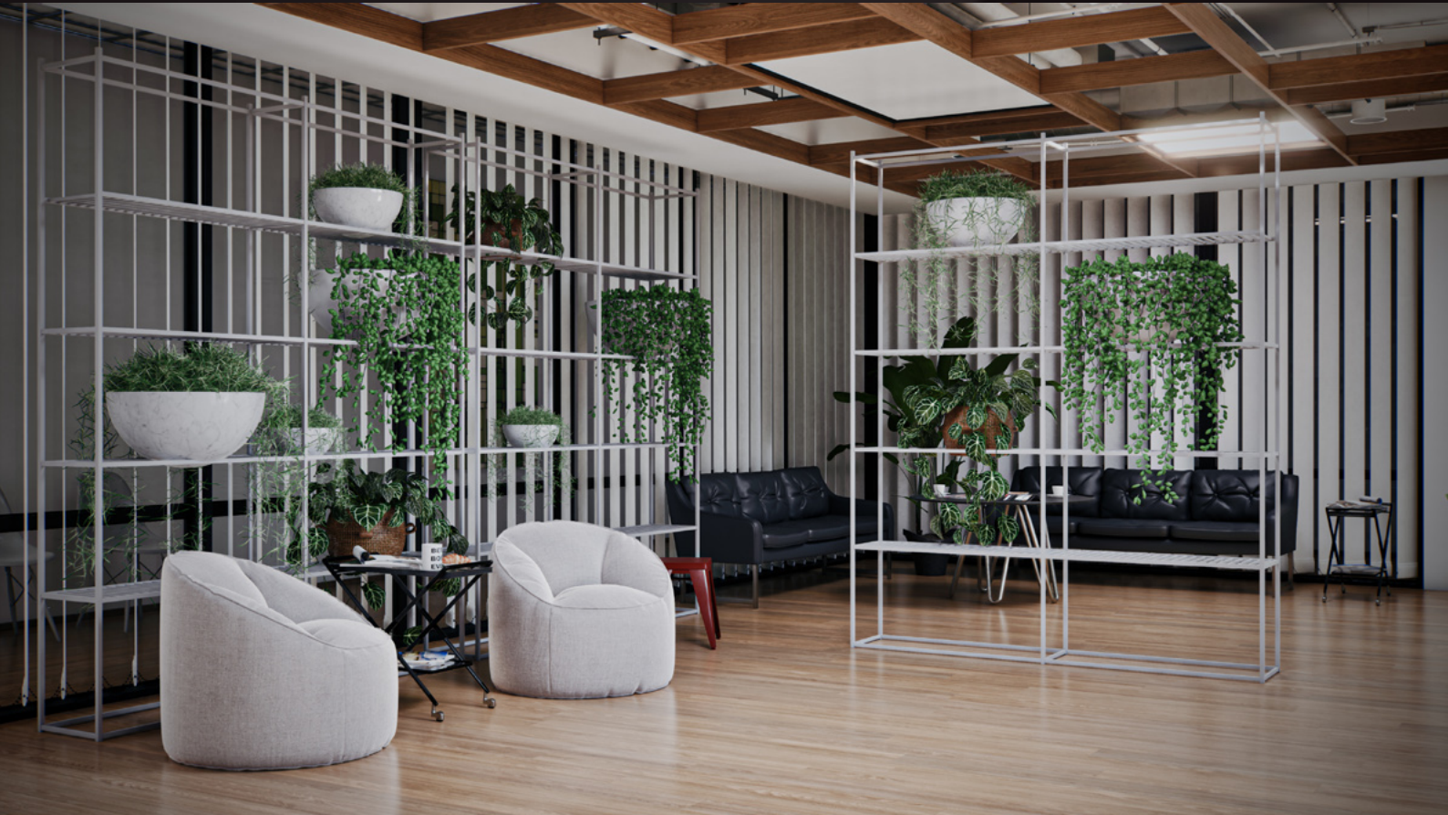
screenshot scene 05 cam 04

Archinteriors for Unreal Engine vol. 11 consists of five interior scenes of modern office workspaces. Each scene is a complete interior and contains various zones that characterize modern work spaces. You can find here a co-working zones, relaxation areas and a meeting spots which, interpenetrating each other, create an attractive work environment. All scenes are lit with Lumen, delivering perfect balance between high performance, lighting quality and flexibility. All interiors are fully modular and easy to re-use in your projects. Collection contains 40 animation shots set in Unreal Engine Sequencer.