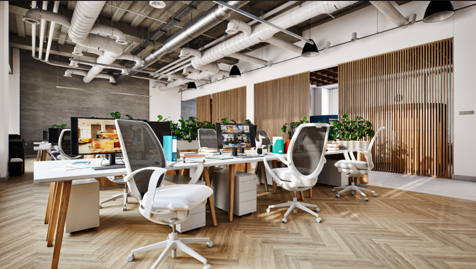
screenshot scene 03 cam 02

Archinteriors for Unreal Engine vol. 11 consists of five interior scenes of modern office workspaces. Each scene is a complete interior and contains various zones that characterize modern work spaces. You can find here a co-working zones, relaxation areas and a meeting spots which, interpenetrating each other, create an attractive work environment. All scenes are lit with Lumen, delivering perfect balance between high performance, lighting quality and flexibility. All interiors are fully modular and easy to re-use in your projects. Collection contains 40 animation shots set in Unreal Engine Sequencer.