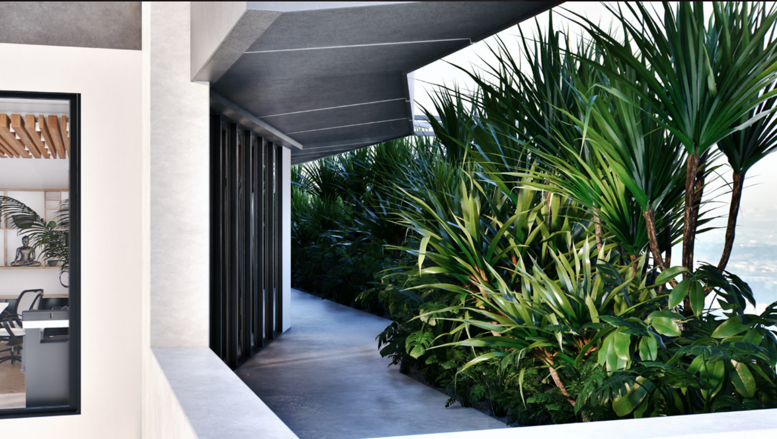
screenshot scene 04 cam 08

Archinteriors for Unreal Engine vol. 11 consists of five interior scenes of modern office workspaces. Each scene is a complete interior and contains various zones that characterize modern work spaces. You can find here a co-working zones, relaxation areas and a meeting spots which, interpenetrating each other, create an attractive work environment. All scenes are lit with Lumen, delivering perfect balance between high performance, lighting quality and flexibility. All interiors are fully modular and easy to re-use in your projects. Collection contains 40 animation shots set in Unreal Engine Sequencer.