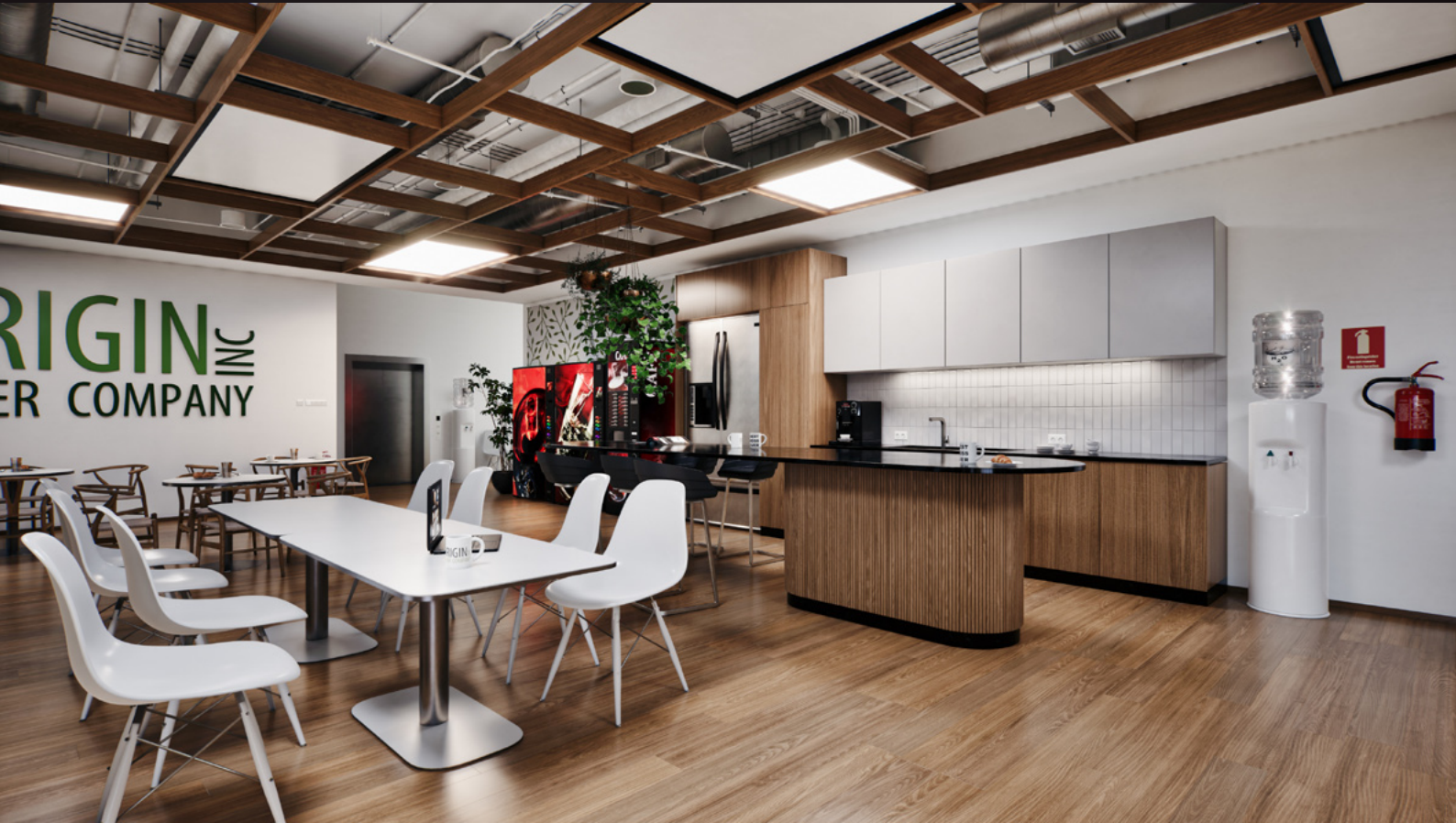
screenshot scene 05 cam 10

Archinteriors for Unreal Engine vol. 11 consists of five interior scenes of modern office workspaces. Each scene is a complete interior and contains various zones that characterize modern work spaces. You can find here a co-working zones, relaxation areas and a meeting spots which, interpenetrating each other, create an attractive work environment. All scenes are lit with Lumen, delivering perfect balance between high performance, lighting quality and flexibility. All interiors are fully modular and easy to re-use in your projects. Collection contains 40 animation shots set in Unreal Engine Sequencer.