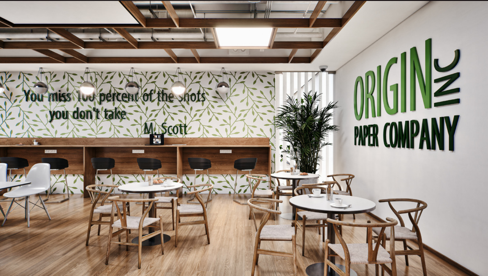
screenshot scene 05 cam 03

Archinteriors for Unreal Engine vol. 11 consists of five interior scenes of modern office workspaces. Each scene is a complete interior and contains various zones that characterize modern work spaces. You can find here a co-working zones, relaxation areas and a meeting spots which, interpenetrating each other, create an attractive work environment. All scenes are lit with Lumen, delivering perfect balance between high performance, lighting quality and flexibility. All interiors are fully modular and easy to re-use in your projects. Collection contains 40 animation shots set in Unreal Engine Sequencer.