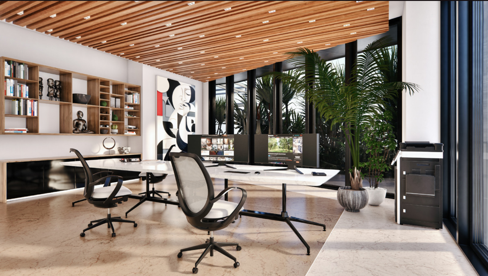
screenshot scene 04 cam 11

Archinteriors for Unreal Engine vol. 11 consists of five interior scenes of modern office workspaces. Each scene is a complete interior and contains various zones that characterize modern work spaces. You can find here a co-working zones, relaxation areas and a meeting spots which, interpenetrating each other, create an attractive work environment. All scenes are lit with Lumen, delivering perfect balance between high performance, lighting quality and flexibility. All interiors are fully modular and easy to re-use in your projects. Collection contains 40 animation shots set in Unreal Engine Sequencer.