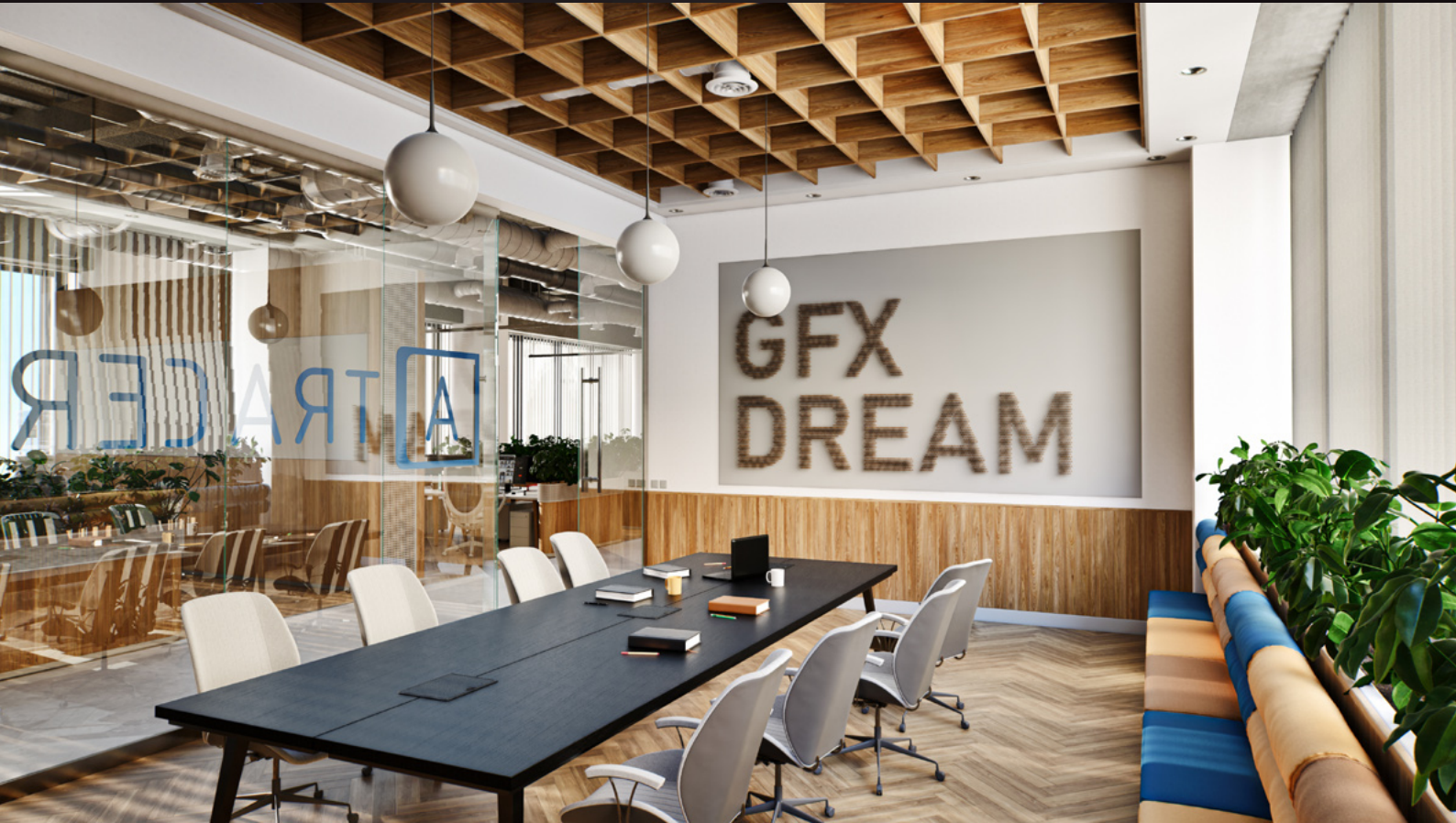
screenshot scene 03 cam 01

Archinteriors for Unreal Engine vol. 11 consists of five interior scenes of modern office workspaces. Each scene is a complete interior and contains various zones that characterize modern work spaces. You can find here a co-working zones, relaxation areas and a meeting spots which, interpenetrating each other, create an attractive work environment. All scenes are lit with Lumen, delivering perfect balance between high performance, lighting quality and flexibility. All interiors are fully modular and easy to re-use in your projects. Collection contains 40 animation shots set in Unreal Engine Sequencer.