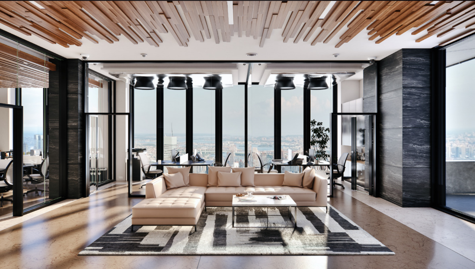
screenshot scene 04 cam 01

Archinteriors for Unreal Engine vol. 11 consists of five interior scenes of modern office workspaces. Each scene is a complete interior and contains various zones that characterize modern work spaces. You can find here a co-working zones, relaxation areas and a meeting spots which, interpenetrating each other, create an attractive work environment. All scenes are lit with Lumen, delivering perfect balance between high performance, lighting quality and flexibility. All interiors are fully modular and easy to re-use in your projects. Collection contains 40 animation shots set in Unreal Engine Sequencer.