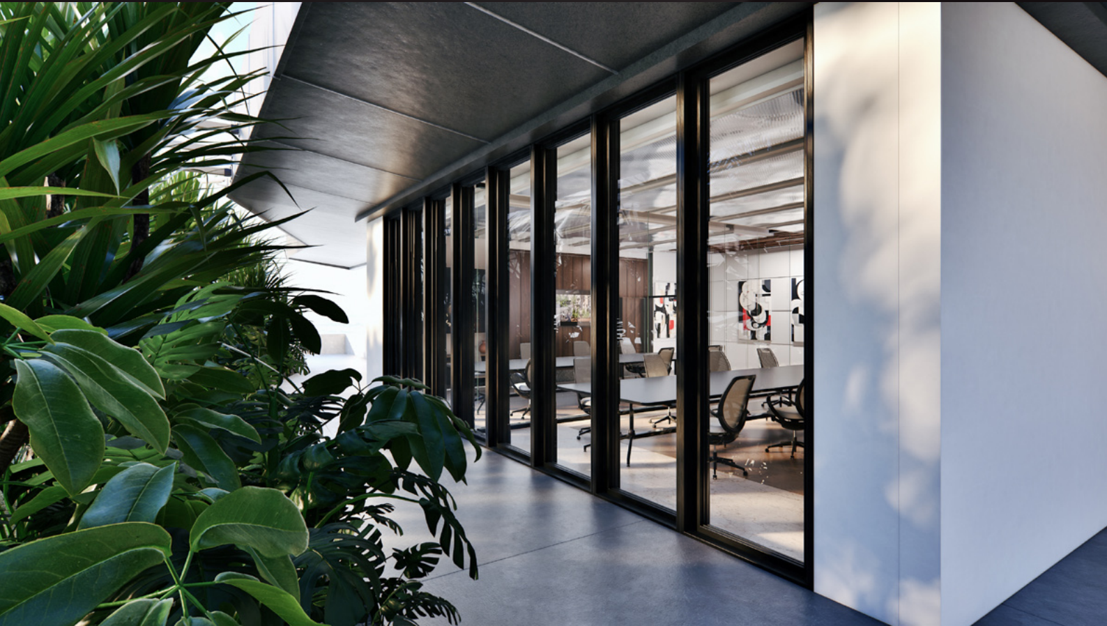
screenshot scene 04 cam 10

Archinteriors for Unreal Engine vol. 11 consists of five interior scenes of modern office workspaces. Each scene is a complete interior and contains various zones that characterize modern work spaces. You can find here a co-working zones, relaxation areas and a meeting spots which, interpenetrating each other, create an attractive work environment. All scenes are lit with Lumen, delivering perfect balance between high performance, lighting quality and flexibility. All interiors are fully modular and easy to re-use in your projects. Collection contains 40 animation shots set in Unreal Engine Sequencer.