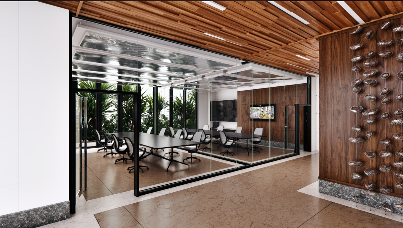
screenshot scene 04 cam 02

Archinteriors for Unreal Engine vol. 11 consists of five interior scenes of modern office workspaces. Each scene is a complete interior and contains various zones that characterize modern work spaces. You can find here a co-working zones, relaxation areas and a meeting spots which, interpenetrating each other, create an attractive work environment. All scenes are lit with Lumen, delivering perfect balance between high performance, lighting quality and flexibility. All interiors are fully modular and easy to re-use in your projects. Collection contains 40 animation shots set in Unreal Engine Sequencer.