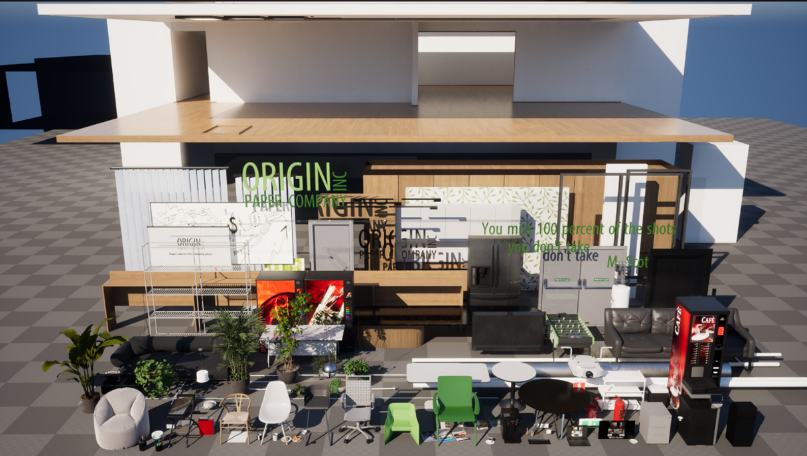
overview scene 05

Archinteriors for Unreal Engine vol. 11 consists of five interior scenes of modern office workspaces. Each scene is a complete interior and contains various zones that characterize modern work spaces. You can find here a co-working zones, relaxation areas and a meeting spots which, interpenetrating each other, create an attractive work environment. All scenes are lit with Lumen, delivering perfect balance between high performance, lighting quality and flexibility. All interiors are fully modular and easy to re-use in your projects. Collection contains 40 animation shots set in Unreal Engine Sequencer.