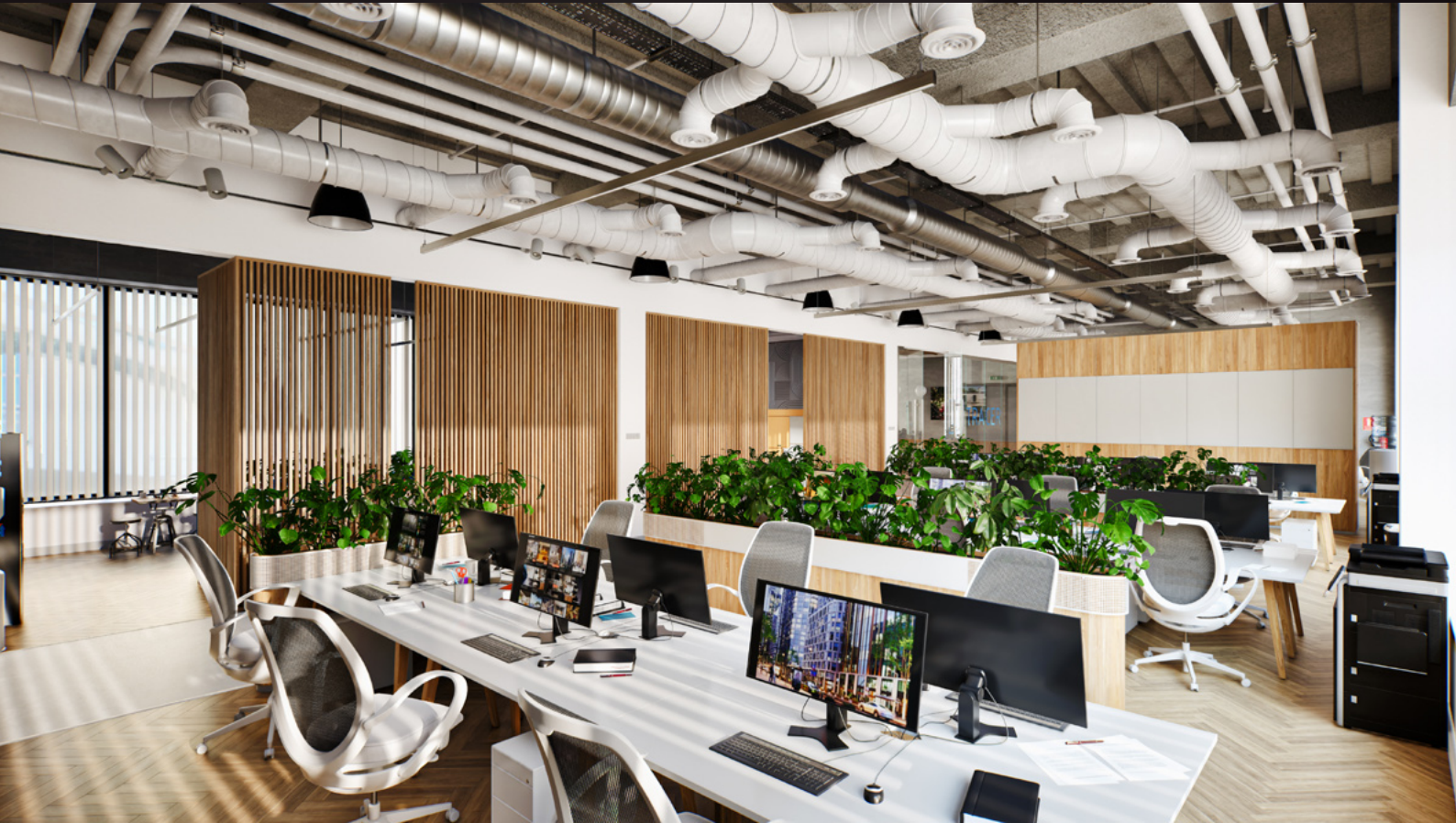
screenshot scene 03 cam 06

Archinteriors for Unreal Engine vol. 11 consists of five interior scenes of modern office workspaces. Each scene is a complete interior and contains various zones that characterize modern work spaces. You can find here a co-working zones, relaxation areas and a meeting spots which, interpenetrating each other, create an attractive work environment. All scenes are lit with Lumen, delivering perfect balance between high performance, lighting quality and flexibility. All interiors are fully modular and easy to re-use in your projects. Collection contains 40 animation shots set in Unreal Engine Sequencer.