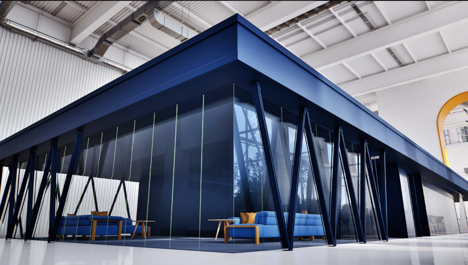
screenshot scene 01 cam 06

Archinteriors for Unreal Engine vol. 11 consists of five interior scenes of modern office workspaces. Each scene is a complete interior and contains various zones that characterize modern work spaces. You can find here a co-working zones, relaxation areas and a meeting spots which, interpenetrating each other, create an attractive work environment. All scenes are lit with Lumen, delivering perfect balance between high performance, lighting quality and flexibility. All interiors are fully modular and easy to re-use in your projects. Collection contains 40 animation shots set in Unreal Engine Sequencer.