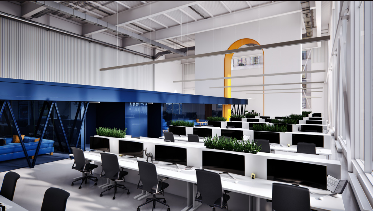
screenshot scene 01 cam 01

Archinteriors for Unreal Engine vol. 11 consists of five interior scenes of modern office workspaces. Each scene is a complete interior and contains various zones that characterize modern work spaces. You can find here a co-working zones, relaxation areas and a meeting spots which, interpenetrating each other, create an attractive work environment. All scenes are lit with Lumen, delivering perfect balance between high performance, lighting quality and flexibility. All interiors are fully modular and easy to re-use in your projects. Collection contains 40 animation shots set in Unreal Engine Sequencer.