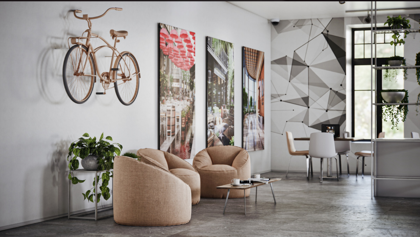
screenshot scene 02 cam 05

Archinteriors for Unreal Engine vol. 11 consists of five interior scenes of modern office workspaces. Each scene is a complete interior and contains various zones that characterize modern work spaces. You can find here a co-working zones, relaxation areas and a meeting spots which, interpenetrating each other, create an attractive work environment. All scenes are lit with Lumen, delivering perfect balance between high performance, lighting quality and flexibility. All interiors are fully modular and easy to re-use in your projects. Collection contains 40 animation shots set in Unreal Engine Sequencer.