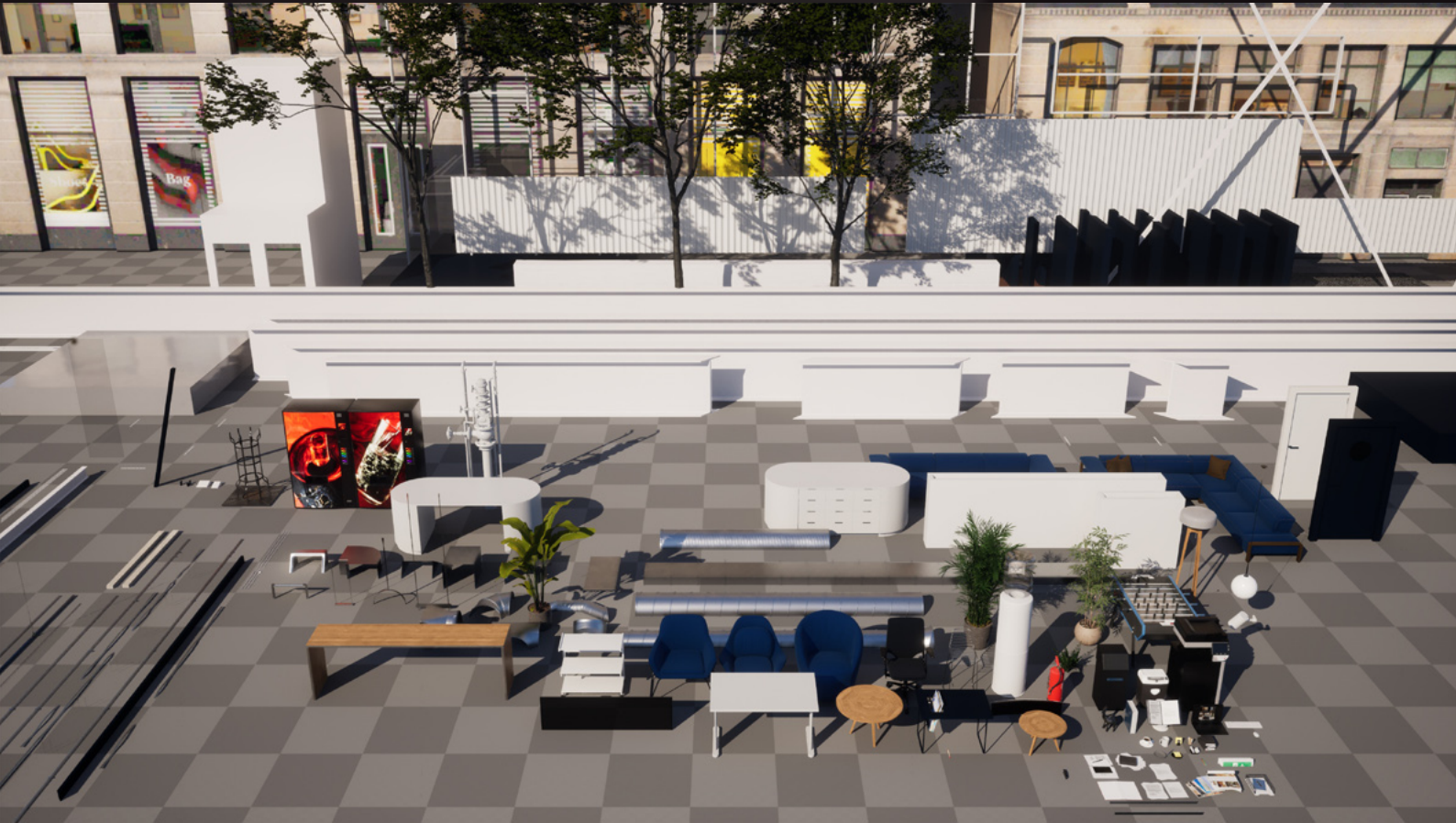
overview scene 01

Archinteriors for Unreal Engine vol. 11 consists of five interior scenes of modern office workspaces. Each scene is a complete interior and contains various zones that characterize modern work spaces. You can find here a co-working zones, relaxation areas and a meeting spots which, interpenetrating each other, create an attractive work environment. All scenes are lit with Lumen, delivering perfect balance between high performance, lighting quality and flexibility. All interiors are fully modular and easy to re-use in your projects. Collection contains 40 animation shots set in Unreal Engine Sequencer.