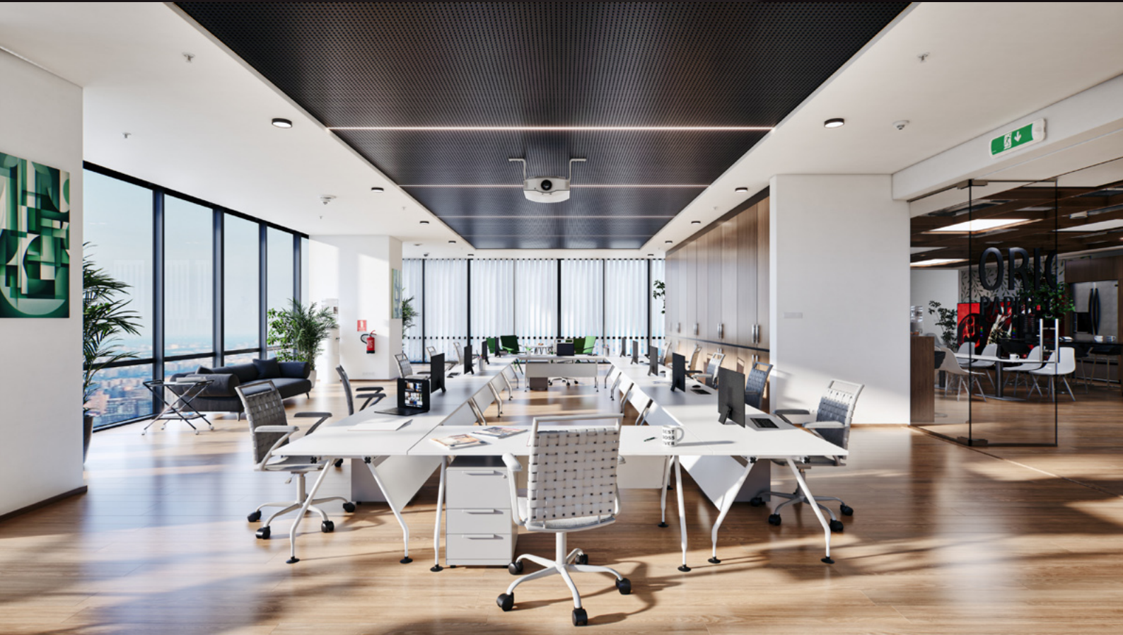
screenshot scene 05 cam 01

Archinteriors for Unreal Engine vol. 11 consists of five interior scenes of modern office workspaces. Each scene is a complete interior and contains various zones that characterize modern work spaces. You can find here a co-working zones, relaxation areas and a meeting spots which, interpenetrating each other, create an attractive work environment. All scenes are lit with Lumen, delivering perfect balance between high performance, lighting quality and flexibility. All interiors are fully modular and easy to re-use in your projects. Collection contains 40 animation shots set in Unreal Engine Sequencer.