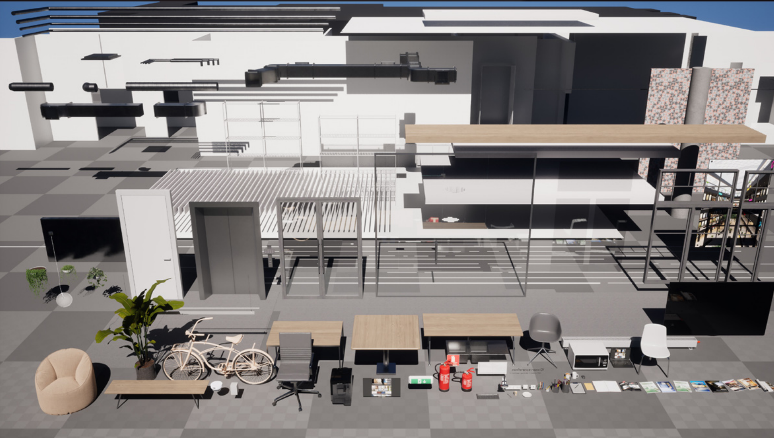
overview scene 02

Archinteriors for Unreal Engine vol. 11 consists of five interior scenes of modern office workspaces. Each scene is a complete interior and contains various zones that characterize modern work spaces. You can find here a co-working zones, relaxation areas and a meeting spots which, interpenetrating each other, create an attractive work environment. All scenes are lit with Lumen, delivering perfect balance between high performance, lighting quality and flexibility. All interiors are fully modular and easy to re-use in your projects. Collection contains 40 animation shots set in Unreal Engine Sequencer.