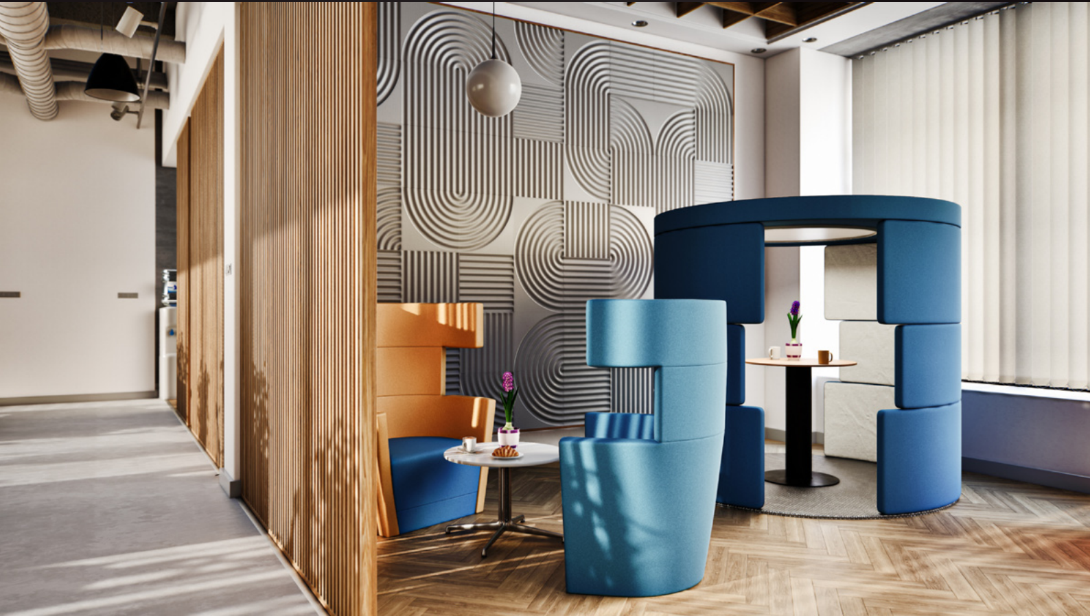
screenshot scene 03 cam 04

Archinteriors for Unreal Engine vol. 11 consists of five interior scenes of modern office workspaces. Each scene is a complete interior and contains various zones that characterize modern work spaces. You can find here a co-working zones, relaxation areas and a meeting spots which, interpenetrating each other, create an attractive work environment. All scenes are lit with Lumen, delivering perfect balance between high performance, lighting quality and flexibility. All interiors are fully modular and easy to re-use in your projects. Collection contains 40 animation shots set in Unreal Engine Sequencer.