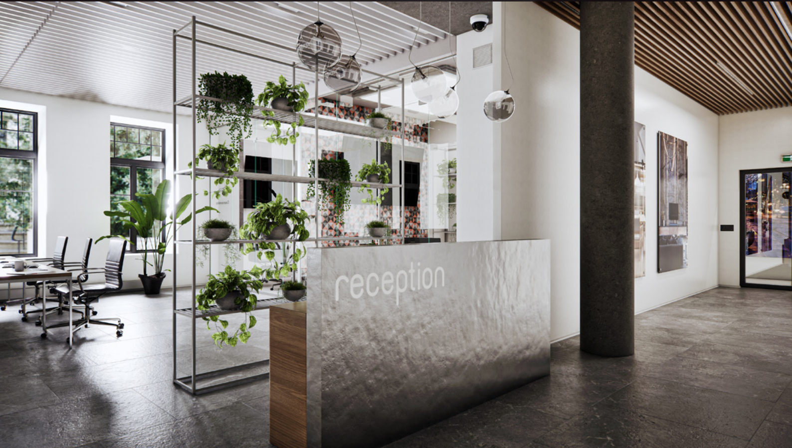
screenshot scene 02 cam 04

Archinteriors for Unreal Engine vol. 11 consists of five interior scenes of modern office workspaces. Each scene is a complete interior and contains various zones that characterize modern work spaces. You can find here a co-working zones, relaxation areas and a meeting spots which, interpenetrating each other, create an attractive work environment. All scenes are lit with Lumen, delivering perfect balance between high performance, lighting quality and flexibility. All interiors are fully modular and easy to re-use in your projects. Collection contains 40 animation shots set in Unreal Engine Sequencer.