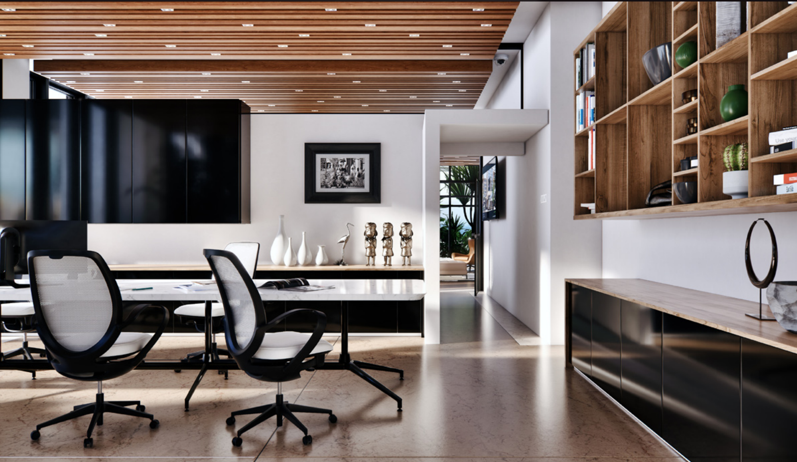
screenshot scene 04 cam 04

Archinteriors for Unreal Engine vol. 11 consists of five interior scenes of modern office workspaces. Each scene is a complete interior and contains various zones that characterize modern work spaces. You can find here a co-working zones, relaxation areas and a meeting spots which, interpenetrating each other, create an attractive work environment. All scenes are lit with Lumen, delivering perfect balance between high performance, lighting quality and flexibility. All interiors are fully modular and easy to re-use in your projects. Collection contains 40 animation shots set in Unreal Engine Sequencer.