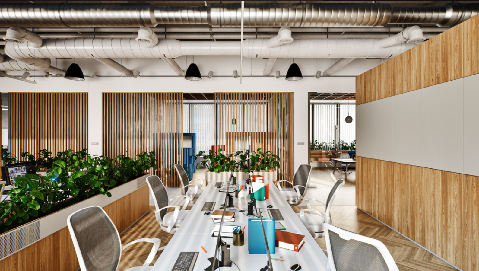
screenshot scene 03 cam 07

Archinteriors for Unreal Engine vol. 11 consists of five interior scenes of modern office workspaces. Each scene is a complete interior and contains various zones that characterize modern work spaces. You can find here a co-working zones, relaxation areas and a meeting spots which, interpenetrating each other, create an attractive work environment. All scenes are lit with Lumen, delivering perfect balance between high performance, lighting quality and flexibility. All interiors are fully modular and easy to re-use in your projects. Collection contains 40 animation shots set in Unreal Engine Sequencer.