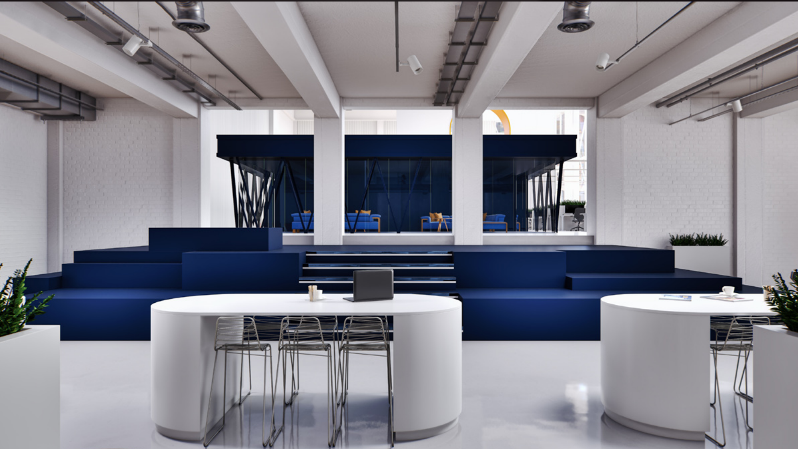
screenshot scene 01 cam 04

Archinteriors for Unreal Engine vol. 11 consists of five interior scenes of modern office workspaces. Each scene is a complete interior and contains various zones that characterize modern work spaces. You can find here a co-working zones, relaxation areas and a meeting spots which, interpenetrating each other, create an attractive work environment. All scenes are lit with Lumen, delivering perfect balance between high performance, lighting quality and flexibility. All interiors are fully modular and easy to re-use in your projects. Collection contains 40 animation shots set in Unreal Engine Sequencer.