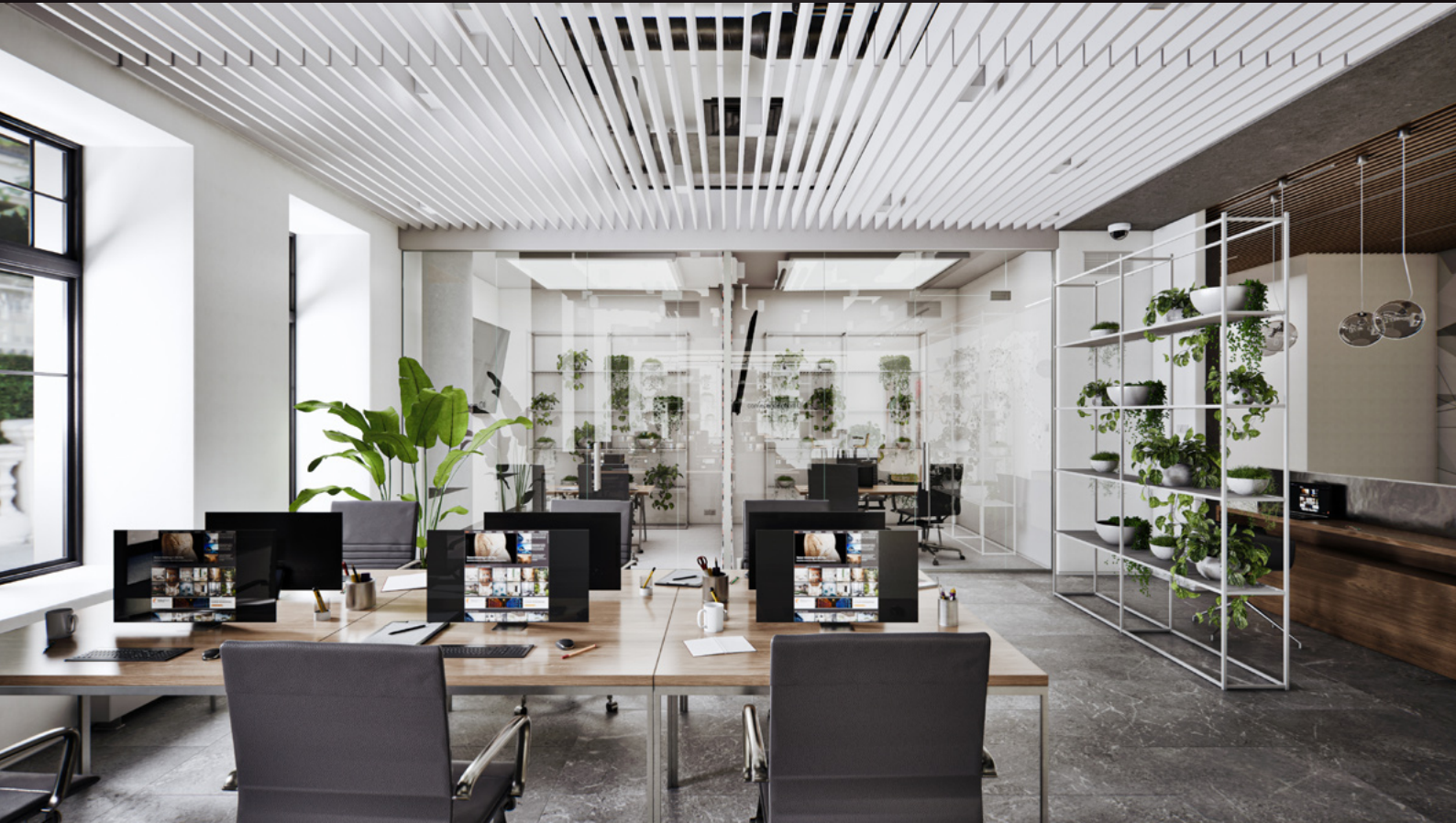
screenshot scene 02 cam 03

Archinteriors for Unreal Engine vol. 11 consists of five interior scenes of modern office workspaces. Each scene is a complete interior and contains various zones that characterize modern work spaces. You can find here a co-working zones, relaxation areas and a meeting spots which, interpenetrating each other, create an attractive work environment. All scenes are lit with Lumen, delivering perfect balance between high performance, lighting quality and flexibility. All interiors are fully modular and easy to re-use in your projects. Collection contains 40 animation shots set in Unreal Engine Sequencer.