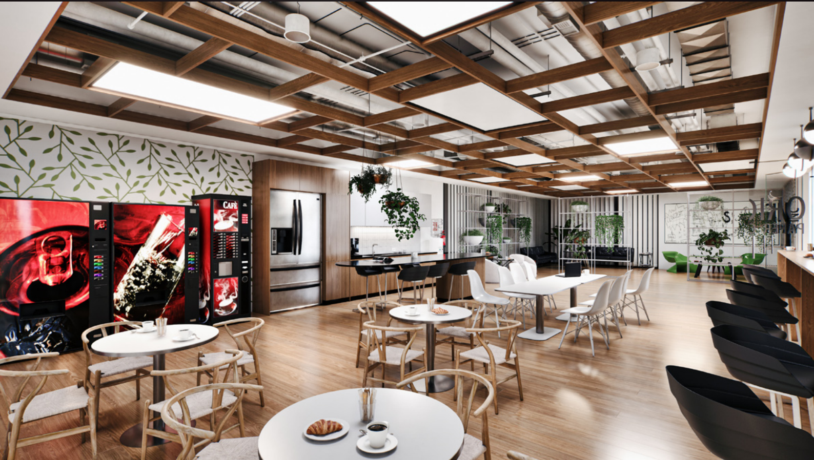
screenshot scene 05 cam 02

Archinteriors for Unreal Engine vol. 11 consists of five interior scenes of modern office workspaces. Each scene is a complete interior and contains various zones that characterize modern work spaces. You can find here a co-working zones, relaxation areas and a meeting spots which, interpenetrating each other, create an attractive work environment. All scenes are lit with Lumen, delivering perfect balance between high performance, lighting quality and flexibility. All interiors are fully modular and easy to re-use in your projects. Collection contains 40 animation shots set in Unreal Engine Sequencer.