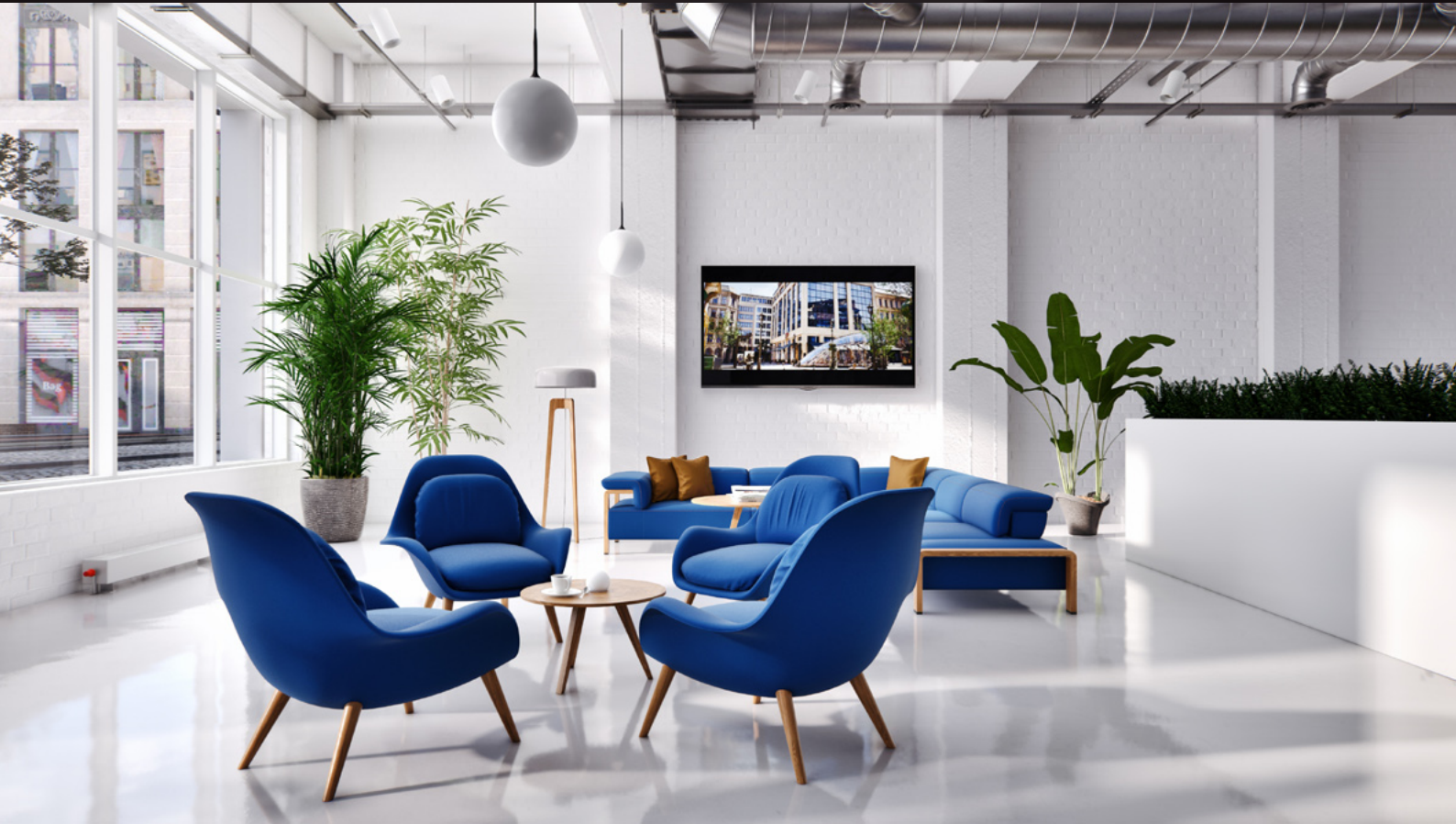
screenshot scene 01 cam 03

Archinteriors for Unreal Engine vol. 11 consists of five interior scenes of modern office workspaces. Each scene is a complete interior and contains various zones that characterize modern work spaces. You can find here a co-working zones, relaxation areas and a meeting spots which, interpenetrating each other, create an attractive work environment. All scenes are lit with Lumen, delivering perfect balance between high performance, lighting quality and flexibility. All interiors are fully modular and easy to re-use in your projects. Collection contains 40 animation shots set in Unreal Engine Sequencer.