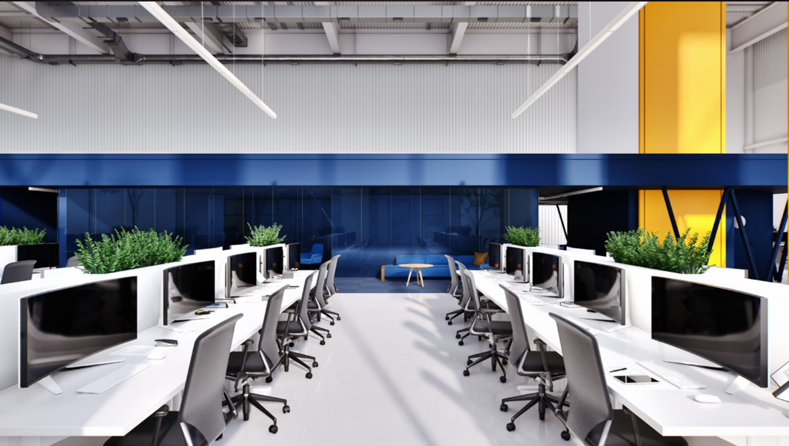
screenshot scene 01 cam 07

Archinteriors for Unreal Engine vol. 11 consists of five interior scenes of modern office workspaces. Each scene is a complete interior and contains various zones that characterize modern work spaces. You can find here a co-working zones, relaxation areas and a meeting spots which, interpenetrating each other, create an attractive work environment. All scenes are lit with Lumen, delivering perfect balance between high performance, lighting quality and flexibility. All interiors are fully modular and easy to re-use in your projects. Collection contains 40 animation shots set in Unreal Engine Sequencer.