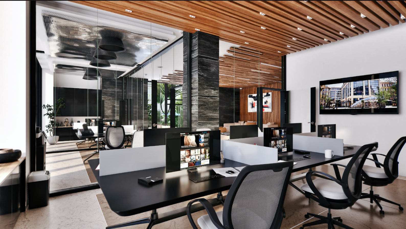
screenshot scene 04 cam 05

Archinteriors for Unreal Engine vol. 11 consists of five interior scenes of modern office workspaces. Each scene is a complete interior and contains various zones that characterize modern work spaces. You can find here a co-working zones, relaxation areas and a meeting spots which, interpenetrating each other, create an attractive work environment. All scenes are lit with Lumen, delivering perfect balance between high performance, lighting quality and flexibility. All interiors are fully modular and easy to re-use in your projects. Collection contains 40 animation shots set in Unreal Engine Sequencer.