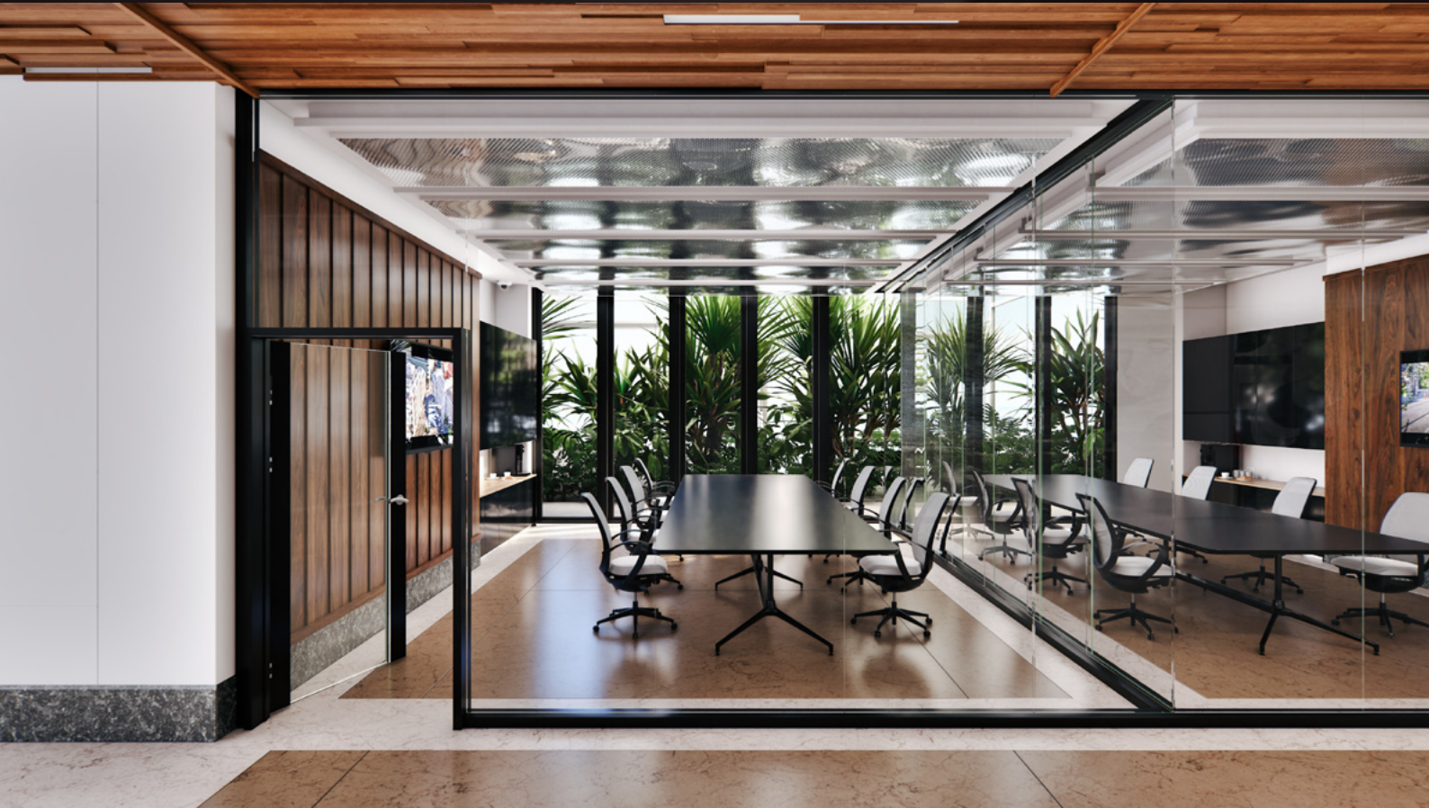
screenshot scene 04 cam 06

Archinteriors for Unreal Engine vol. 11 consists of five interior scenes of modern office workspaces. Each scene is a complete interior and contains various zones that characterize modern work spaces. You can find here a co-working zones, relaxation areas and a meeting spots which, interpenetrating each other, create an attractive work environment. All scenes are lit with Lumen, delivering perfect balance between high performance, lighting quality and flexibility. All interiors are fully modular and easy to re-use in your projects. Collection contains 40 animation shots set in Unreal Engine Sequencer.